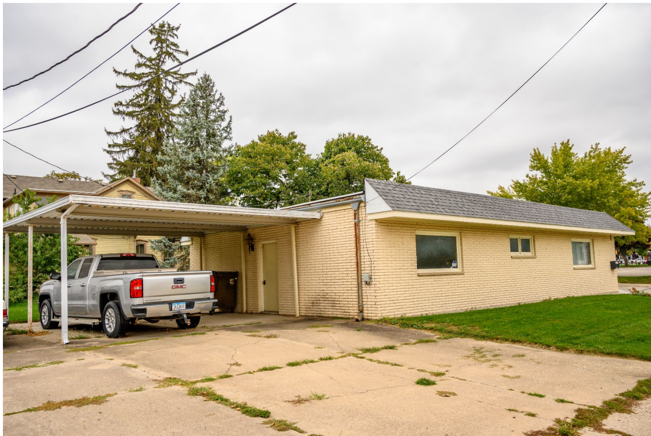
Photograph 44-02233-003. South and east elevations, looking northwest (October 2023)