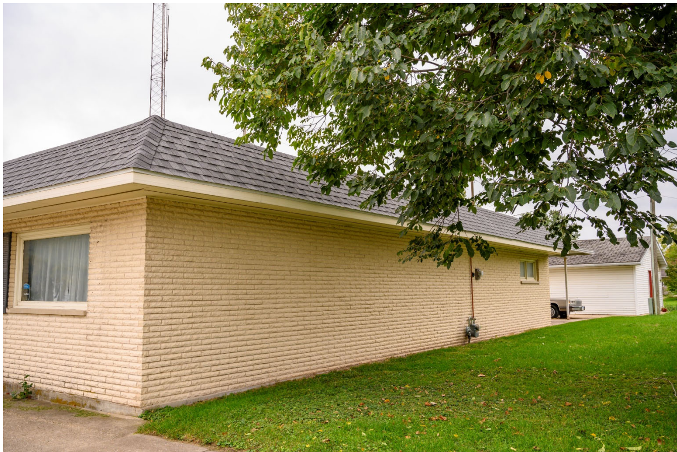
Photograph 44-02233-004. West elevation, looking southeast (October 2023)