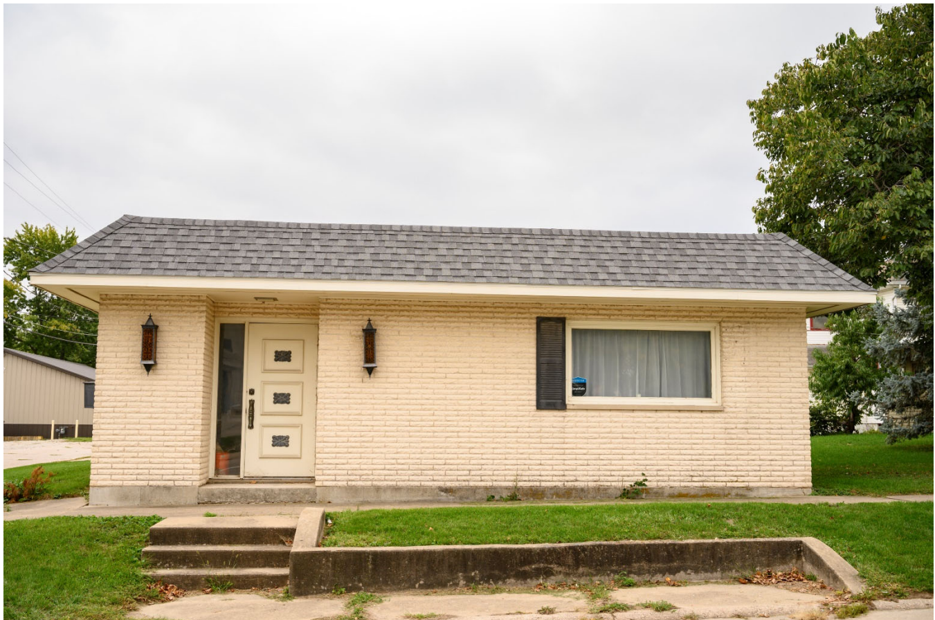
Photograph 44-02233-001. North elevation, looking south (October 2023)