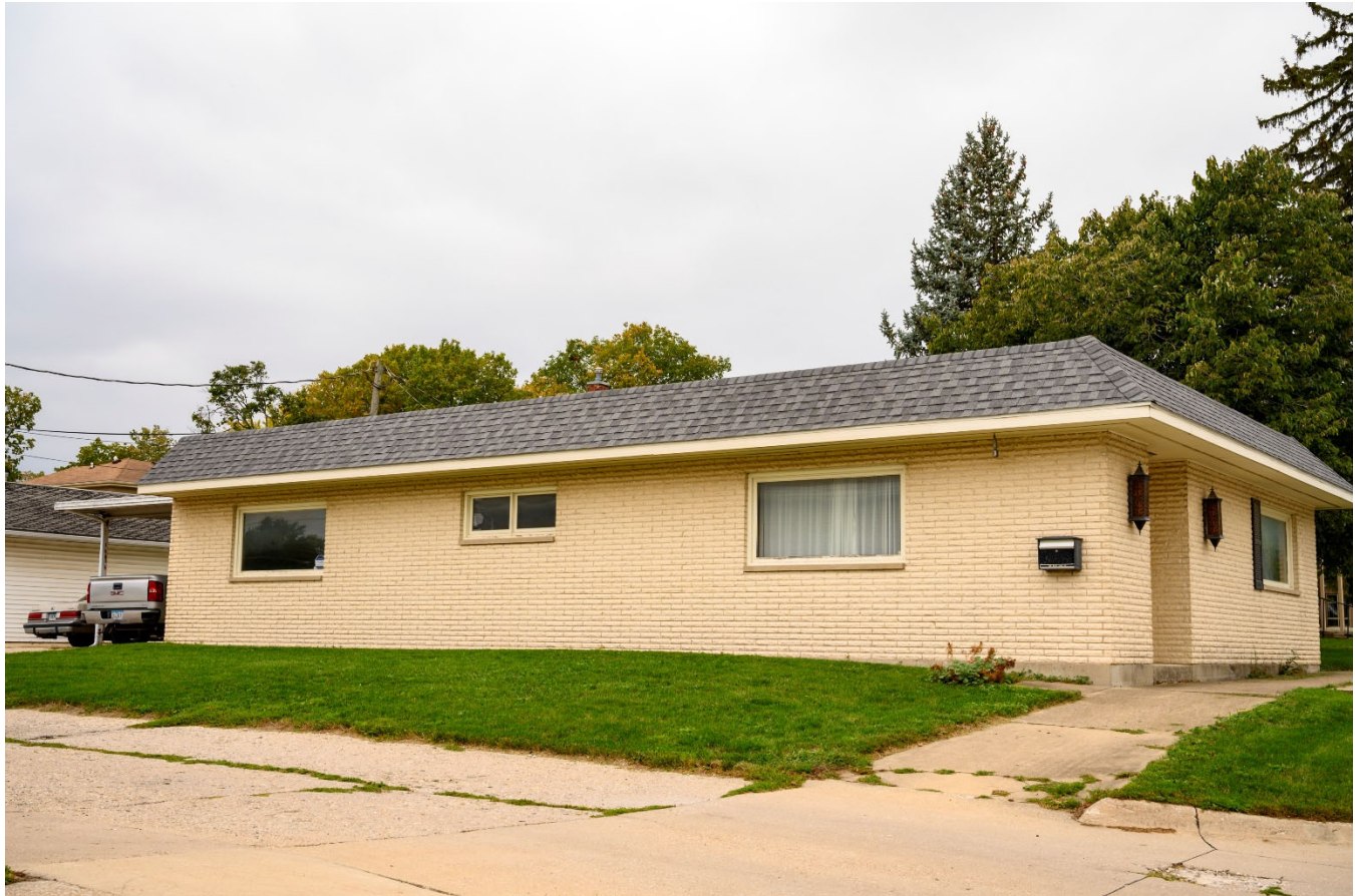
Photograph 44-02233-002. East elevation, looking southwest (October 2023)