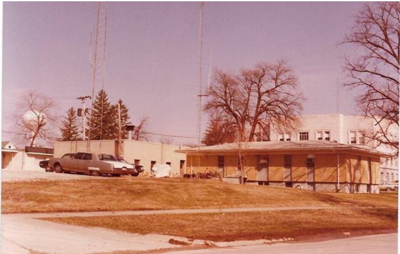
Power plant building and sheriff's residence and jail in 1977, looking northwest

County building Henry Name of Property County 106B E. Clay St (to west of corner building) Mount Pleasant Address City