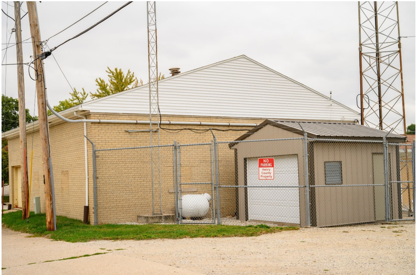
Photograph 44-02235-003. West and south elevations, looking northeast (October 2023)

County building Henry Name of Property County 106B E. Clay St (to west of corner building) Mount Pleasant Address City