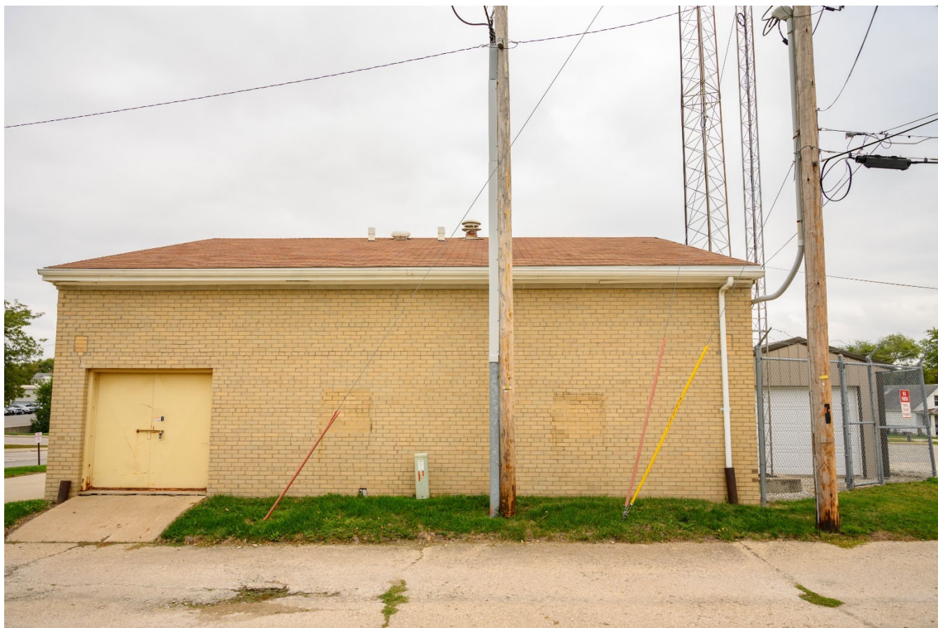
Photograph 44-02235-002. West elevation, looking east (October 2023)

County building Henry Name of Property County 106B E. Clay St (to west of corner building) Mount Pleasant Address City