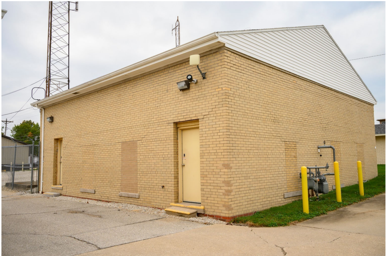
Photograph 44-02235-001. East and north elevations, looking southwest (October 2023)