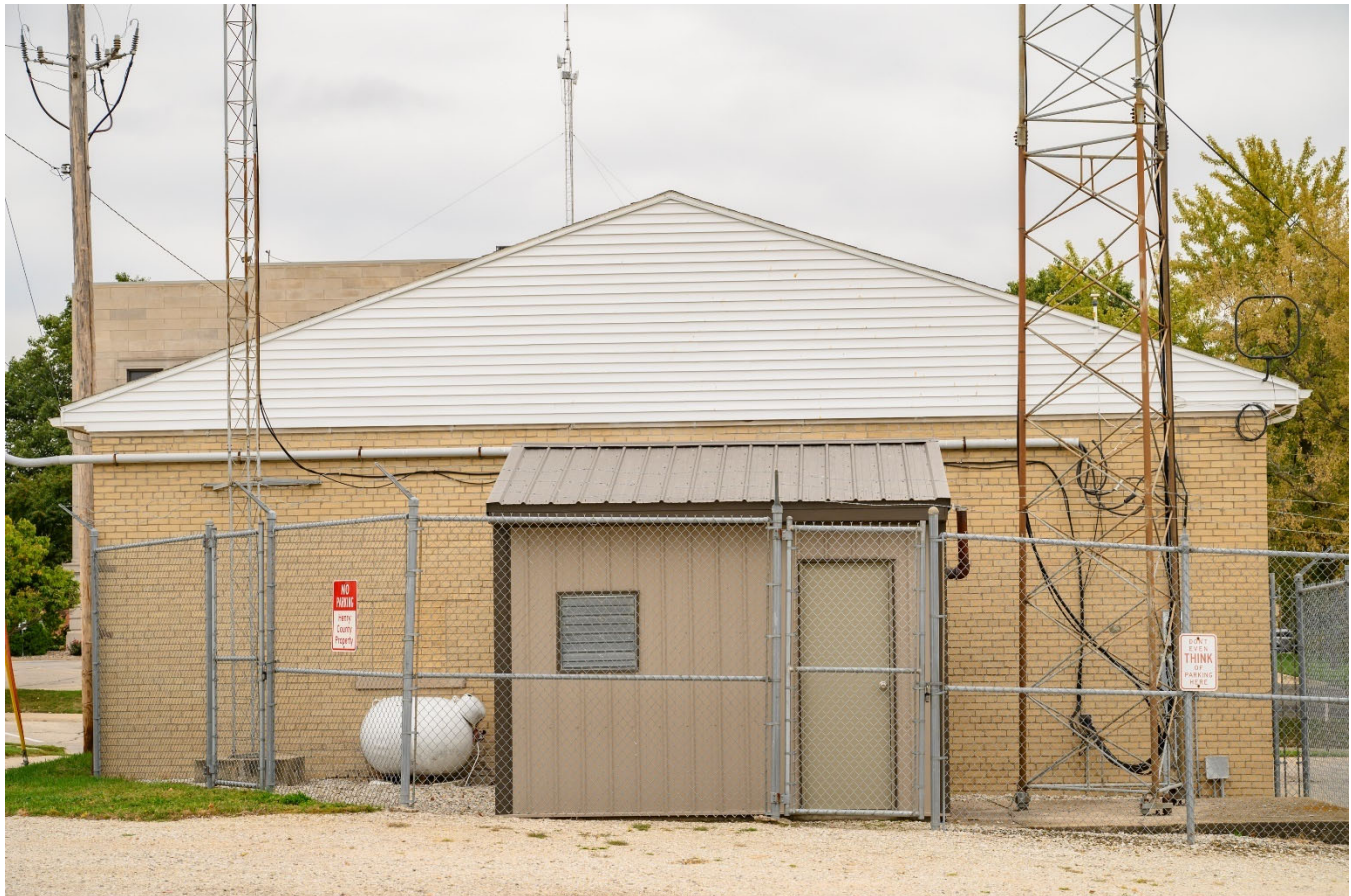
Photograph 44-02235-004. South elevation, looking north (October 2023)

County building Henry Name of Property County 106B E. Clay St (to west of corner building) Mount Pleasant Address City