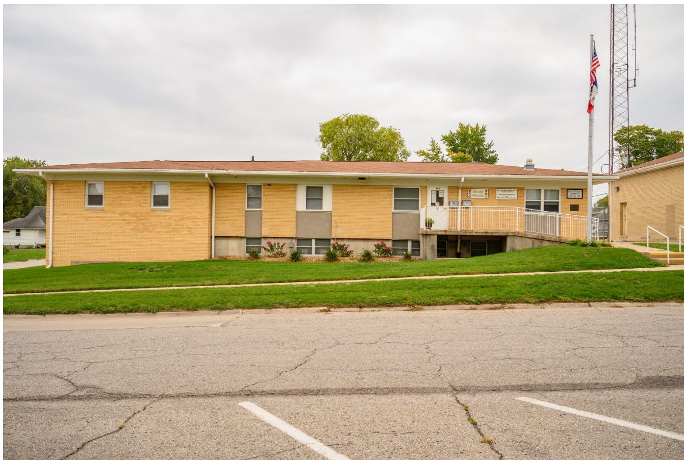
Photograph 44-02234-001. North elevation, looking south (October 2023)