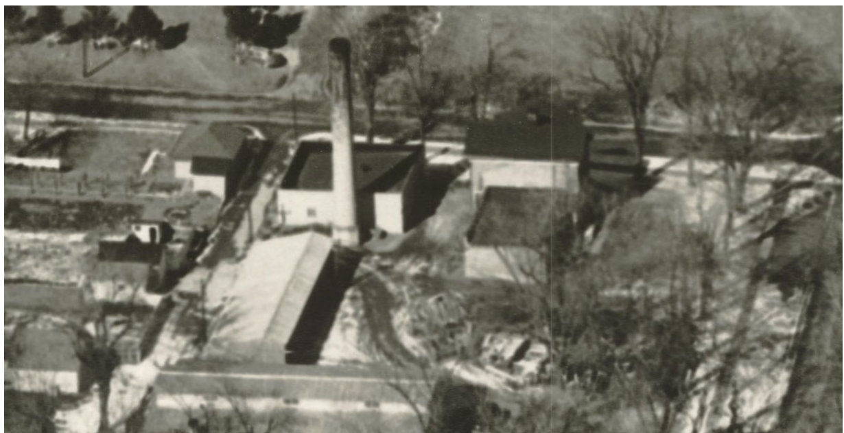
Property on east portion of 1947 aerial photograph of Mt Pleasant, looking north (HCHT files, printed in Des Moines Register , April 27, 1947, sec 9, p3, p83)