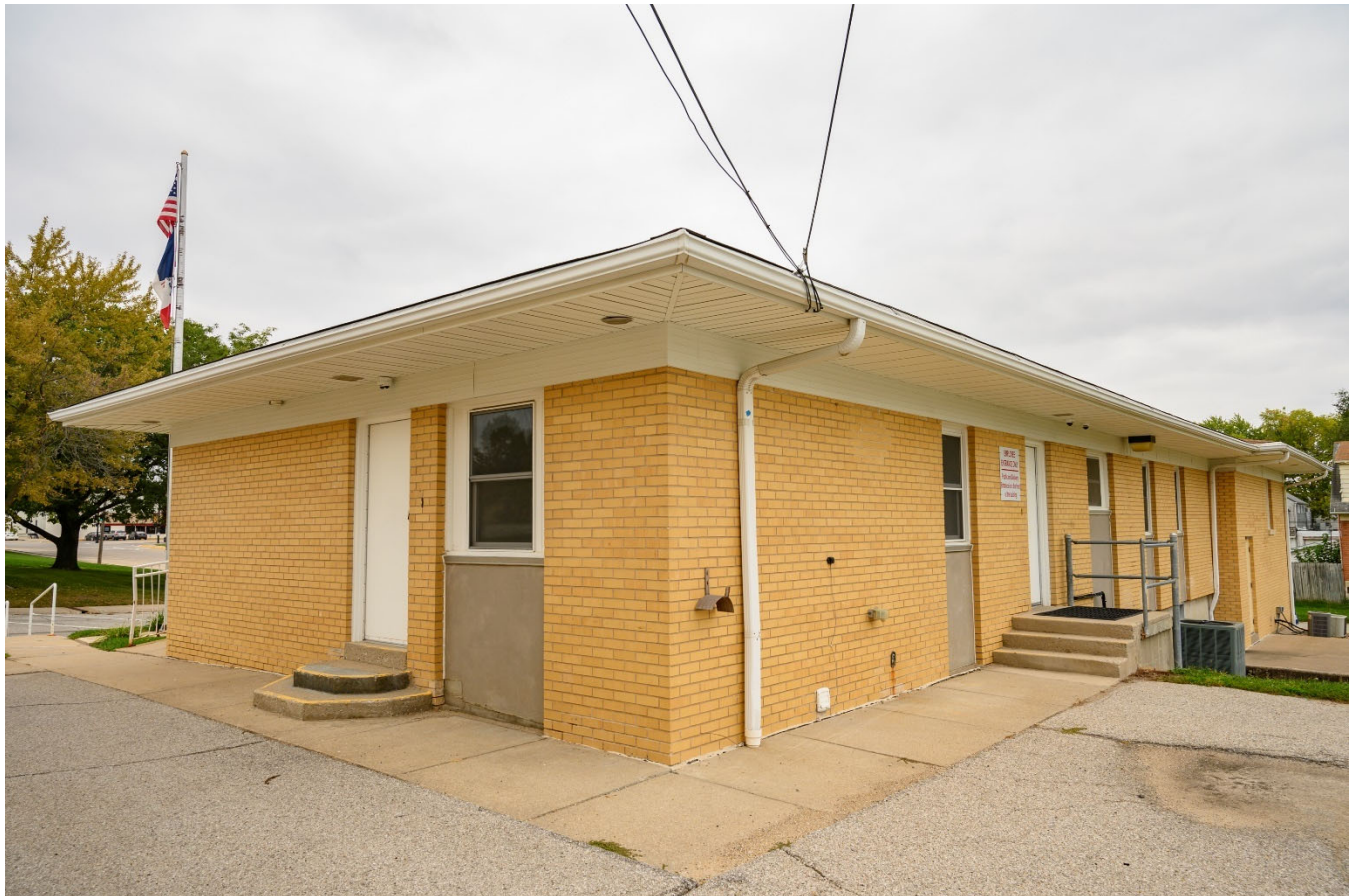
Photograph 44-02234-003. West and south elevations, looking northeast (October 2023)