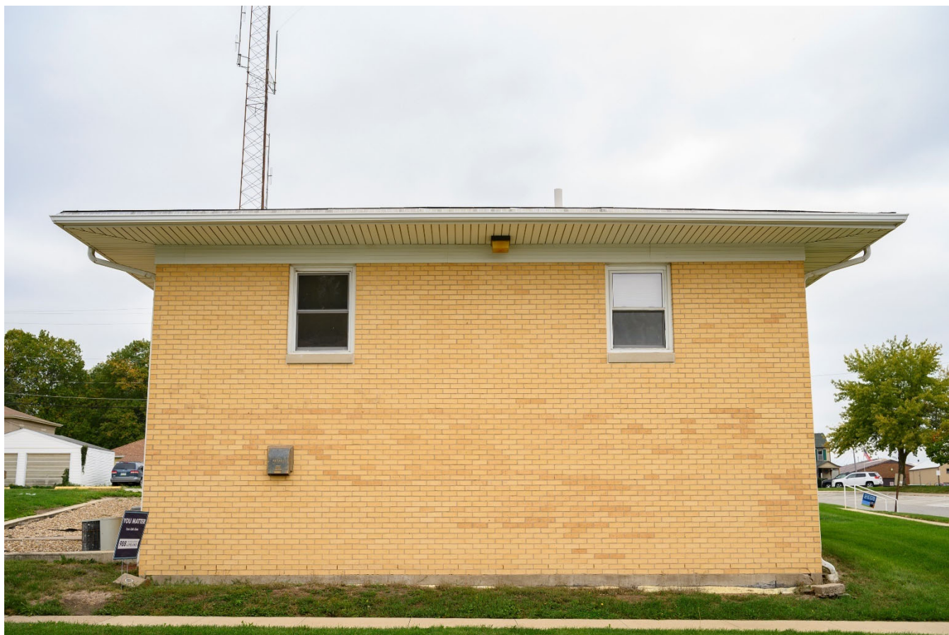
Photograph 44-02234-002. East elevation, looking west (October 2023)