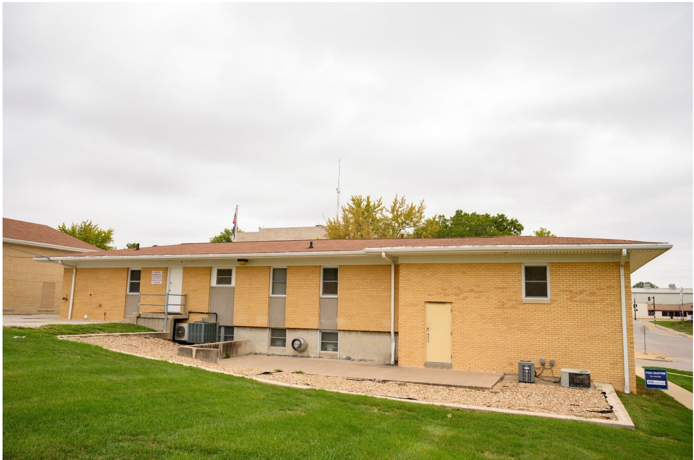
Photograph 44-02234-004. West and south, looking north (October 2023)