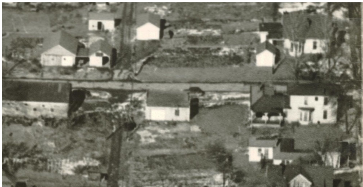
Property on east portion of 1947 aerial photograph of Mt Pleasant, looking north (HCHT files, printed in Des Moines Register , April 27, 1947, sec 9, p3, p83) one story building on property