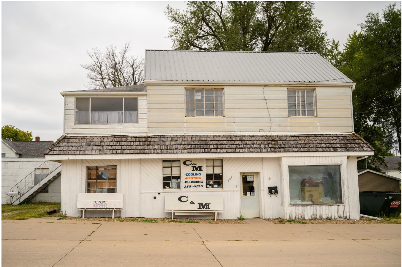
Photograph 44-02236-001. North elevation, looking south (October 2023)