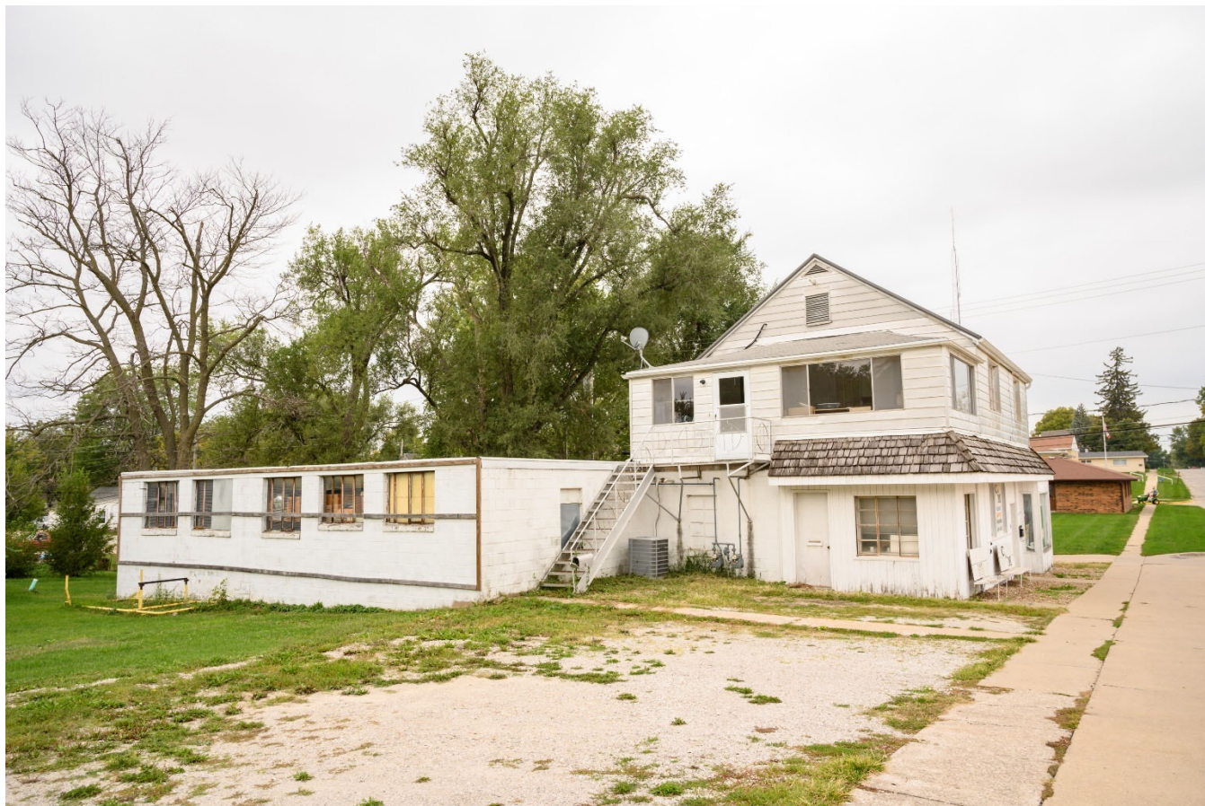
Photograph 44-02236-003. East elevation, looking west (October 2023)