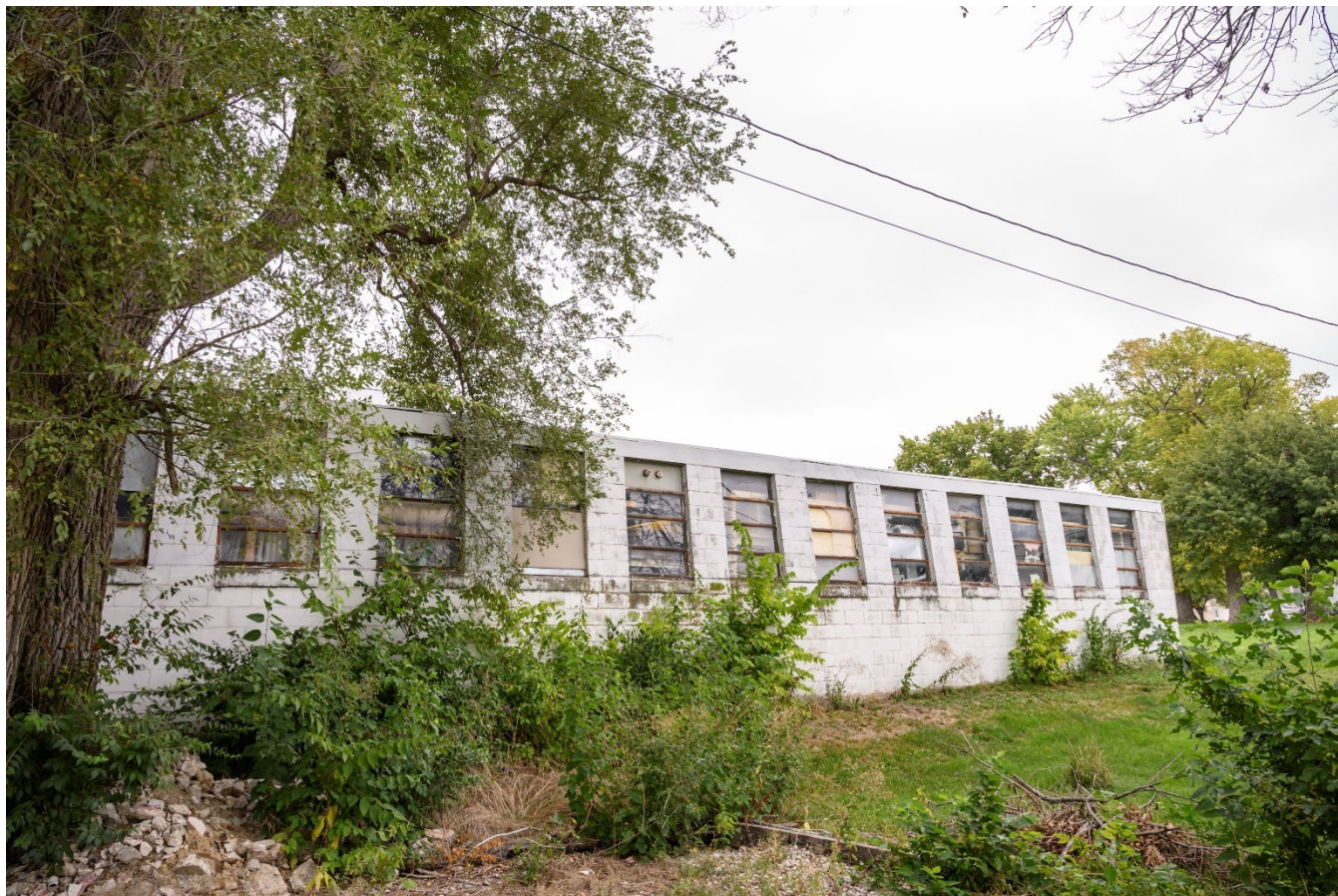
Photograph 44-02236-004. South elevation, looking north (October 2023)