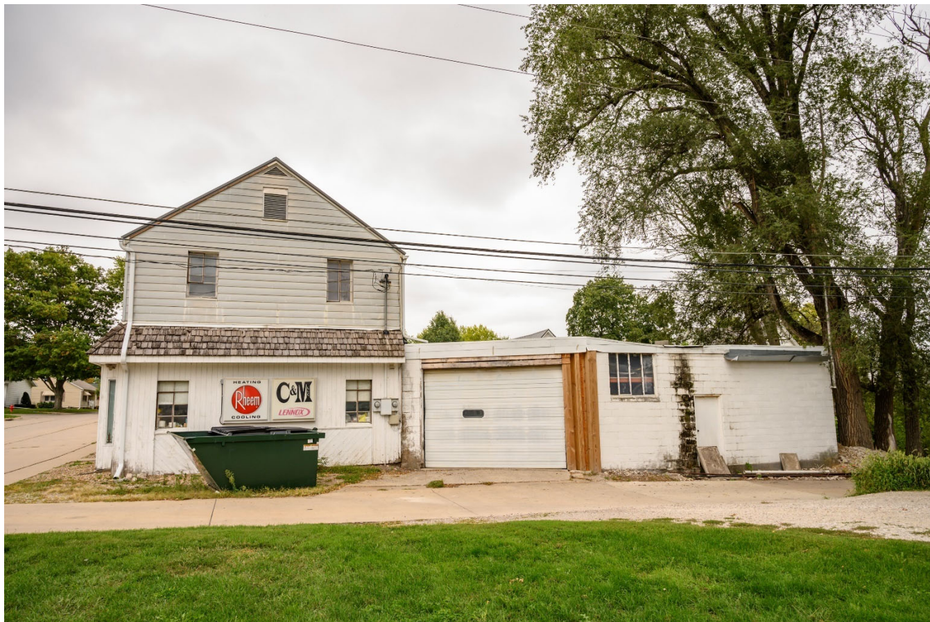
Photograph 44-02236-002. West elevation, looking east (October 2023)