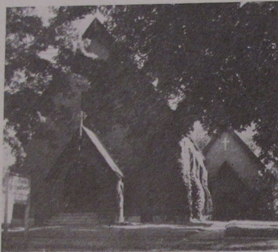
Episcopal Church and Parish House

St Michael's Episcopal Church in 1938 city directory