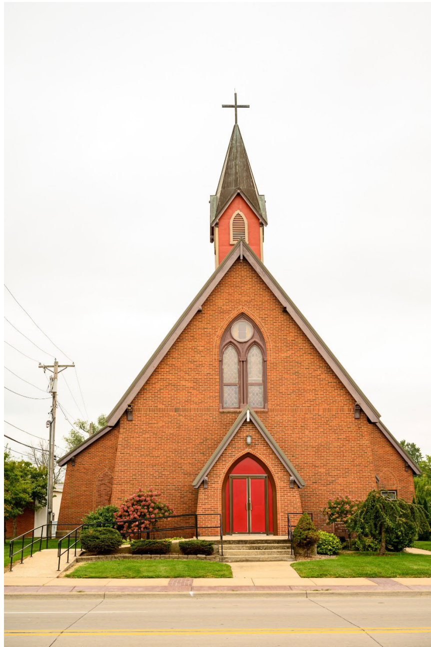
Photograph 44-02272-001. North elevation, looking south (October 2023)