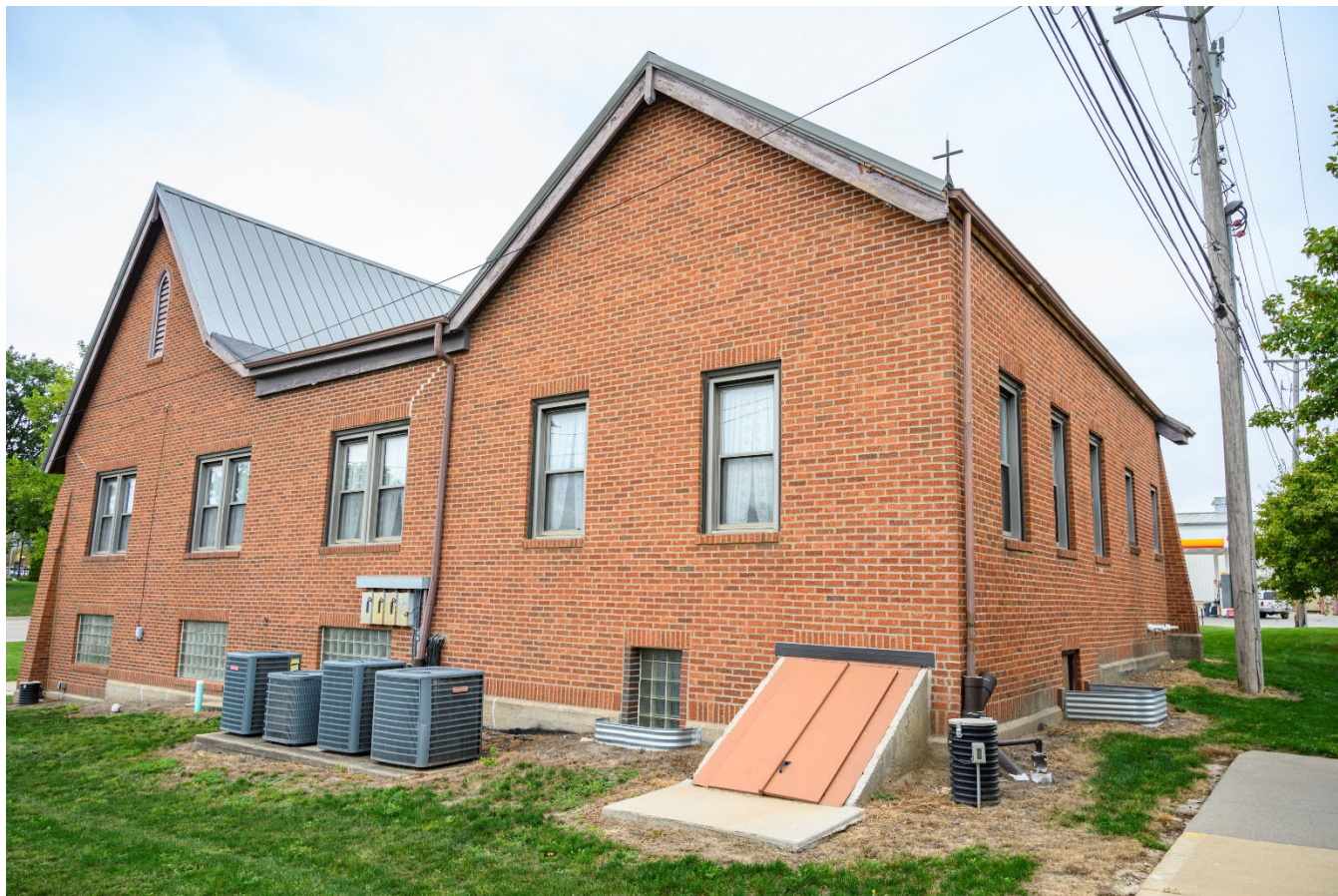
Photograph 44-02272-005. South and east elevations, looking northwest (October 2023)