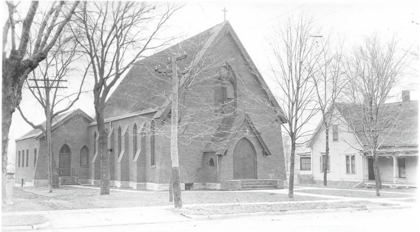
St Michael's Episcopal Church after brick veneer added in 1917