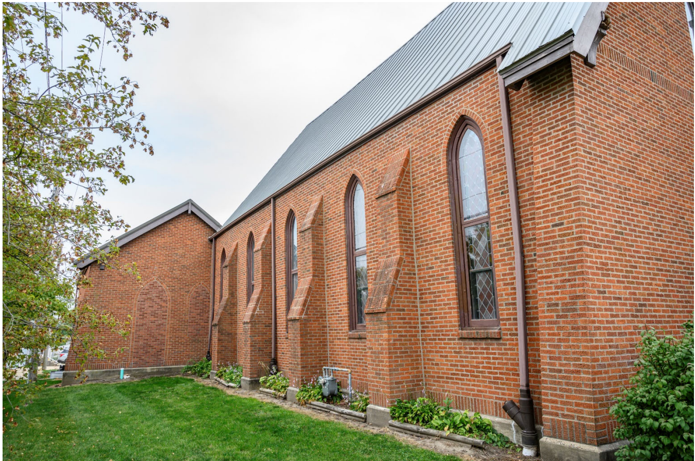
Photograph 44-02272-004. East elevation, looking southwest (October 2023)