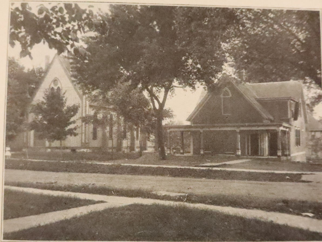
ST. MICHAELS EPISCOPAL CHURCH AND RECTORY, E. WASH.

St Michael's Episcopal Church and rectory in 1909 ( Mt Pleasant Beautiful 1909: 13)