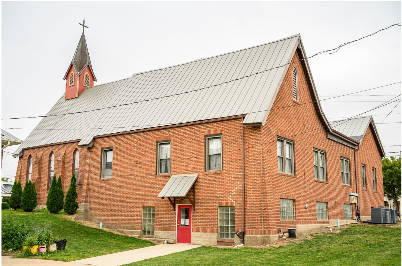
Photograph 44-02272-003. West and south elevations, looking northeast (October 2023)