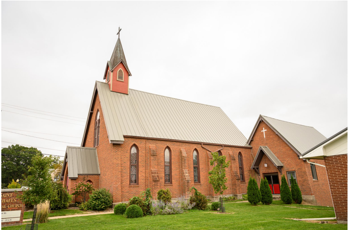
Photograph 44-02272-002. West elevation, looking east (October 2023)