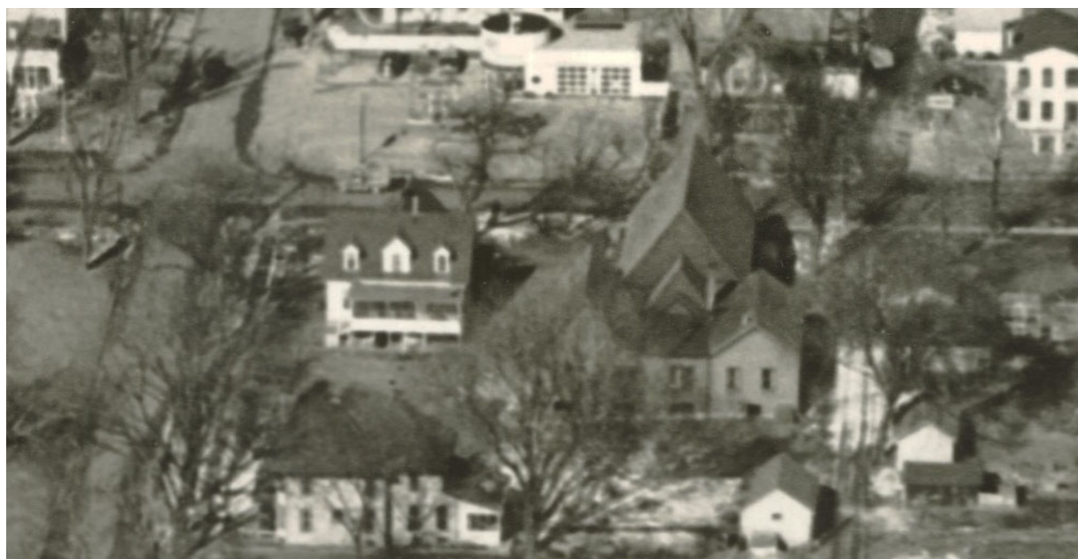
Rectory and church on east portion of 1947 aerial photograph of Mt Pleasant, looking north (HCHT files, printed in Des Moines Register , April 27, 1947, sec 9, p3, p83)