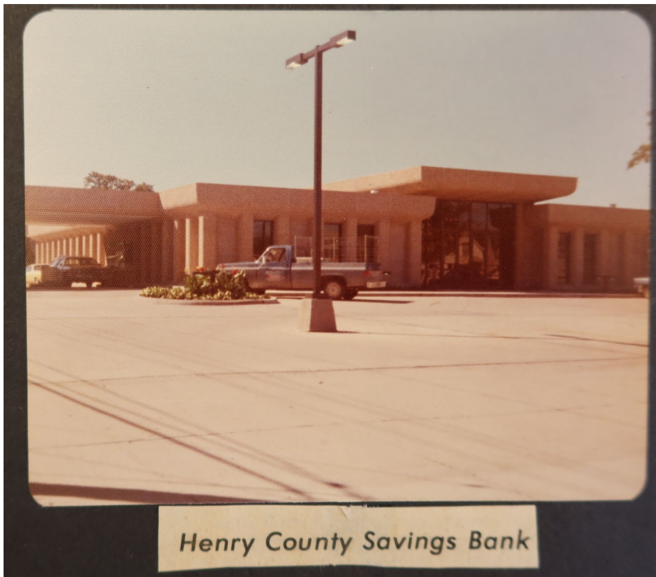
Henry County Savings Bank around 1975