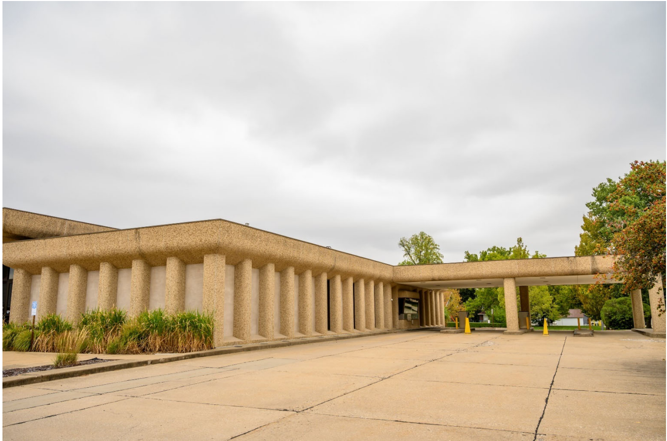
Photograph 44-02270-003. East elevation, looking northwest (October 2023)