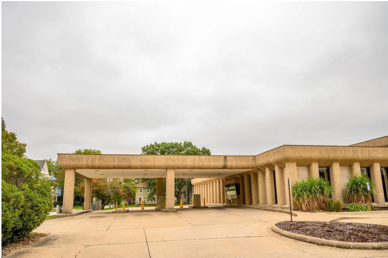
Photograph 44-02270-005. North elevation on east side, looking south (October 2023)