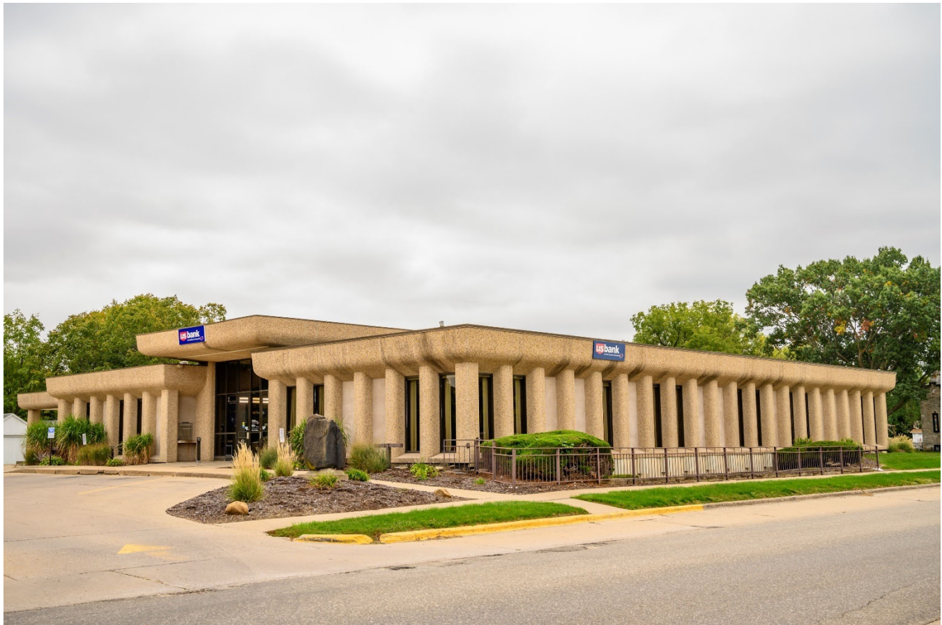
Photograph 44-02270-004. North and west elevations, looking southeast (October 2023)