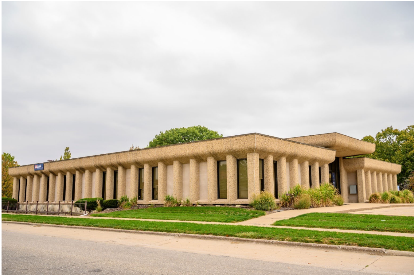
Photograph 44-02270-002. West and south elevations, looking northeast (October 2023)