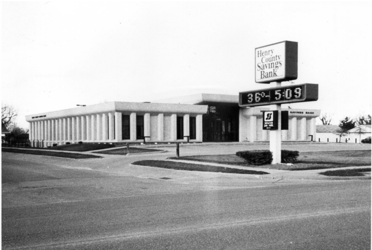
Henry County Savings Bank around 1975