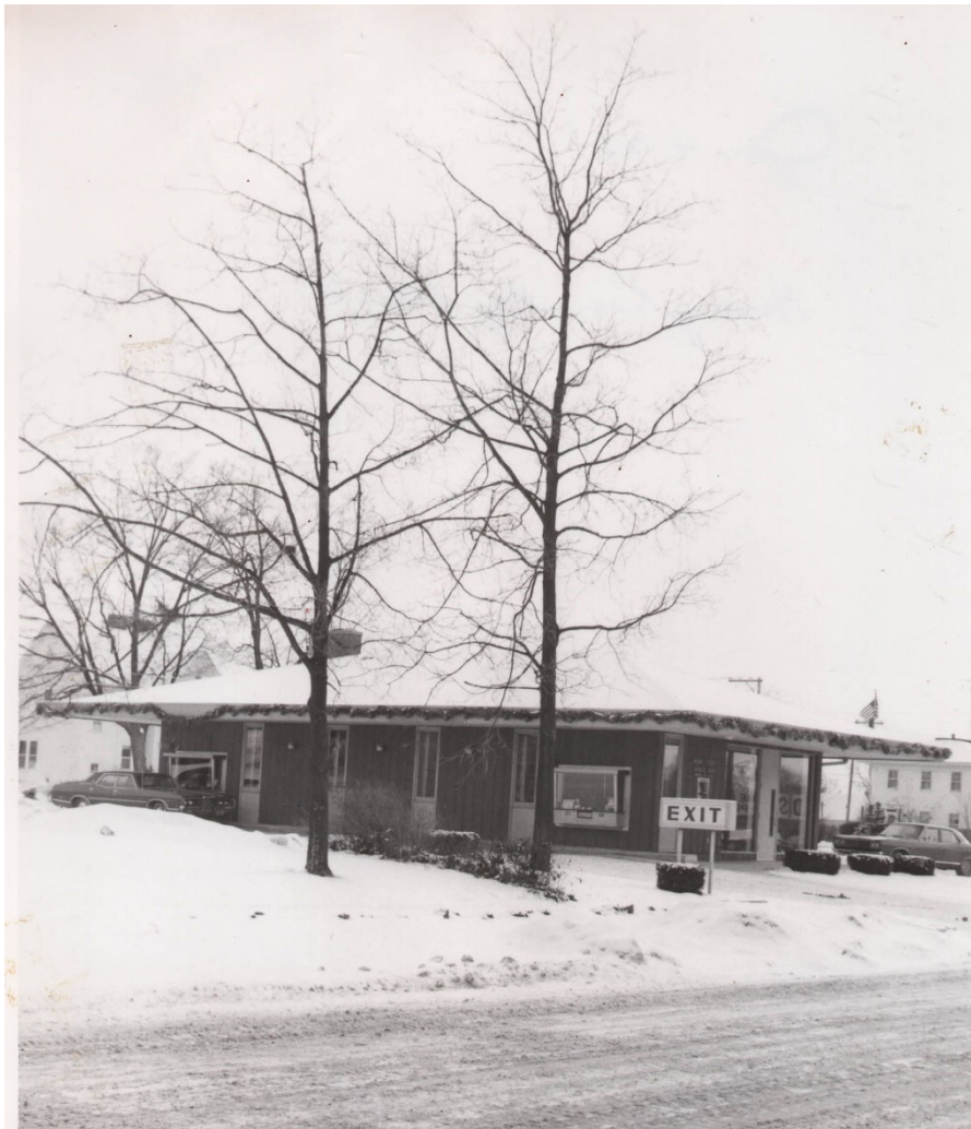
Earlier drive-in bank built on site in January 1974 before building moved to 203 S. Jackson