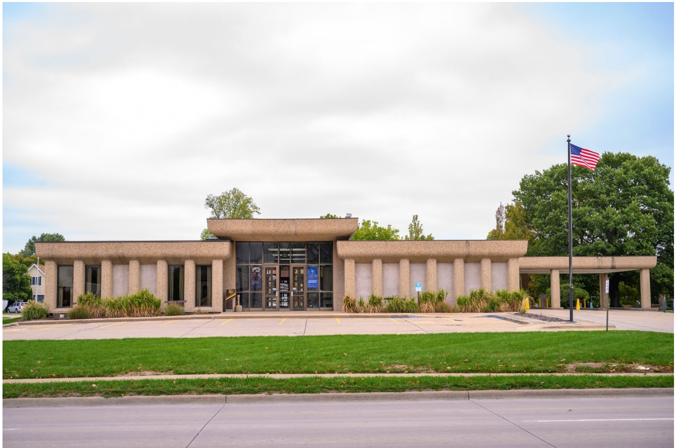
Photograph 44-02270-001. South elevation, looking north (October 2023)