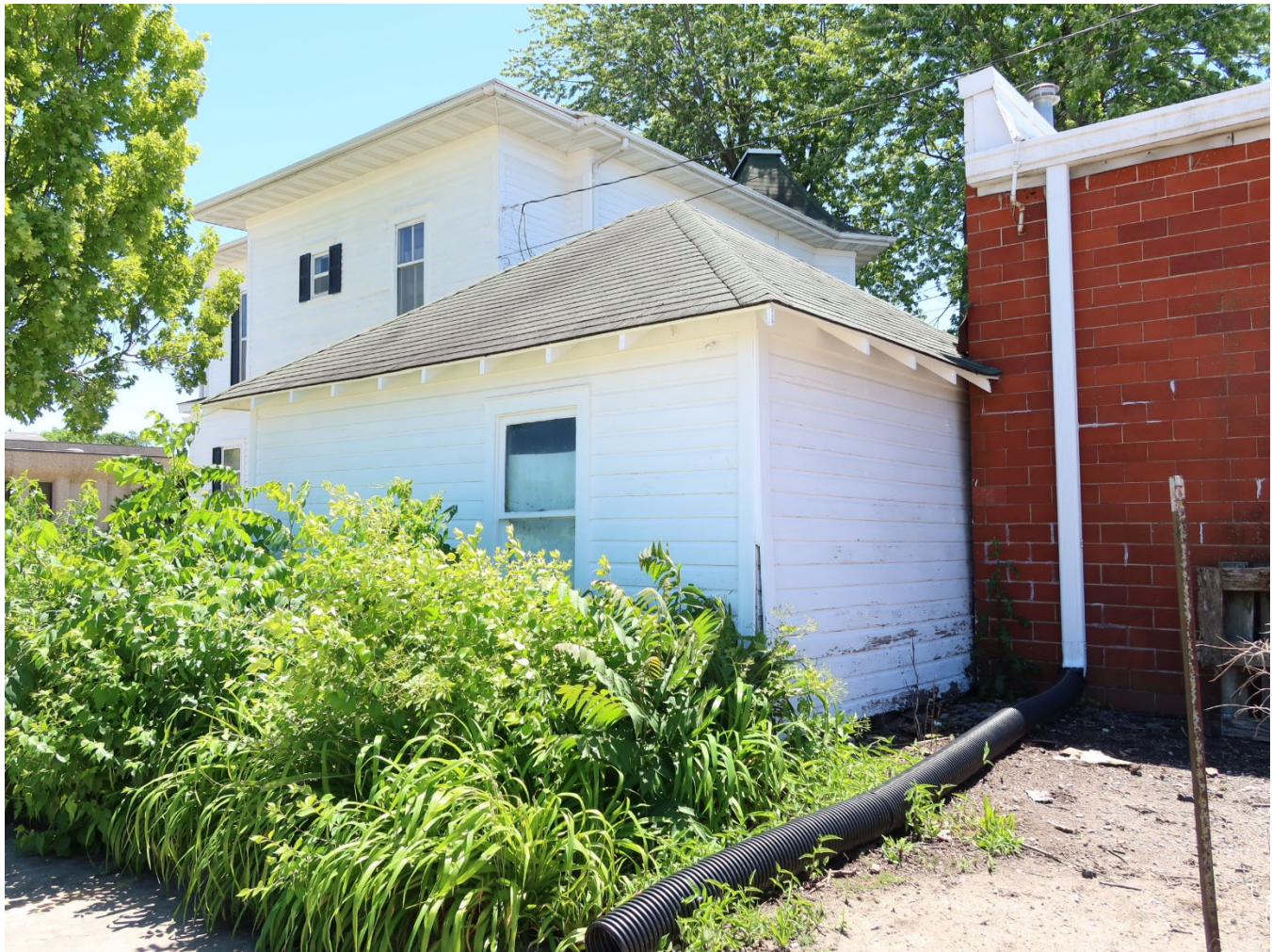
Photograph 44-02237-007. North and west elevations of garage, looking southeast (June 2024)