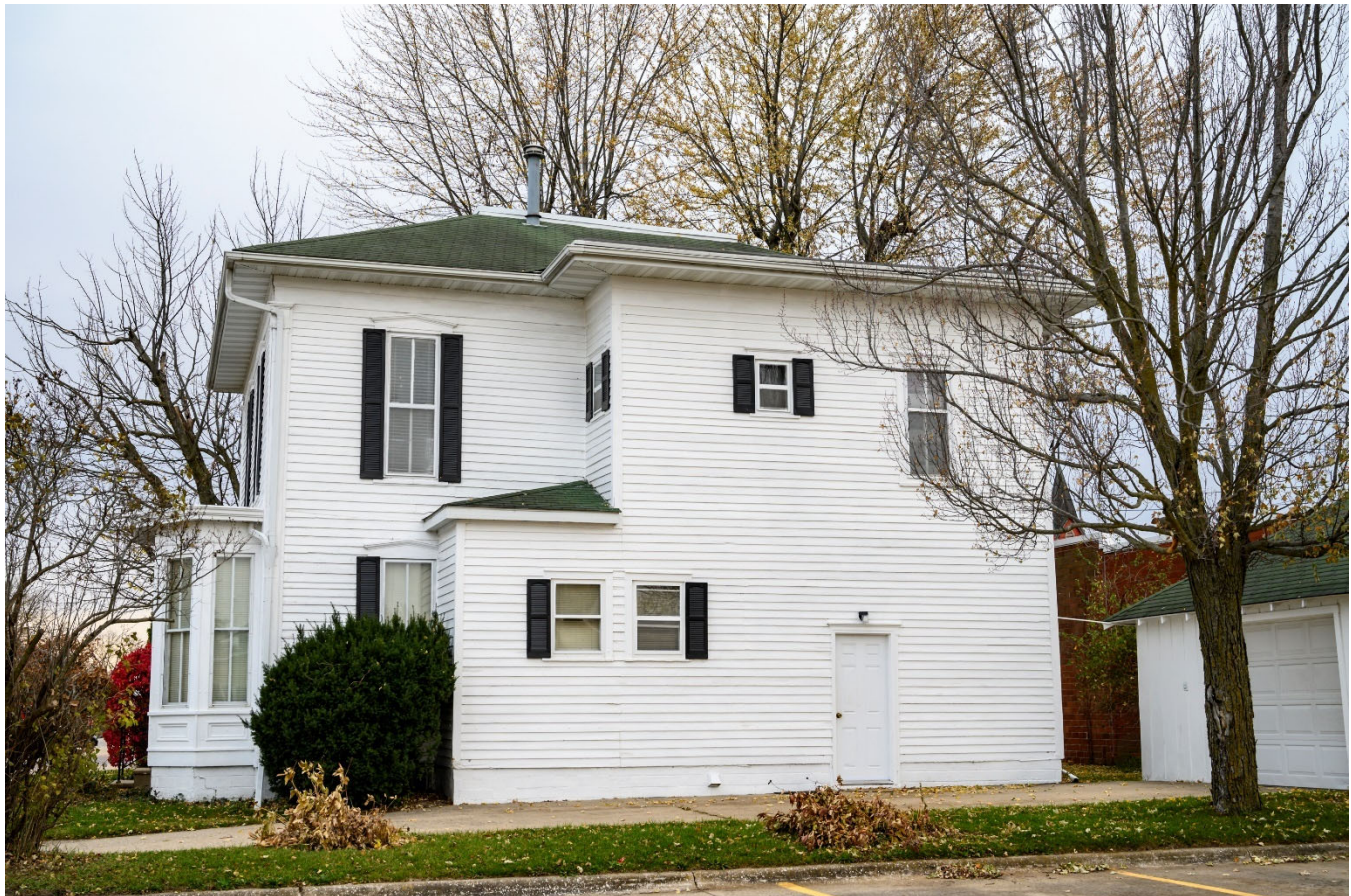
Photograph 44-02237-004. North elevation, looking south (October 2023)