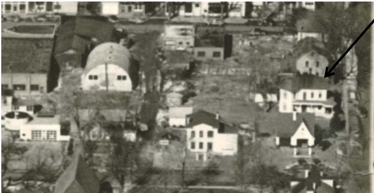
House moved to north, as depicted on east portion of 1947 aerial photograph of Mt Pleasant, looking north