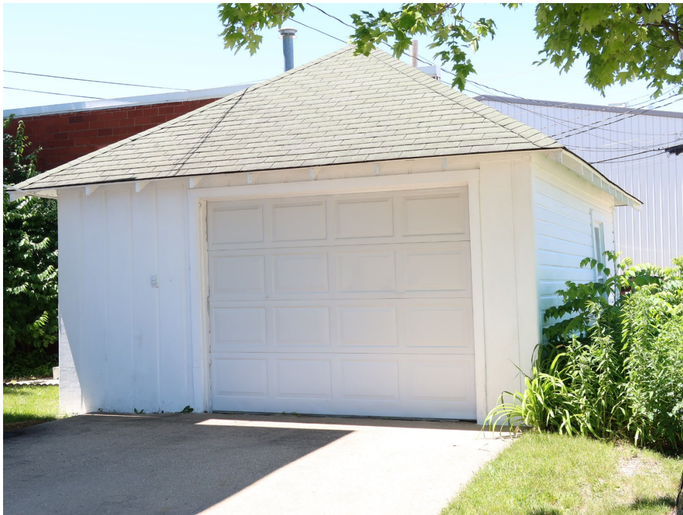
Photograph 44-02237-006. East elevation of garage, looking southwest (June 2024)