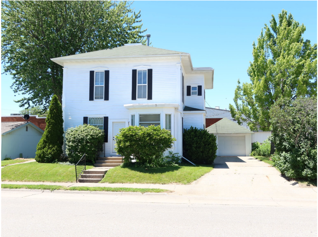
Photograph 44-02237-005. East elevation, looking west (June 2024)