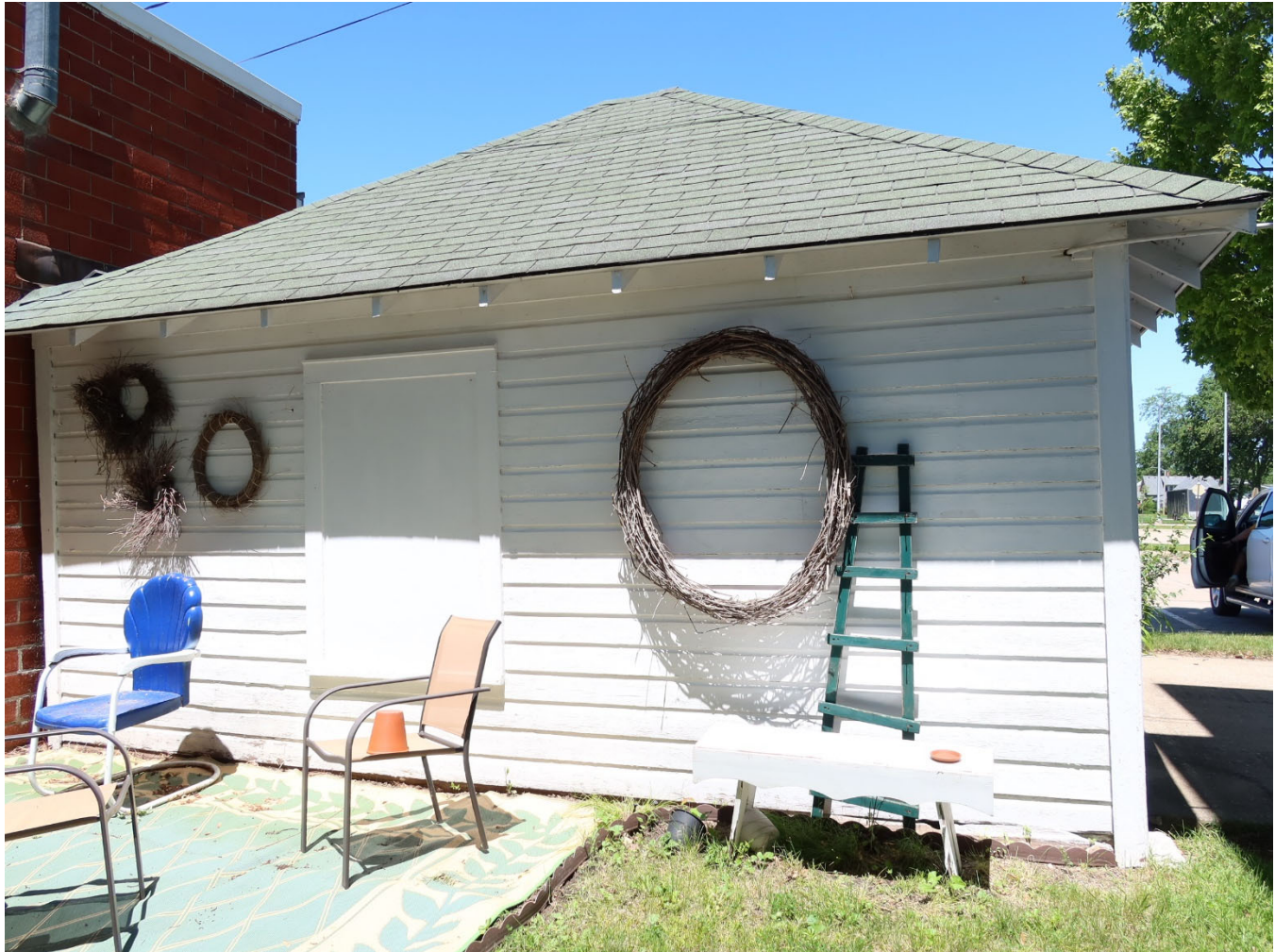
Photograph 44-02237-008. South elevation of garage, looking north (June 2024)