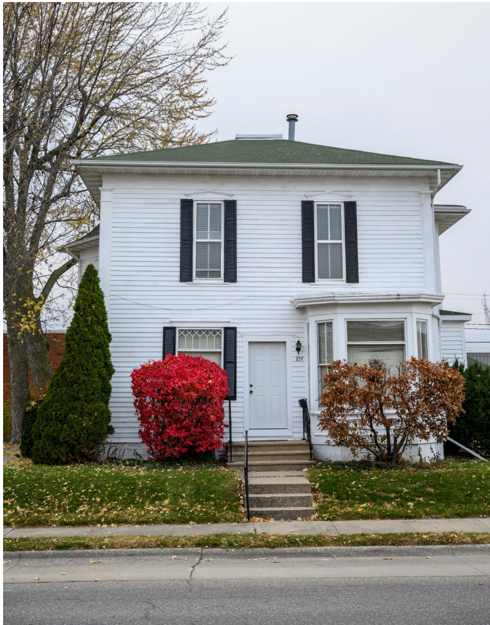
Photograph 44-02237-002. East elevation, looking west (October 2023)