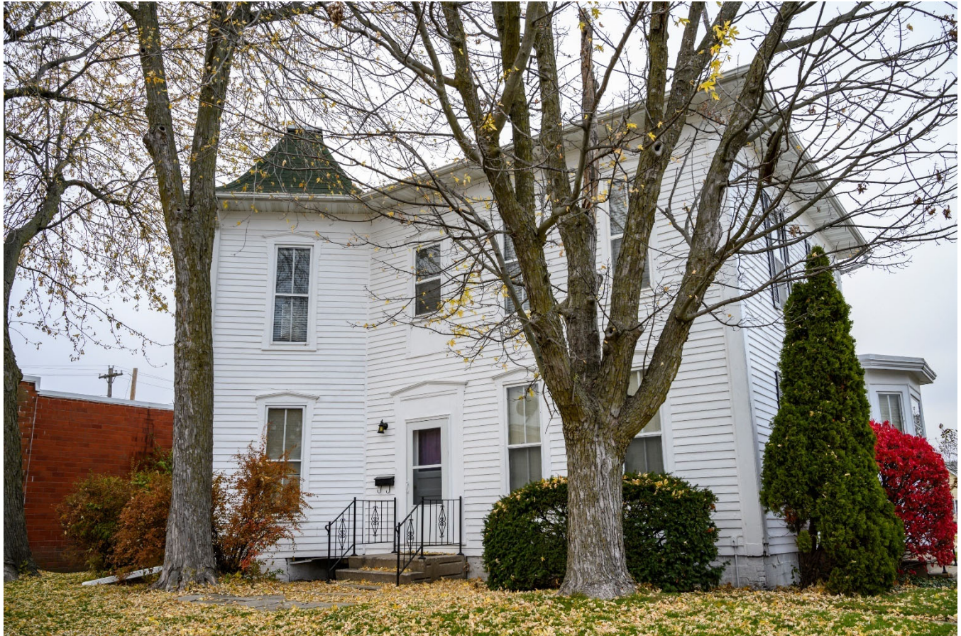
Photograph 44-02237-001. South elevation, looking northwest (October 2023)