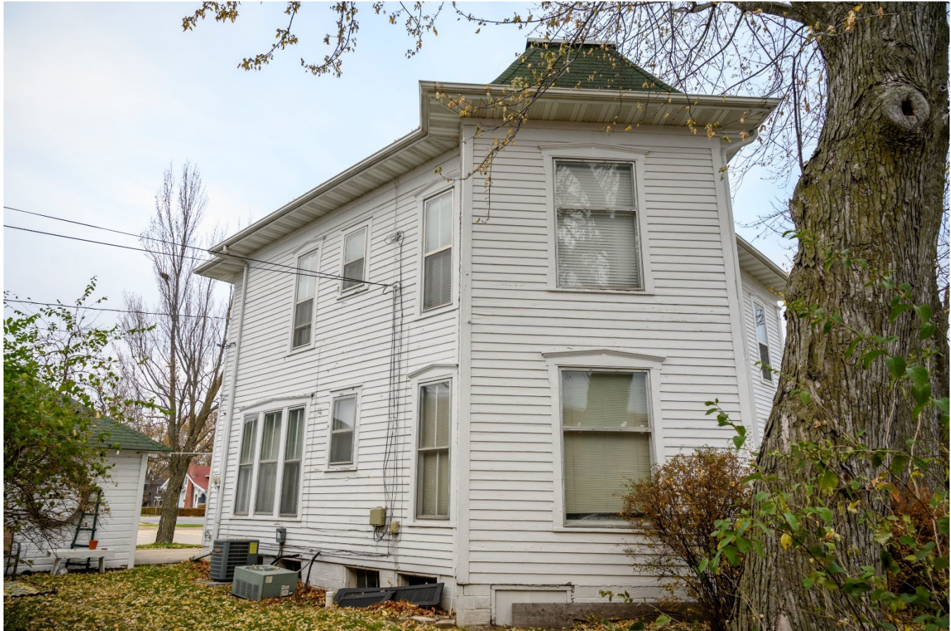
Photograph 44-02273-003. West elevation, looking northeast (October 2023)