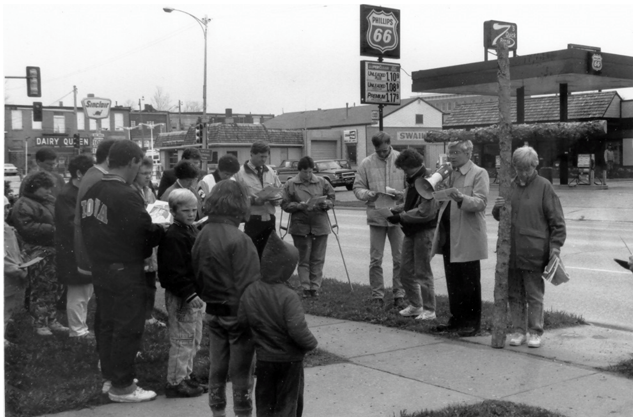
Building in background in 1990s