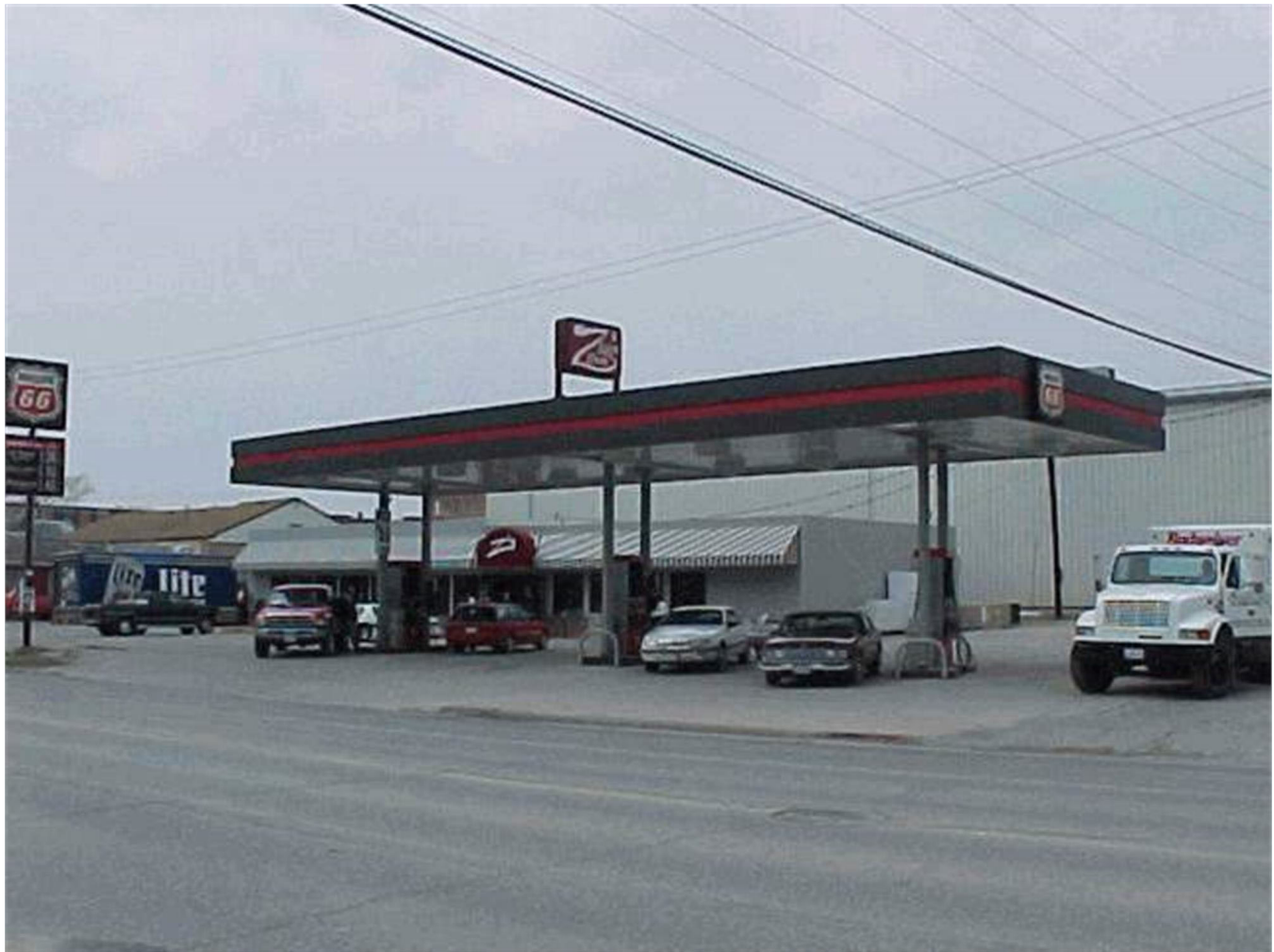
Building as Z's Quick Break with new canopy (1996)

Quick Break Henry Name of Property County 201 E. Washington St Mount Pleasant Address City