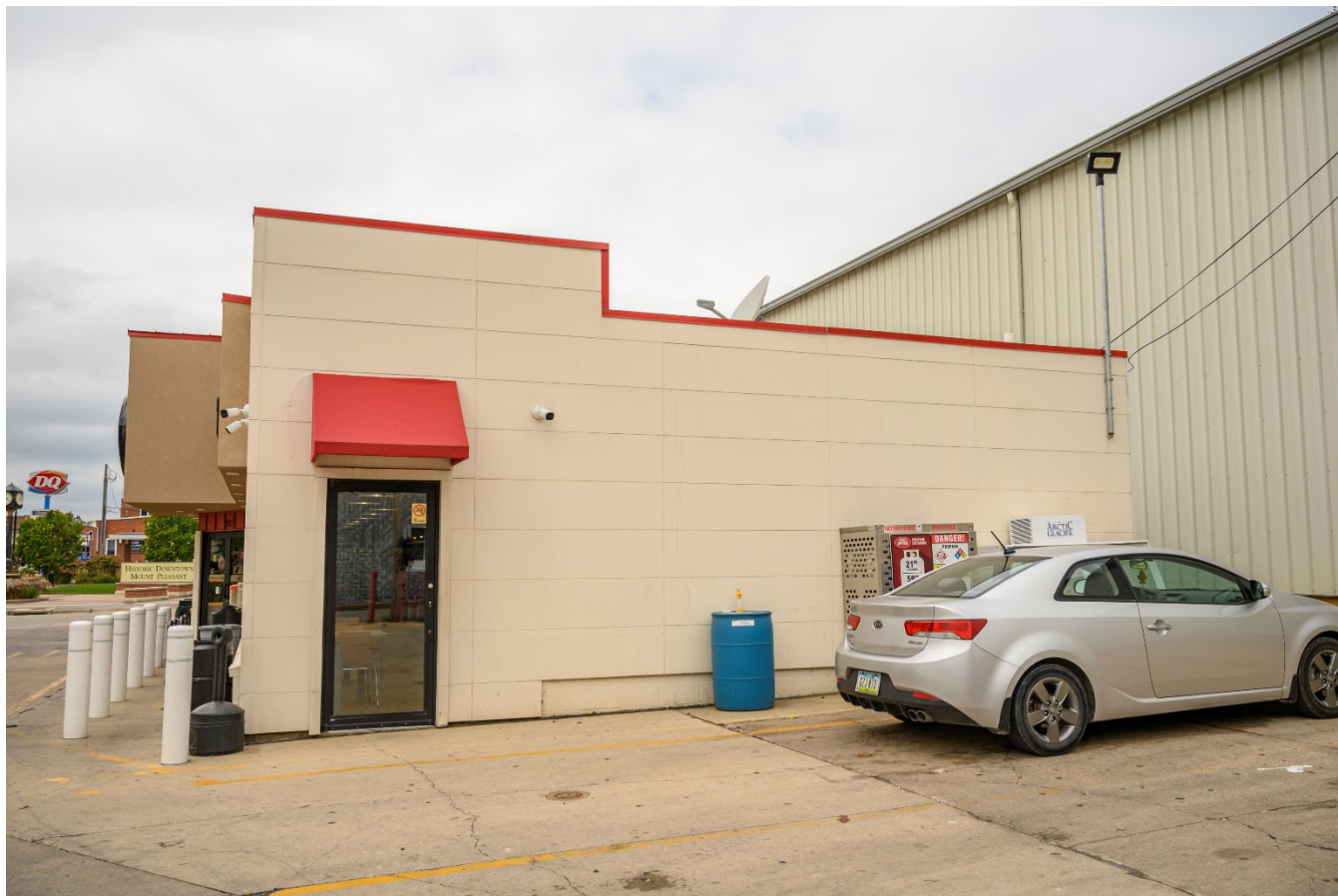
Photograph 44-02267-003. East elevation, looking west (October 2023)