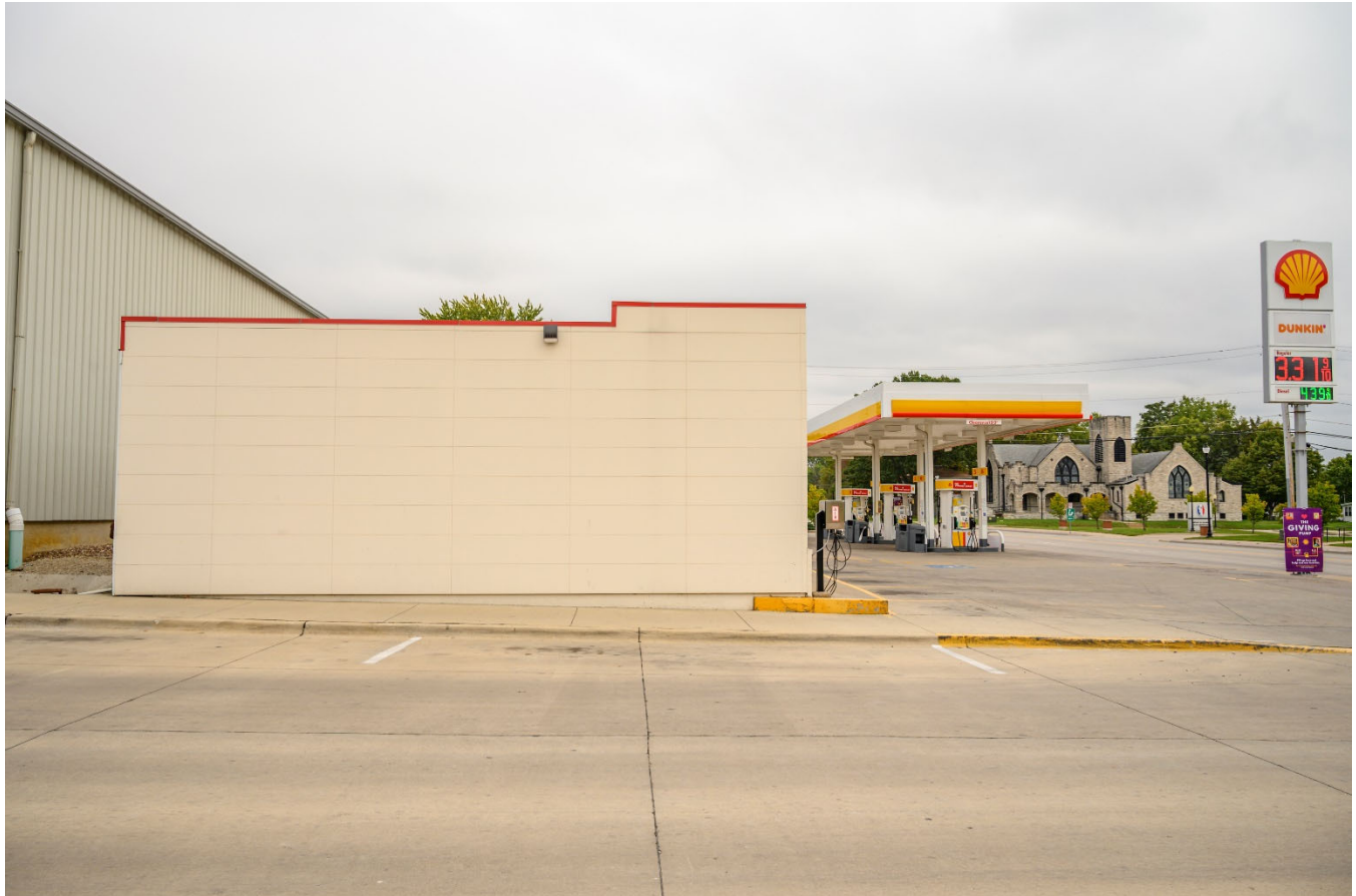
Photograph 44-02267-002. West elevation, looking east (October 2023)

Quick Break Henry Name of Property County 201 E. Washington St Mount Pleasant Address City