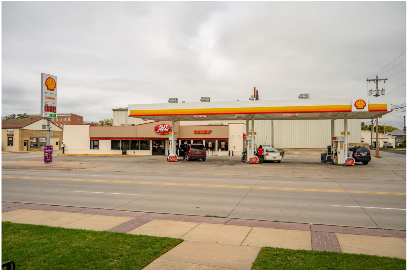
Photograph 44-02267-001. South elevation, looking north (October 2023)