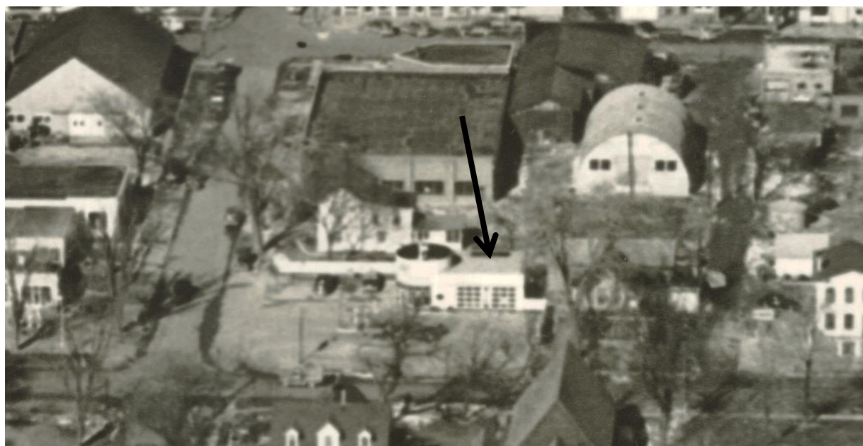
Building on east portion of 1947 aerial photograph of Mt Pleasant, looking north