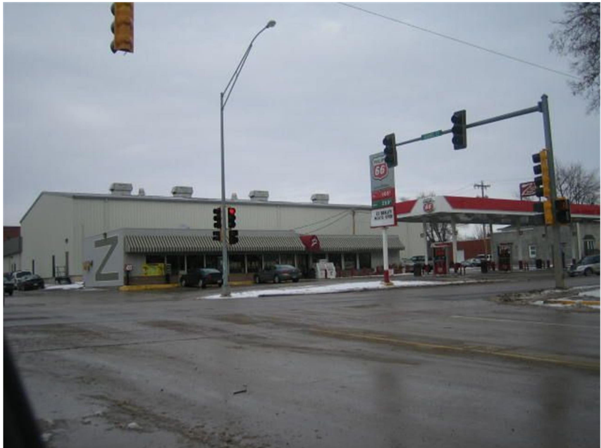
Building as Z's Quick Break with old canopy

Quick Break Henry Name of Property County 201 E. Washington St Mount Pleasant Address City