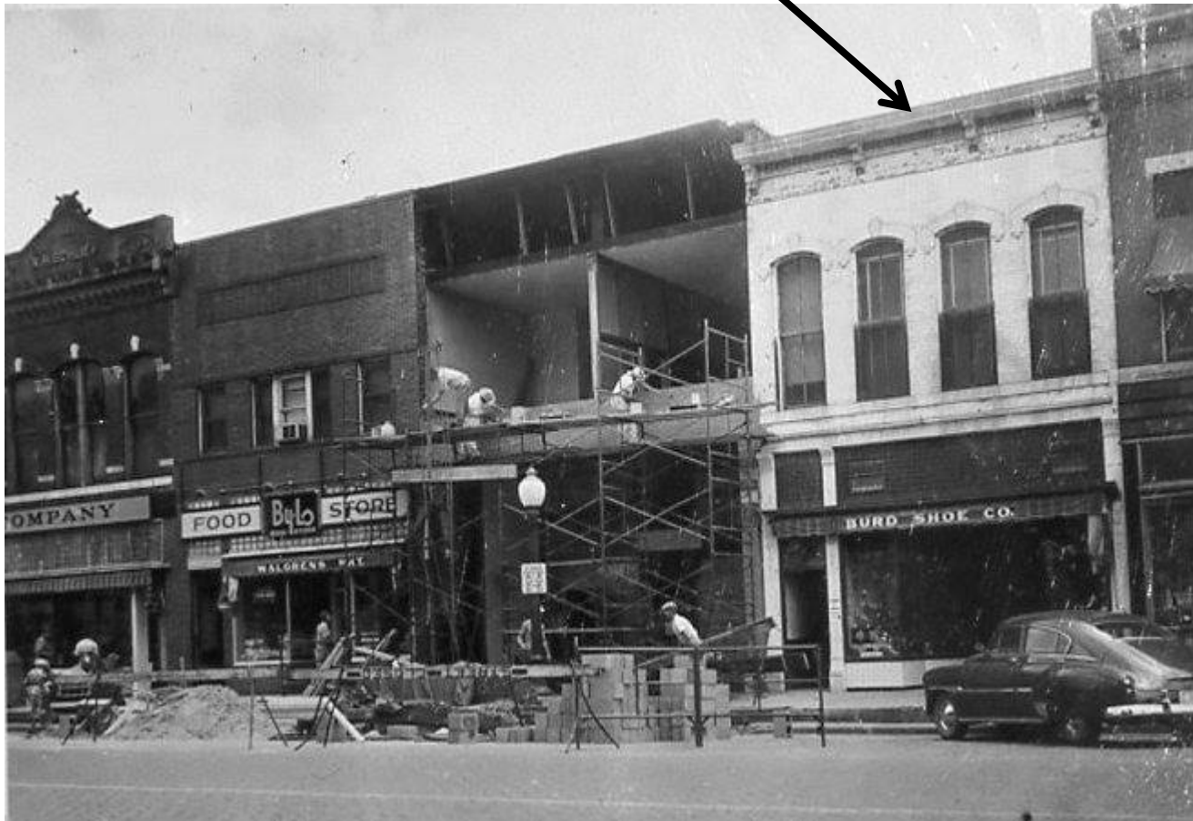
Middle of 100 block of S. Main St in 1958 (HCHT Facebook album)