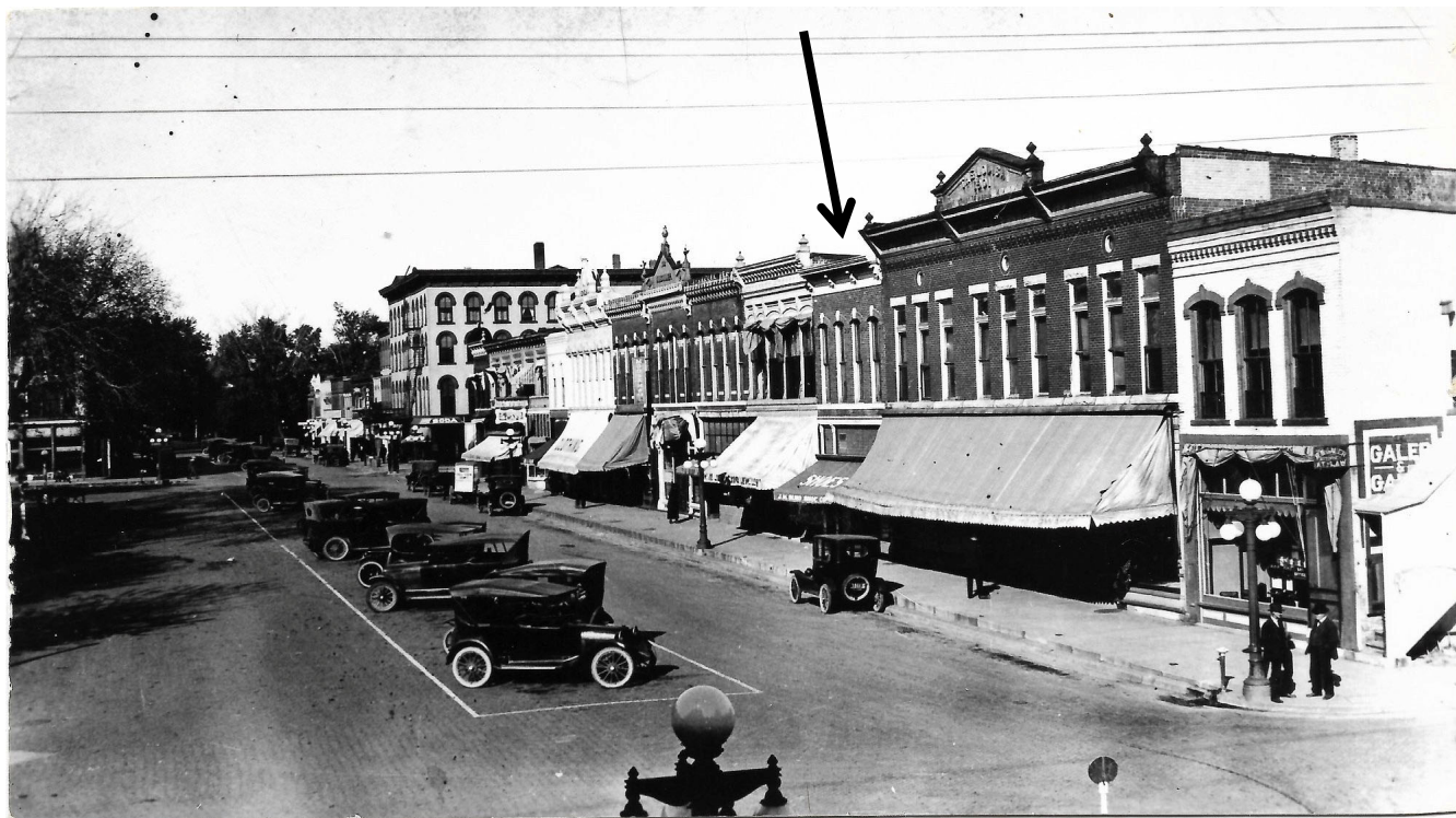
100 block of S. Main St around 1925 (HCHT Facebook album)