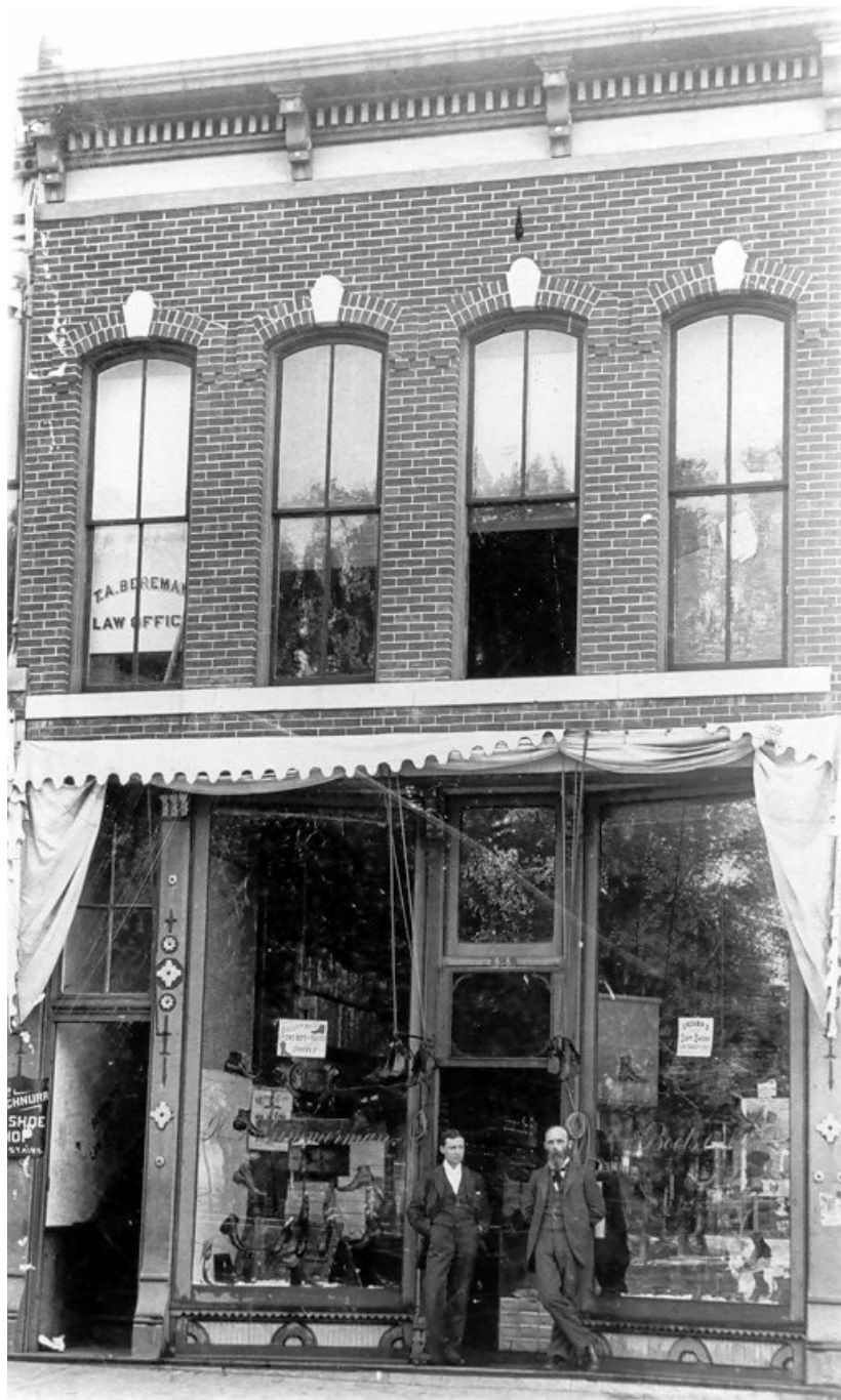
H.L. Timmerman, boots and shoes, circa 1890s