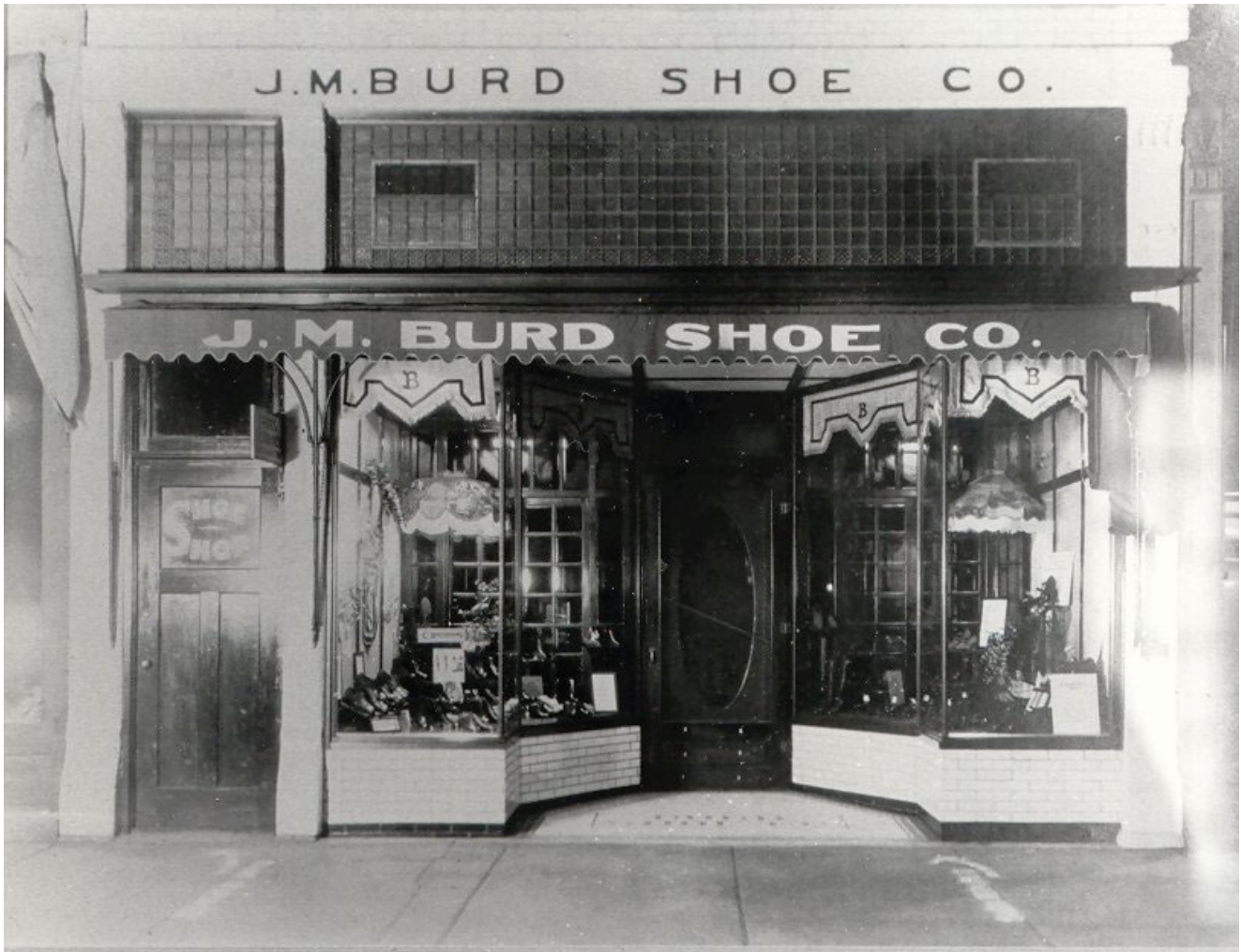
Storefront remodel complete for J.M. Burd Shoe Co (HCHT Facebook album)