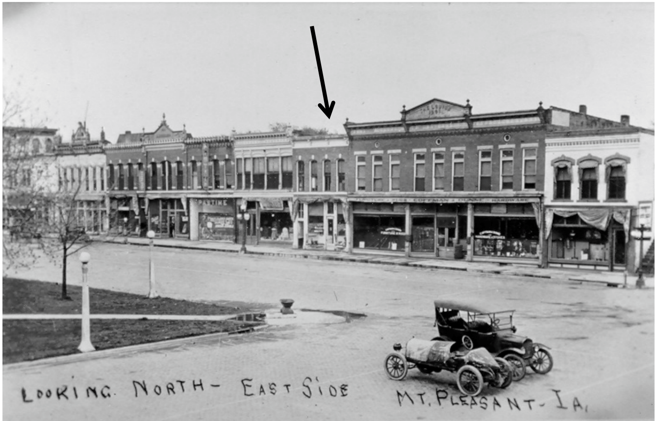
100 block of S. Main St in 1910s