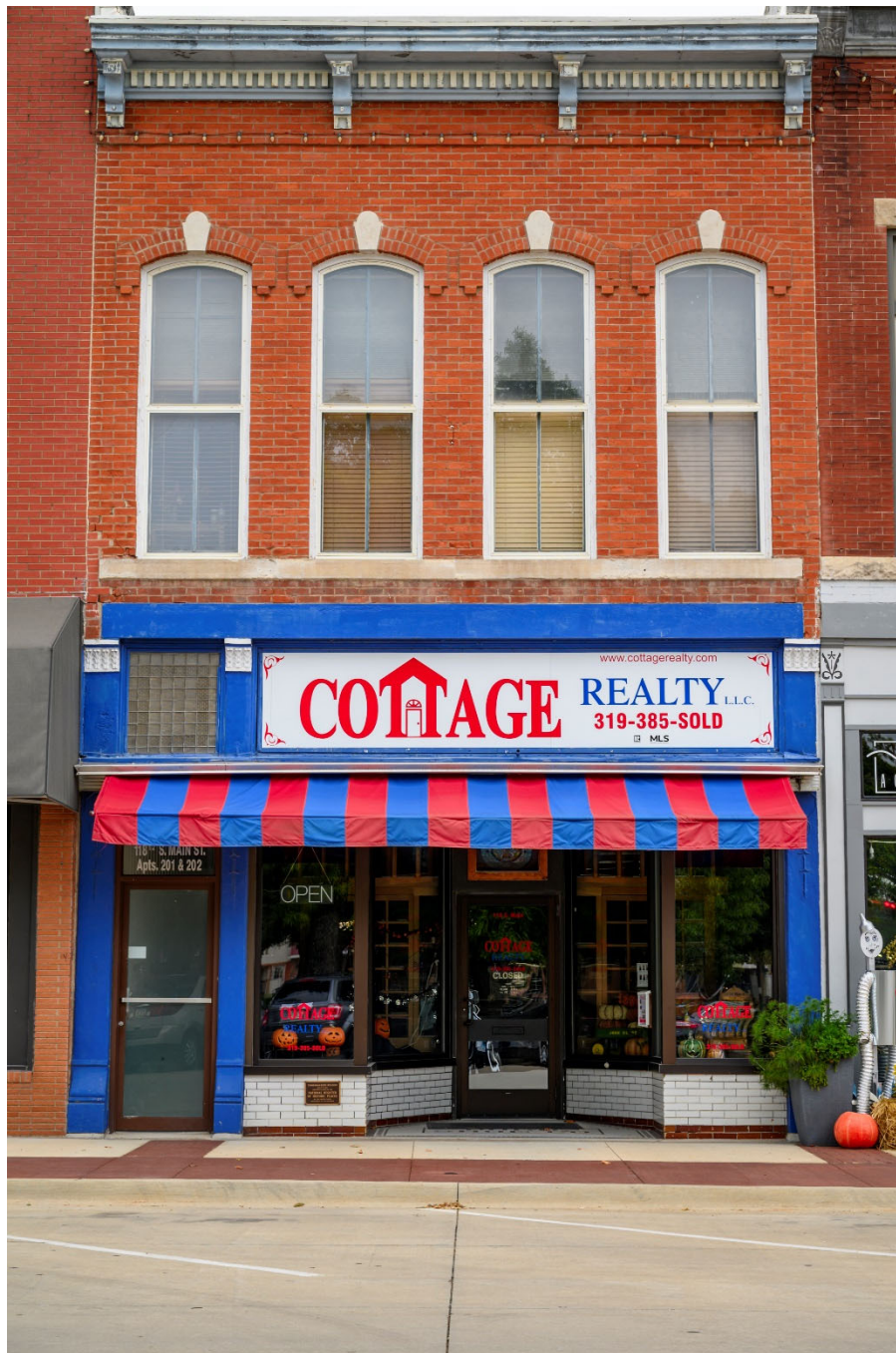
Photograph 44-00300-001. West elevation, looking east (October 2023)