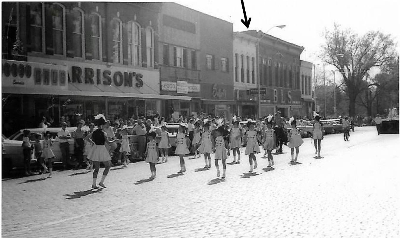
South portion of 100 block of S. Main St in 1962