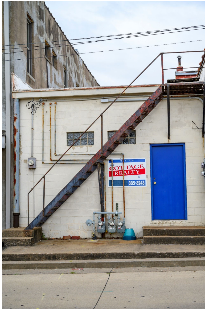
Photograph 44-00300-004. East elevation, looking west (October 2023)