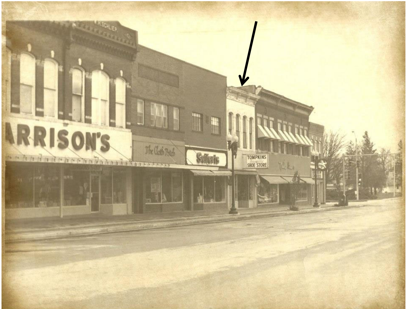
South end of 100 block of S. Main St in early 1980s (HCHT Facebook album)