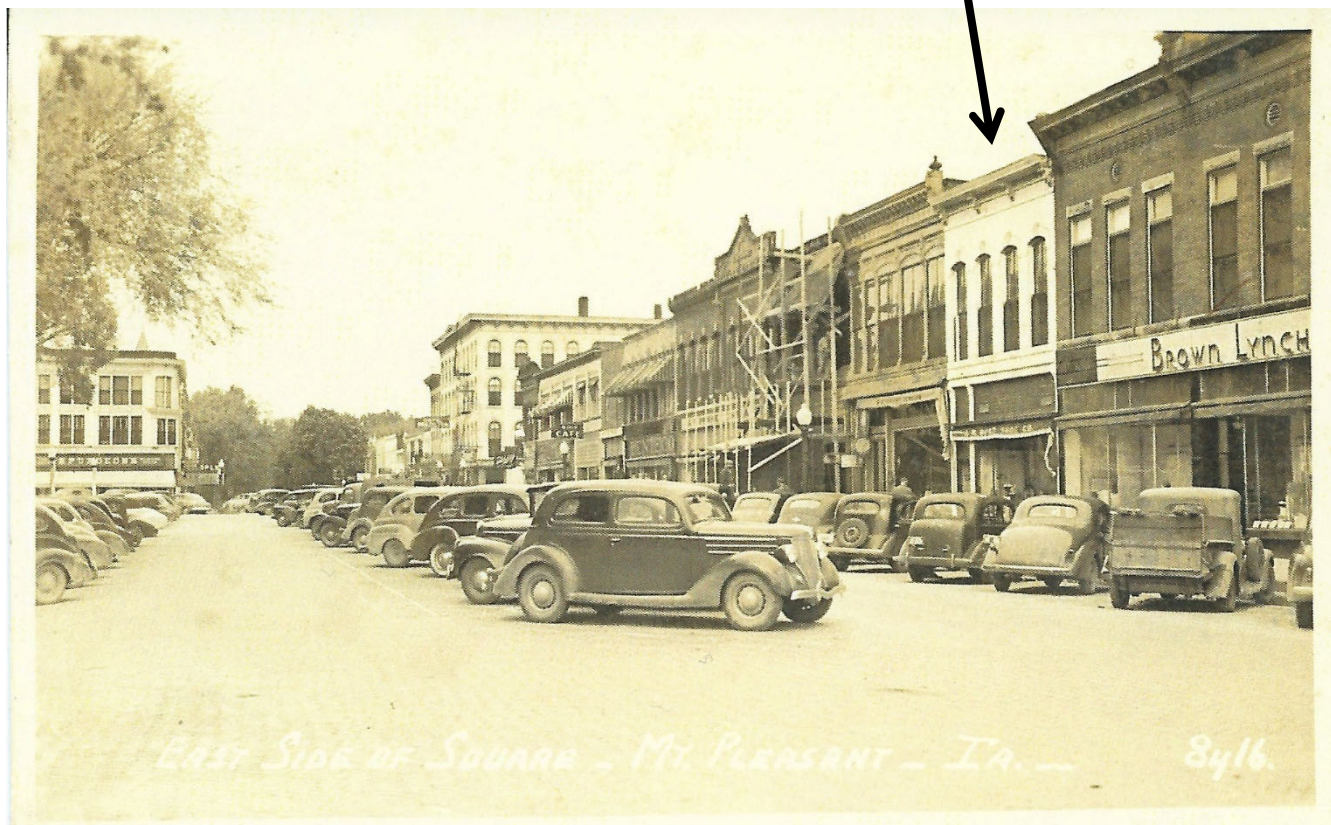
100 block of S. Main St in 1946