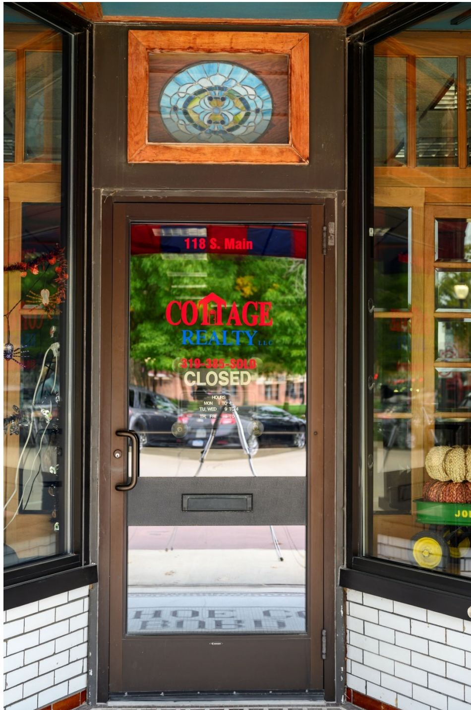
Photograph 44-00300-002. Detail of entry on west elevation, looking east (October 2023)