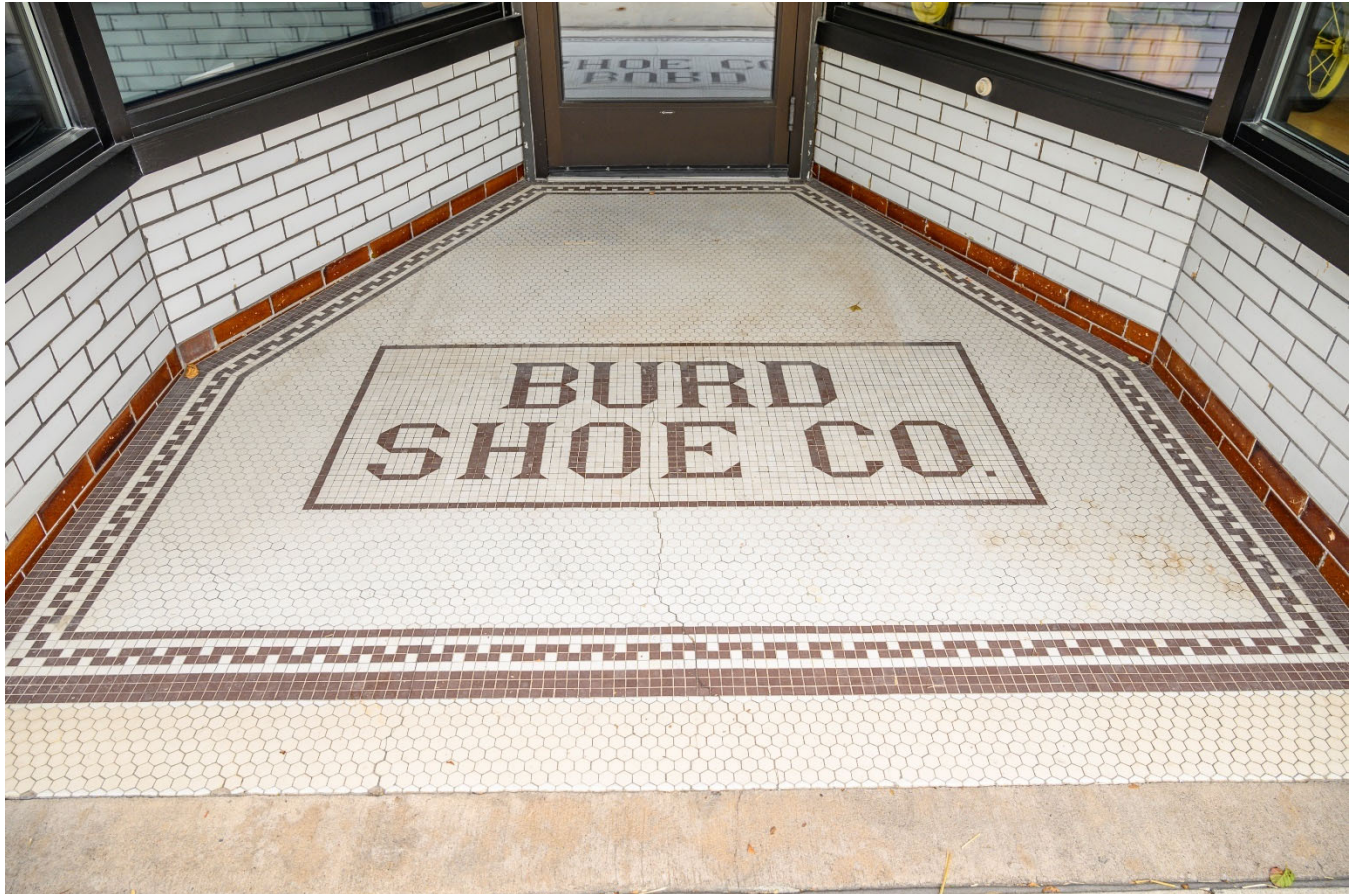
Photograph 44-00300-003. Detail of entry tile on west elevation, looking east (October 2023)