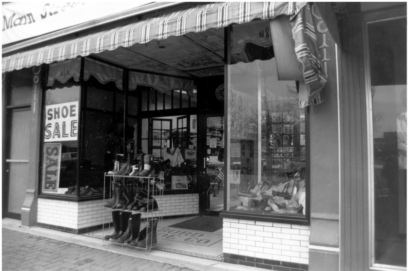
Storefront of building in early 1990s