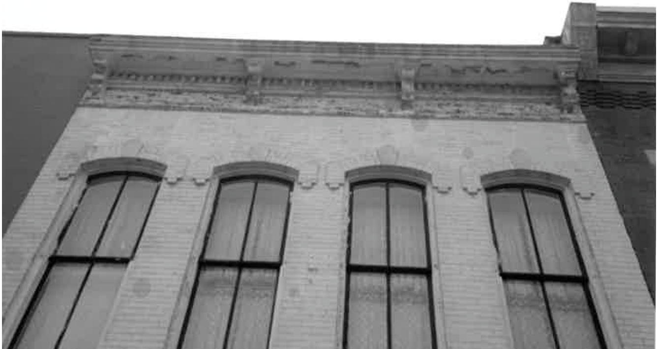
1990 survey photograph (Naumann 1991)