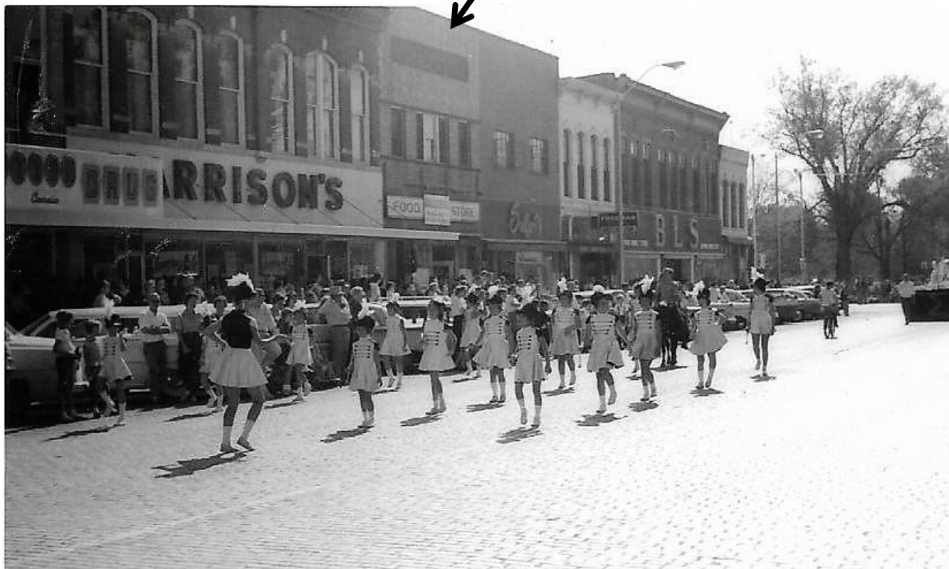
South portion of 100 block of S. Main St in 1962