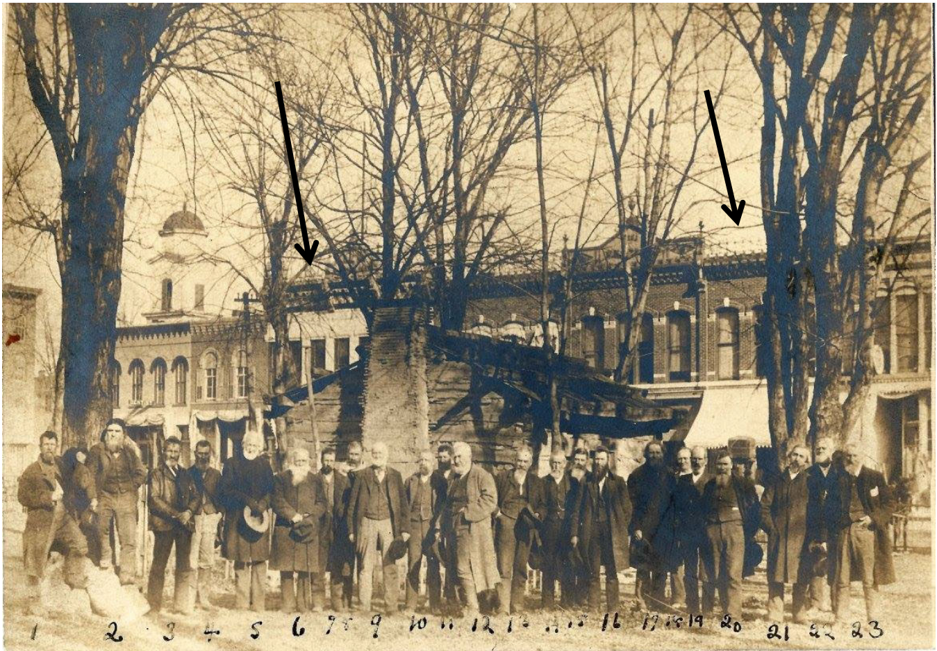
Central Park with 100 block of S. Main St in background in 1885

different exterior façade than original 1870 image - portion for Crane Hardware to north is same as earlier