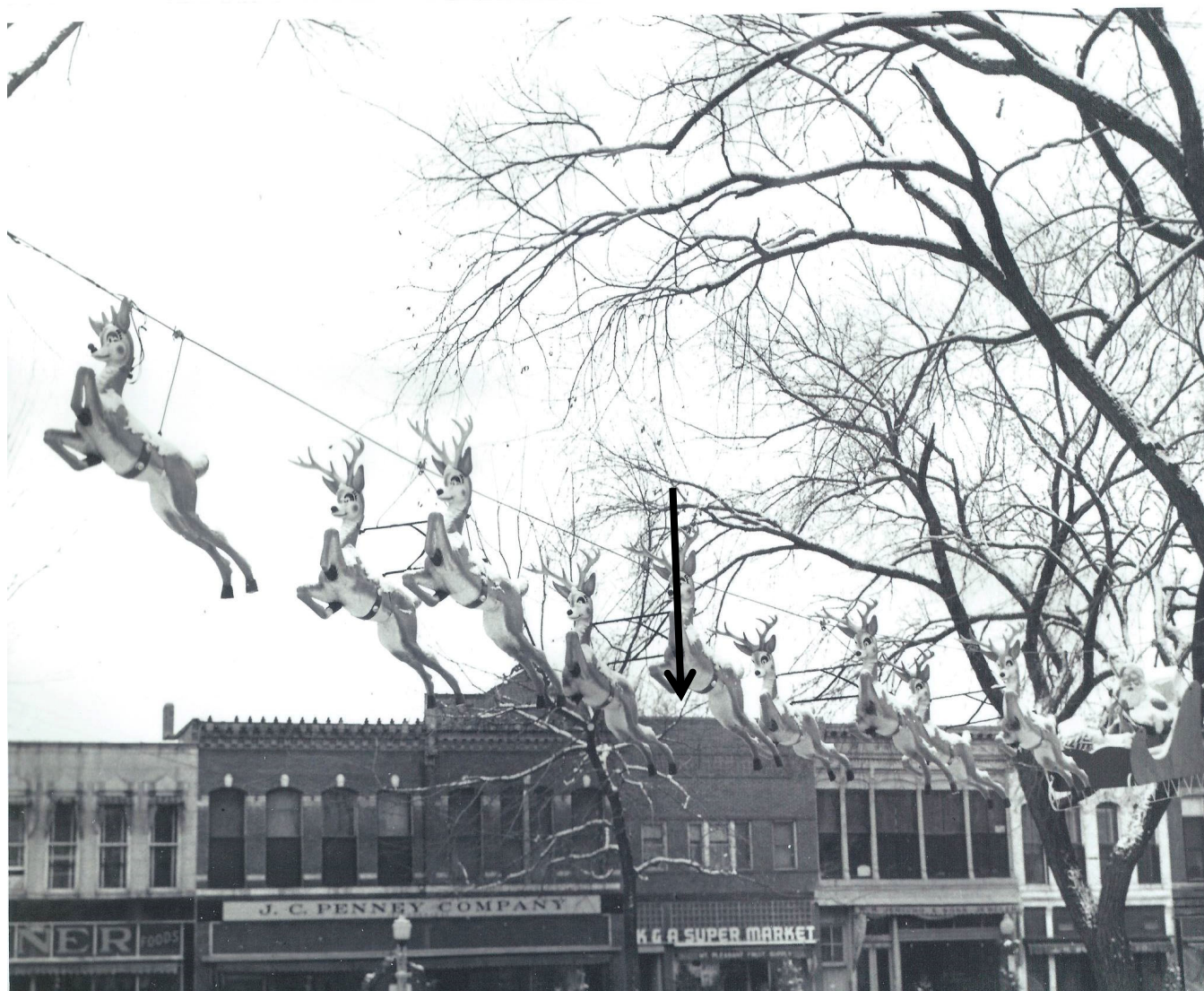
Middle of 100 block of S. Main St in 1953