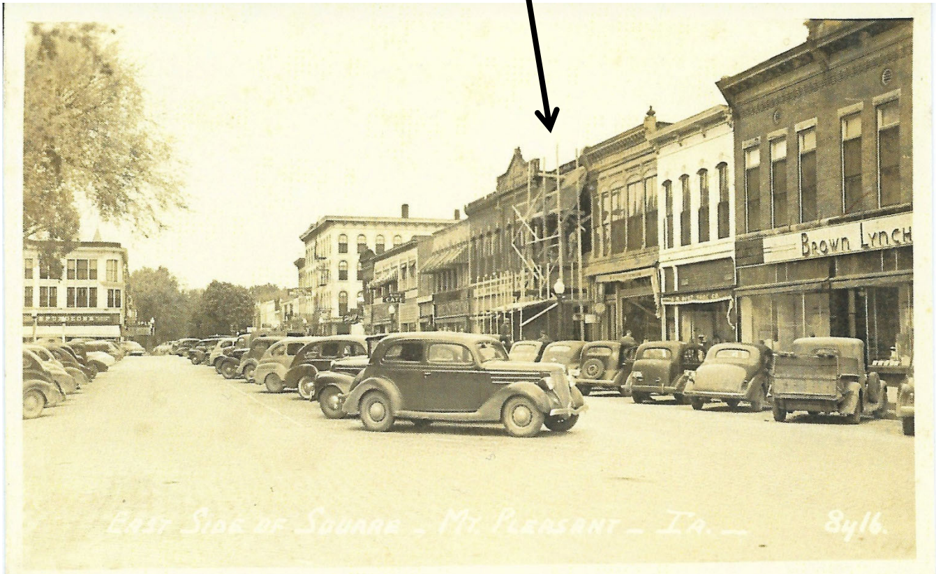
100 block of S. Main St in 1946 showing brick façade being removed and reconstructed on this building