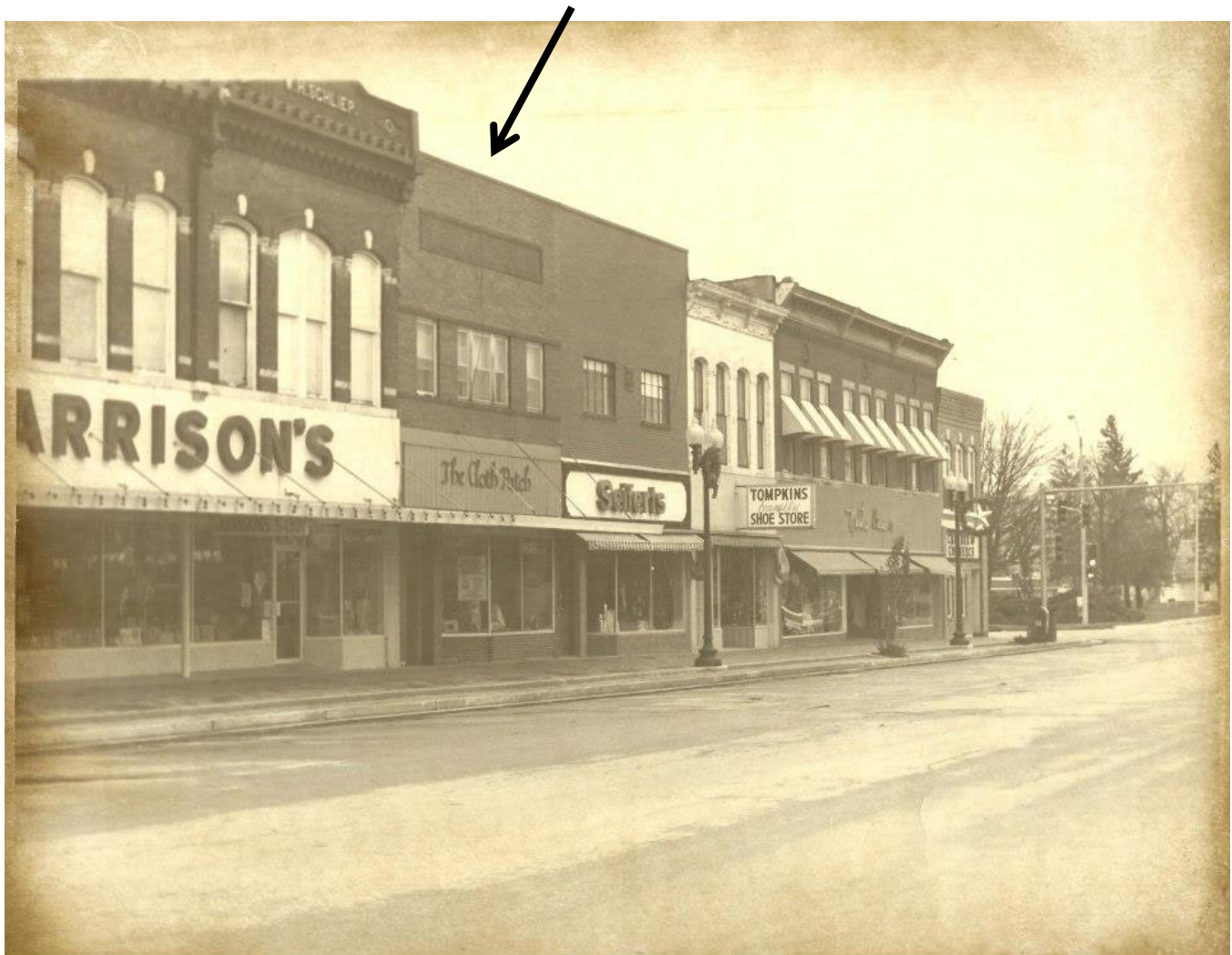
South end of 100 block of S. Main St in early 1980s (HCHT Facebook album)