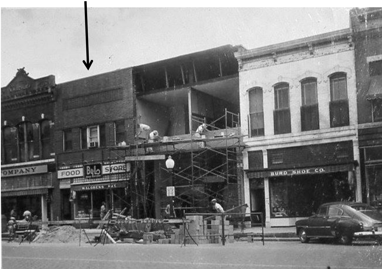
Middle of 100 block of S. Main St in 1958 showing 1946 façade of this building, and brick façade being removed and reconstructed on the building to south