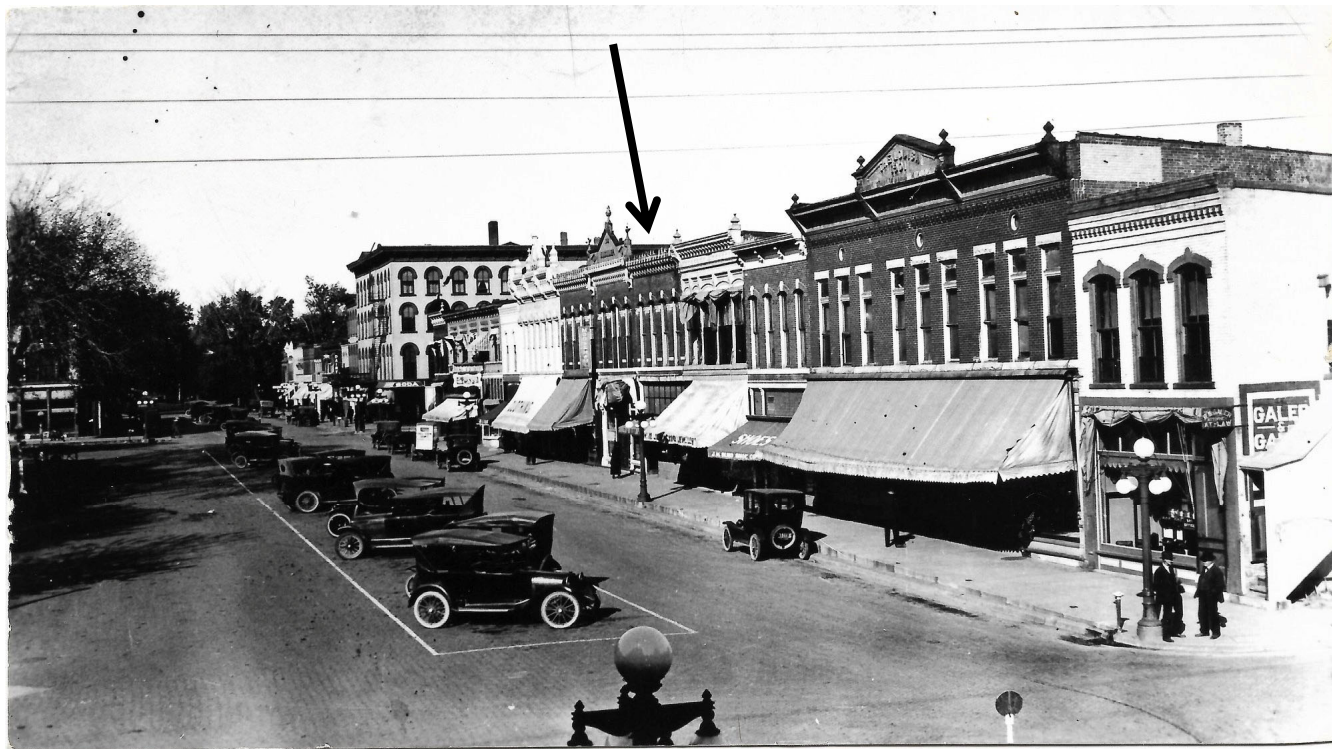
100 block of S. Main St around 1925