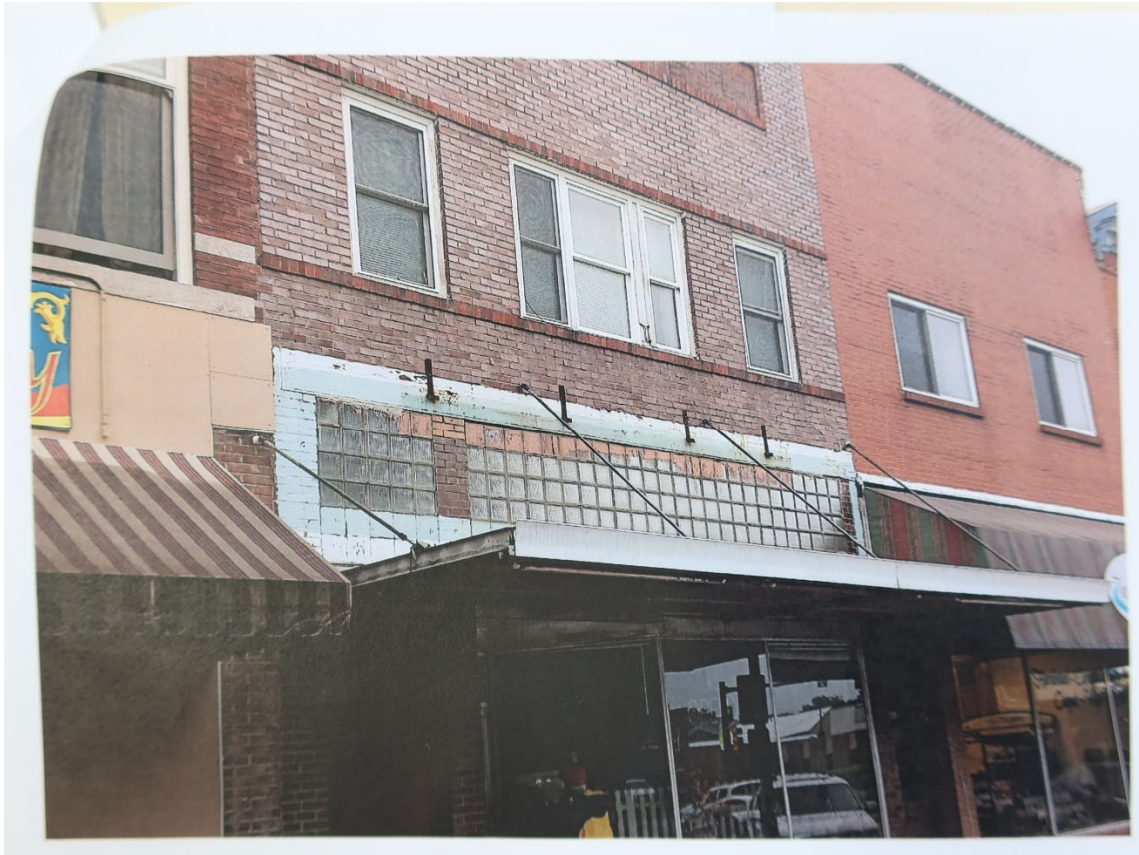
Existing storefront in 2005, photo for sign permit for Yenchay's Market (City of Mount Pleasant building permits)

glass block in transom from 1946 façade remodel remains in place behind signage panel