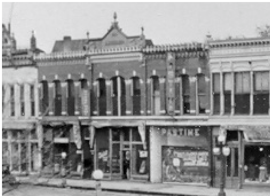
100 block of S. Main St in 1910s