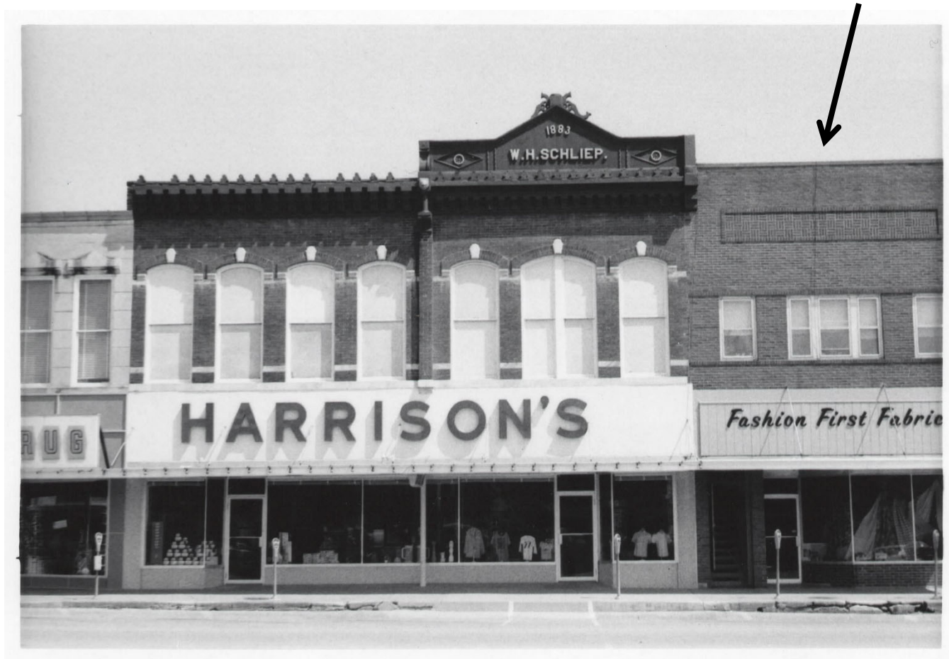
Building in early 1970s (HCHT files)