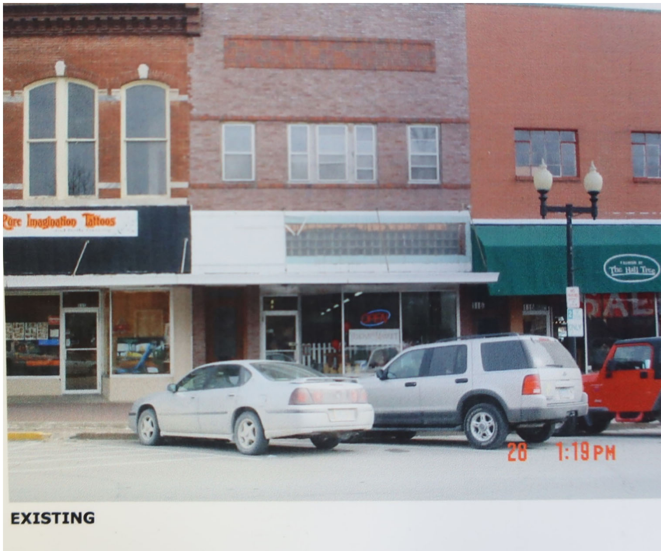
Existing storefront in 2005, photo for sign permit for Yenchay's Market (City of Mount Pleasant building permits)

glass block in transom from 1946 façade remodel remains in place behind signage panel