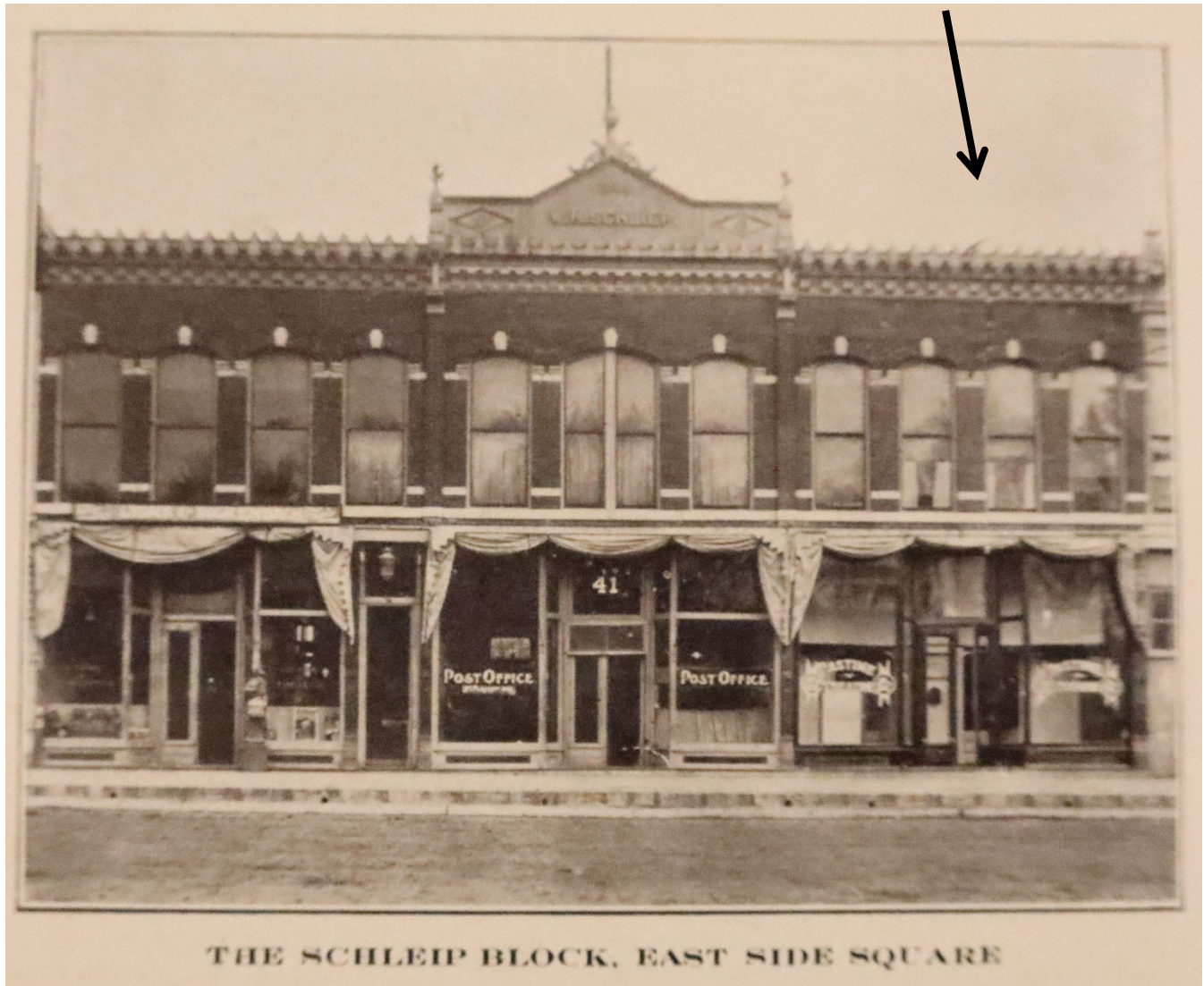
Schliep Block in 1909 ( Mt Pleasant Beautiful 1909: 28)