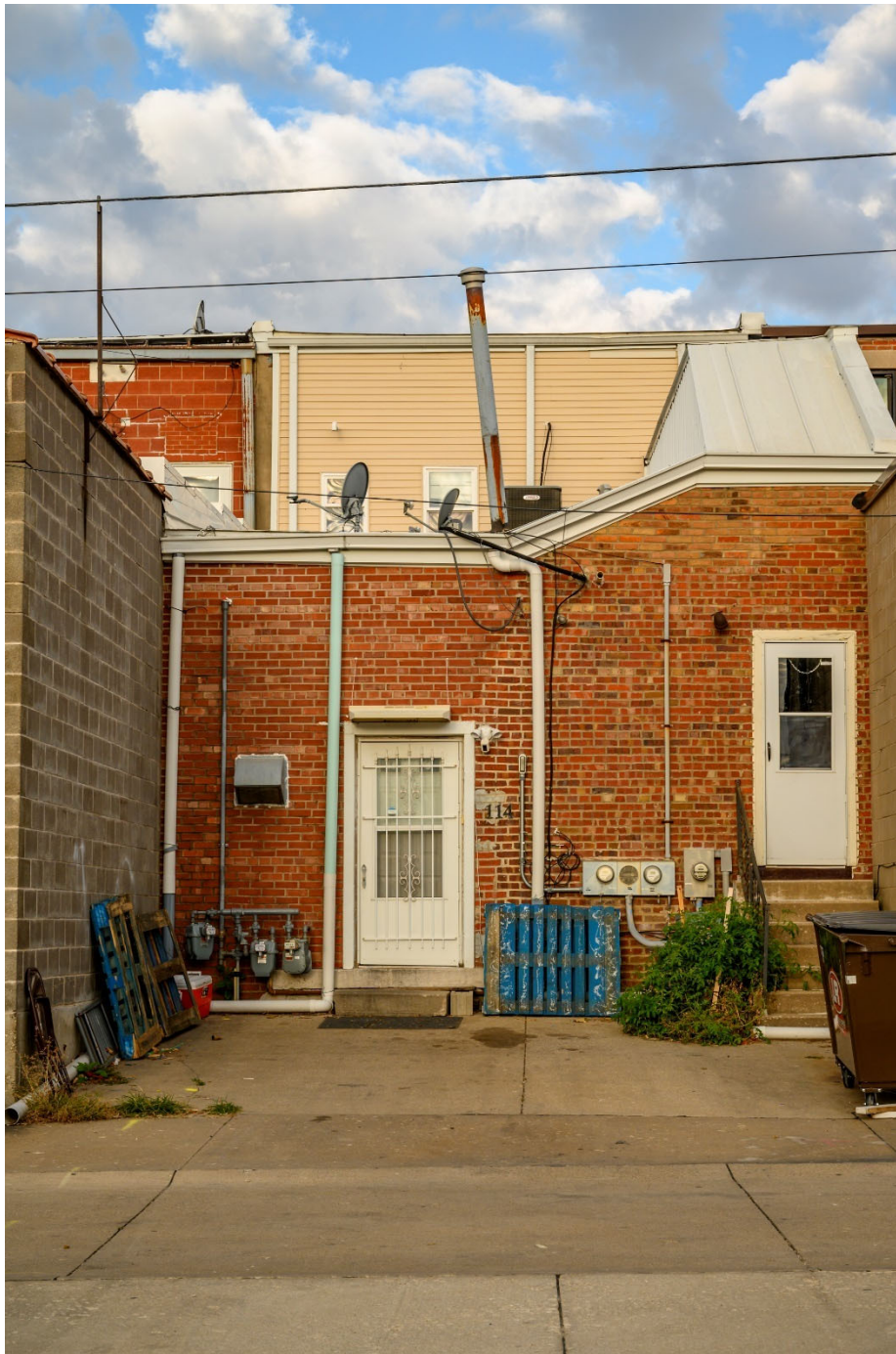
Photograph 44-00298-002. East elevation, looking west (October 2023)