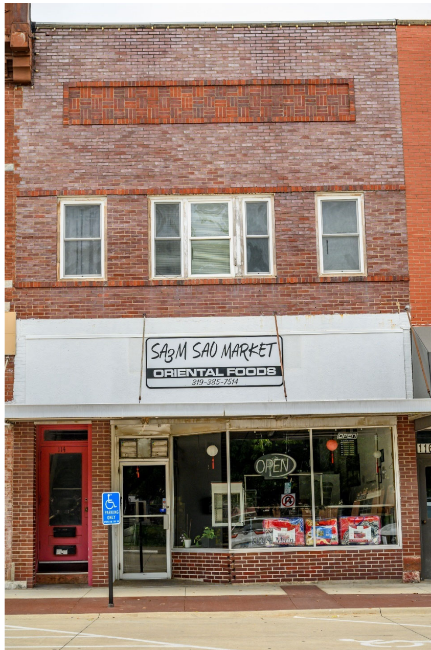
Photograph 44-00298-001. West elevation, looking east (October 2023)