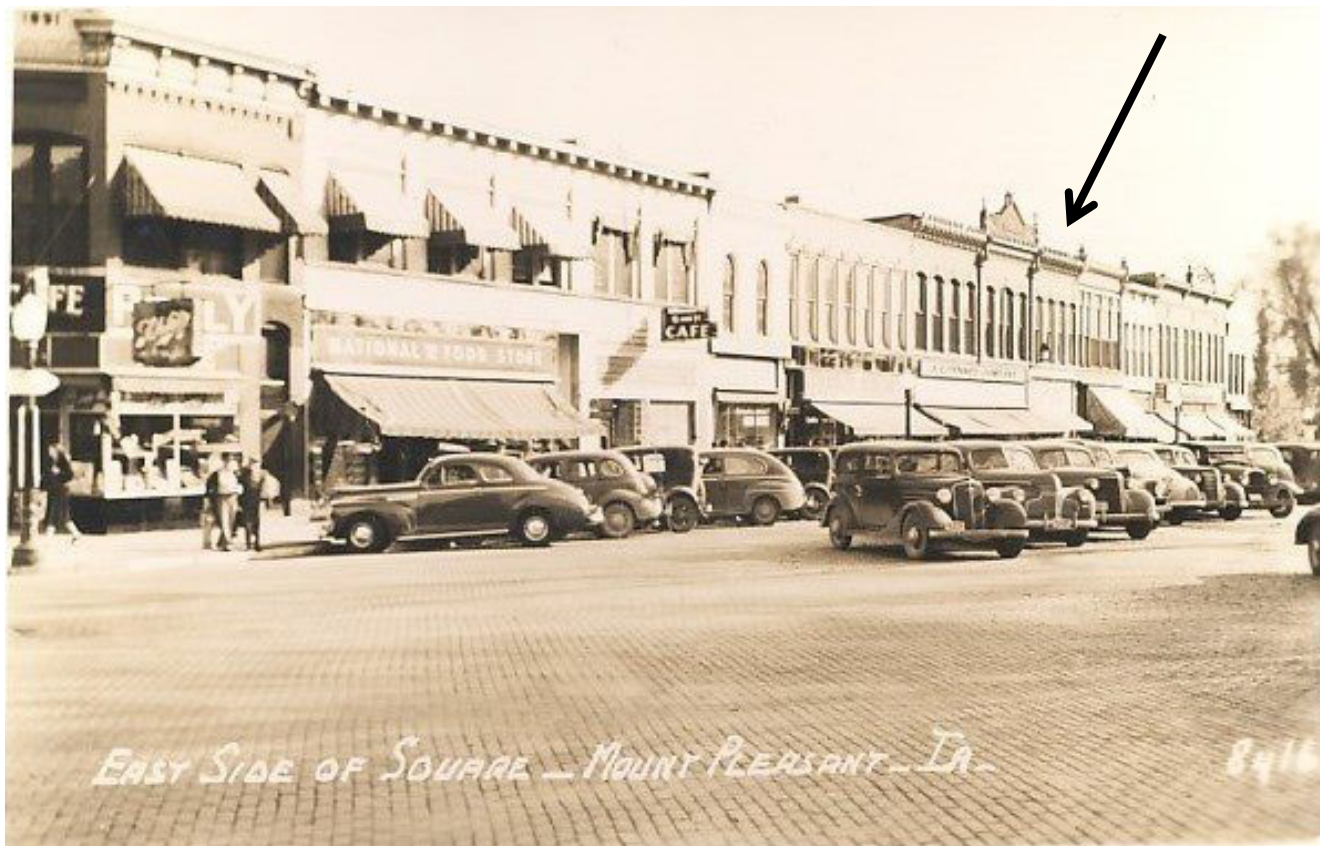
100 block of S. Main St in early 1940s (HCHT Facebook album)