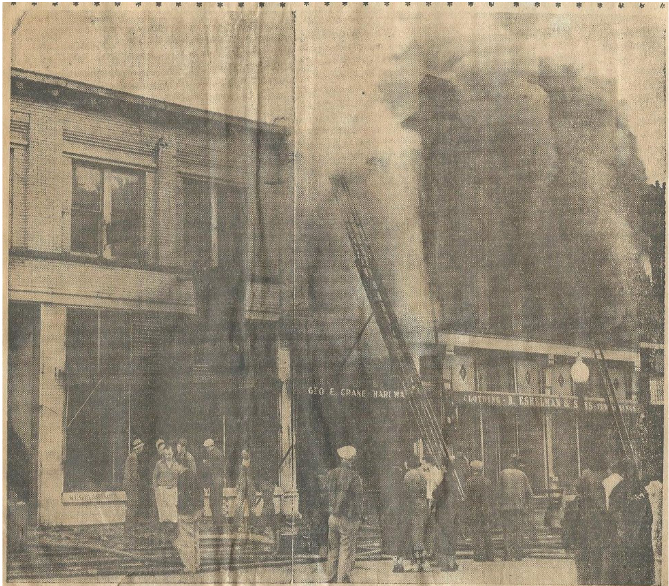
Fire on the east side of the square started in the building at the left and then spread to the Crane building to its south and to the Eshelman building ( Mt Pleasant News , June 10, 1938, 1; HCHT clipping)