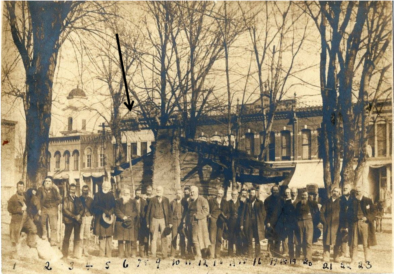
Central Park with 100 block of S. Main St in background in 1885

different exterior façade than original 1870 image - portion for Crane Hardware to north is same as earlier