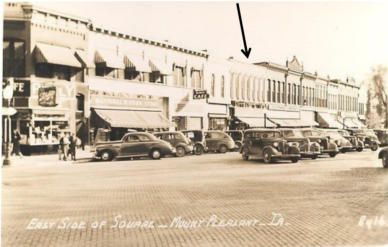
100 block of S. Main St in early 1940s