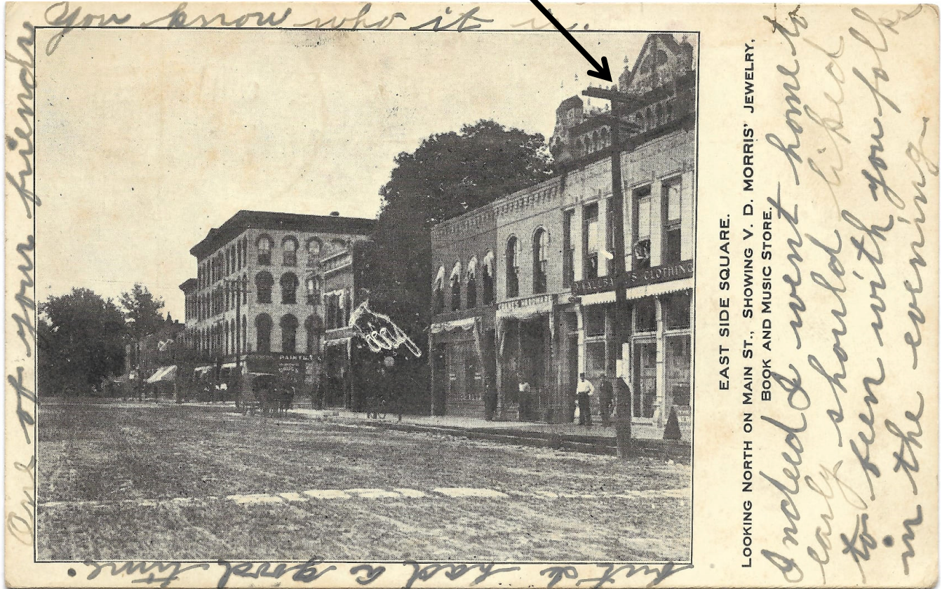
North portion of 100 block of S. Main St around 1907