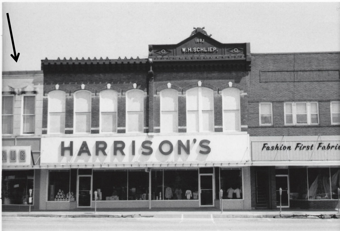
Building in early 1970s