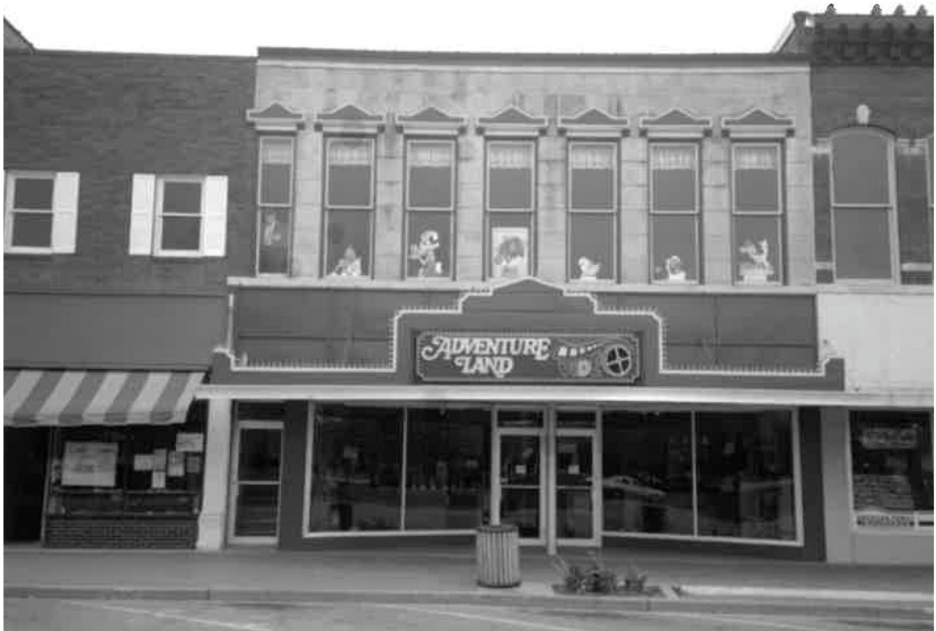
1990 survey photograph (Naumann 1991)