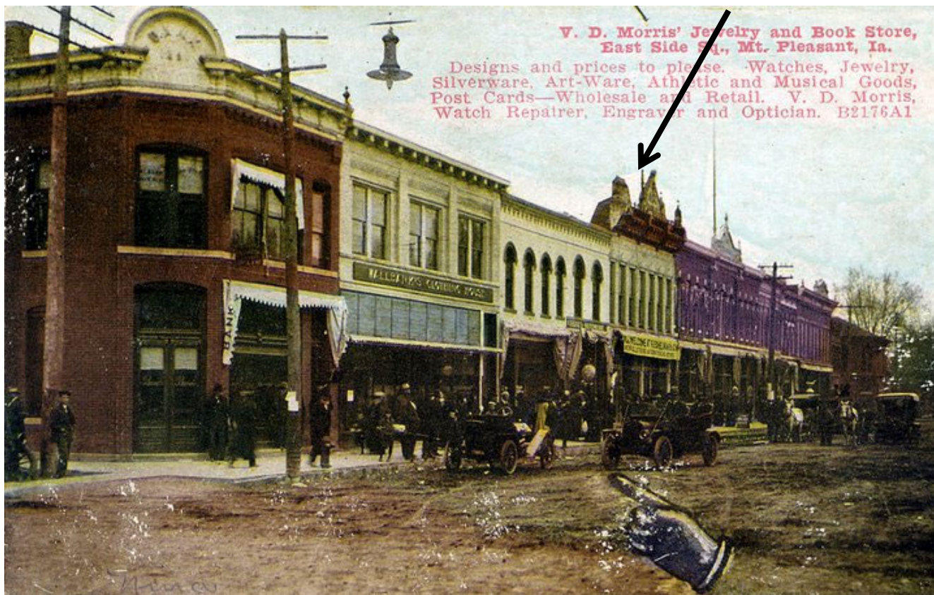
100 block of S. Main St around 1915