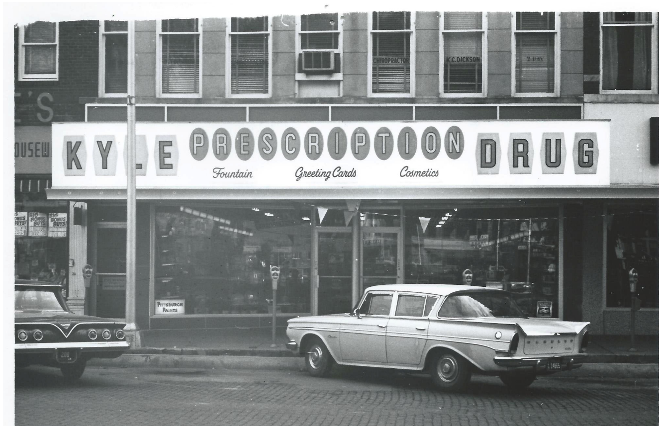
Building with new storefront for Kyle Drug (HCHT Facebook album)