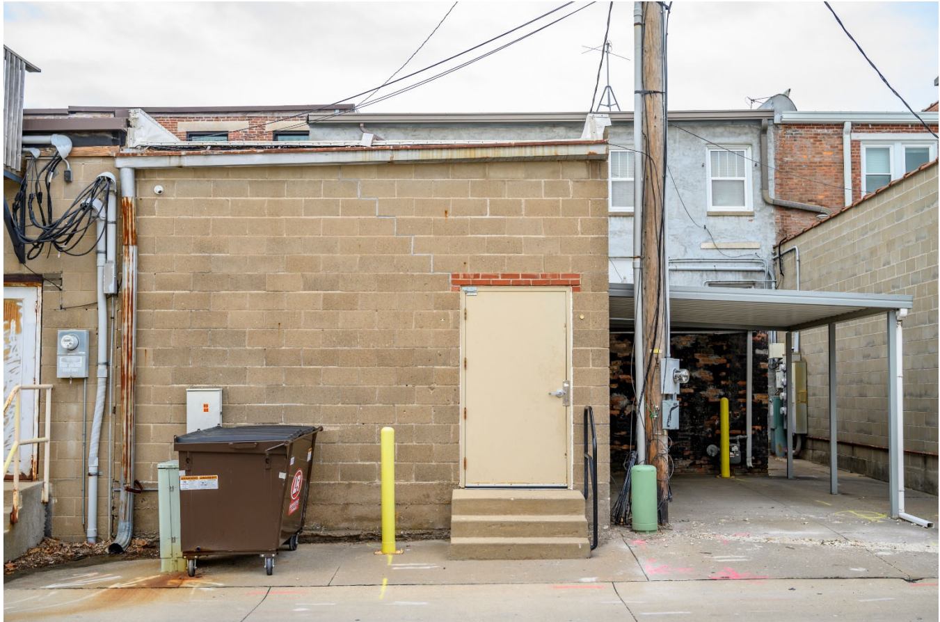
Photograph 44-00296-003. East elevation, looking west (October 2023)