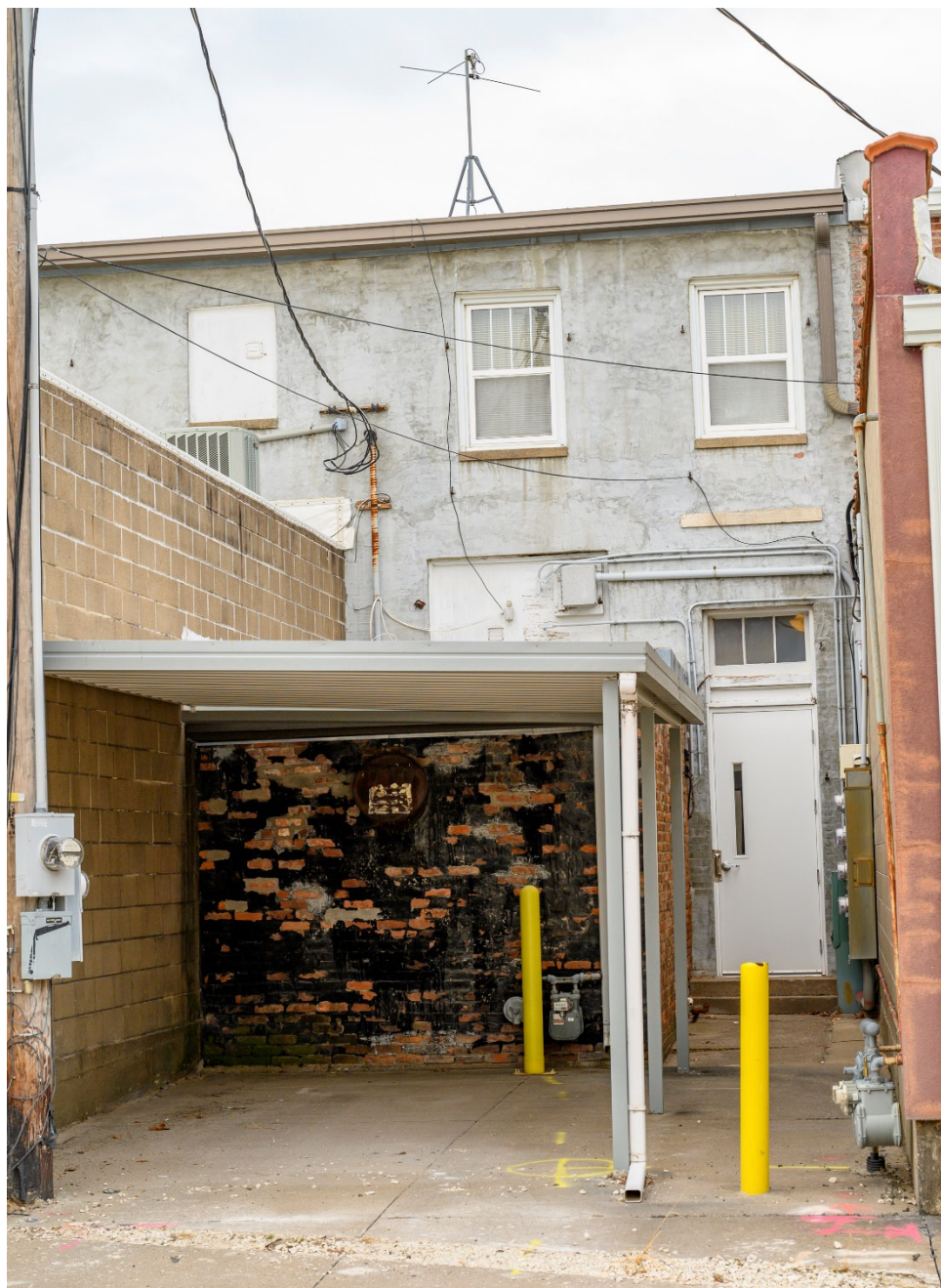
Photograph 44-00296-002. East elevation, looking west (October 2023)