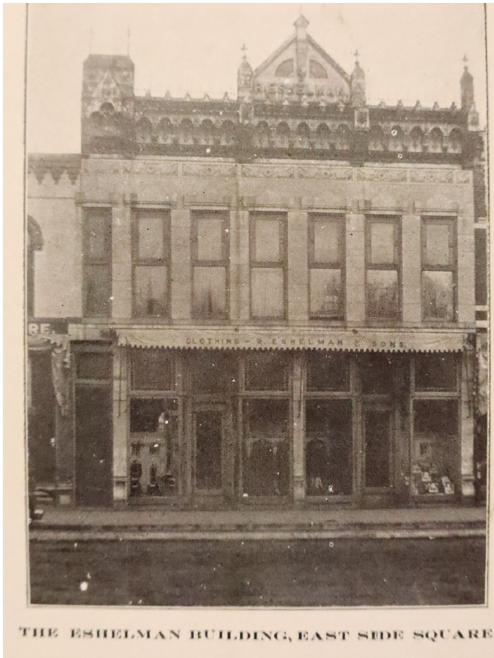
Eshelman Building in 1909 ( Mt Pleasant Beautiful 1909: 26)