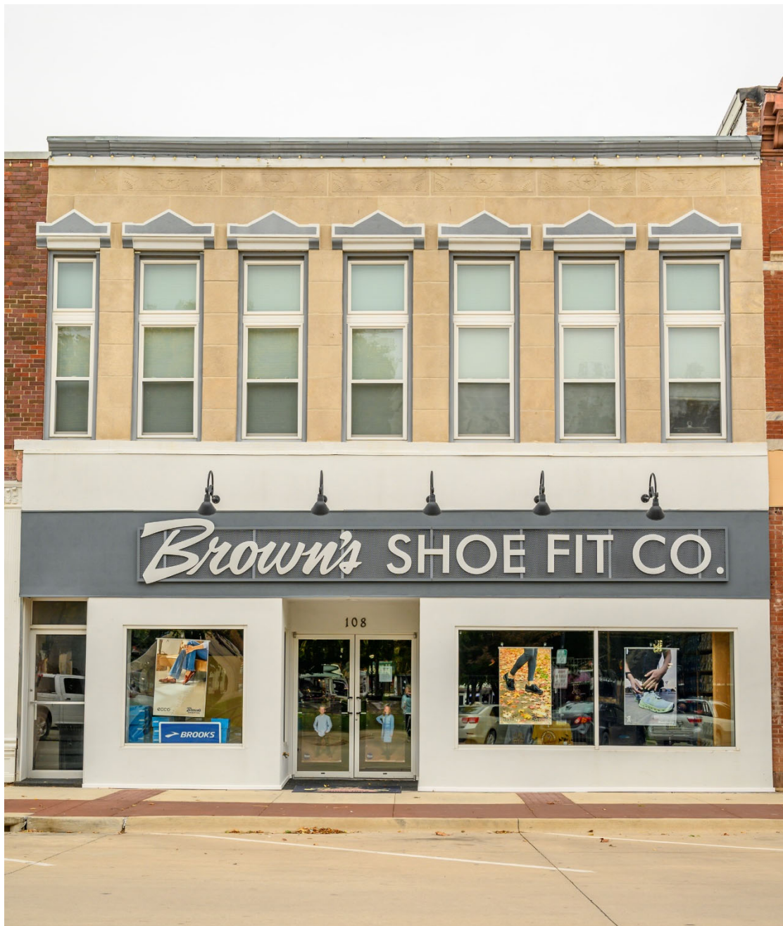
Photograph 44-00296-001. West elevation, looking east (October 2023)