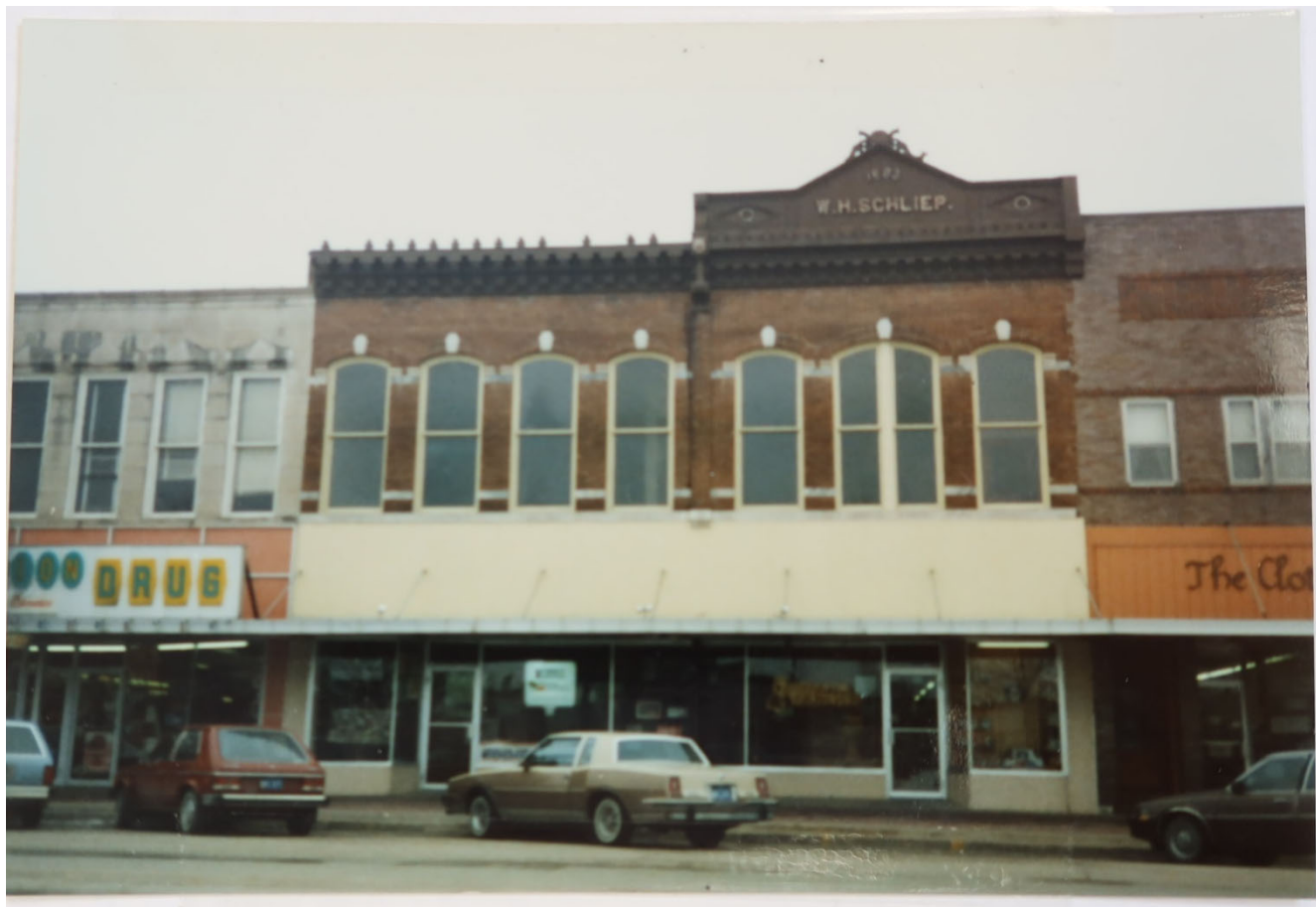
View of metal canopy extending from this building at far left to further south on block in early 1980s (City of Mt Pleasant building permits)