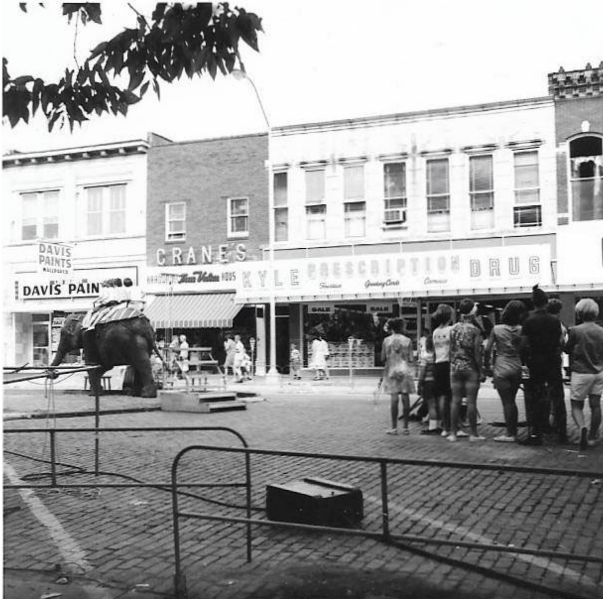
North portion of 100 block of S. Main St in 1965