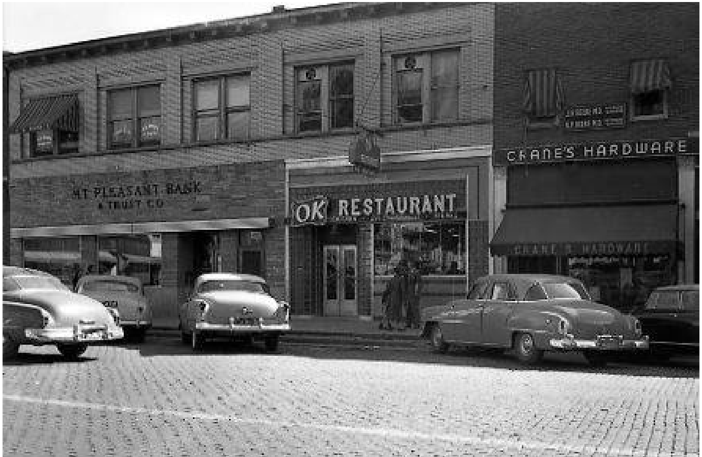
North portion of 100 block of S. Main St in 1952