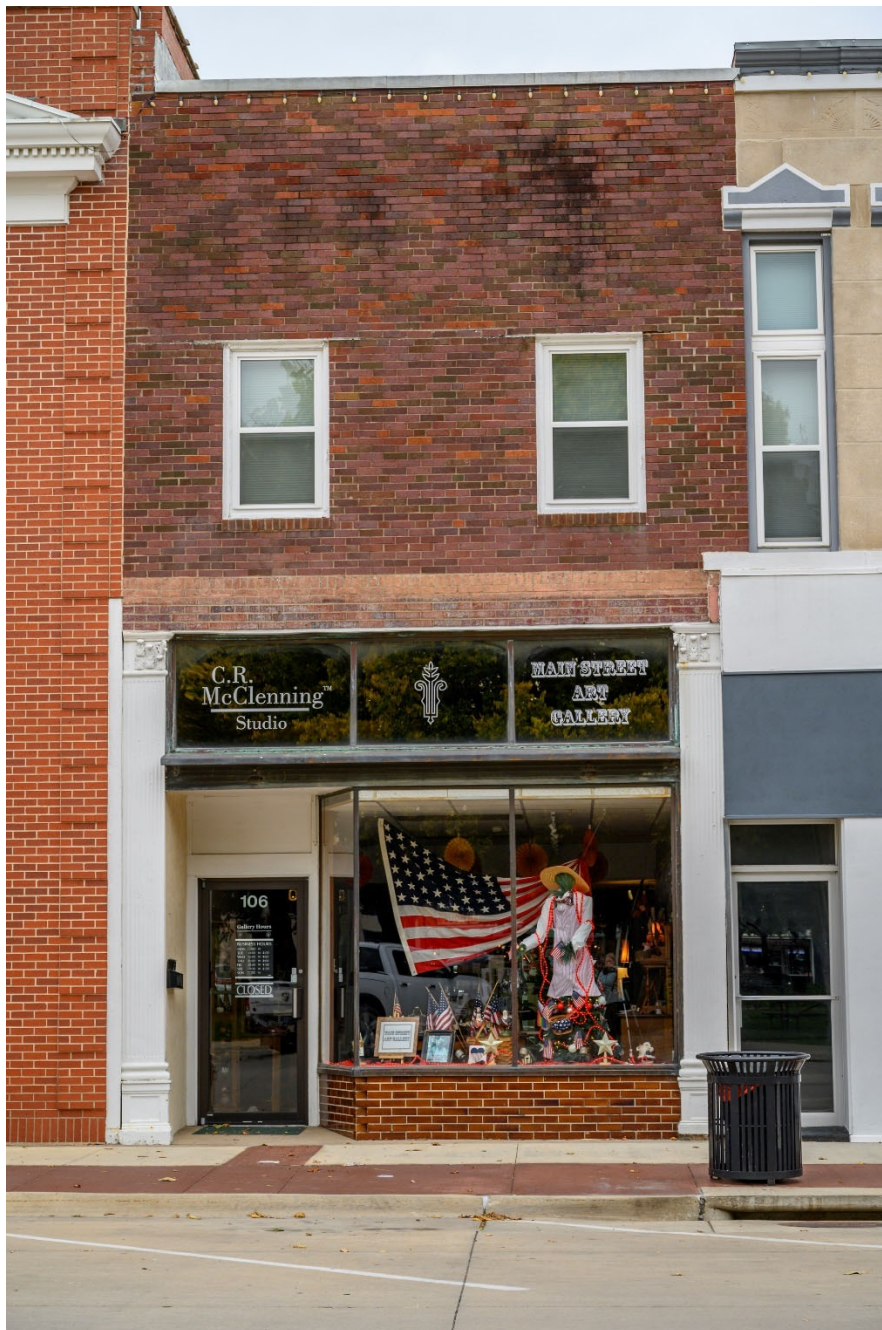
Photograph 44-00295-001. West elevation, looking east (October 2023)