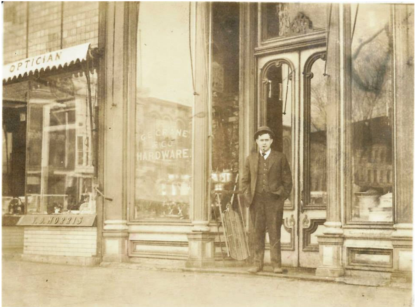
George Crane & Co Hardware (HCHT Facebook album)