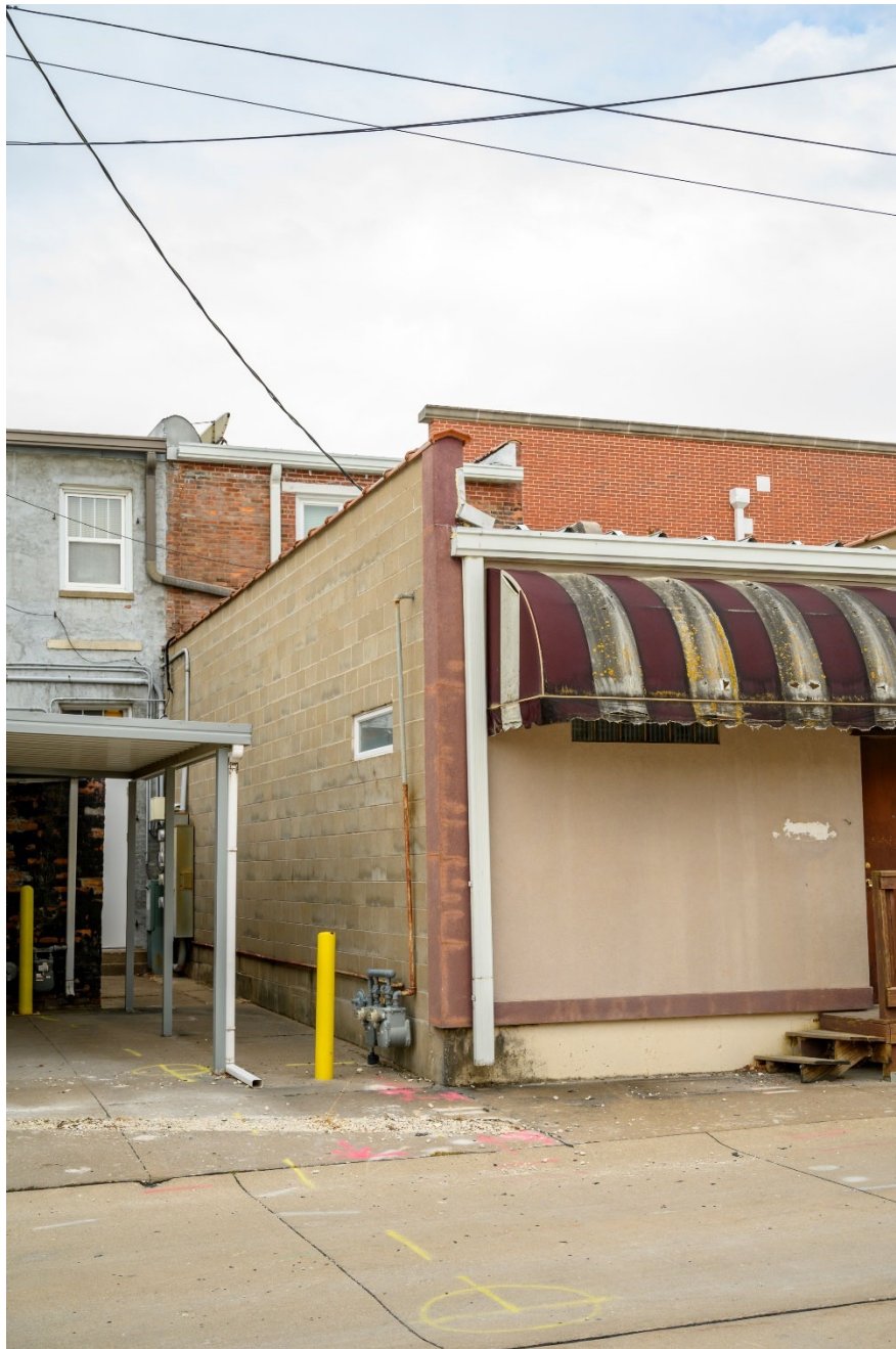
Photograph 44-00295-003. South and east elevations, looking northwest (October 2023)