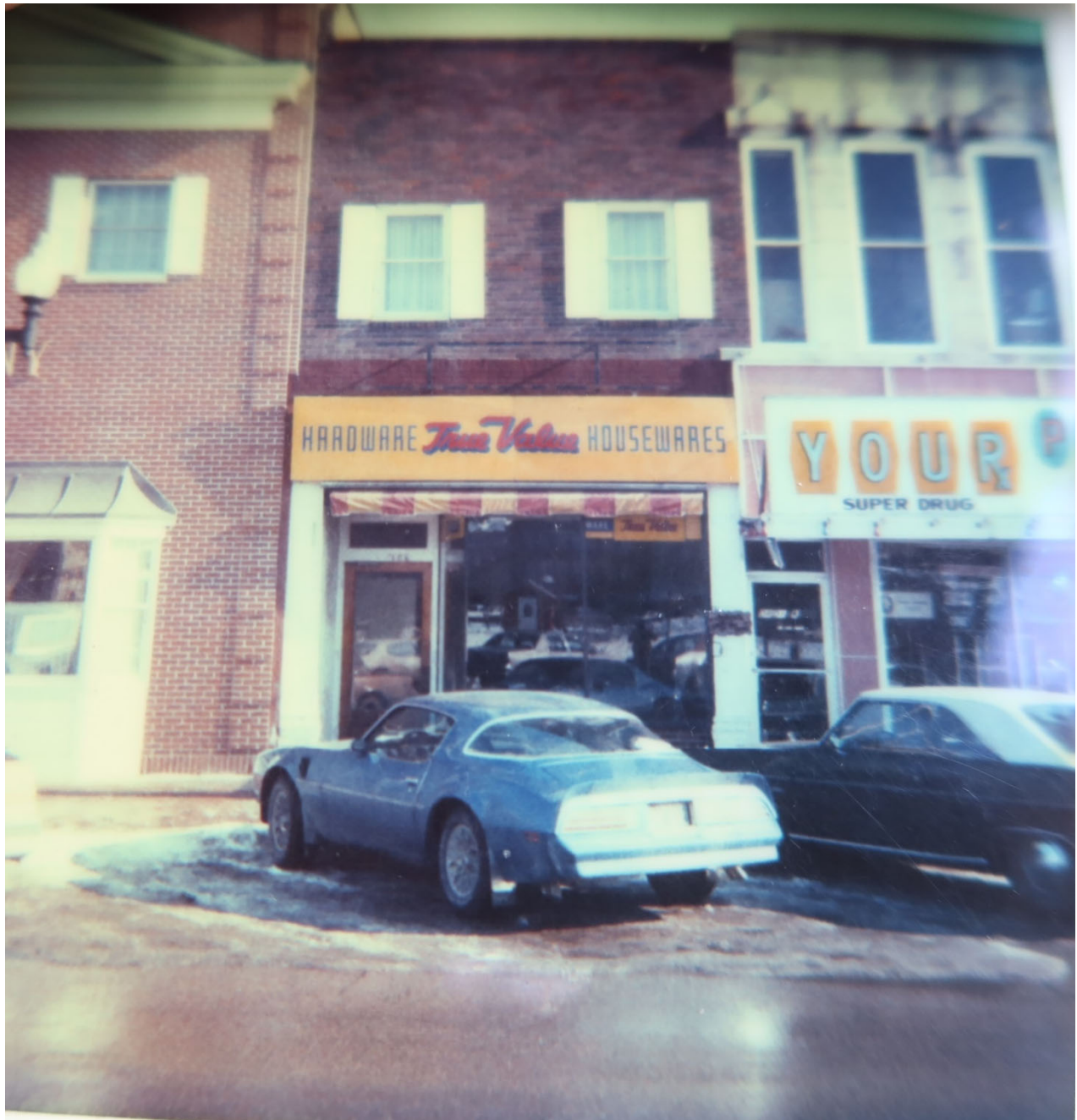
October 1984 photograph of building for new sign permit for Glover (City of Mt Pleasant building permits)