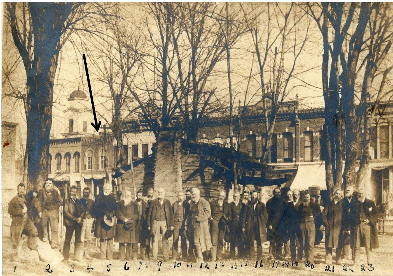
Central Park with 100 block of S. Main St in background in 1885 (HCHT Facebook album)