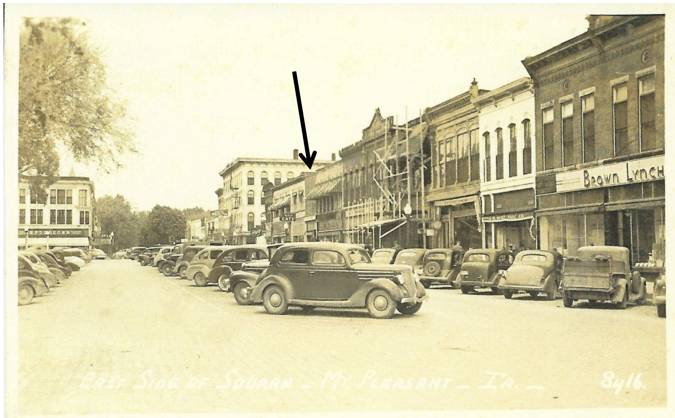
100 block of S. Main St in 1946