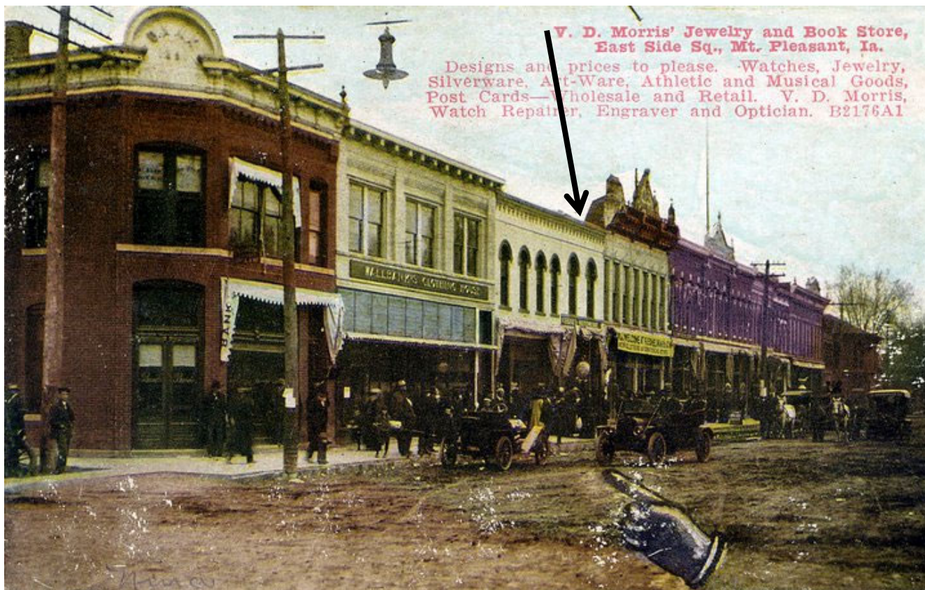
100 block of S. Main St around 1915 (HCHT Facebook album)