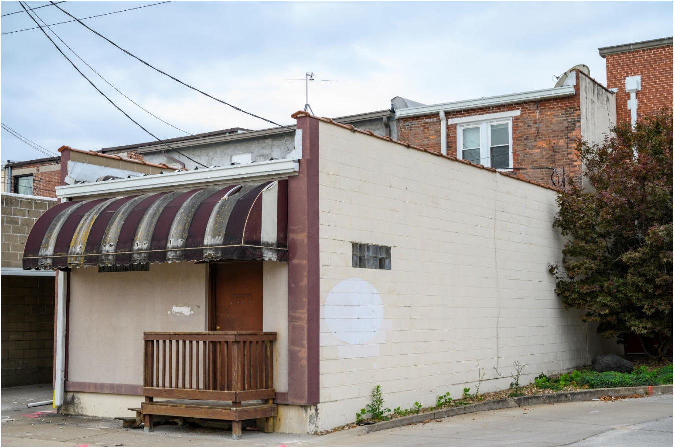
Photograph 44-00295-002. East and north elevations, looking southwest (October 2023)