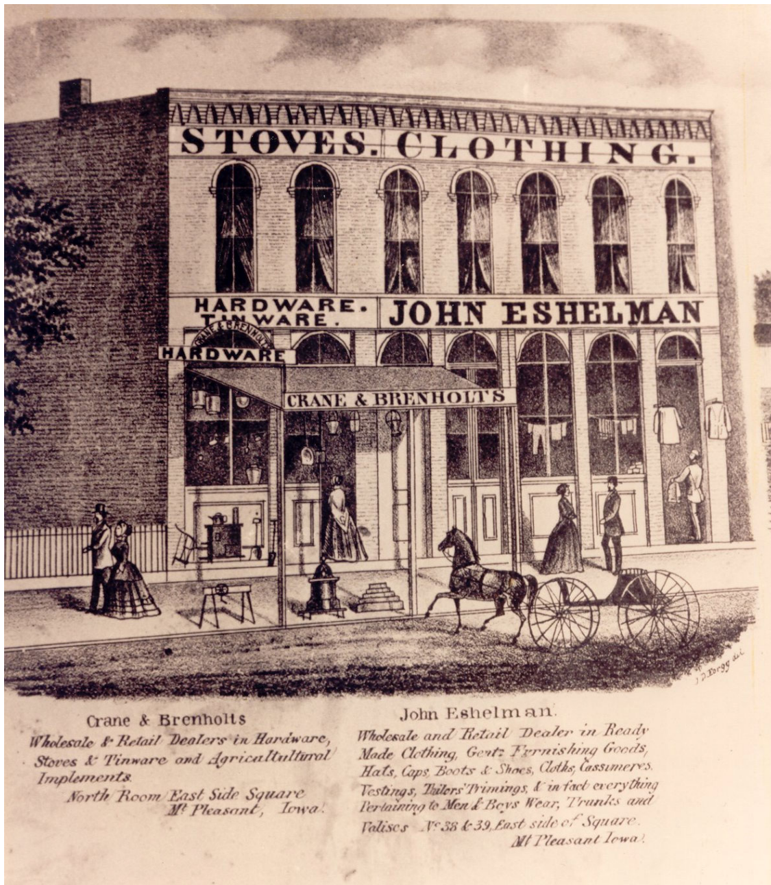
Crane & Brenholts in this building when it was the "north room" on the east side of the square in 1870 (no stores to the north, only Congregational Church) (Atlas of Henry County 1870)