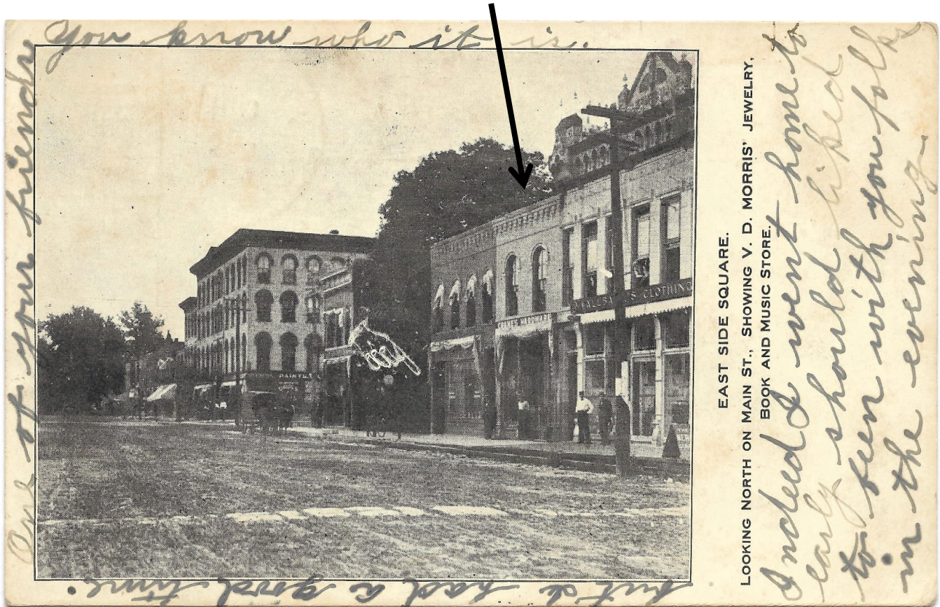
North portion of 100 block of S. Main St around 1907