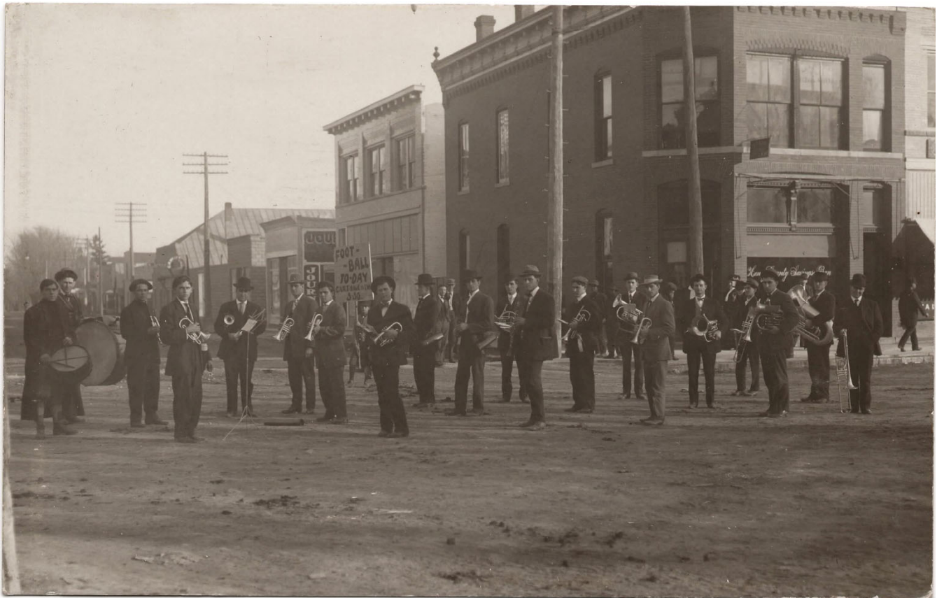
Building in 1909 (HCHT Facebook album)