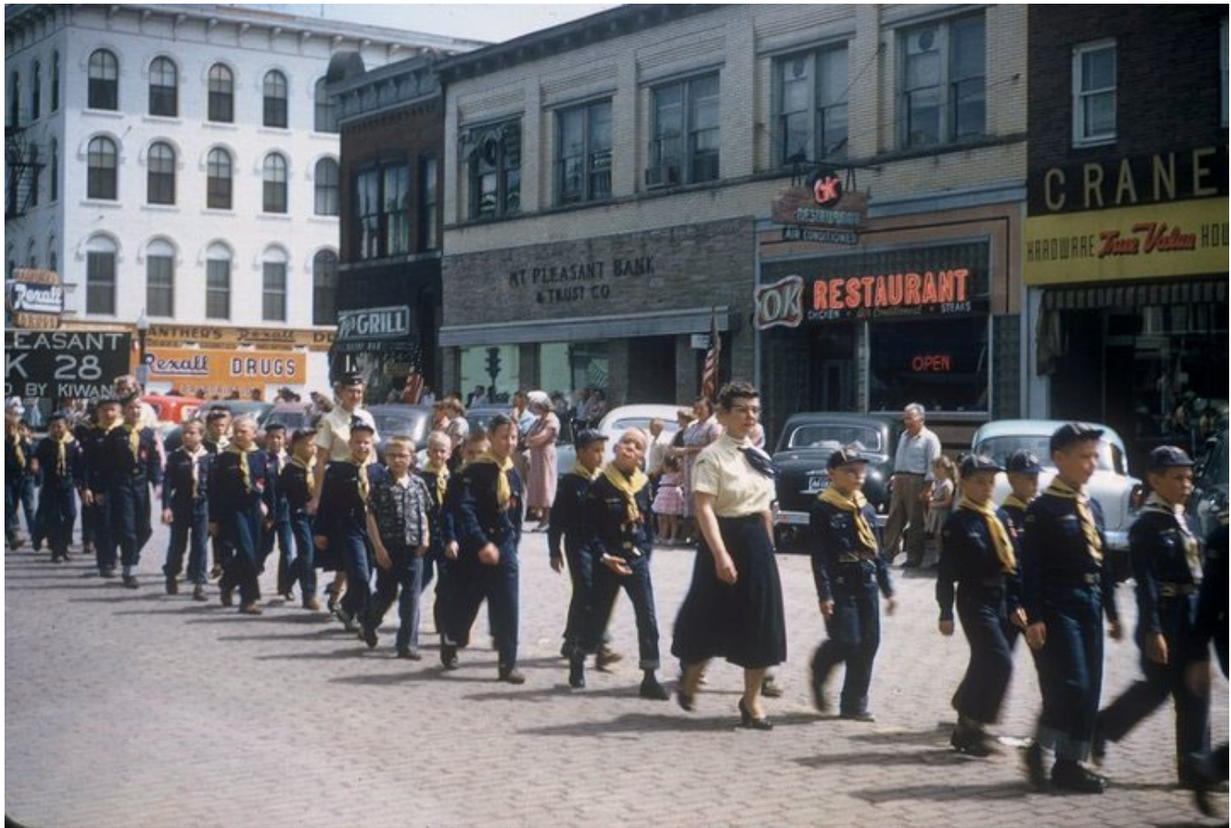
North end of 100 block of S. Main St in 1950s (HCHT Facebook album)