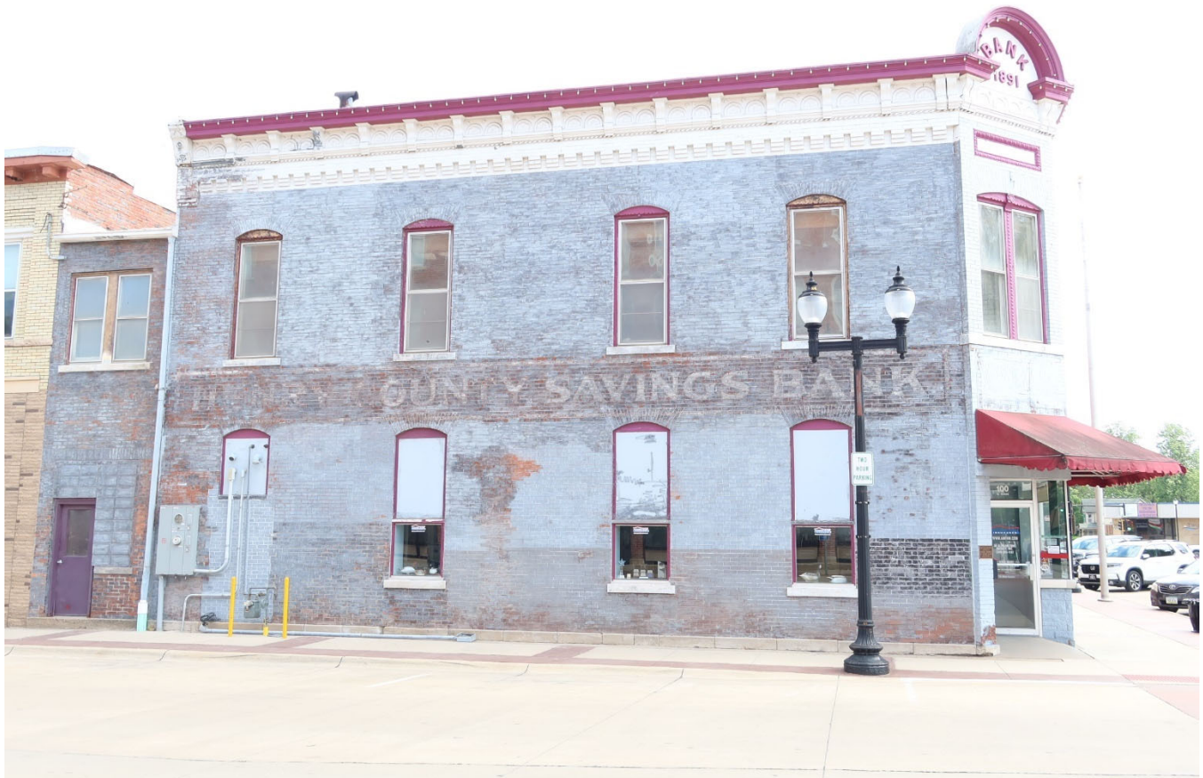
Photograph 44-00293-003. North elevation in June 2024 with paint removal underway and old sign visible, looking south (June 2024)