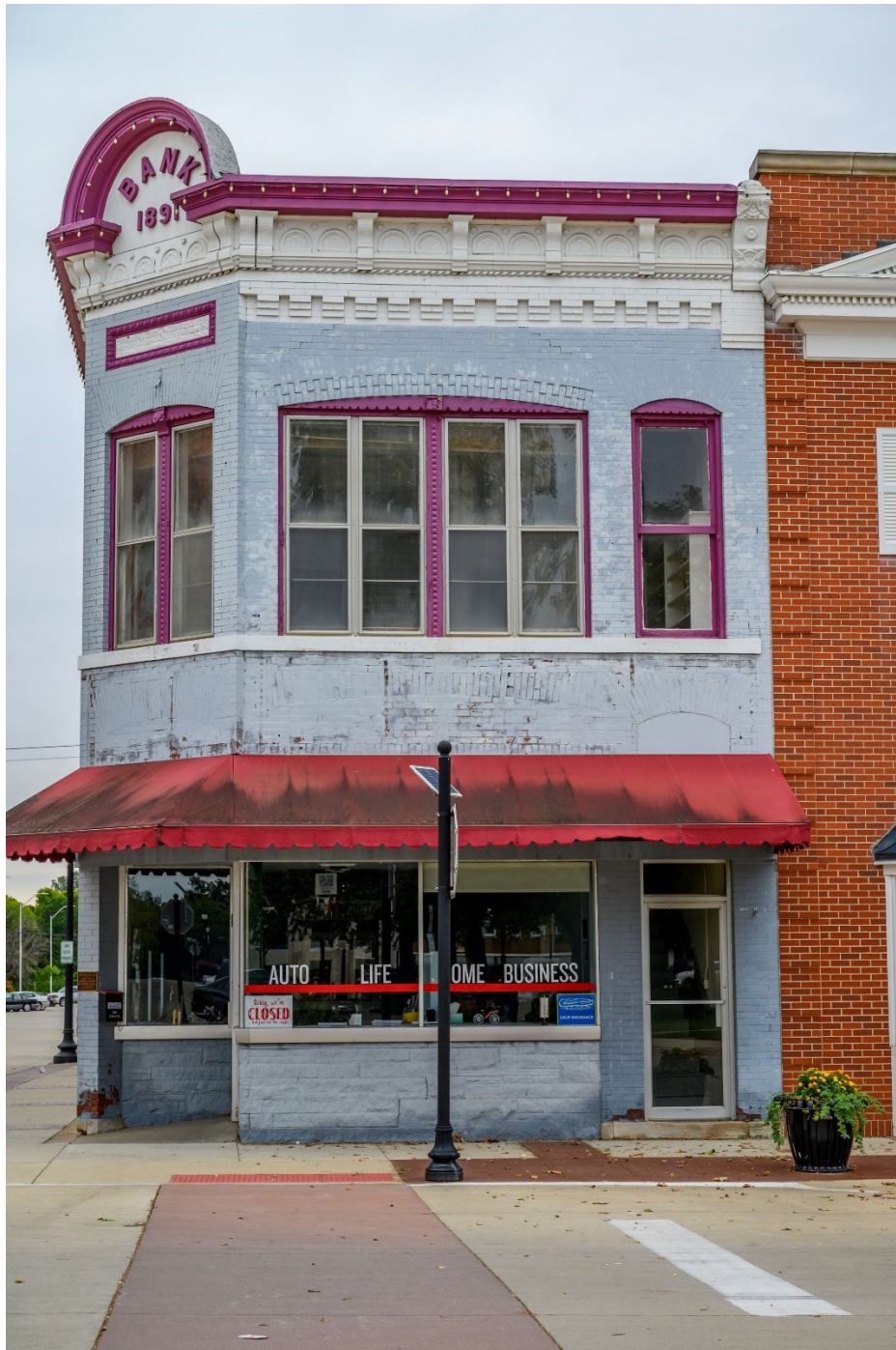
Photograph 44-00293-002. West elevation, looking east (October 2023)