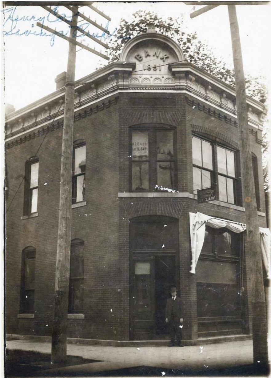
Early photograph of the building