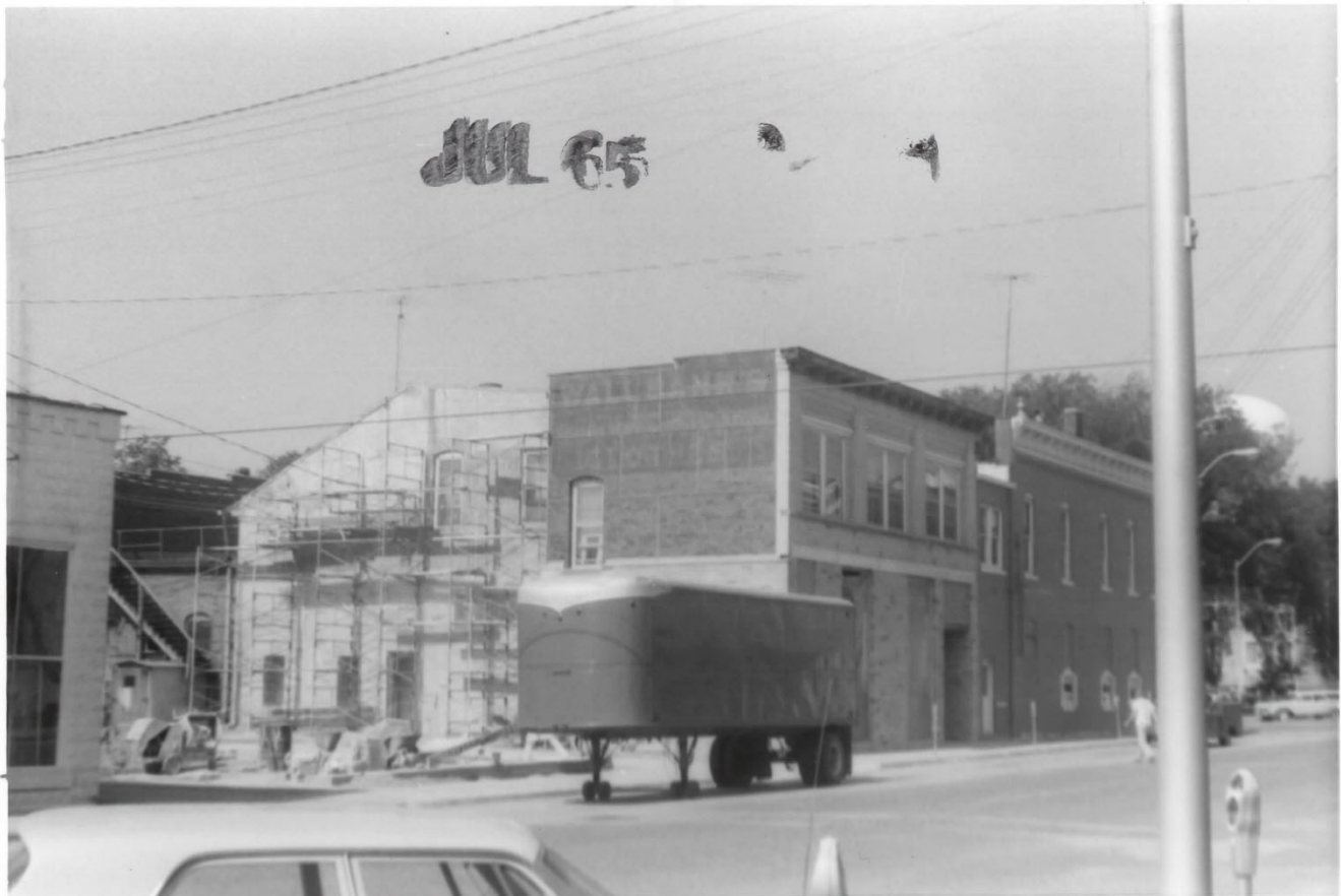
Side of bank at right along E. Monroe St, looking southwest