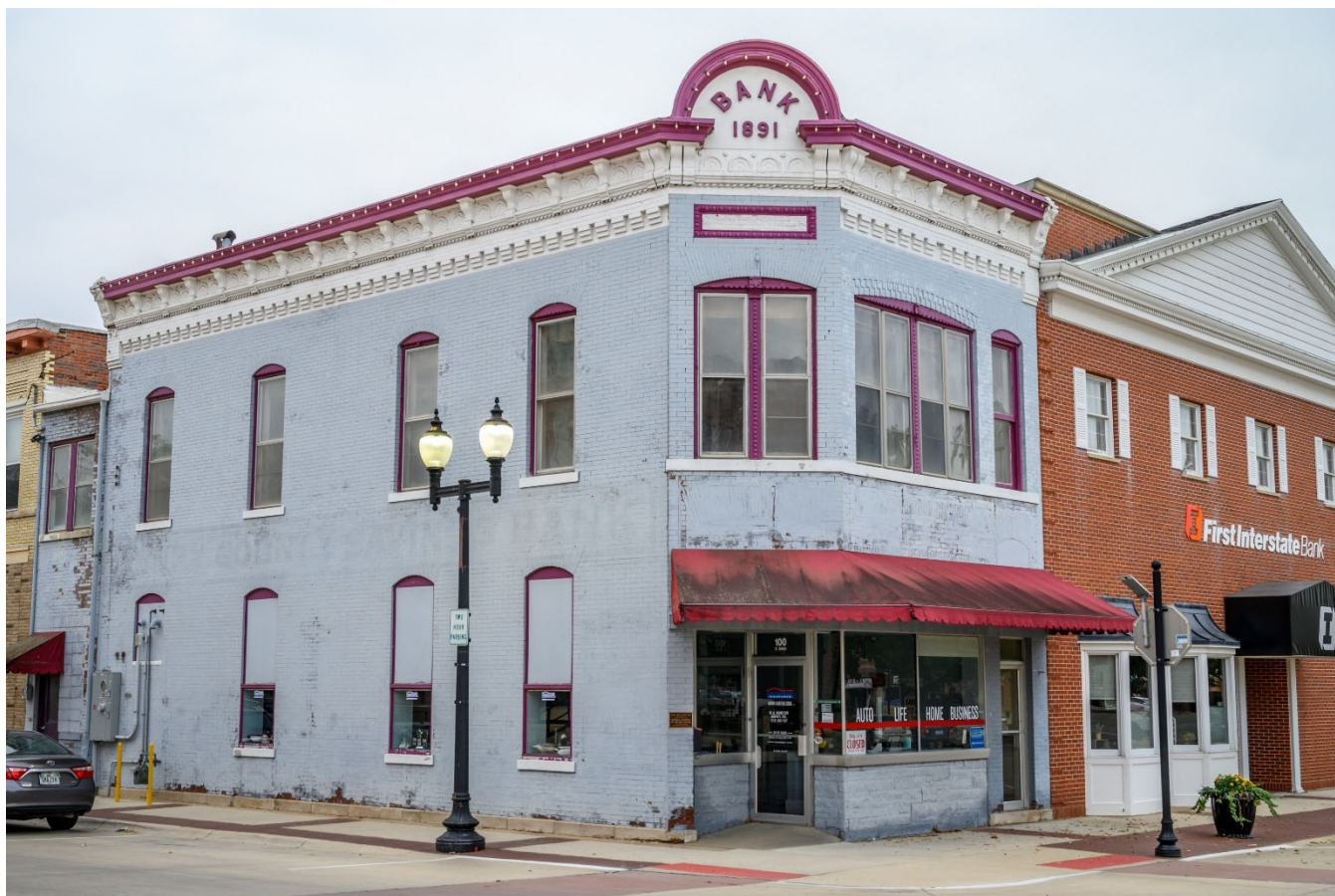
Photograph 44-00293-001. North and west elevations, looking southeast (October 2023)