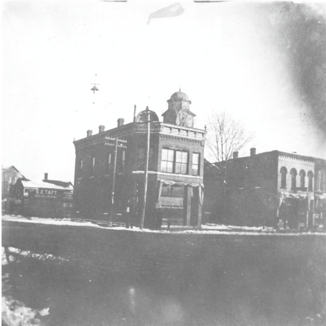
Building prior to move of church (HCHT Facebook album)