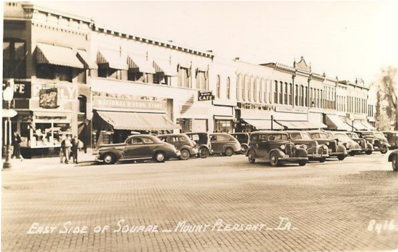
100 block of S. Main St in 1940s