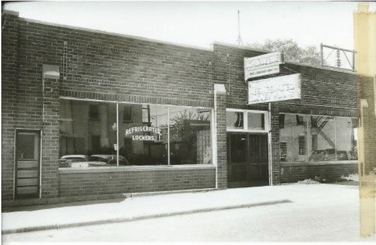
Building as a meat locker (HCHT Facebook album)