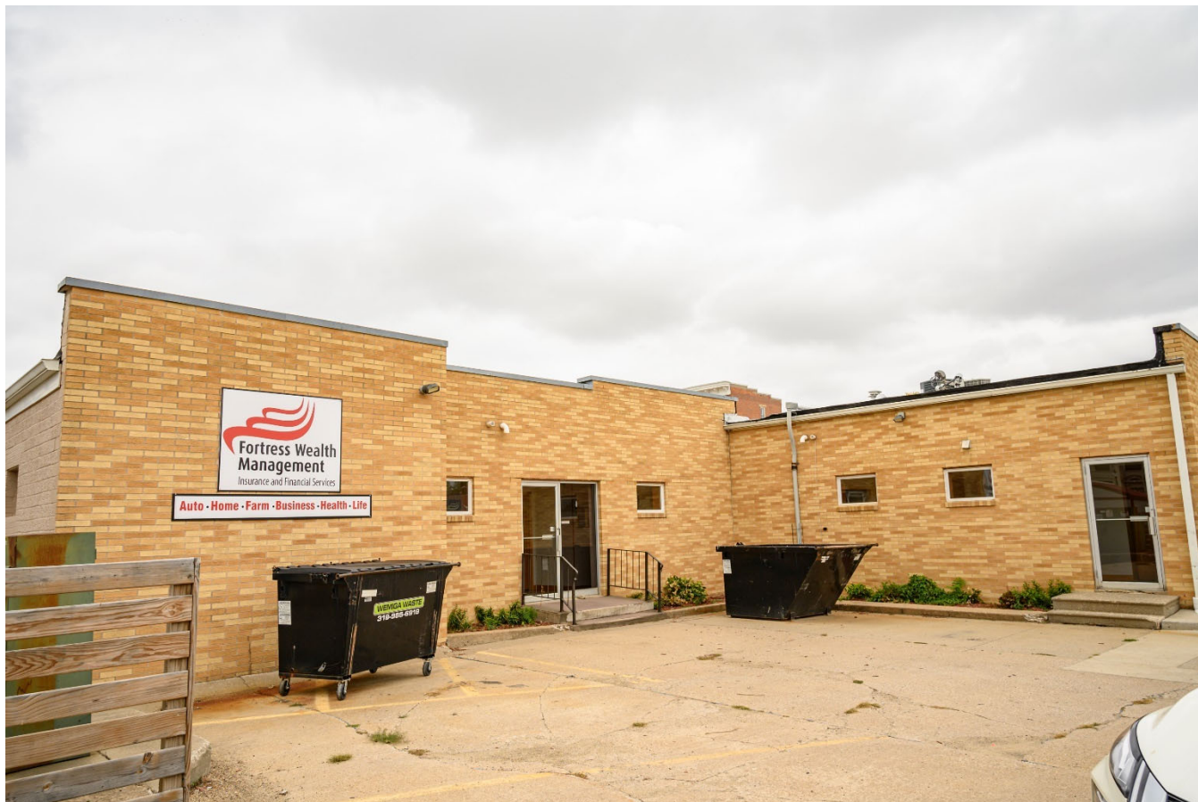
Photograph 44-00330-005. South elevation, looking northwest (October 2023)