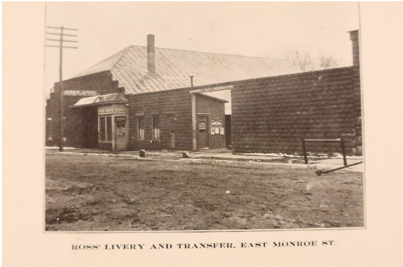
Earlier building at corner to east (current parking) with this building sitting in location of wall (Mt Pleasant Beautiful 1909)