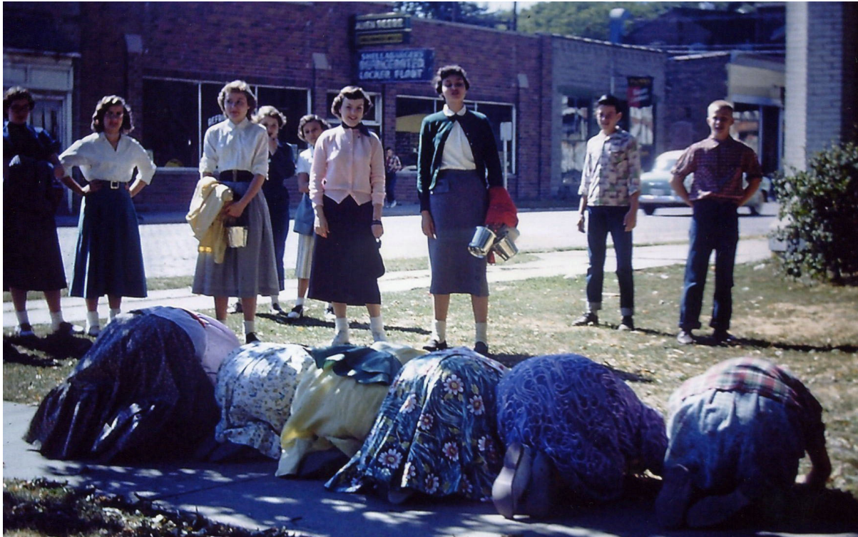
Building in background around 1953