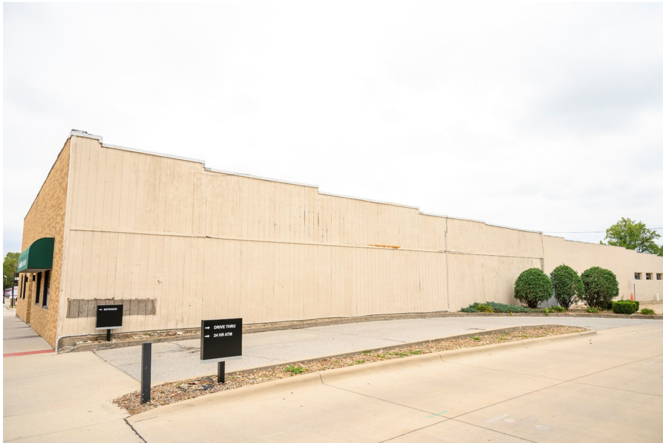
Photograph 44-00330-003. West elevation, looking east (October 2023)