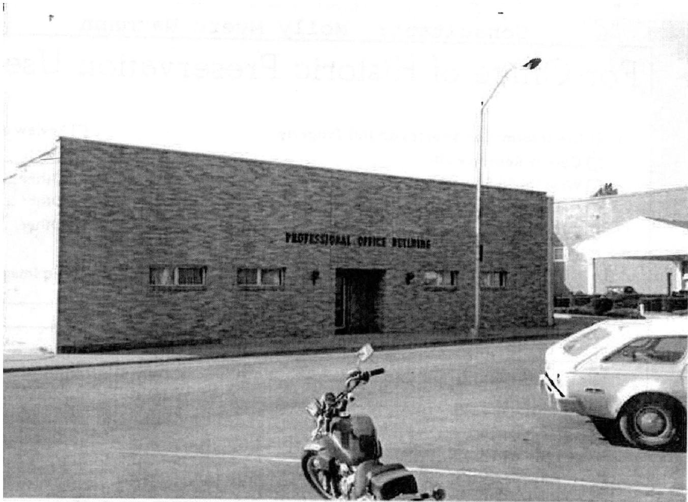
1990 survey photograph (Naumann 1991)