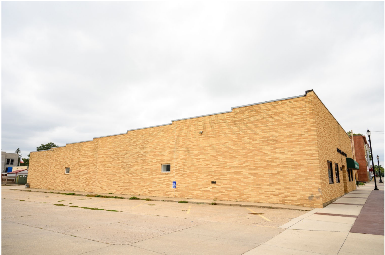
Photograph 44-00330-002. East elevation, looking west (October 2023)

Professional Office Building Henry Name of Property County 114 E. Monroe St Mount Pleasant Address City