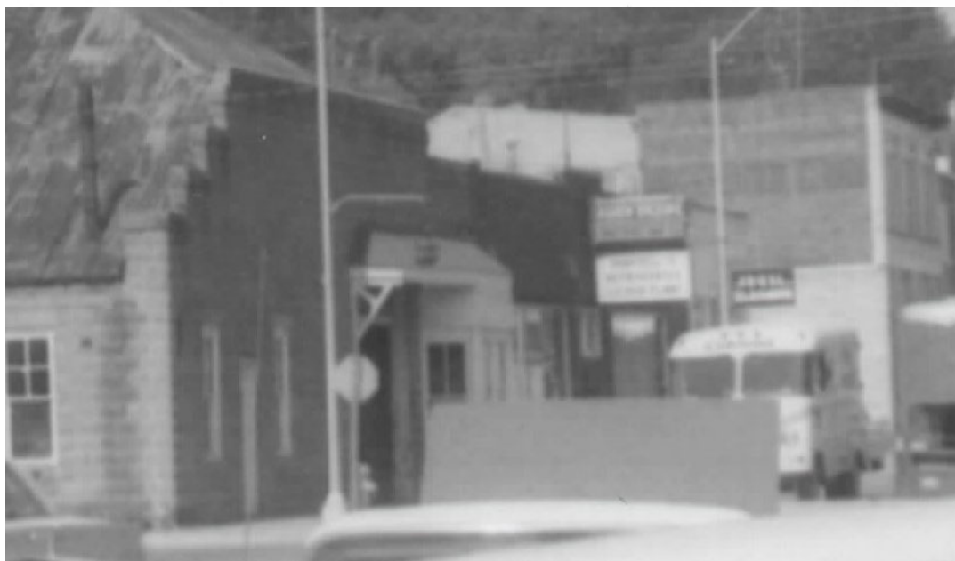
Building with blade sign and large front windows in July 1965, looking southwest