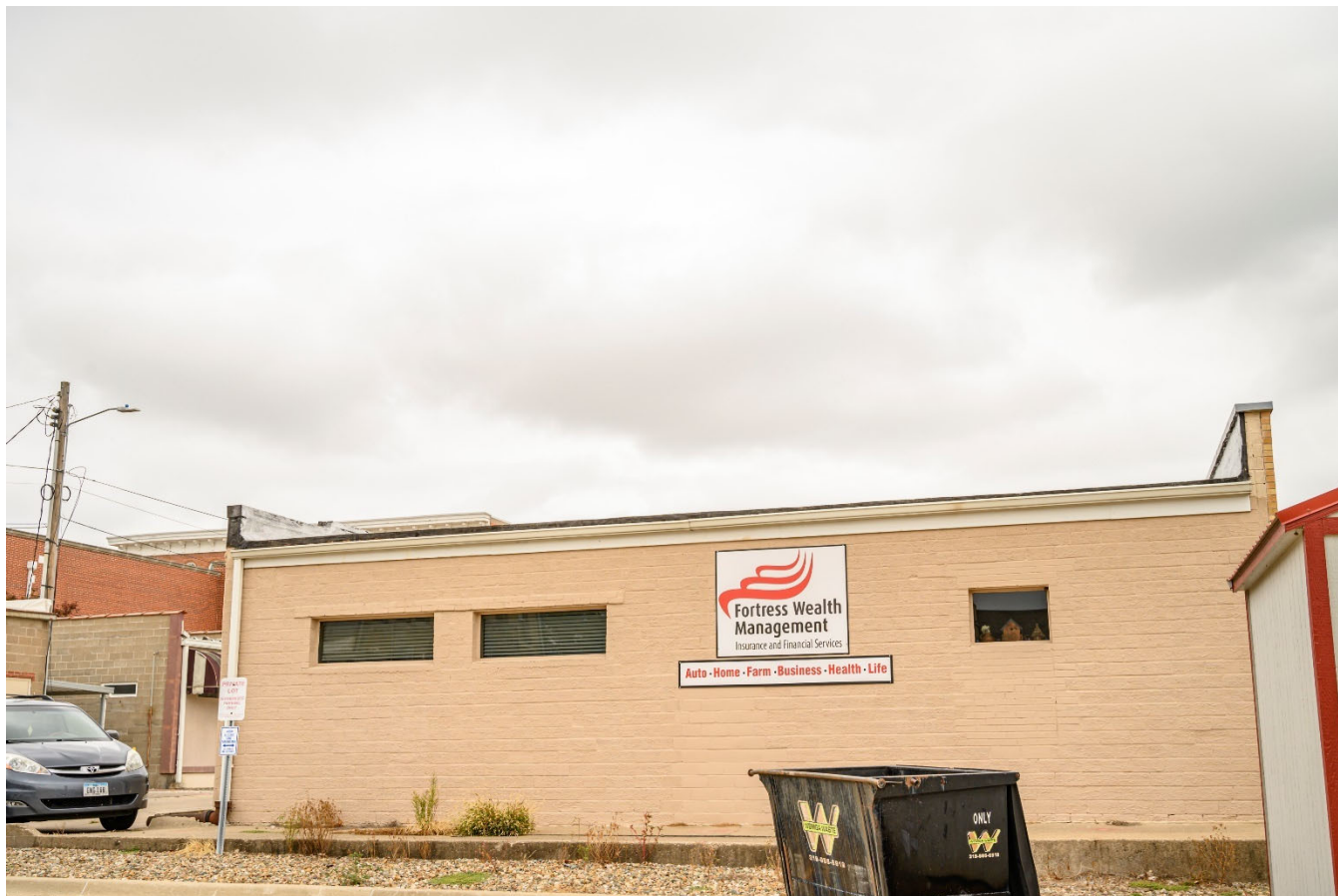
Photograph 44-00330-004. South elevation, looking north (October 2023)

Professional Office Building Henry Name of Property County 114 E. Monroe St Mount Pleasant Address City