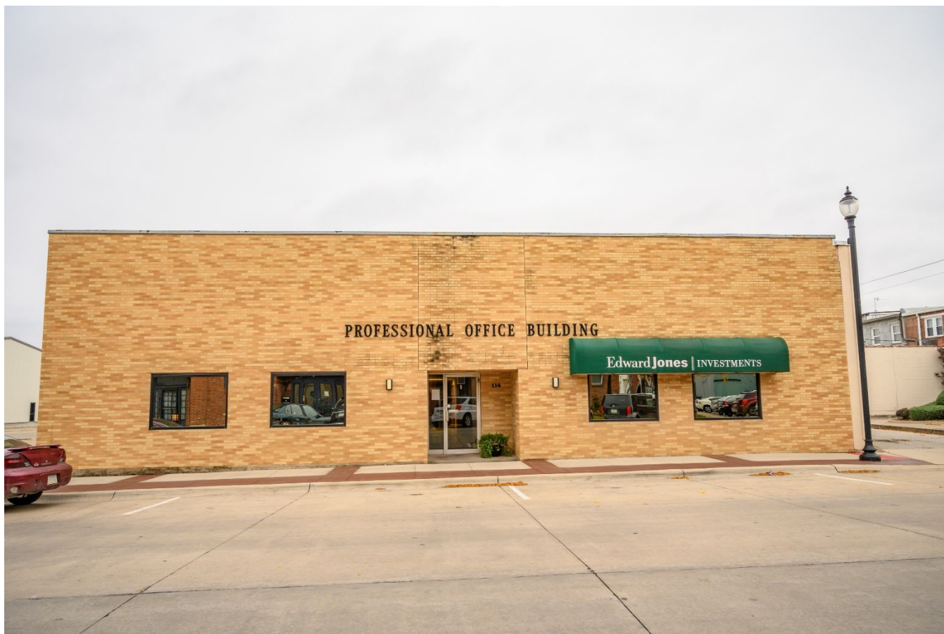
Photograph 44-00330-001. North elevation, looking south (October 2023)