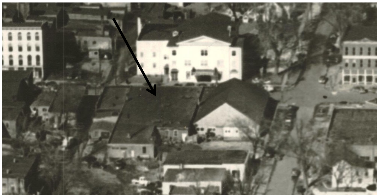
Building on east portion of 1947 aerial photograph of Mt Pleasant, looking north