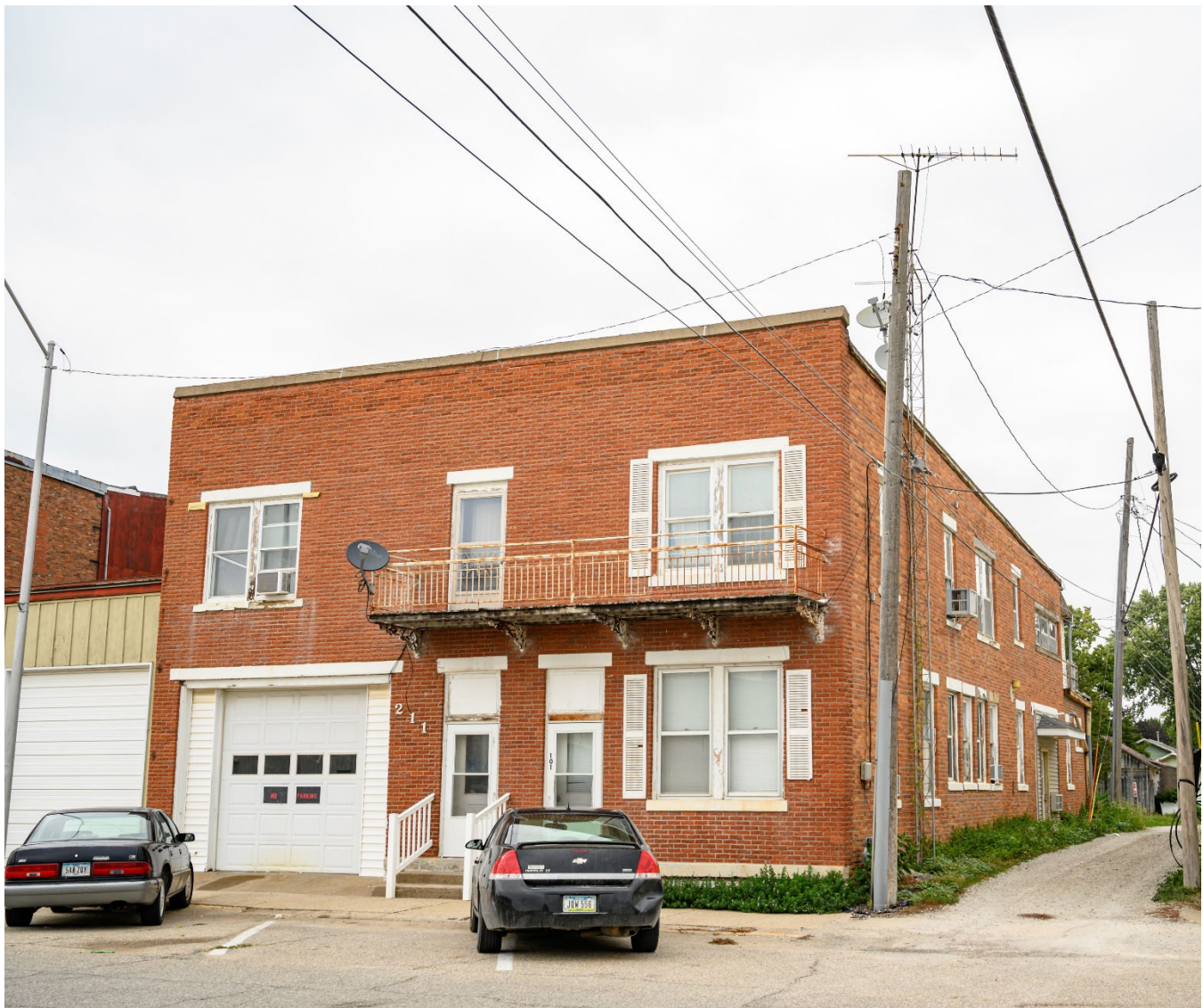
Photograph 44-02260-001. South elevation, looking northwest (October 2023)