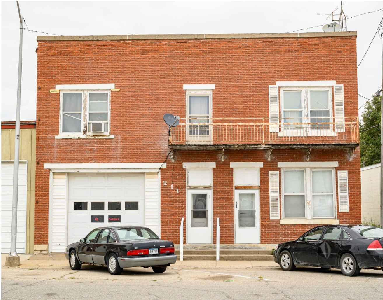
Photograph 44-02260-002. South elevation, looking north (October 2023)