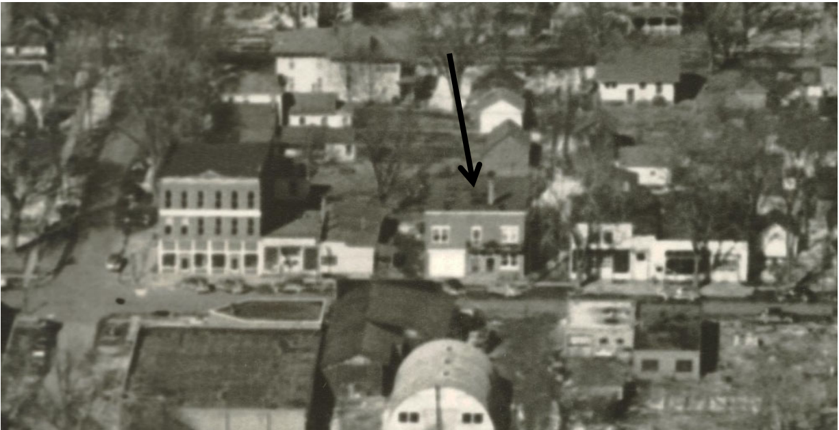
Building on east portion of 1947 aerial photograph of Mt Pleasant, looking north