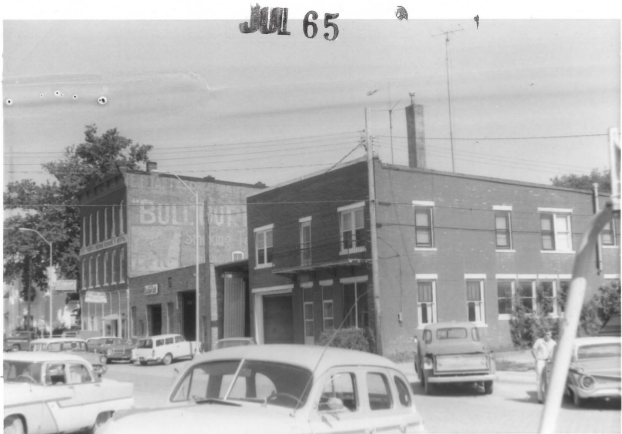
Building at left in July 1965, with Bull Durham sign visible