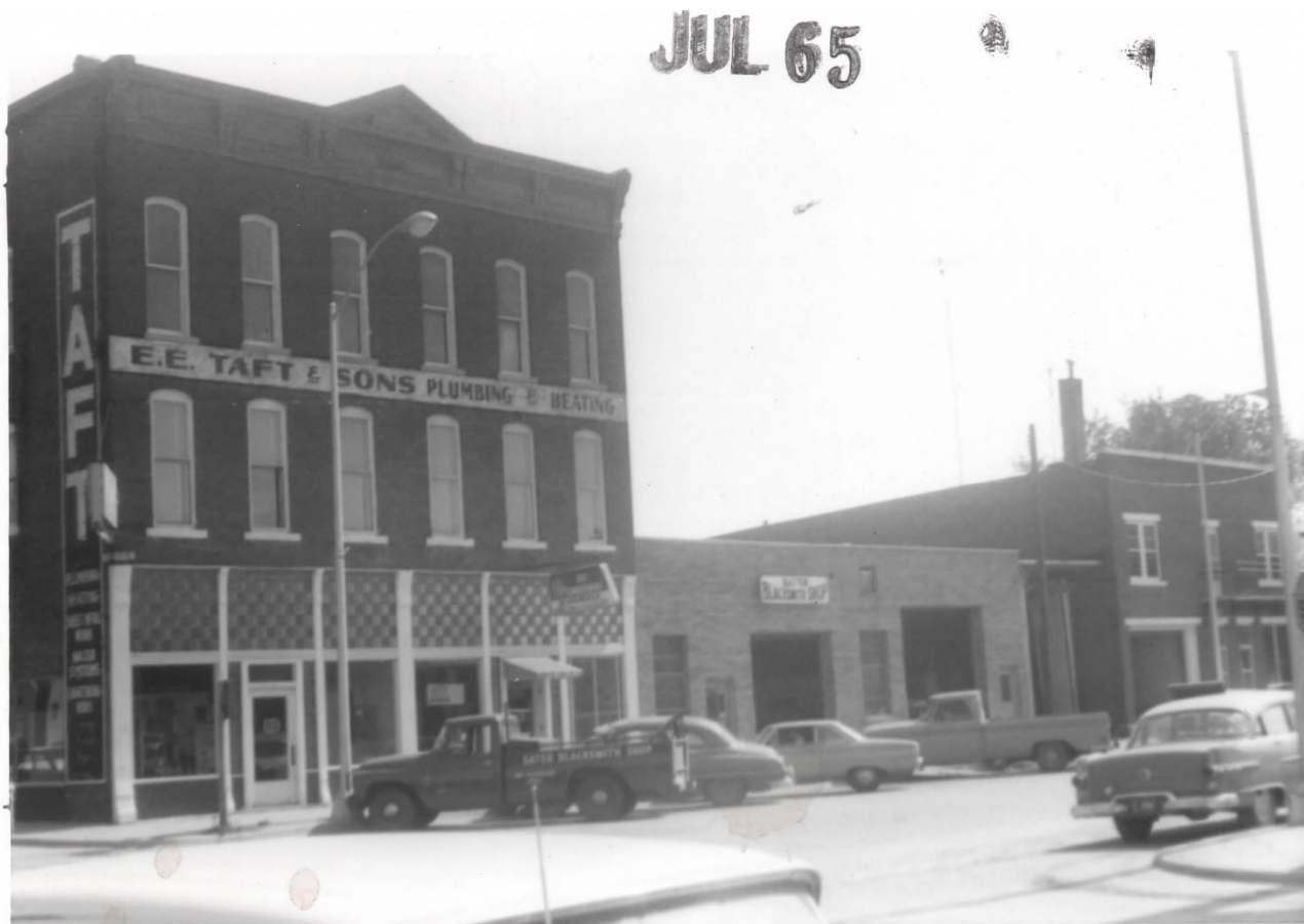
Building at left in July 1965