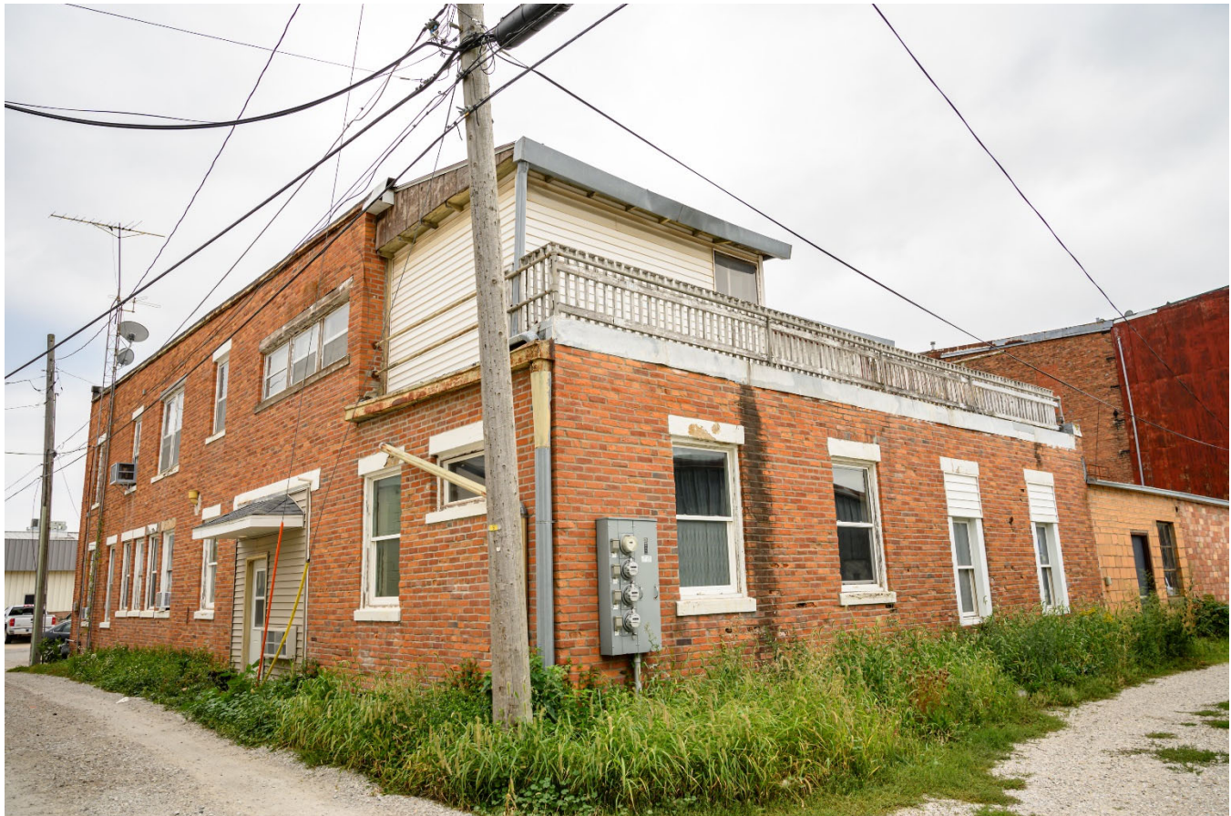
Photograph 44-02260-003. East and north elevations, looking southeast (October 2023)