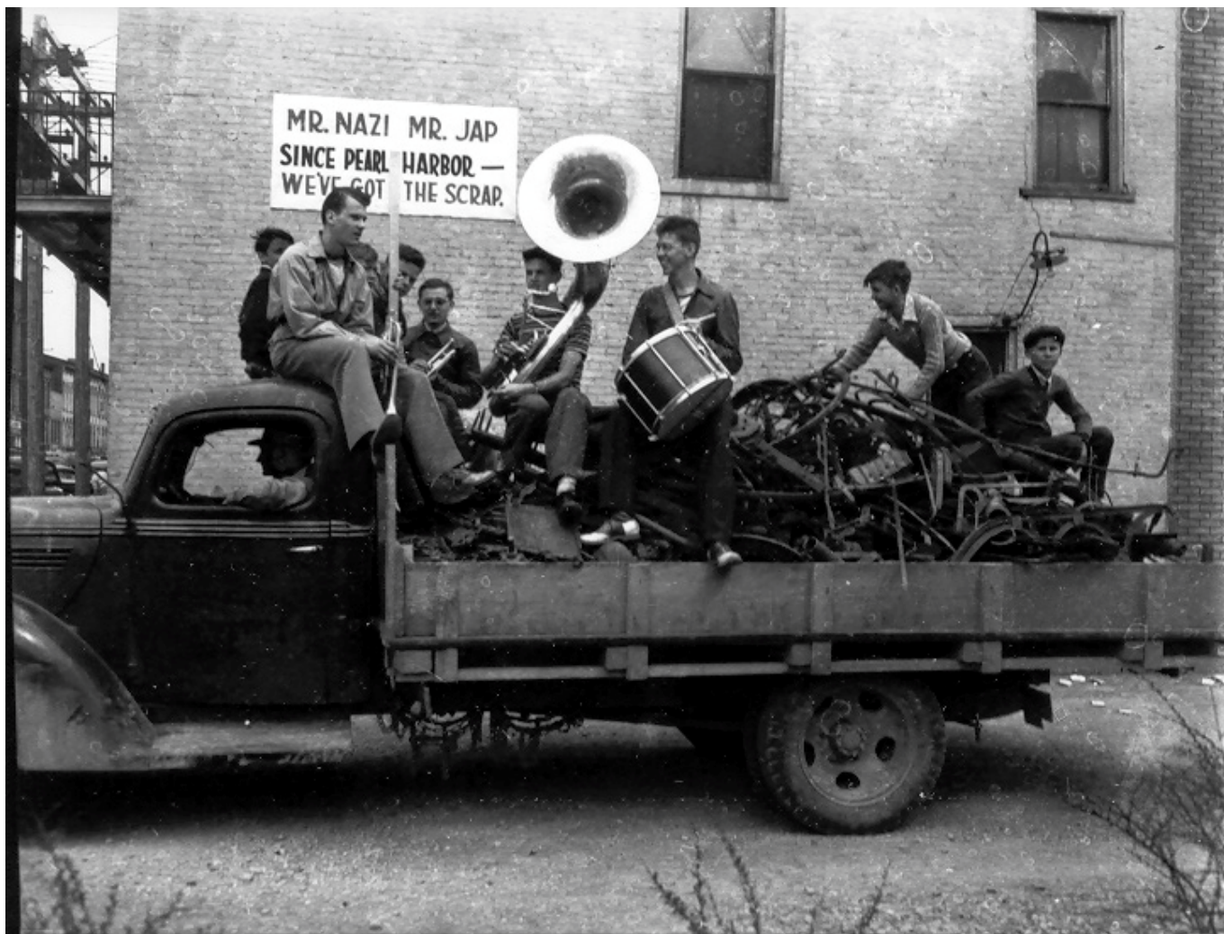
Side of building in early 1940s (Hayes collection, HCHT files)