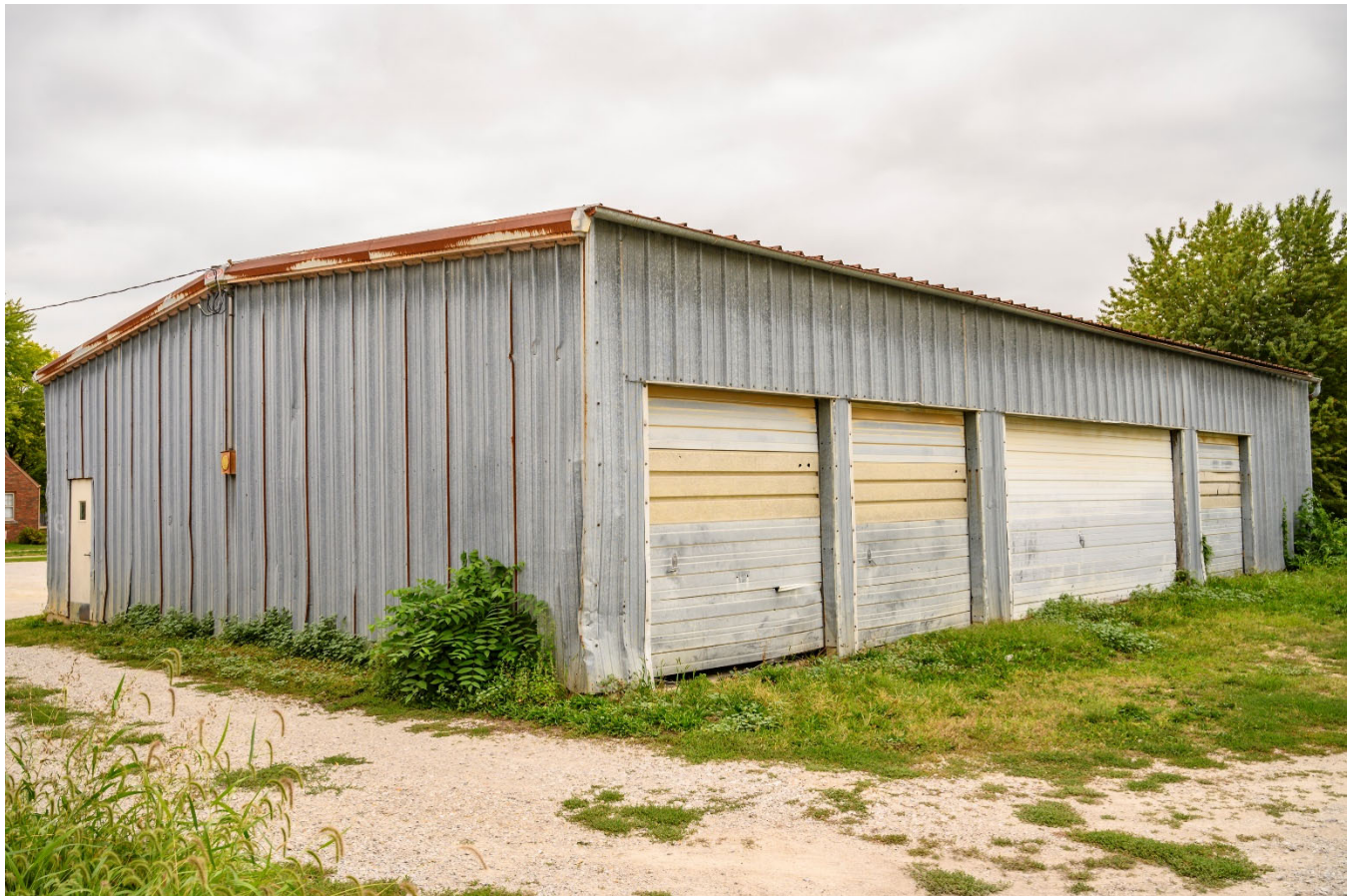
Photograph 44-02231-001. South and east elevations, looking northwest (October 2023)