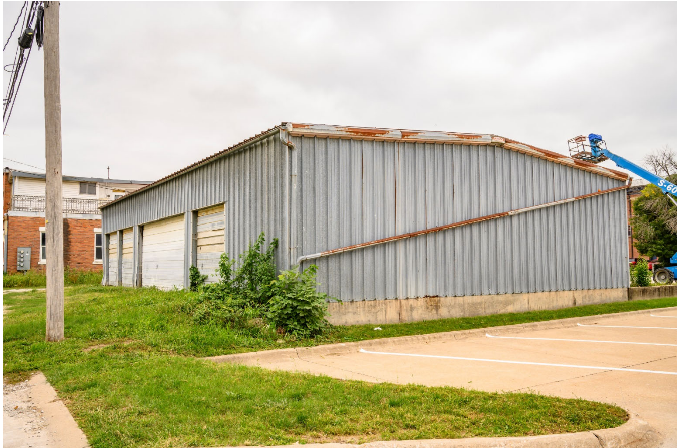
Photograph 44-02231-003. North elevation, looking southwest (October 2023)