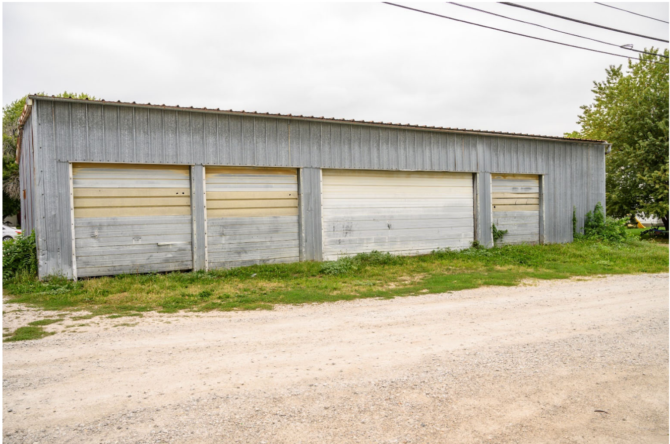
Photograph 44-02231-002. East elevation, looking west (October 2023)