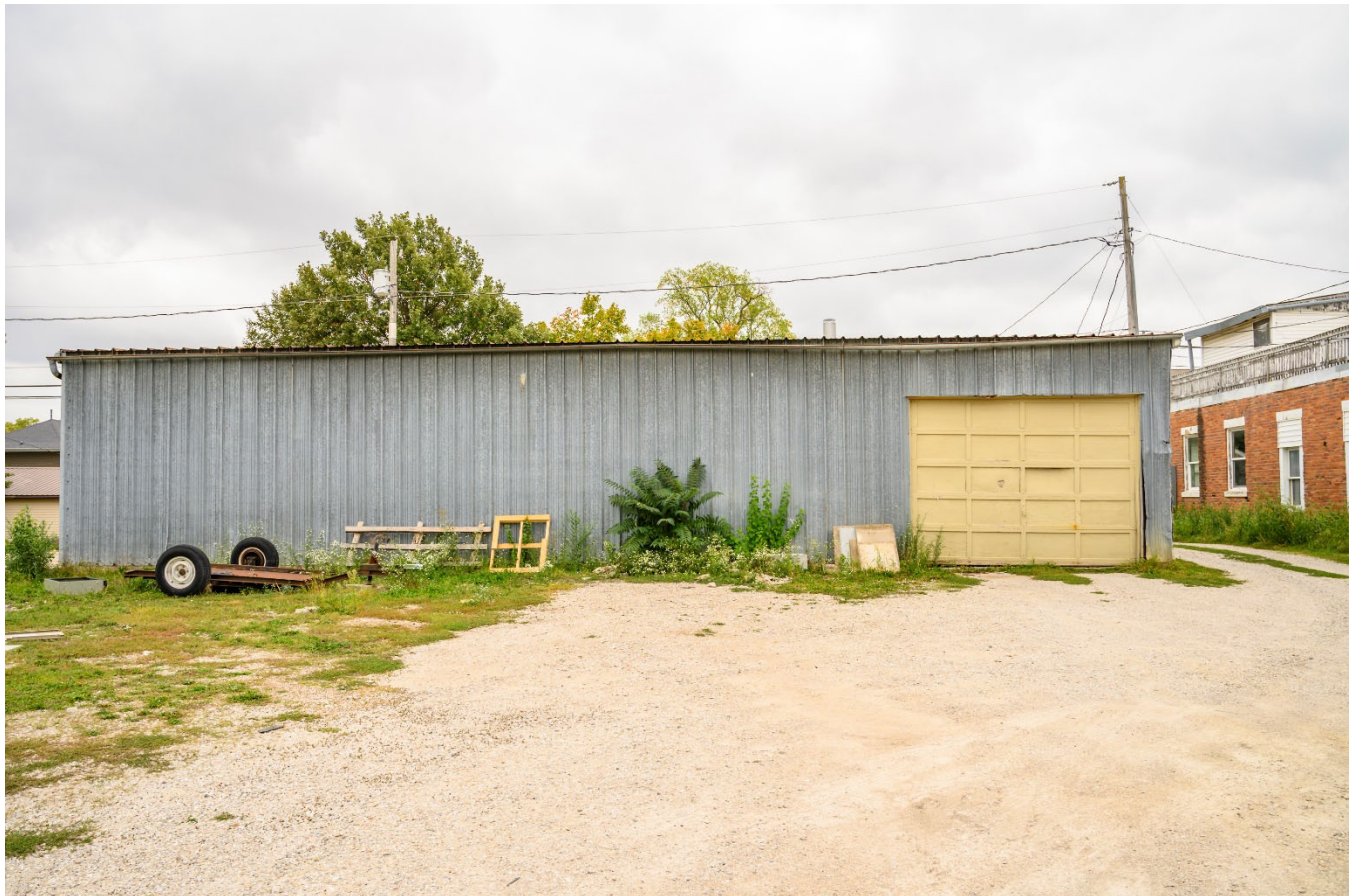
Photograph 44-02231-005. West elevation, looking east (October 2023)