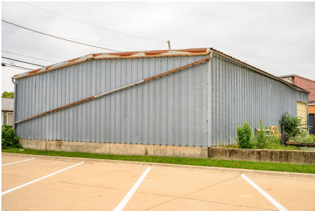
Photograph 44-02231-004. North elevation, looking southeast (October 2023)