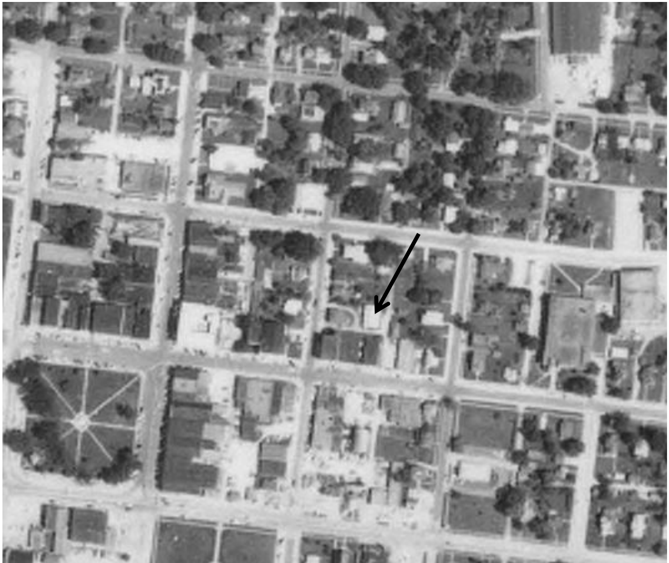
Metal building visible behind house along Adams and behind buildings along E. Monroe