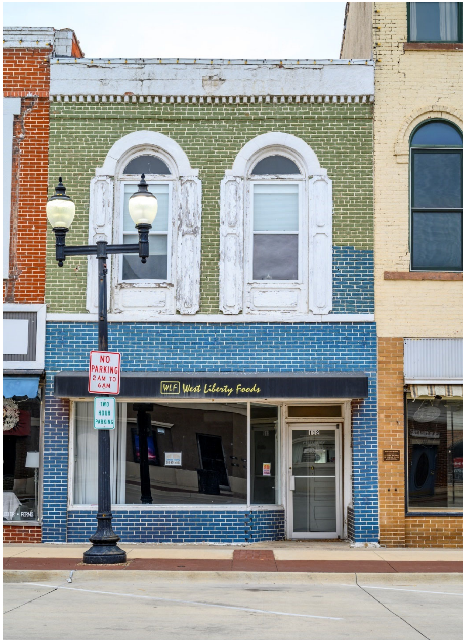
Photograph 44-00244-001. West elevation, looking east (October 2023)