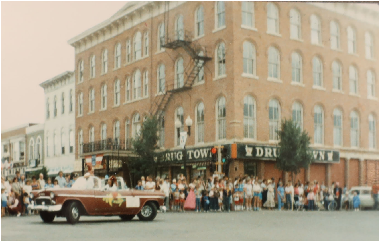
East side of south portion of 100 block of N. Main in 1985