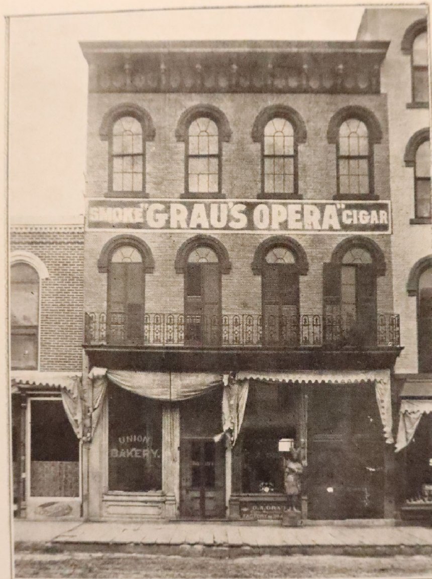
G. A. GRAUS CIGAR FACTORY, NORTH MAIN ST

Building at left edge in 1909 ( Mt Pleasant Beautiful 1909: 17 )