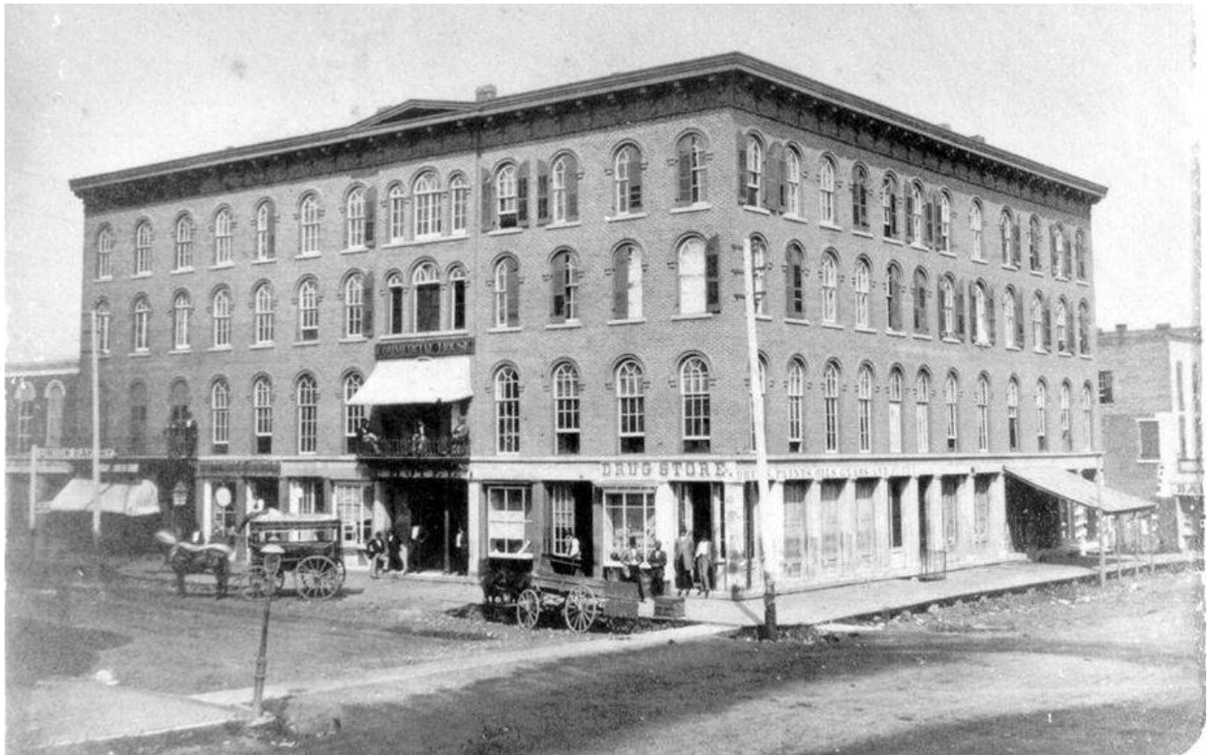
Two story building to left of Brazelton House in 1870s (HCHT Facebook album)