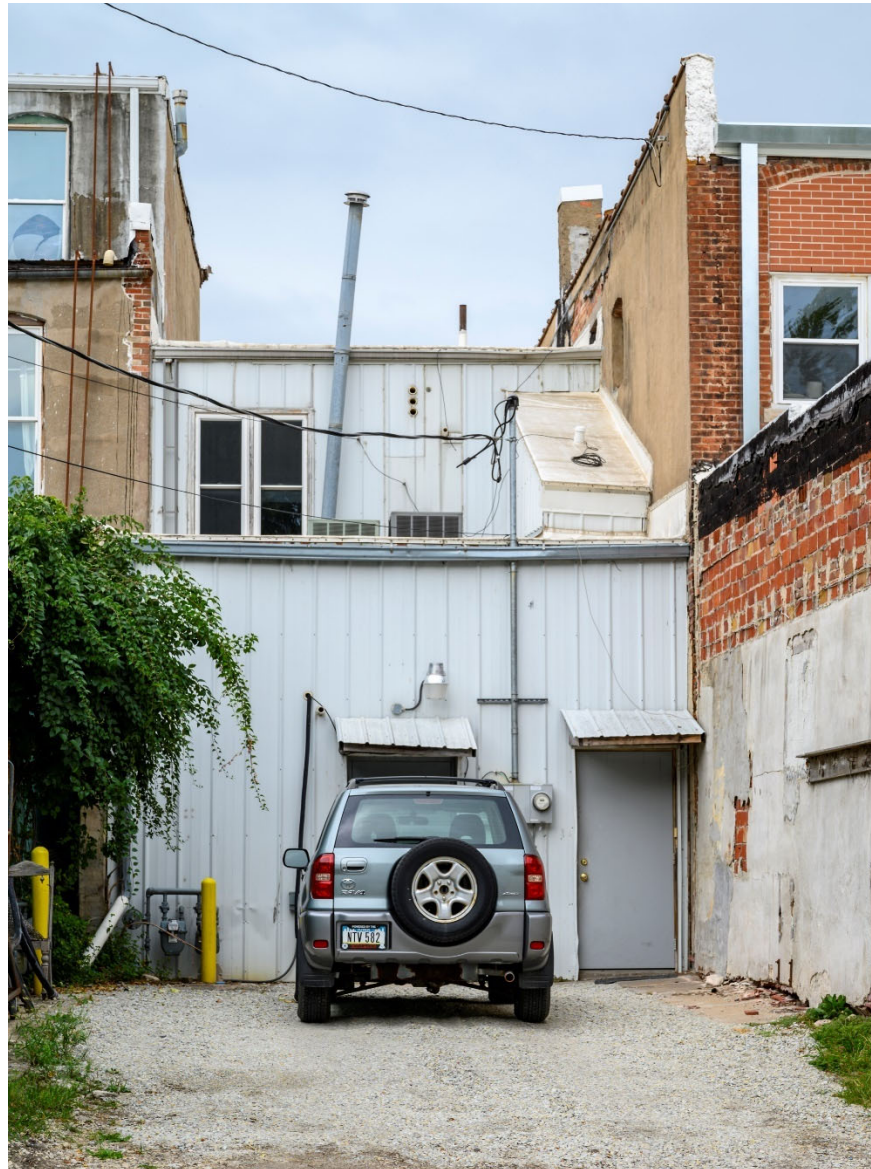
Photograph 44-00244-002. East elevation, looking west (October 2023)