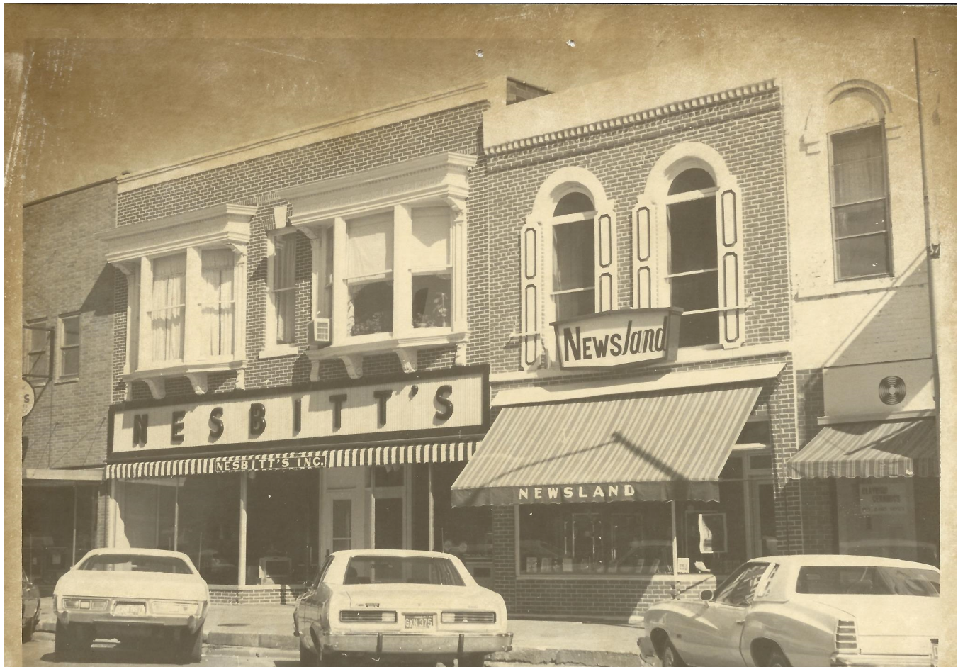
Nesbitt's and Newsland on N. Main St after completion of Operation Pride projects in 1979