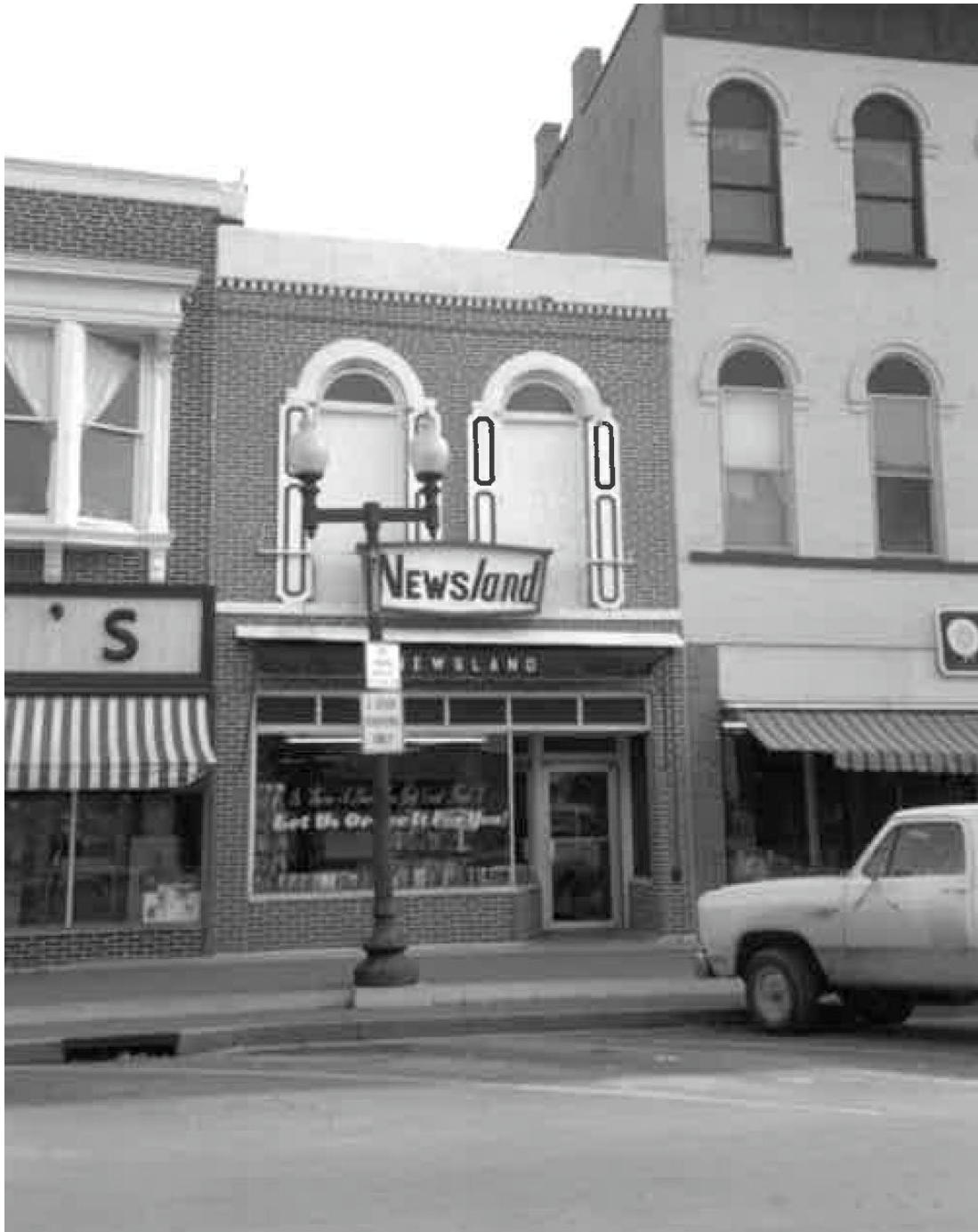
1990 survey photograph (Naumann 1991)