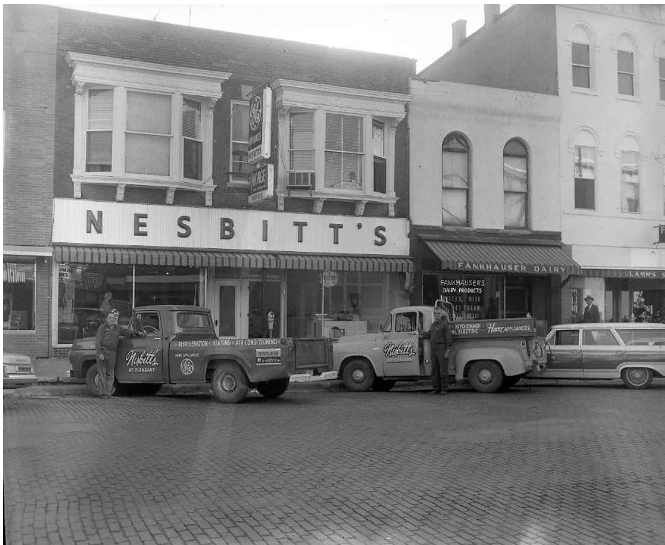
Building at right on November 11, 1963 (Nesbitt's opening) (HCHT Facebook album)