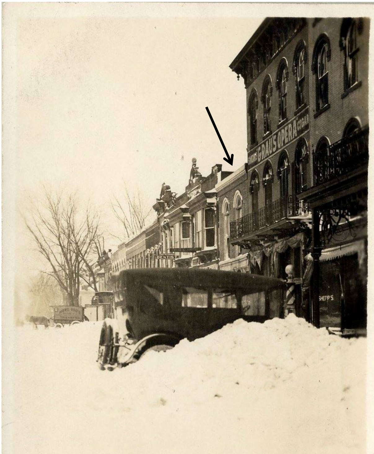
100 block of N. Main in 1915 (HCHT Facebook album)