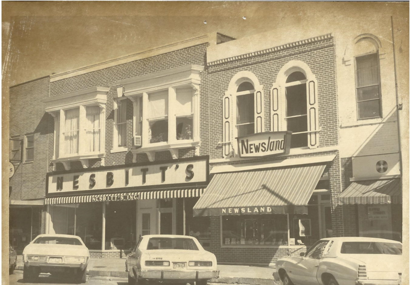
Nesbitt's and Newsland on N. Main St after completion of Operation Pride projects in 1979