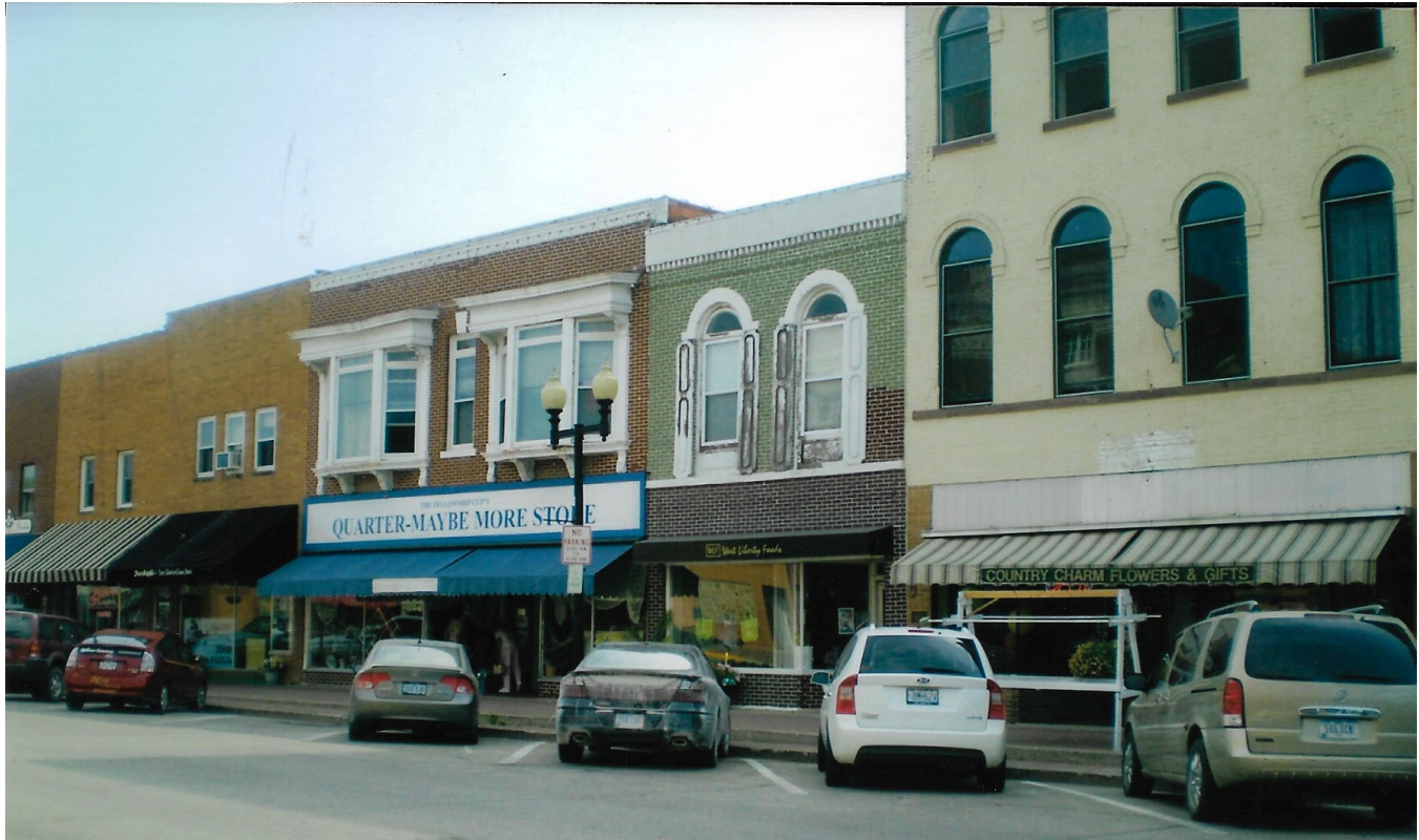
East side of 100 block of N. Main St in 2011