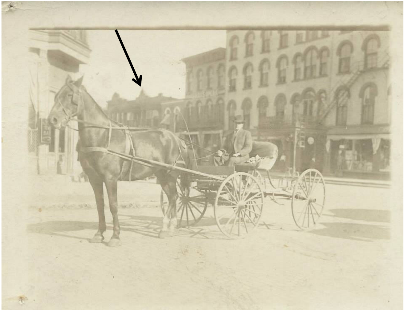
South portion of east side of 100 block of N. Main in early 1900s (HCHT Facebook album)