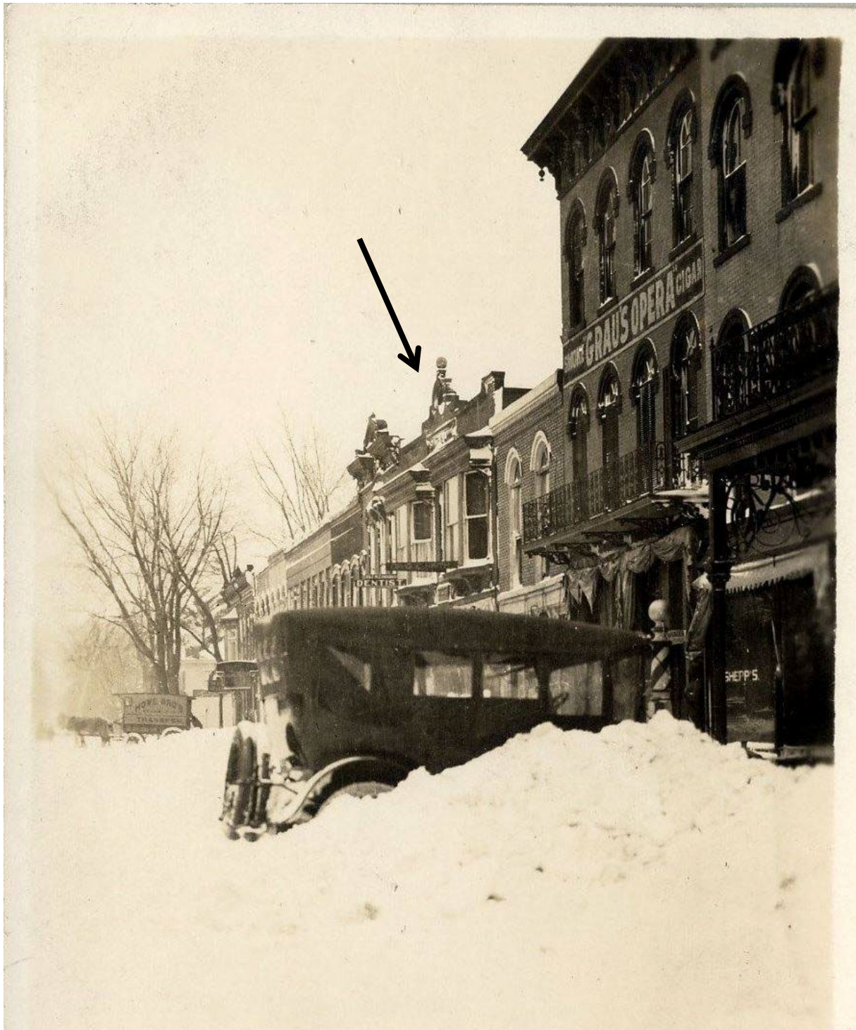
100 block of N. Main in 1915