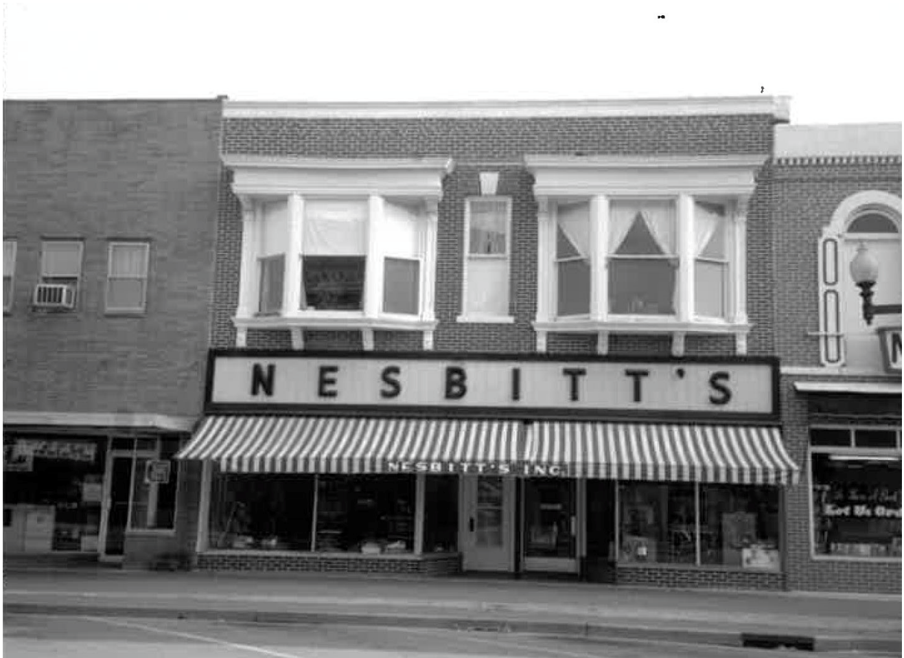
1990 survey photograph (Naumann 1991)