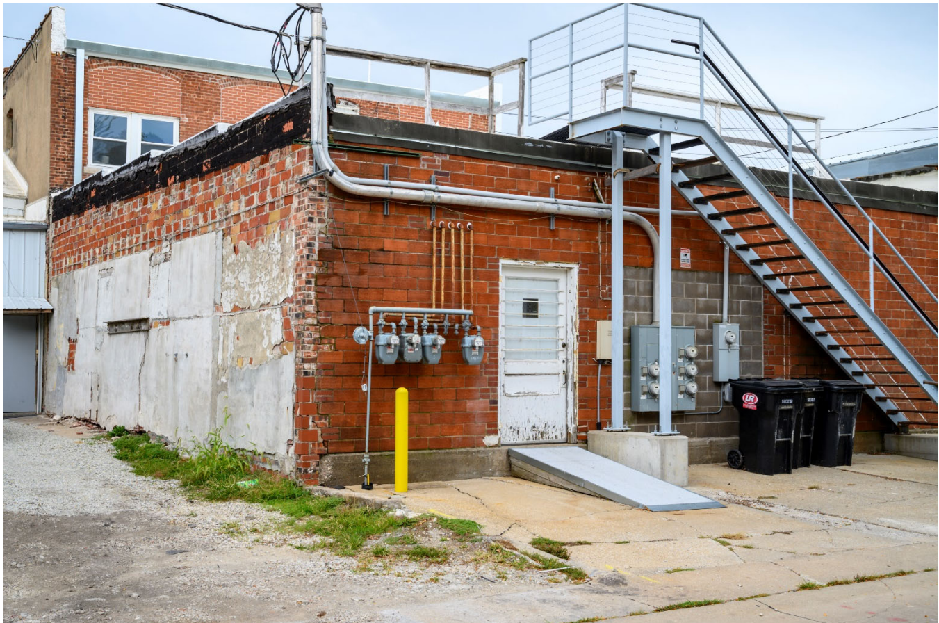
Photograph 44-00245-002. South and east elevation, looking northwest (October 2023)