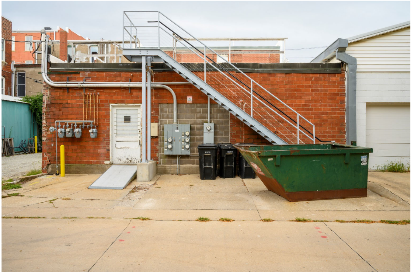
Photograph 44-00245-003. East elevation, looking west (October 2023)