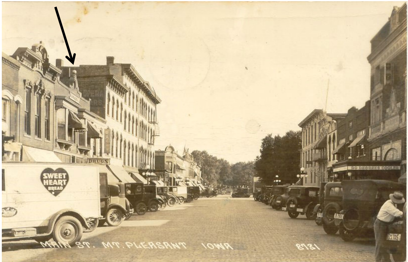
Building at left in 1920s (HCHT Facebook album)