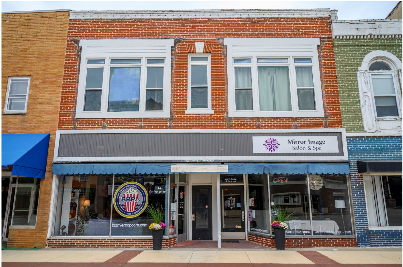
Photograph 44-00245-001. West elevation, looking east (October 2023)