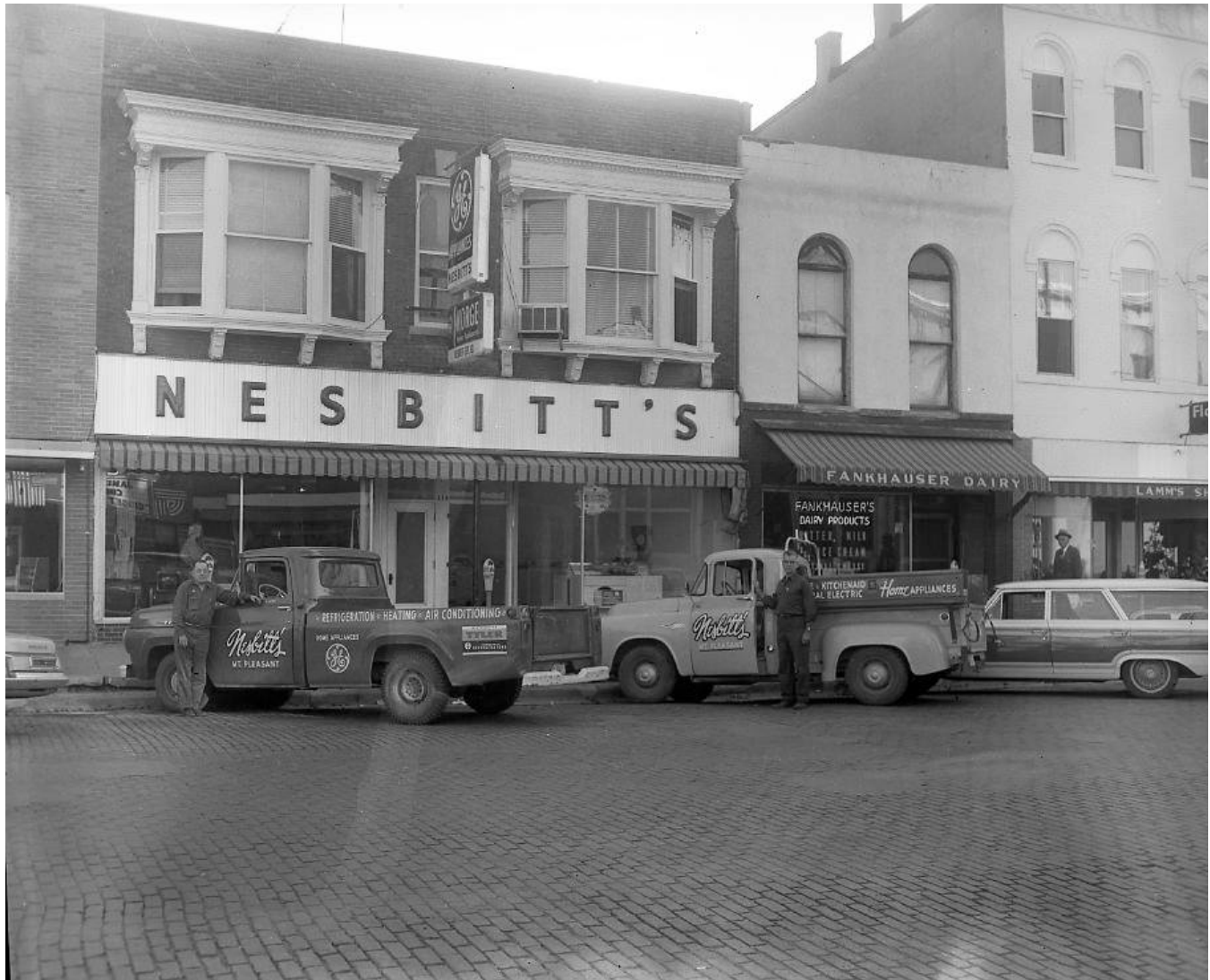
Building on November 11, 1963 (Nesbitt's opening)