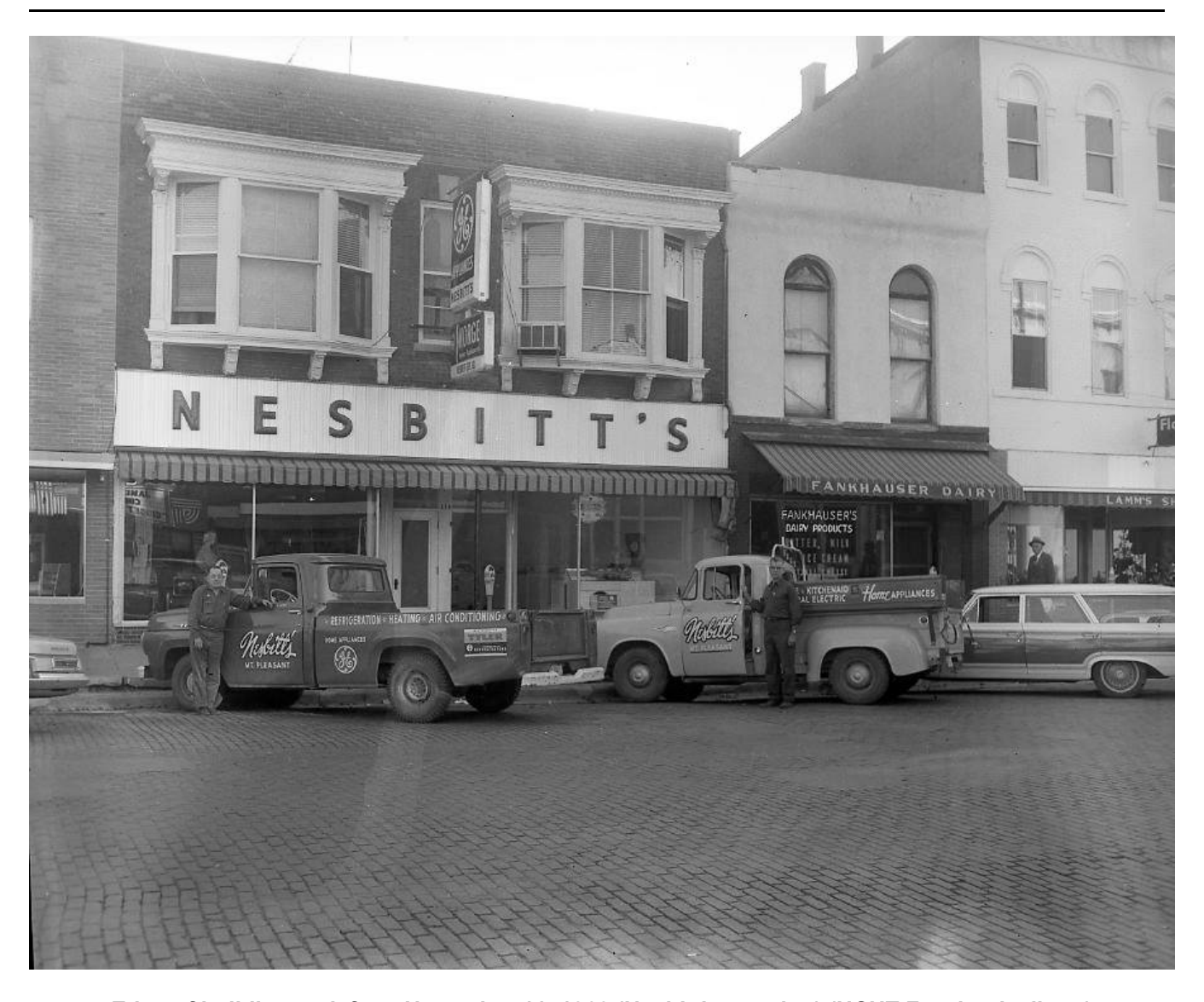
Edge of building on left on November 11, 1963 (Nesbitt's opening) (HCHT Facebook album) new façade brick by this date