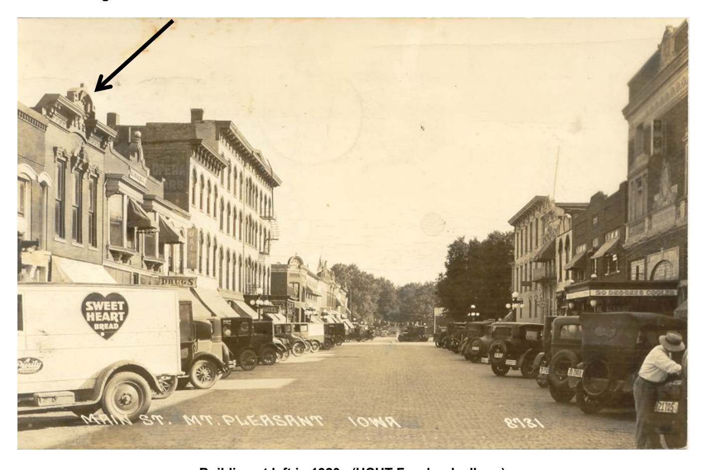
Building at left in 1920s