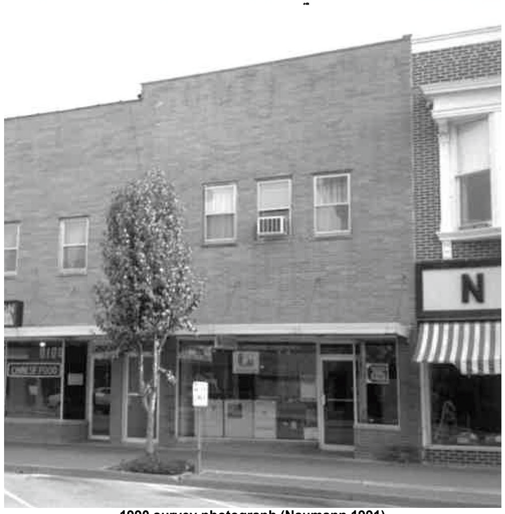
1990 survey photograph (Naumann 1991)