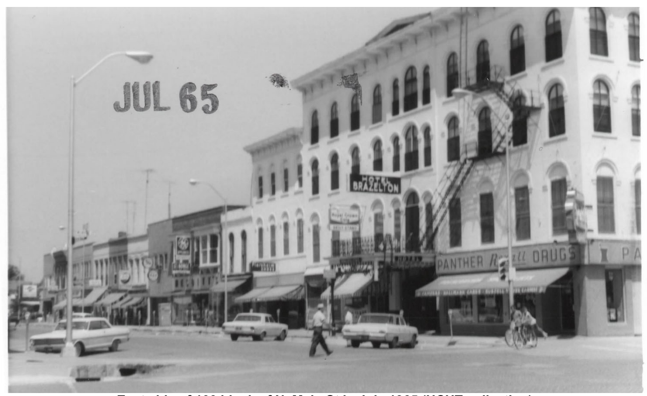
East side of 100 block of N. Main St in July 1965