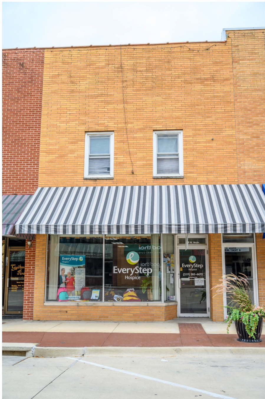
Photograph 44-00248-001. West elevation, looking east (October 2023)