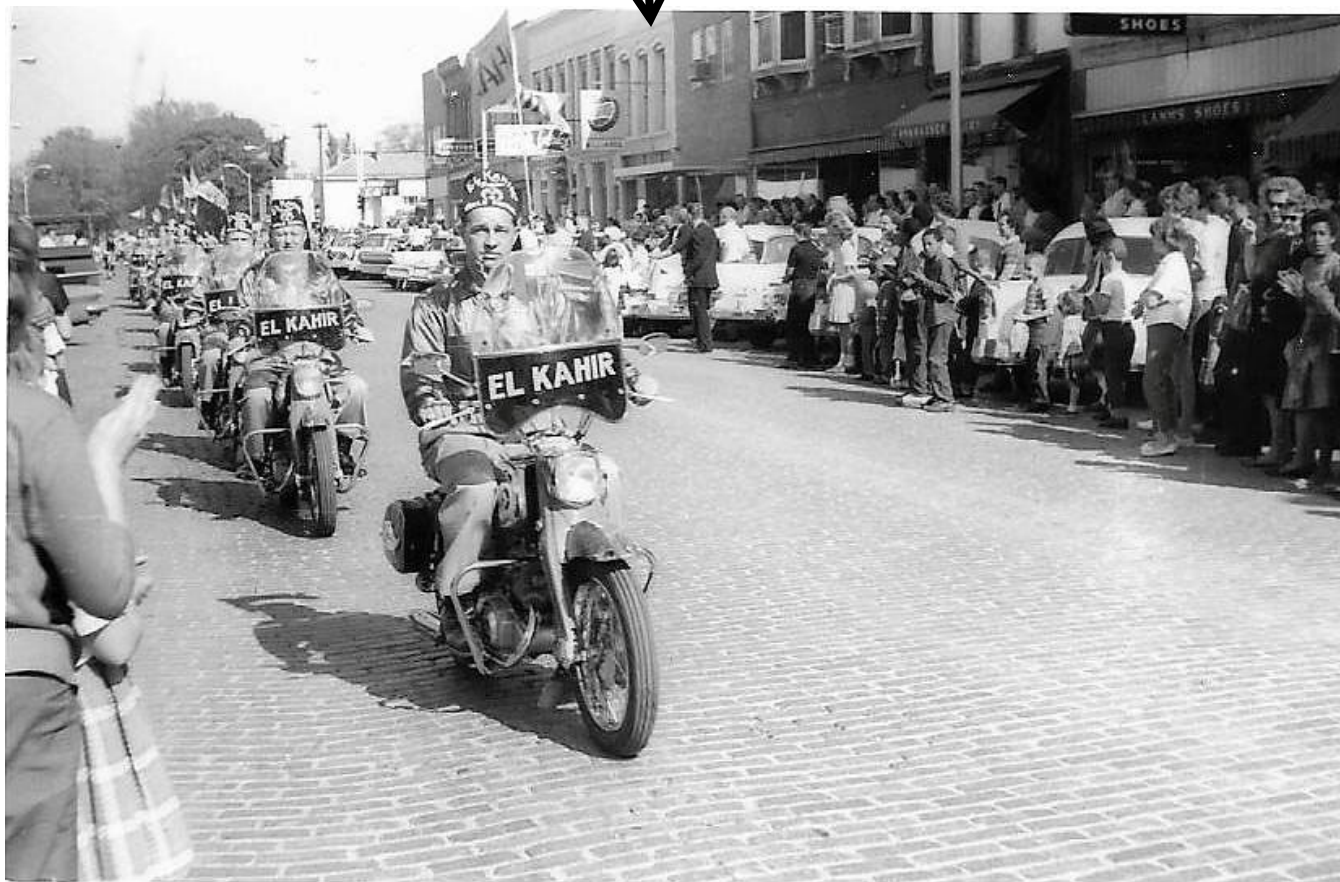
East side of 100 block of N. Main St in October 1960 (HCHT Facebook album)