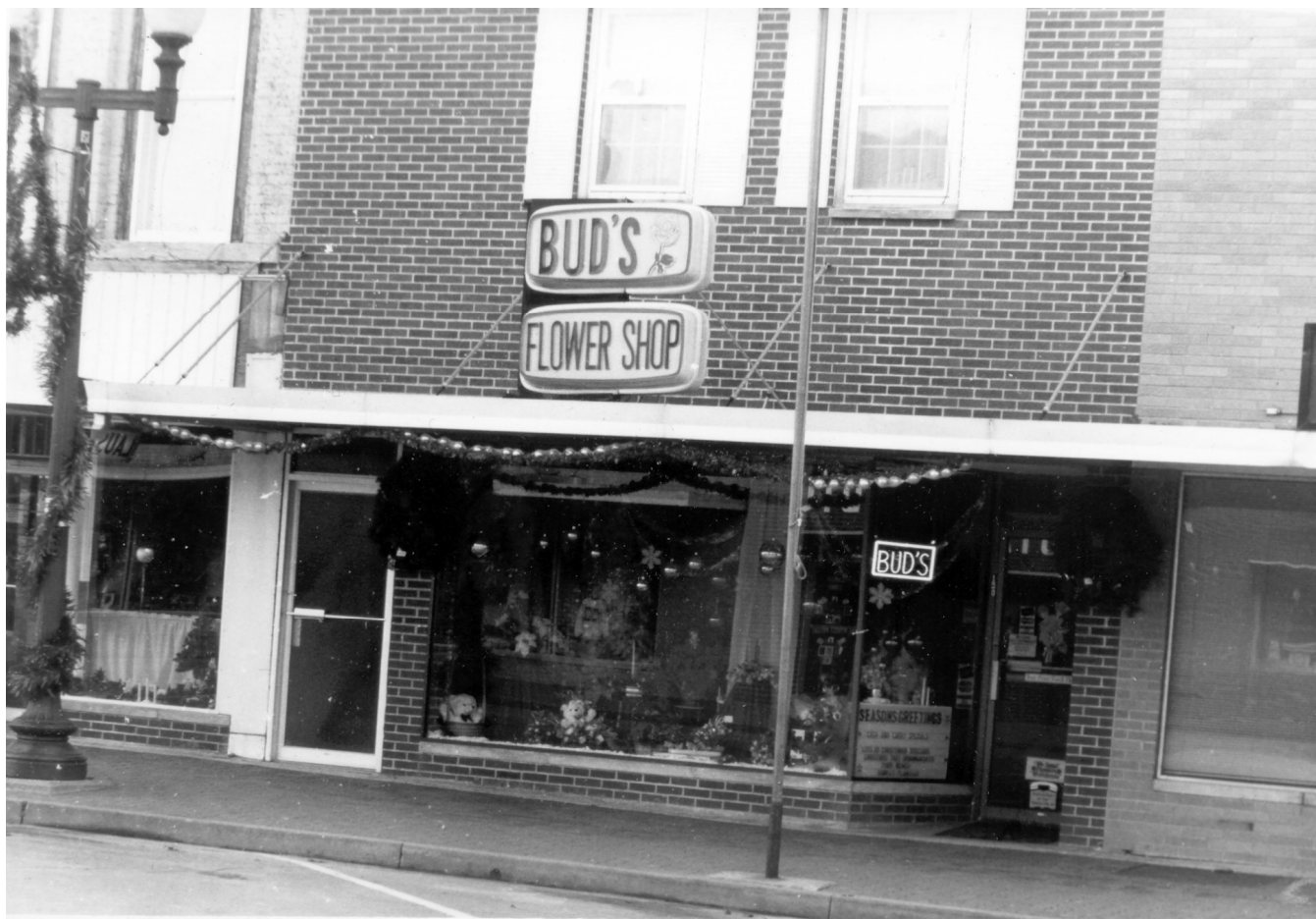
Building with new façade brick at right edge of photograph, c.1970