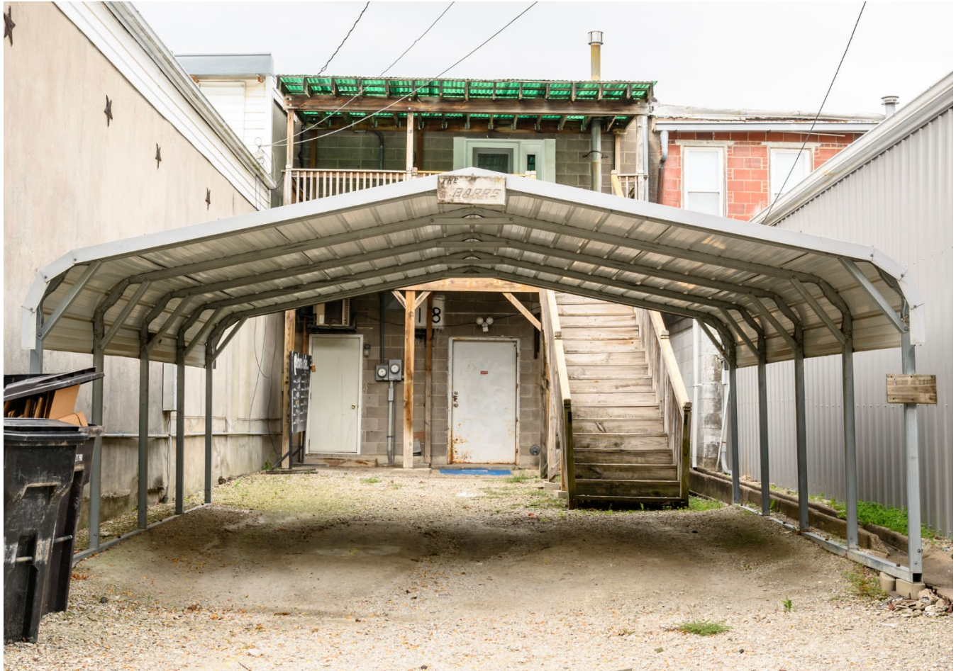
Photograph 44-00248-002. East elevation, looking west (October 2023)