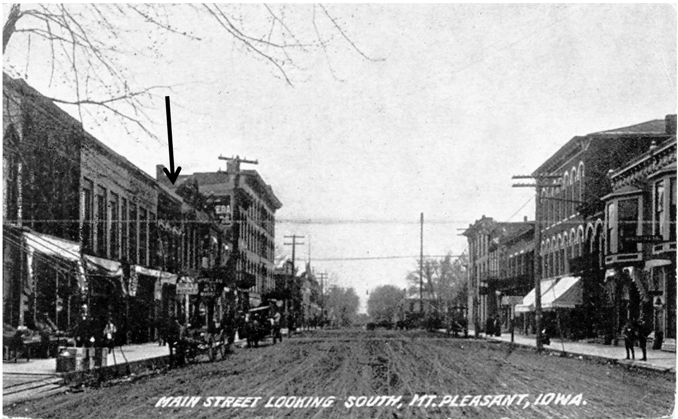
Building at left in 1900s (HCHT Facebook album)