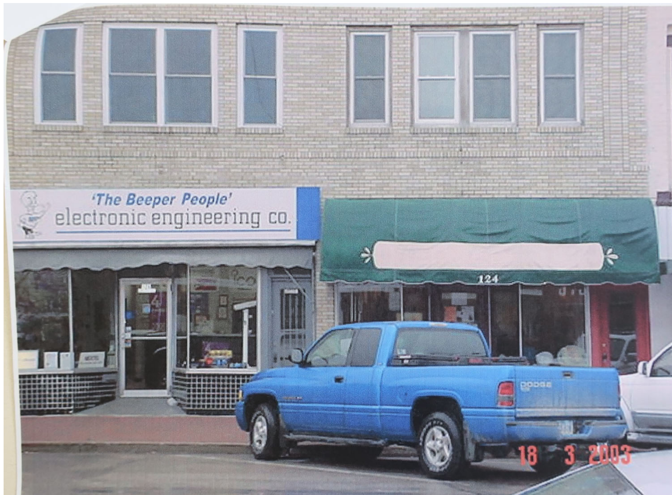
Building in March 2003 (City of Mount Pleasant building permits)