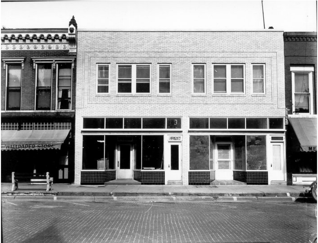
Building in late 1930s after façade remodel (HCHT Facebook album)