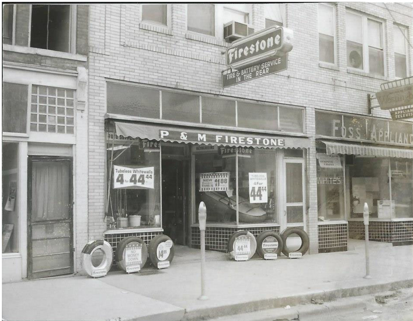
Building in November 1961