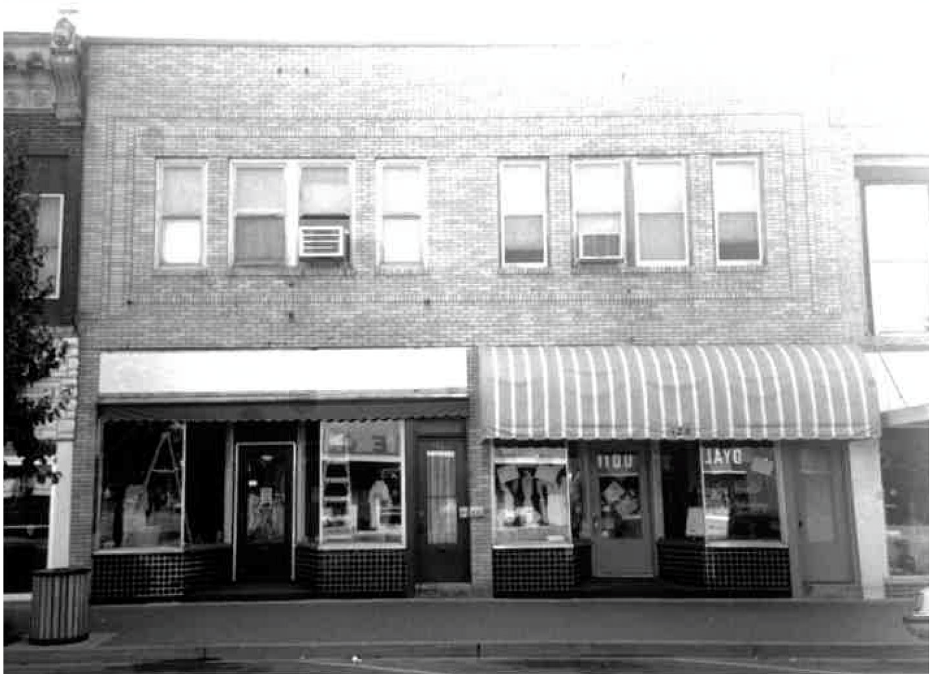
1990 survey photograph (Naumann 1991)