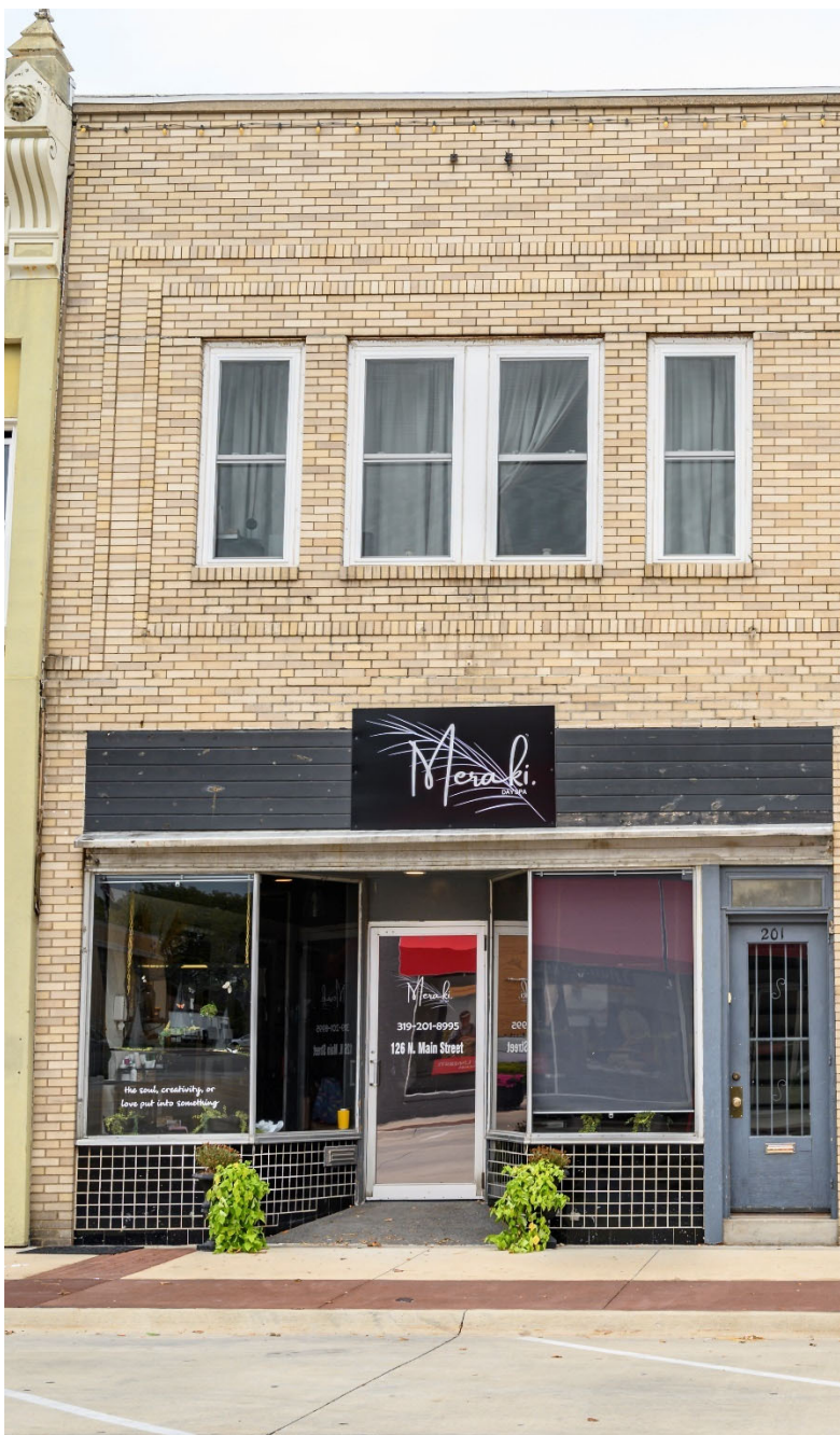
Photograph 44-00253b-001. West elevation, looking east (October 2023)