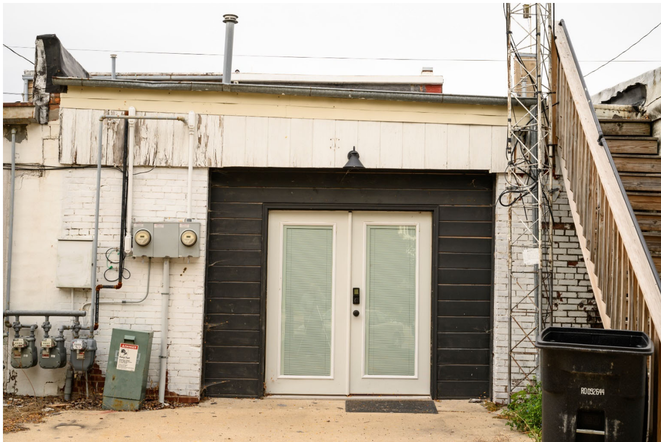
Photograph 44-00253b-002. East elevation, looking west (October 2023)