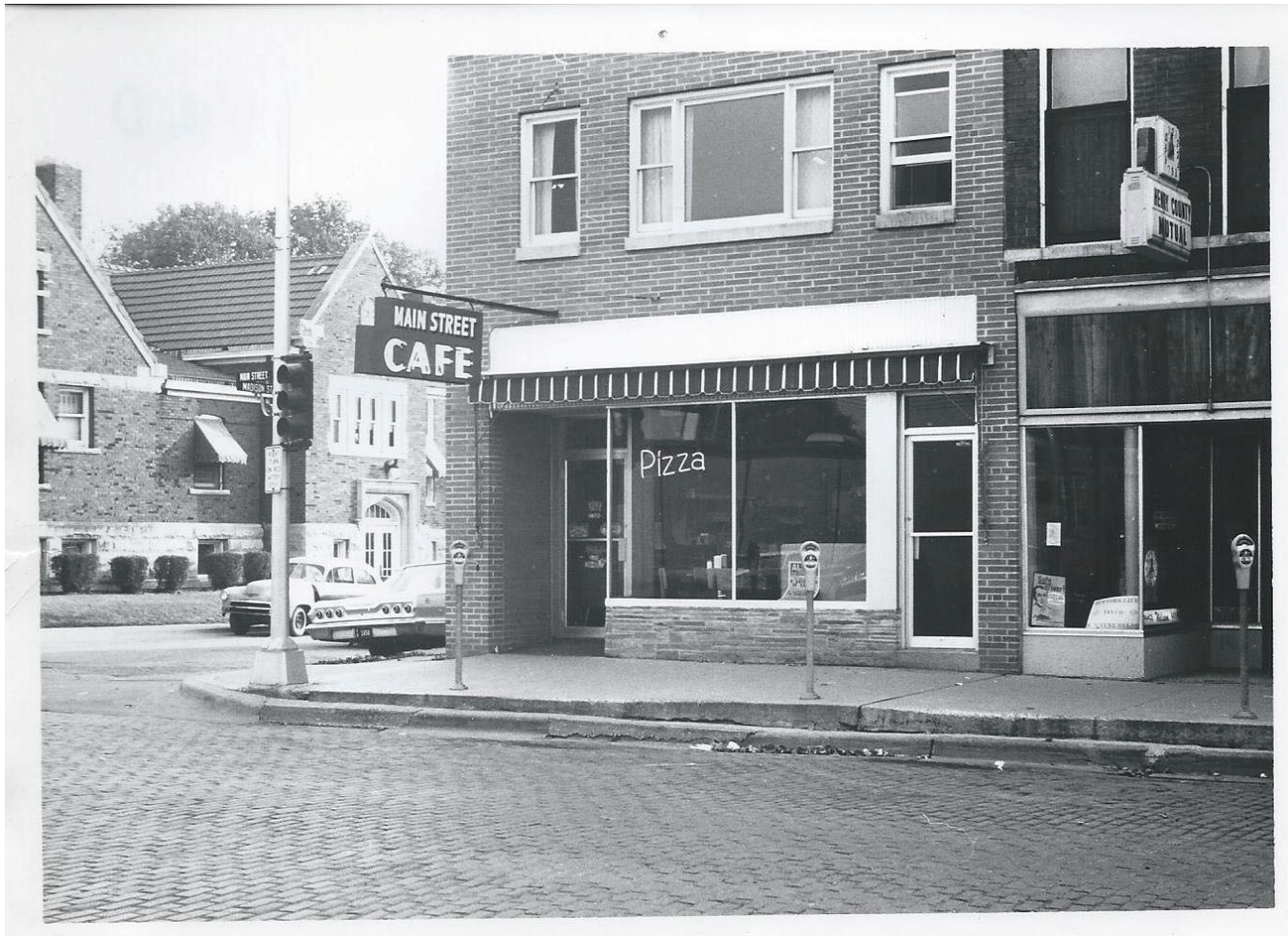
Building in 1960s (HCHT Facebook album)