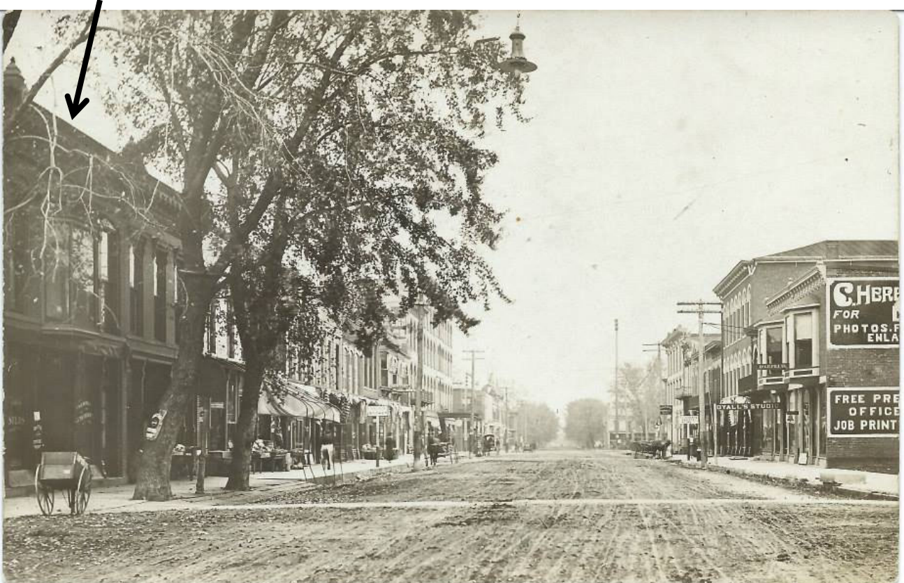
Looking south on 100 block of N. Main St around 1900