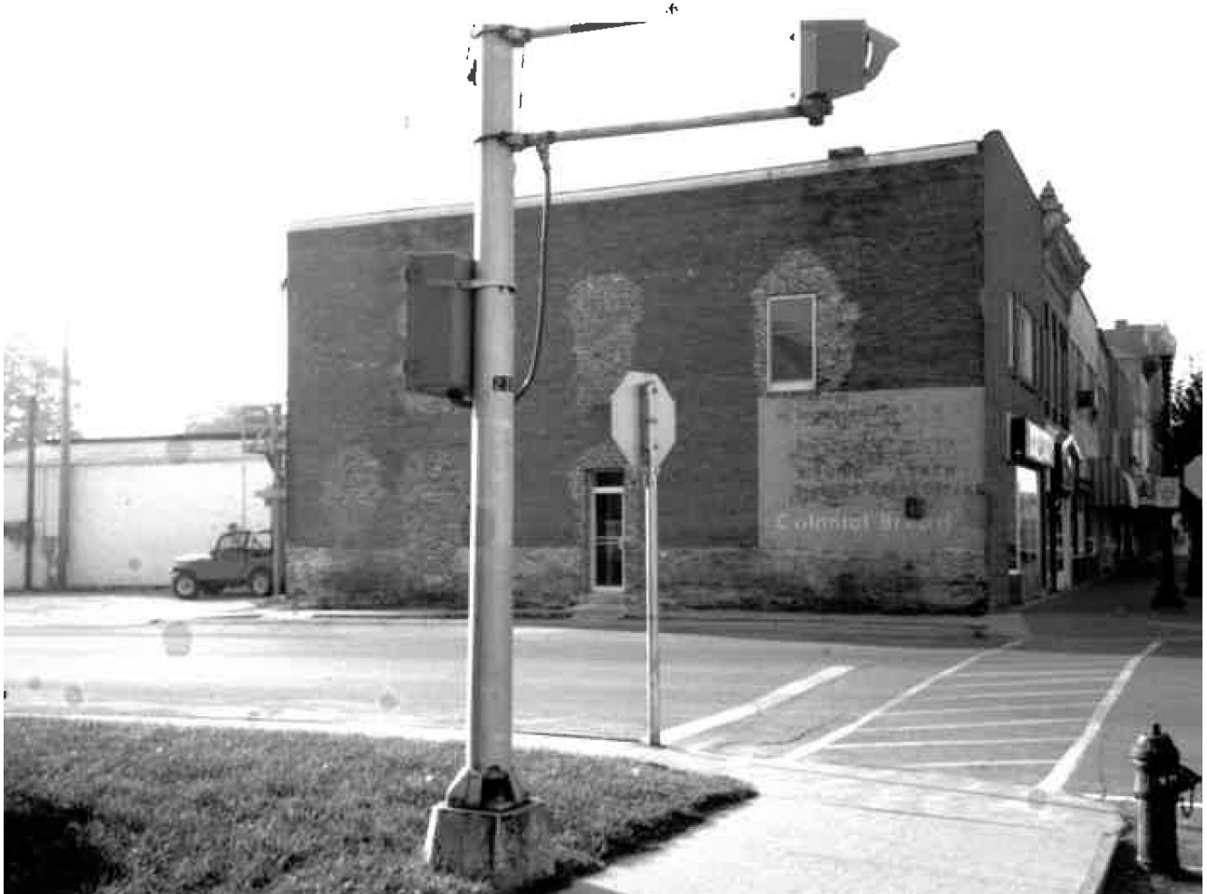
1990 survey photograph (Naumann 1991)