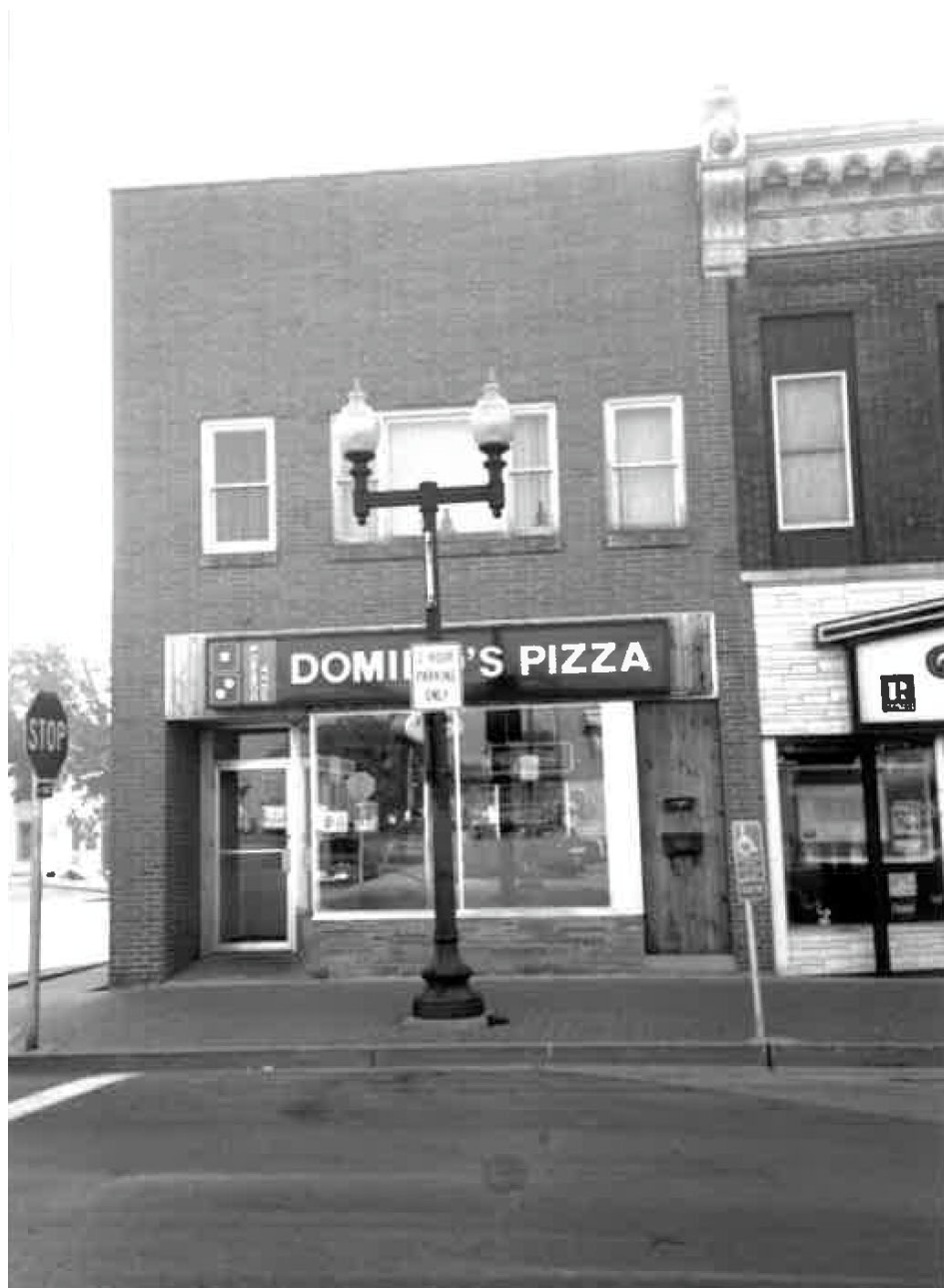
1990 survey photograph (Naumann 1991)