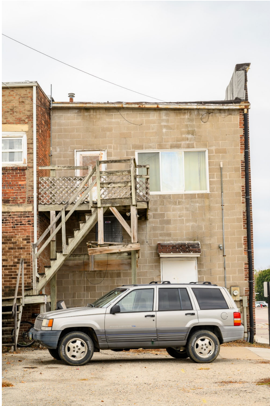
Photograph 44-00256-003. East elevation, looking west (October 2023)