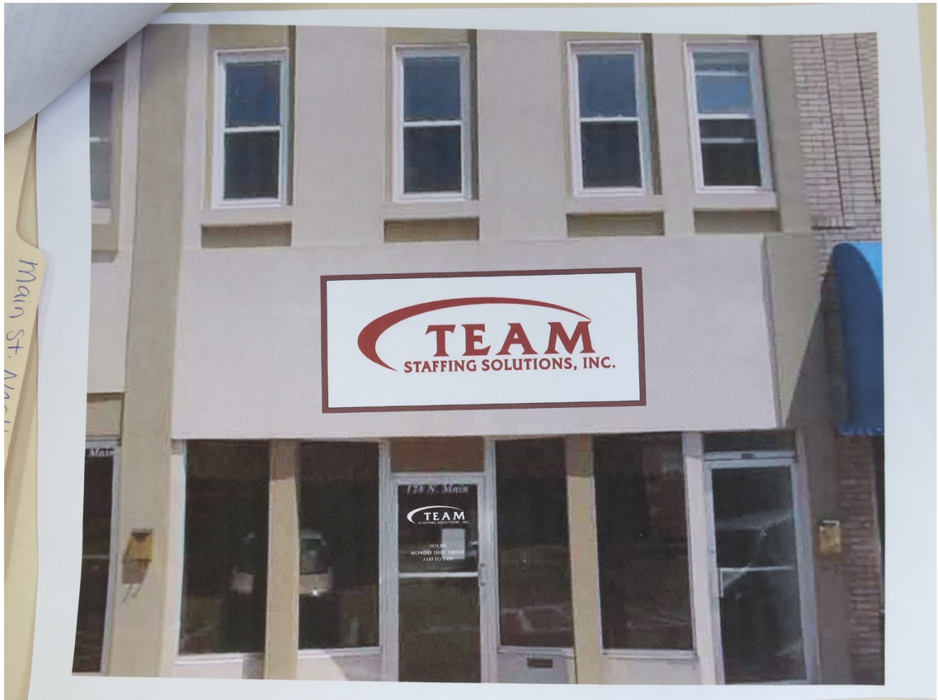
Edge of building at left at time of sign permit application in May 2007 (City of Mt Pleasant building permit)