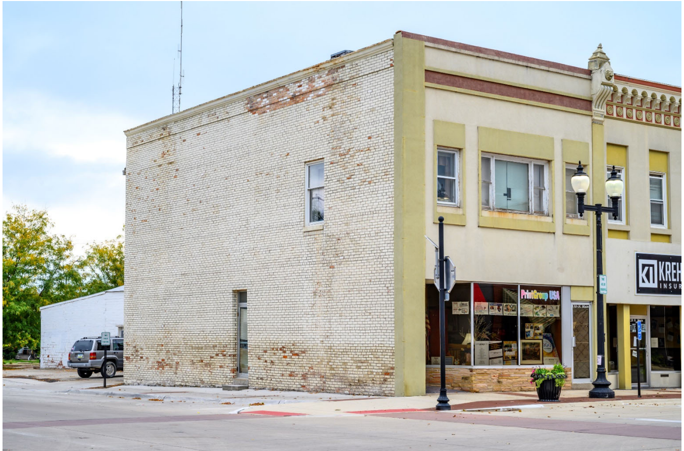
Photograph 44-00256-002. North and west elevations, looking southeast (October 2023)