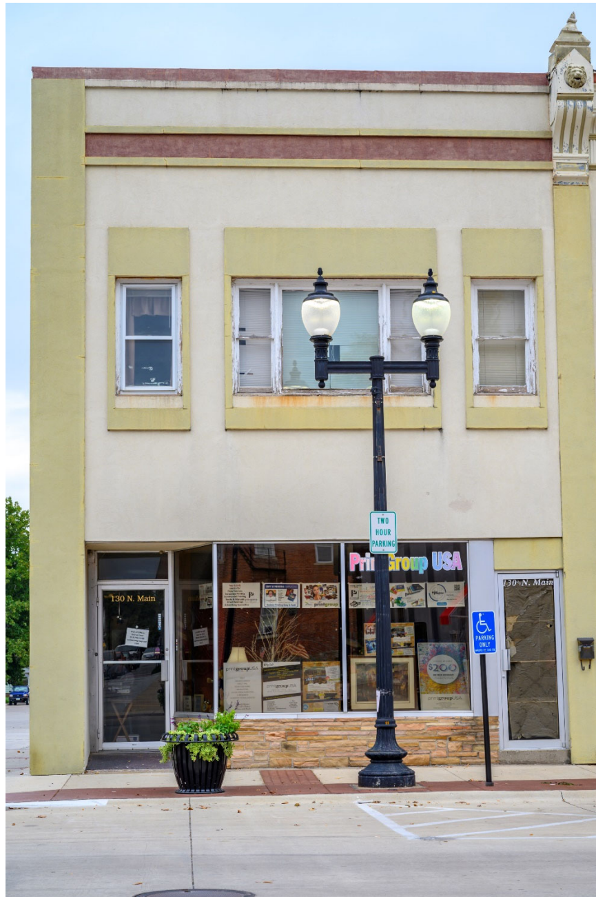
Photograph 44-00256-001. West elevation, looking east (October 2023)