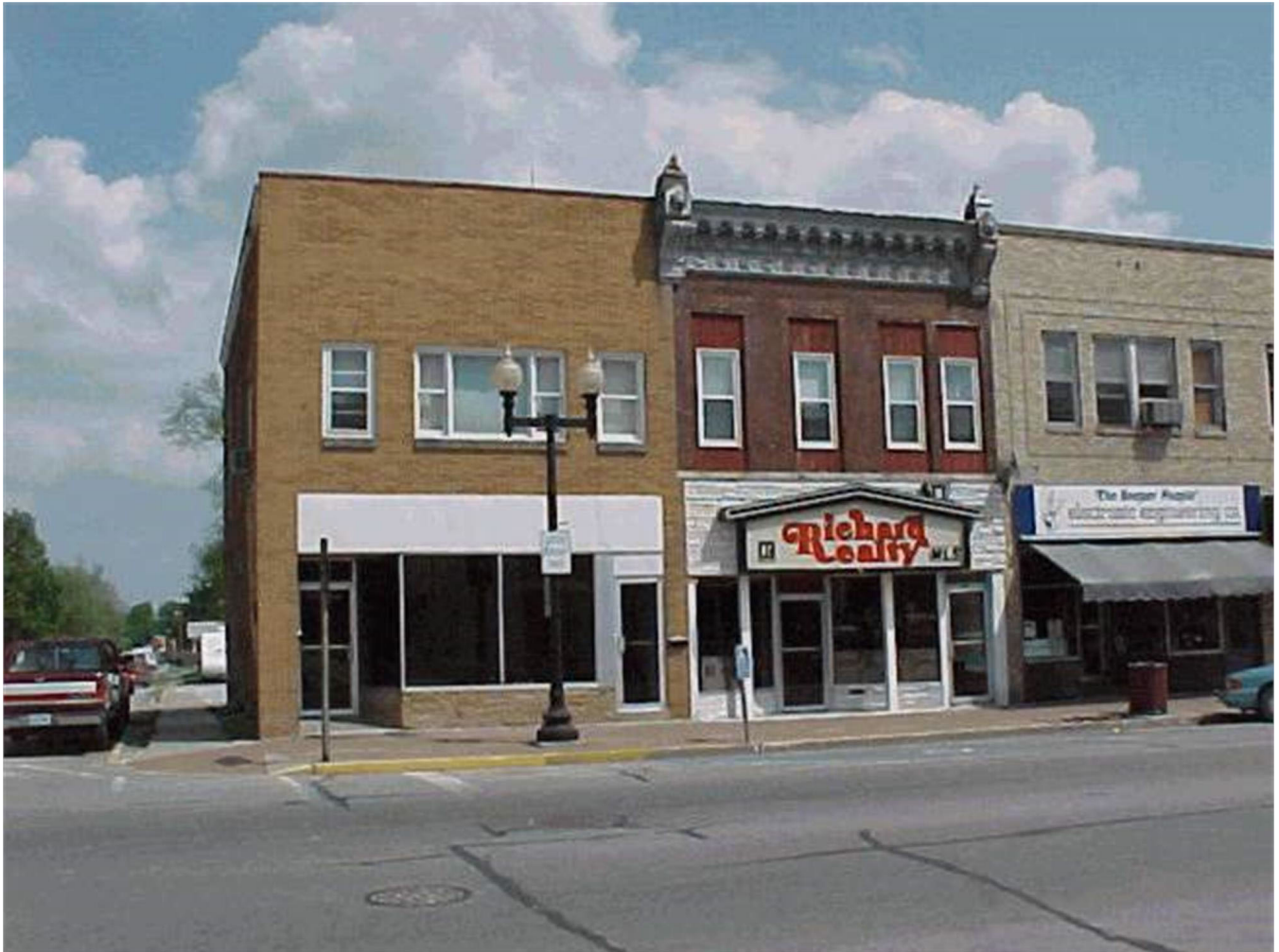
Building in early 2000s

Main Street Café Henry Name of Property County 130 N. Main St Mount Pleasant Address City