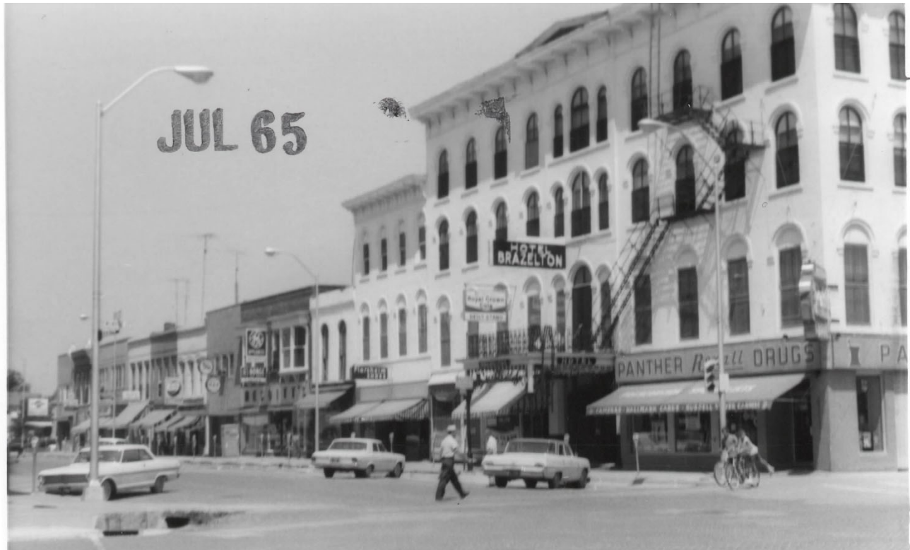
East side of 100 block of N. Main St in July 1965