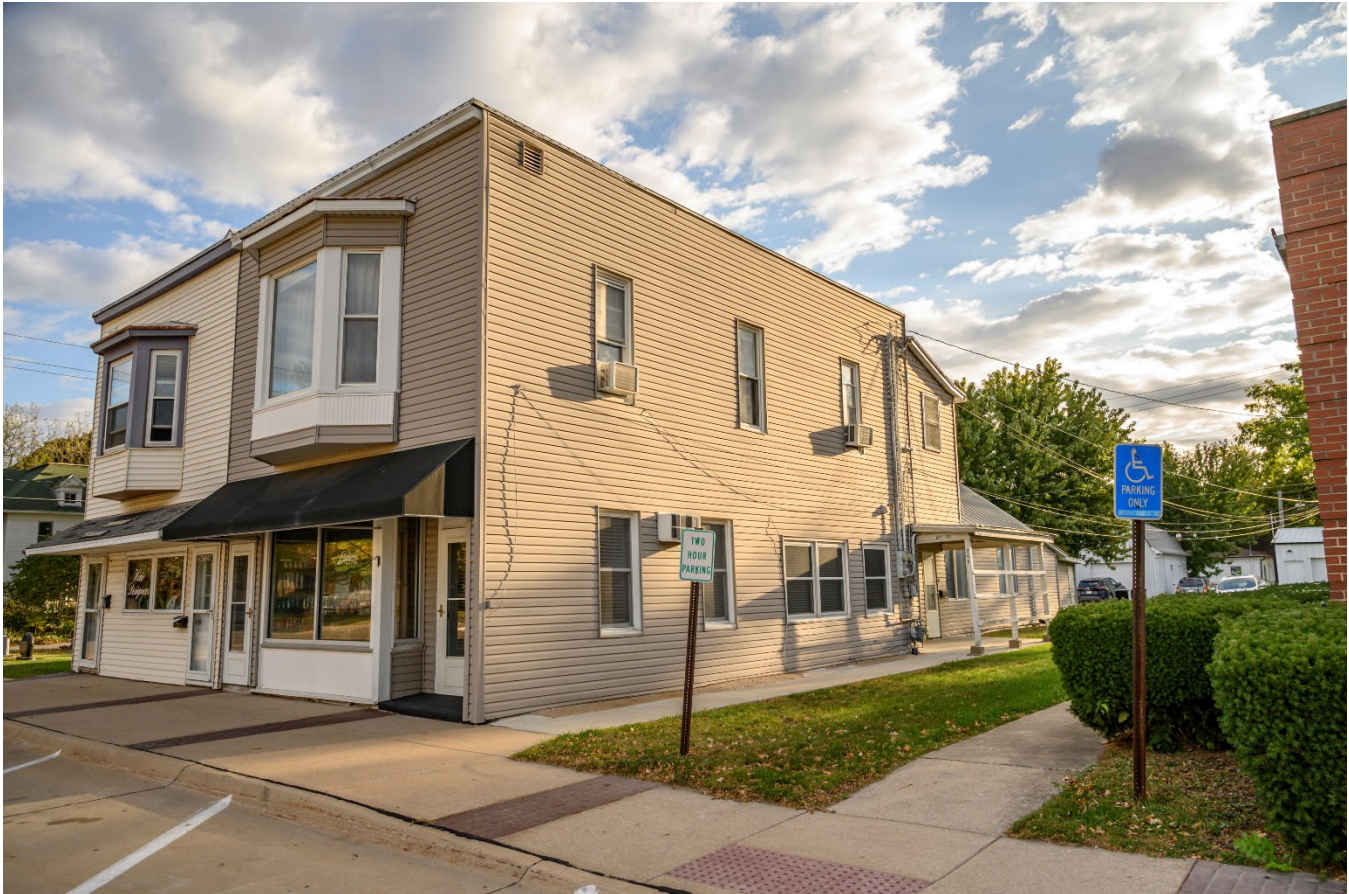
Photograph 44-00258-002. West and south elevations, looking northeast (October 2023)