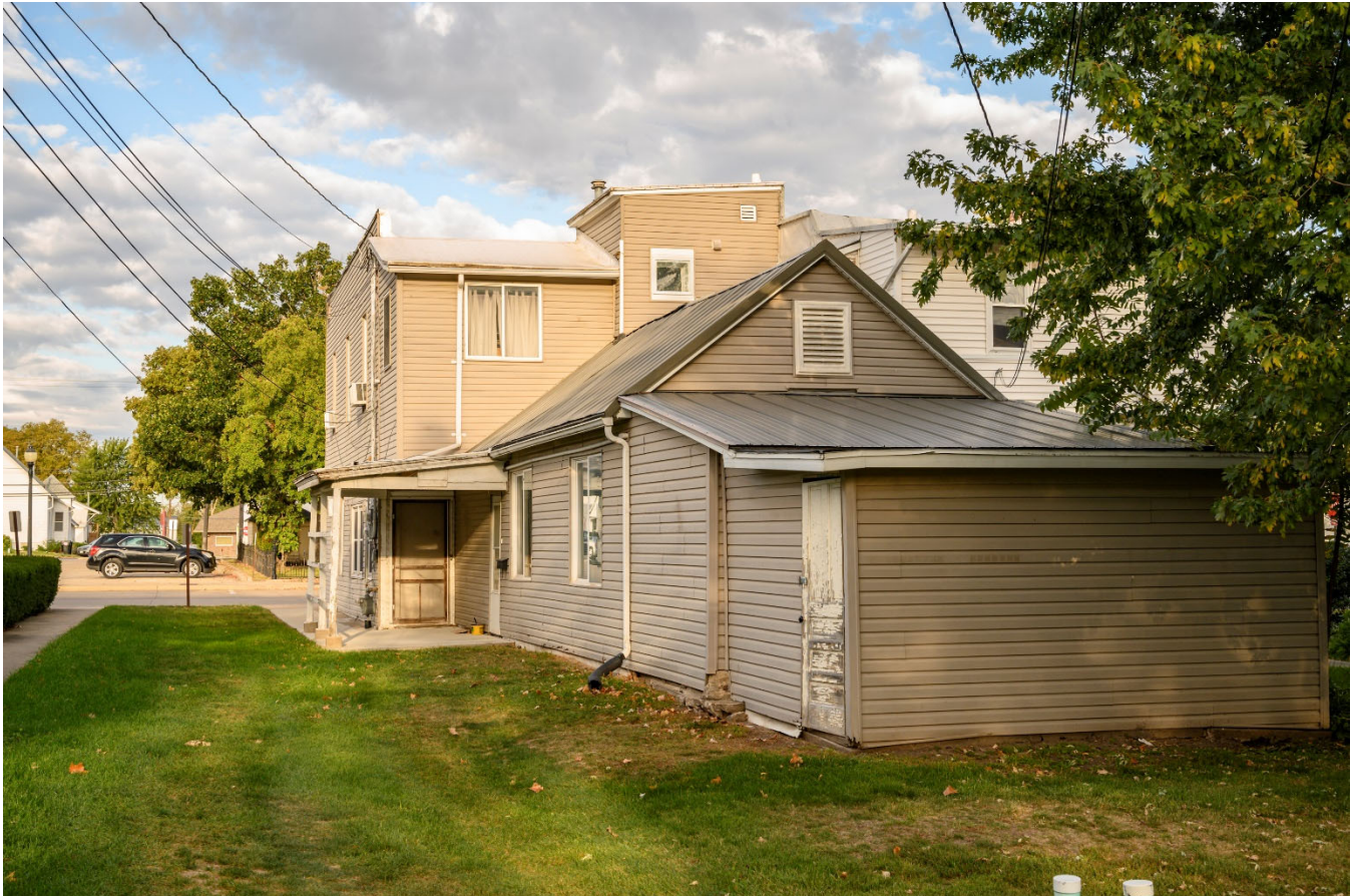
Photograph 44-00258-003. East elevation, looking west (October 2023)