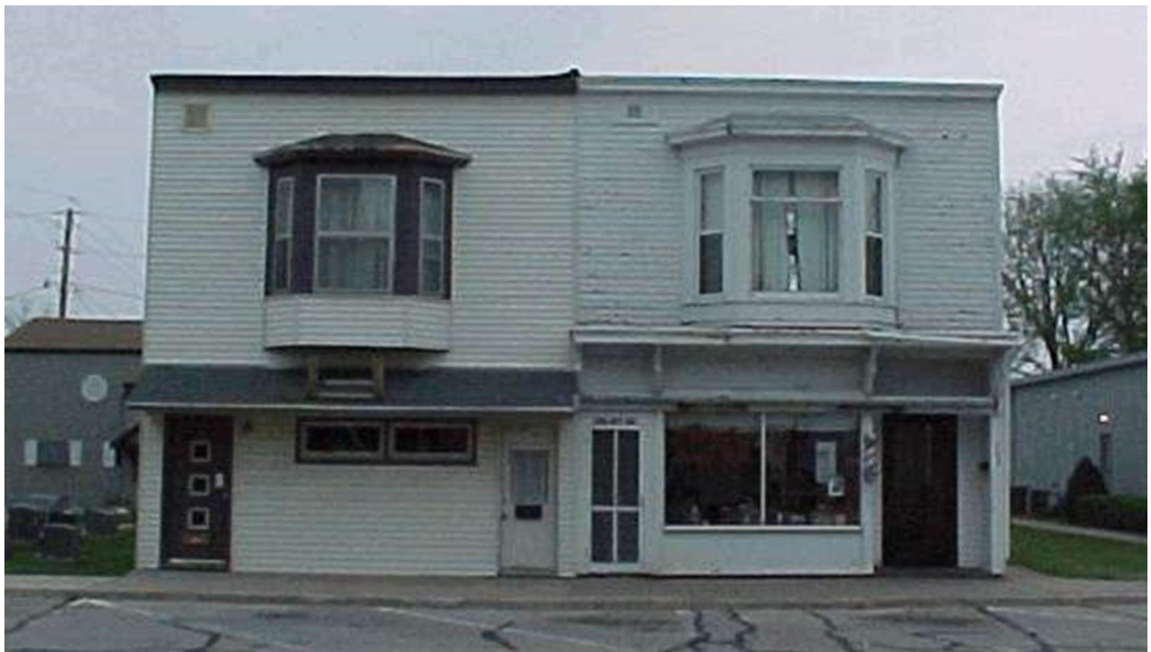
Henry County Assessor