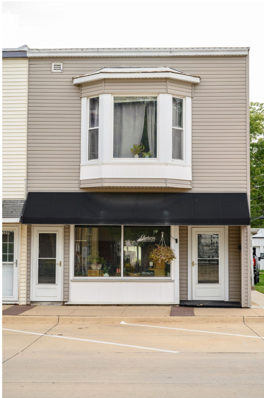
Photograph 44-00258-001. West elevation, looking east (October 2023)