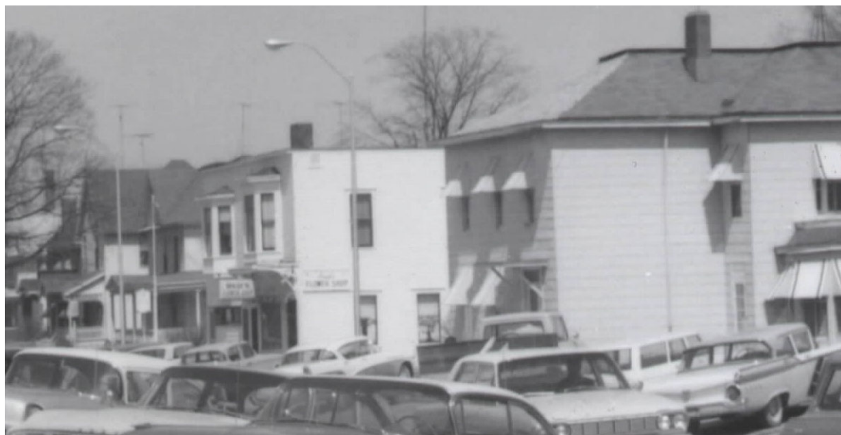
Building in April 1964