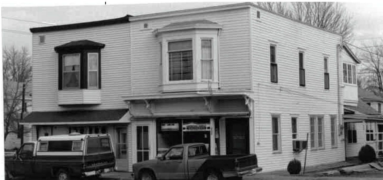
Building at left, 1990 survey photograph (Naumann 1991)

Spry Building Henry Name of Property County 210 N. Main St Mount Pleasant Address City