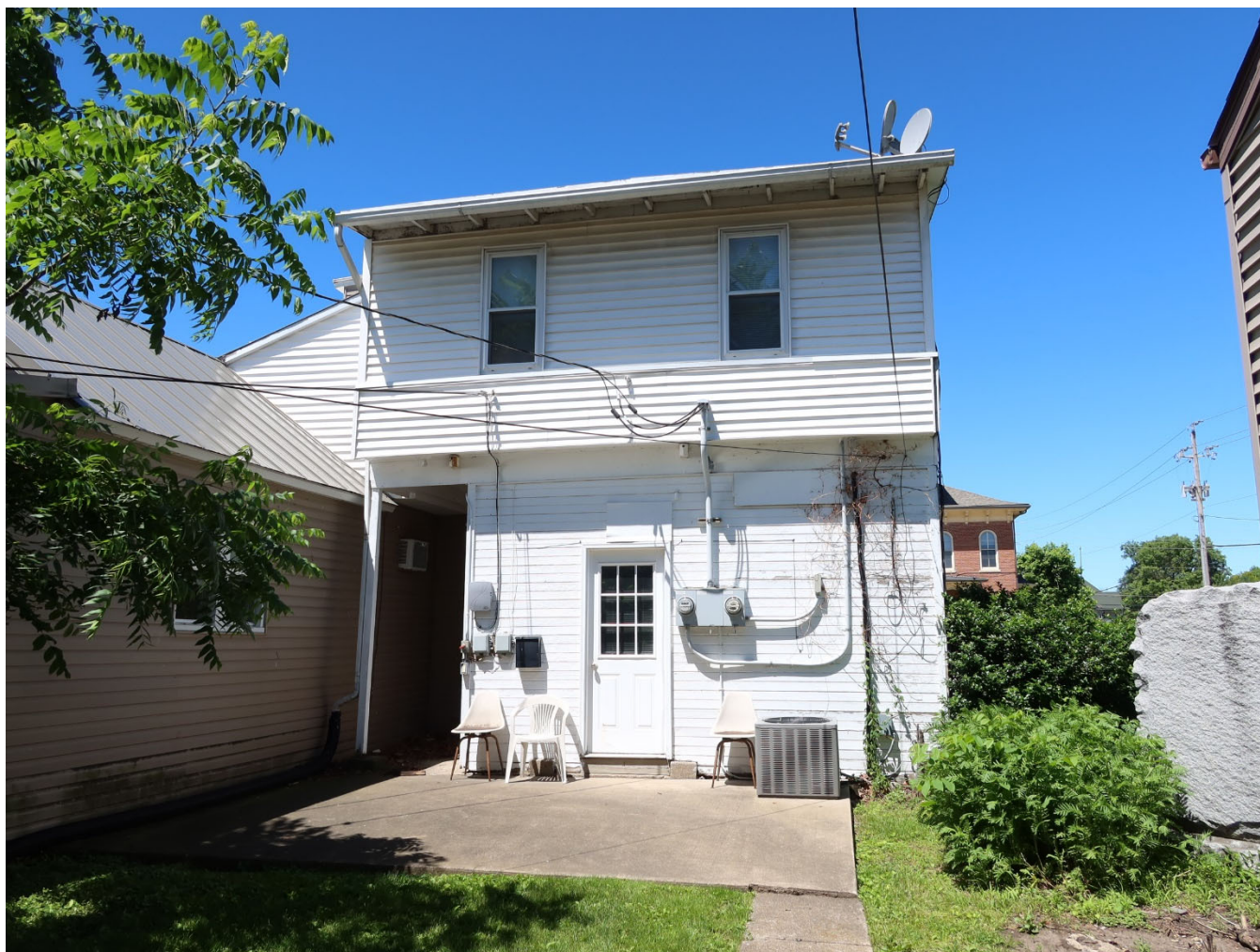
Photograph 44-02279-004. East elevation, looking west (October 2023)