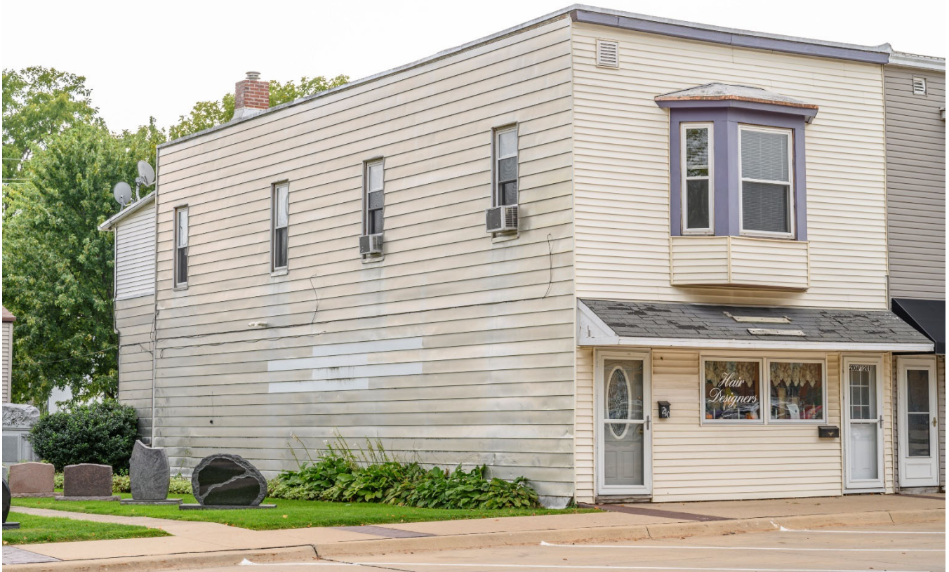
Photograph 44-02279-001. North and West elevations, looking southeast (October 2023)

Spry Building Henry Name of Property County 210 N. Main St Mount Pleasant Address City