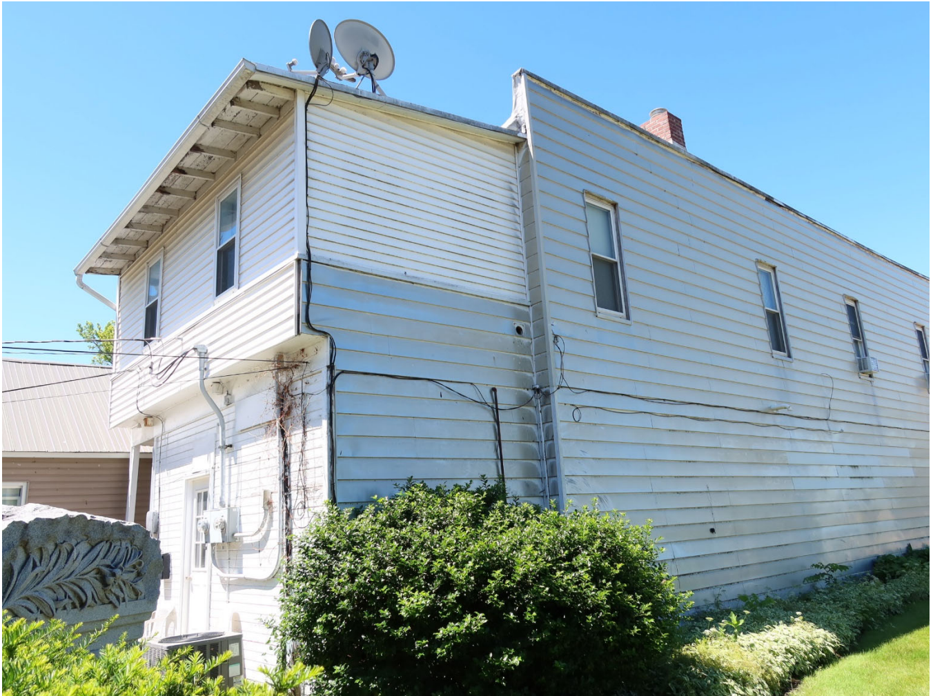
Photograph 44-02279-003. North elevation, looking southwest (October 2023)