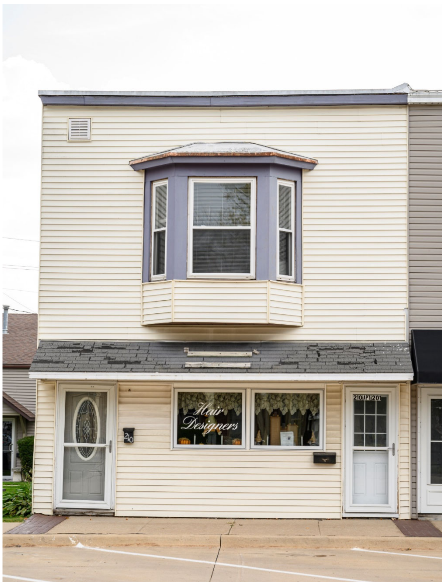
Photograph 44-02279-002. West elevation, looking east (October 2023)