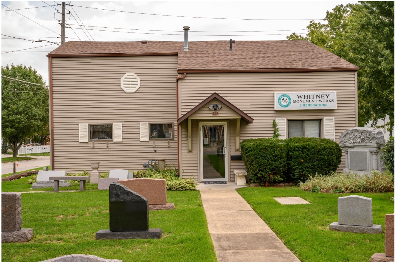
Photograph 44-02258-001. West elevation, looking east (October 2023)