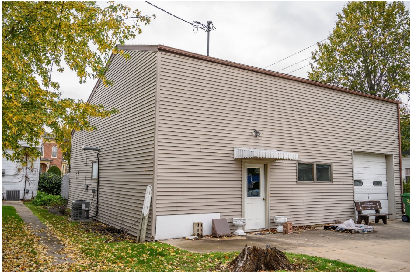
Photograph 44-02258-004. South and east elevations, looking northwest (October 2023)