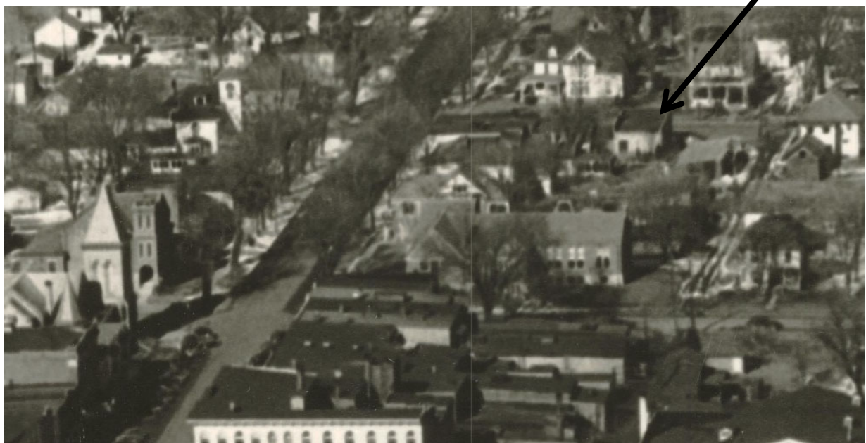
Building on northeast portion of 1947 aerial photograph of Mt Pleasant, looking north (HCHT files, printed in Des Moines Register , April 27, 1947, sec 9, p3, p83)