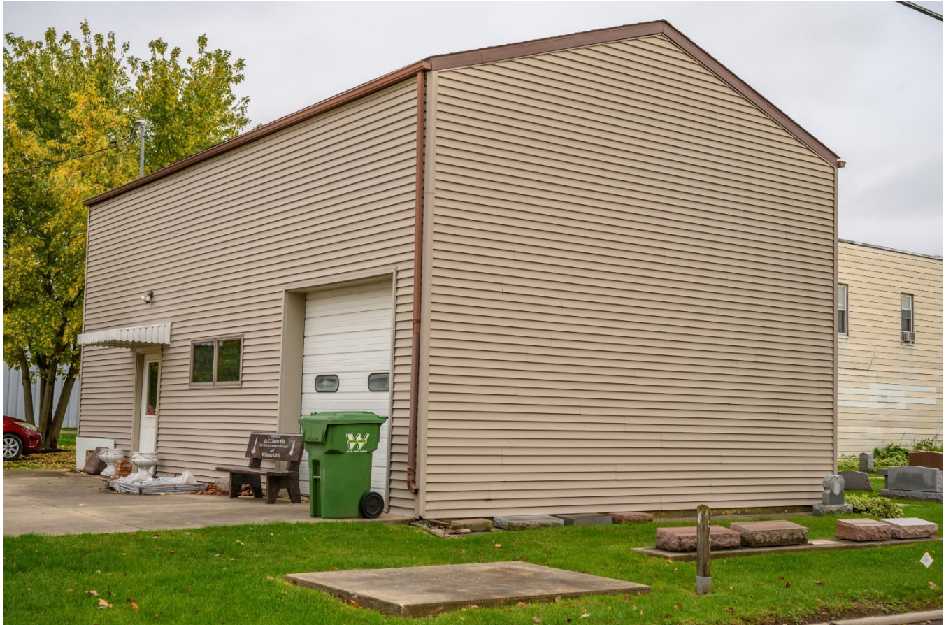
Photograph 44-02258-002. East and north elevations, looking southwest (October 2023)

Case Memorials Henry Name of Property County 212 N. Main St Mount Pleasant Address City