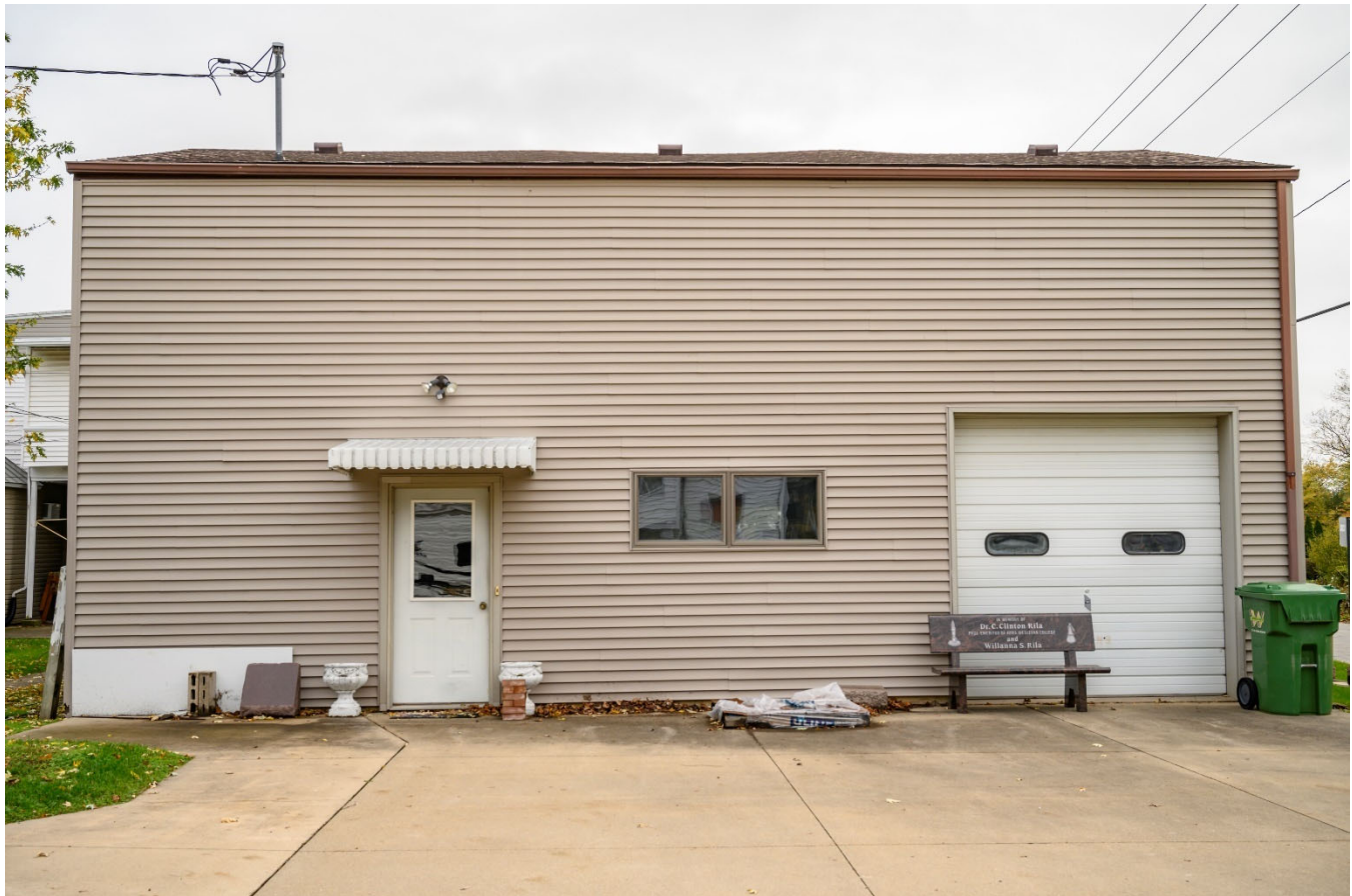
Photograph 44-02258-003. East elevation, looking west (October 2023)