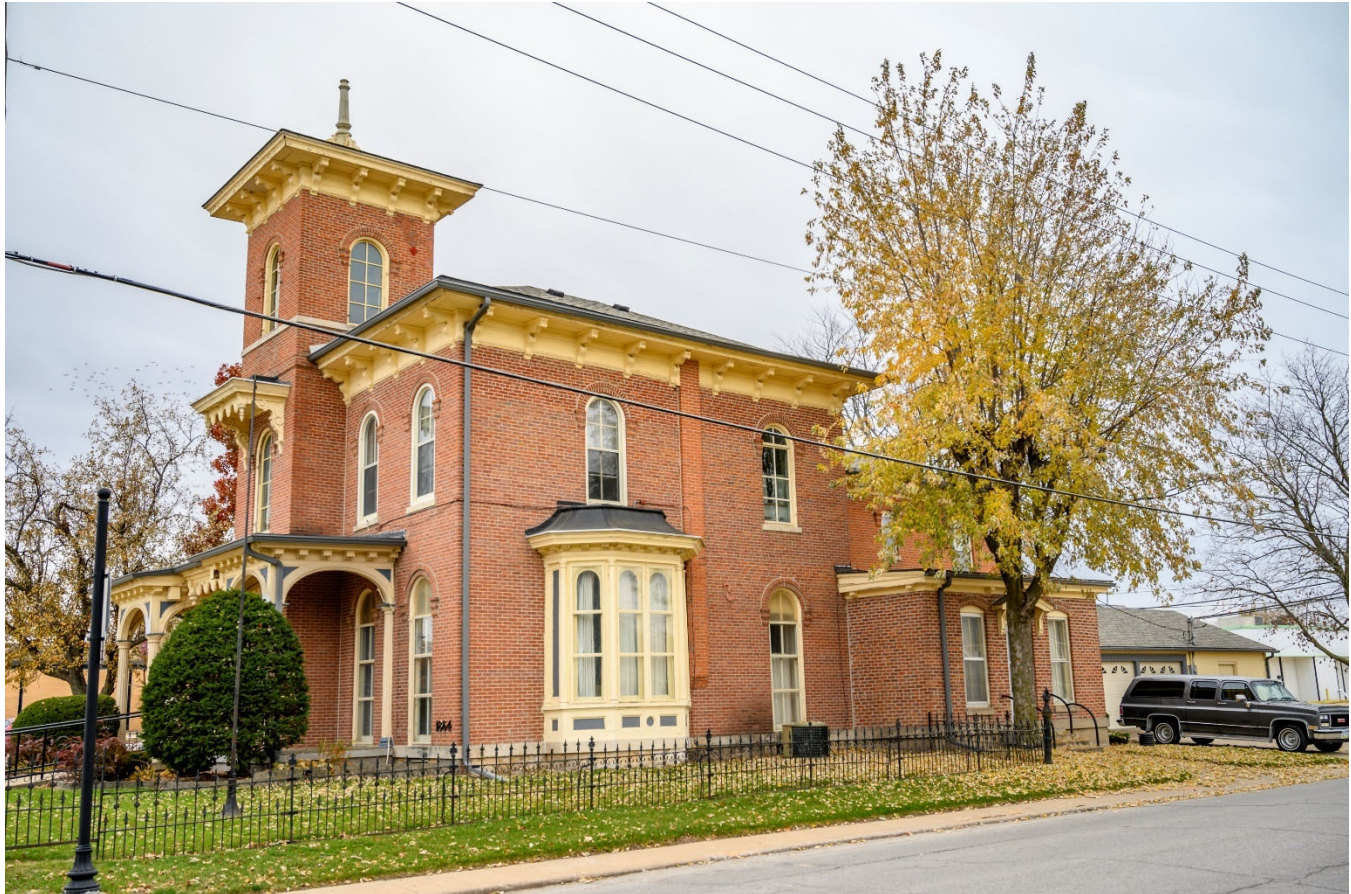
Photograph 44-00259-002. North elevation, looking southwest (October 2023)