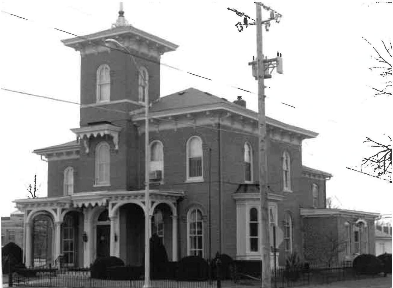
1990 survey photograph (Naumann 1991)