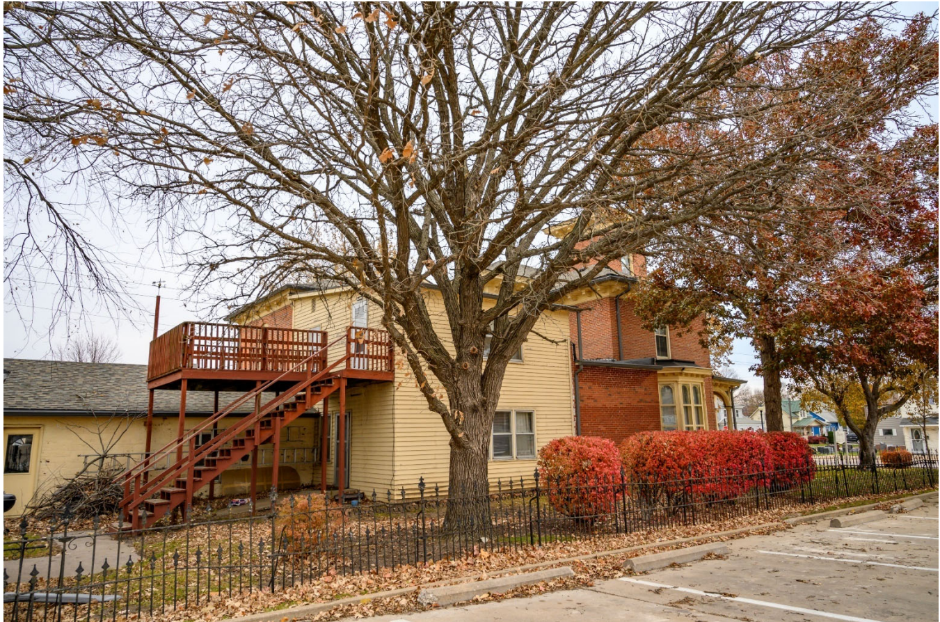
Photograph 44-00259-004. South elevation, looking northeast (October 2023)