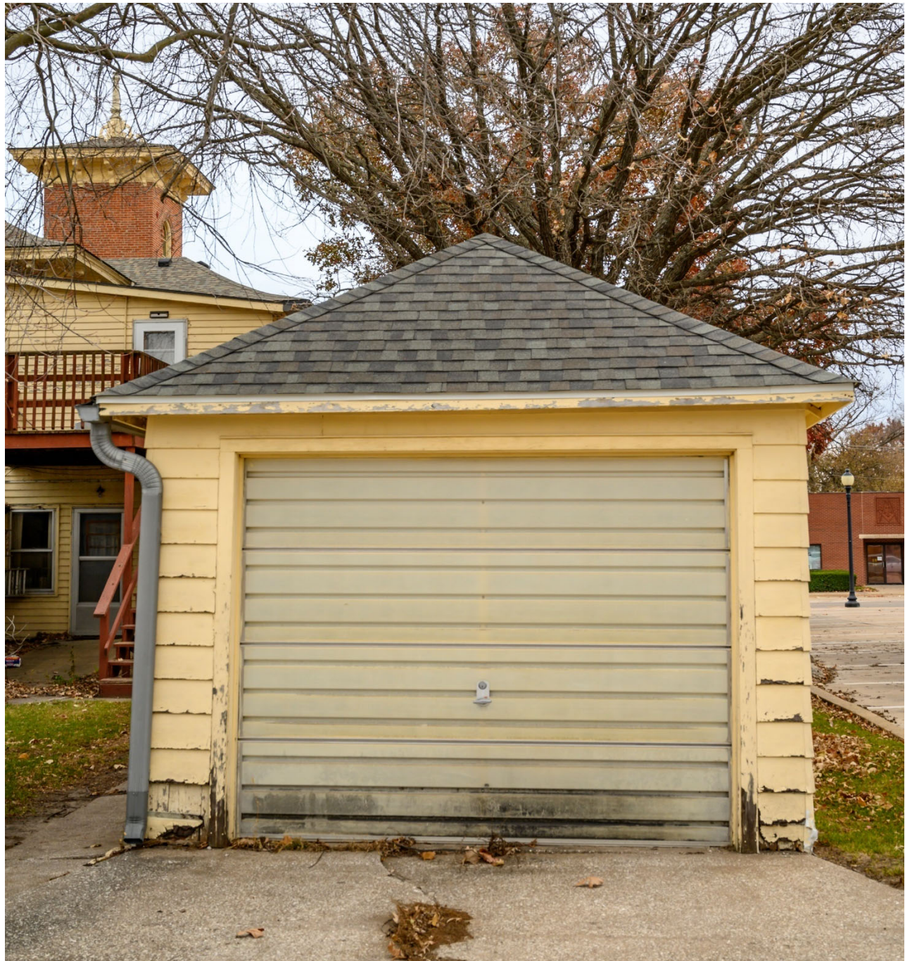
Photograph 44-00259-007. West elevation of garage, looking east (October 2023)