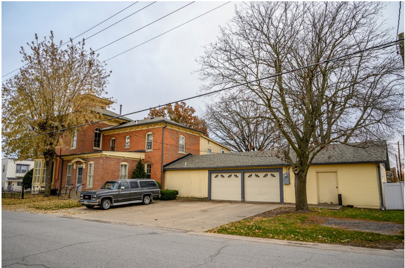
Photograph 44-00259-005. North and west elevations, looking southeast (October 2023)