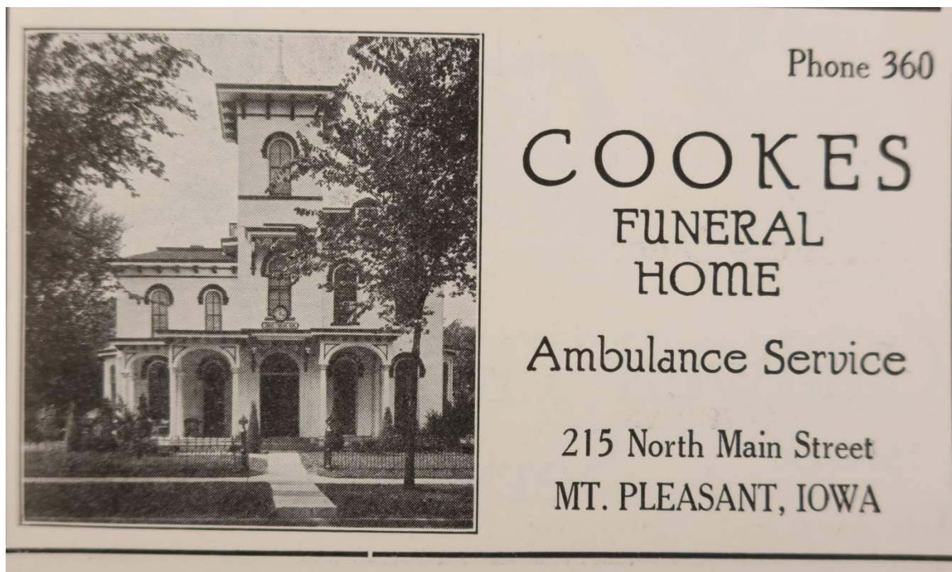
Ad in 1937 telephone directory