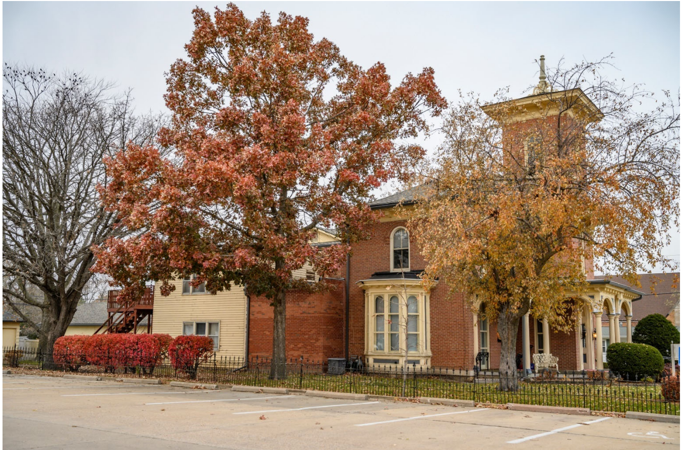
Photograph 44-00259-003. South elevation, looking northwest (October 2023)