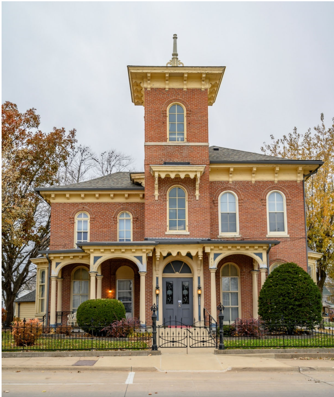
Photograph 44-00259-001. East elevation, looking west (October 2023)