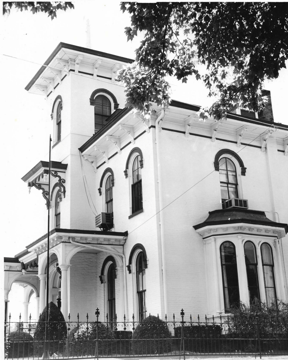
Funeral home on June 16, 1973