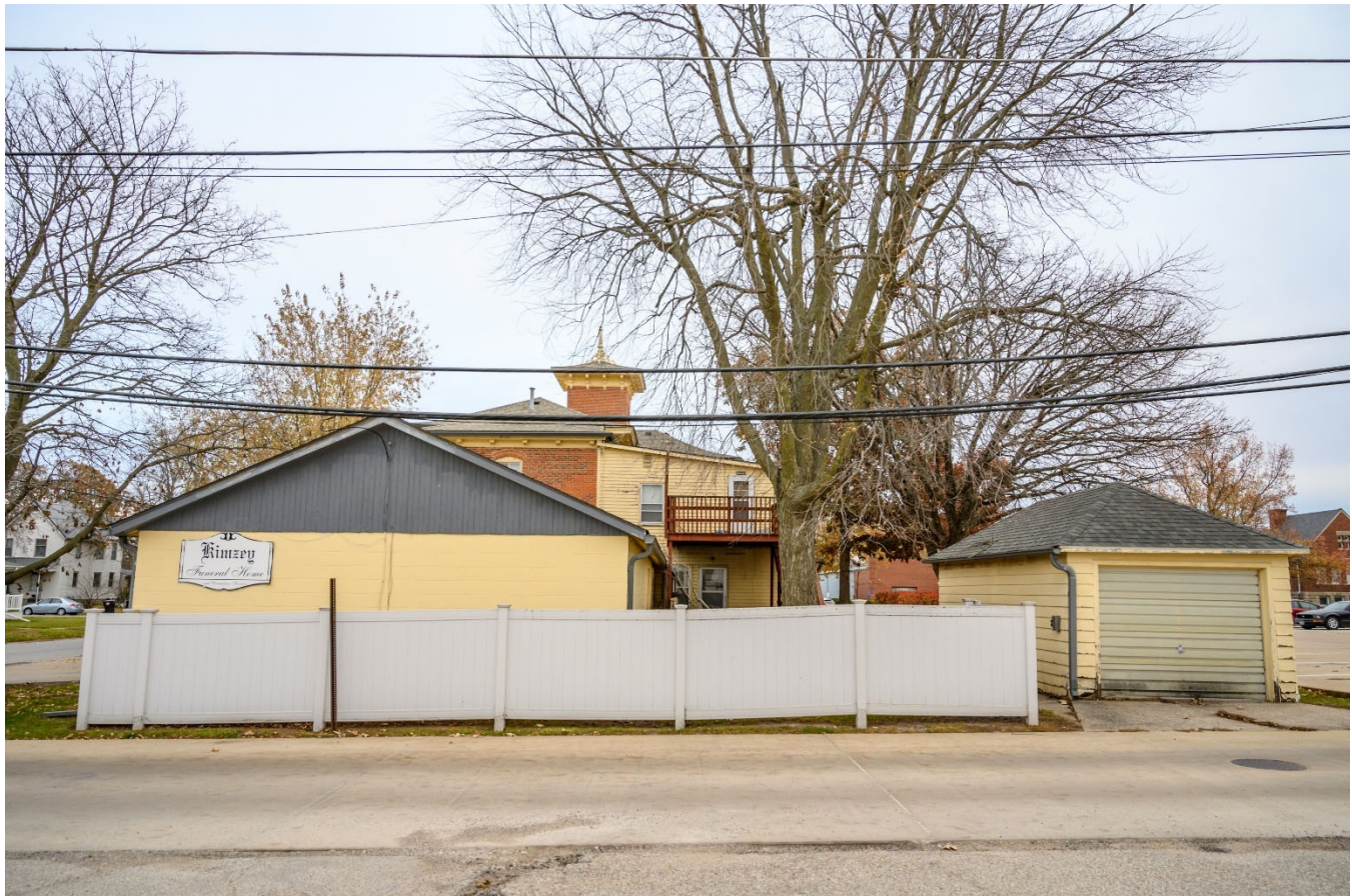
Photograph 44-00259-006. West elevation, looking east (October 2023)