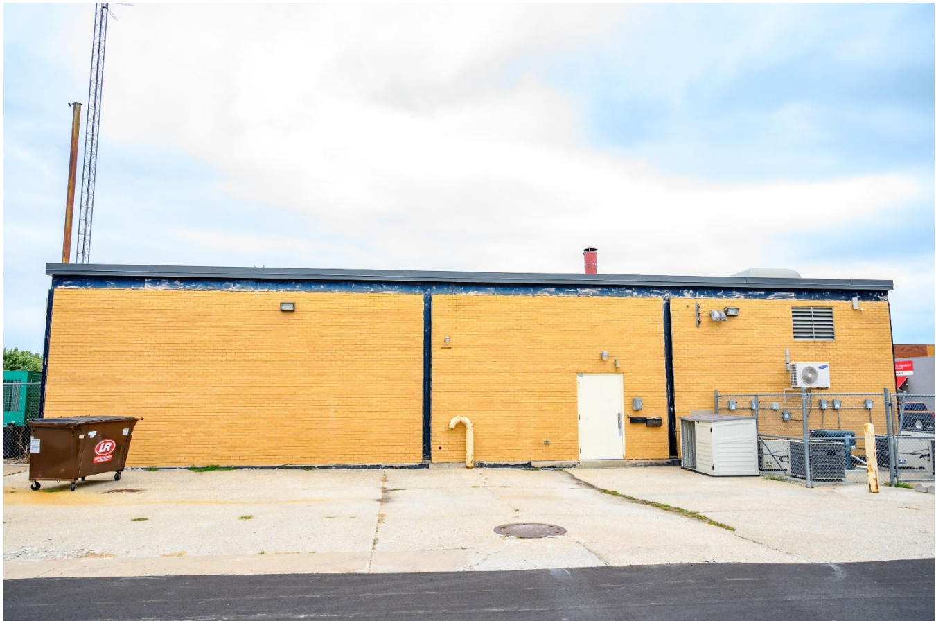
Photograph 44-02252-002. West elevation, looking east (October 2023)