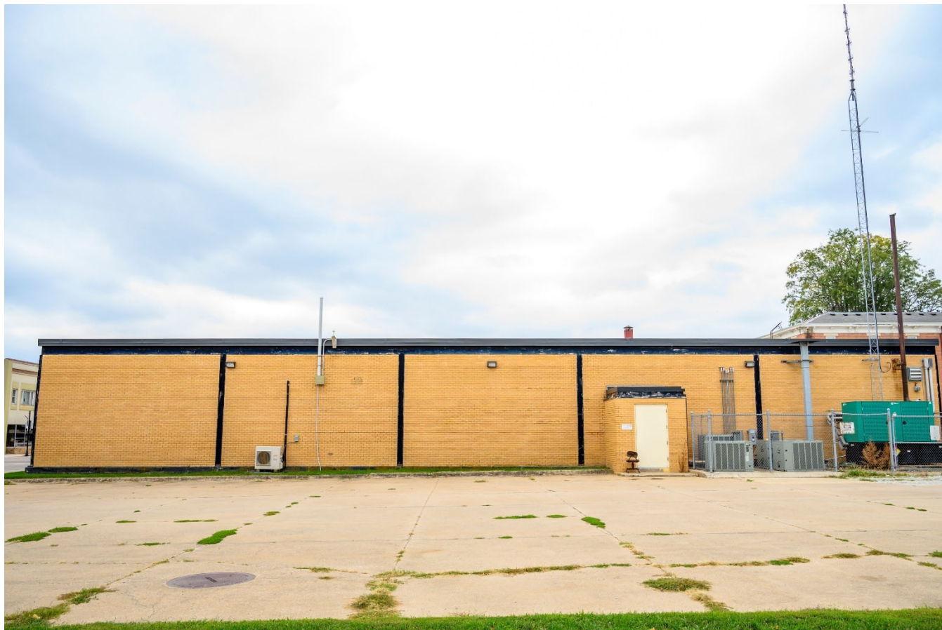
Photograph 44-02252-003. North elevation, looking south (October 2023)