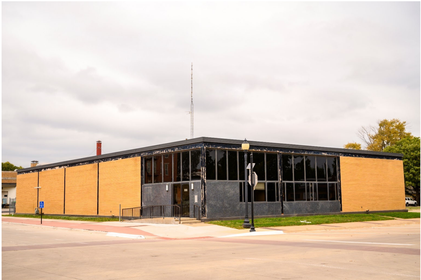
Photograph 44-02252-001. South and east elevations, looking northwest (October 2023)