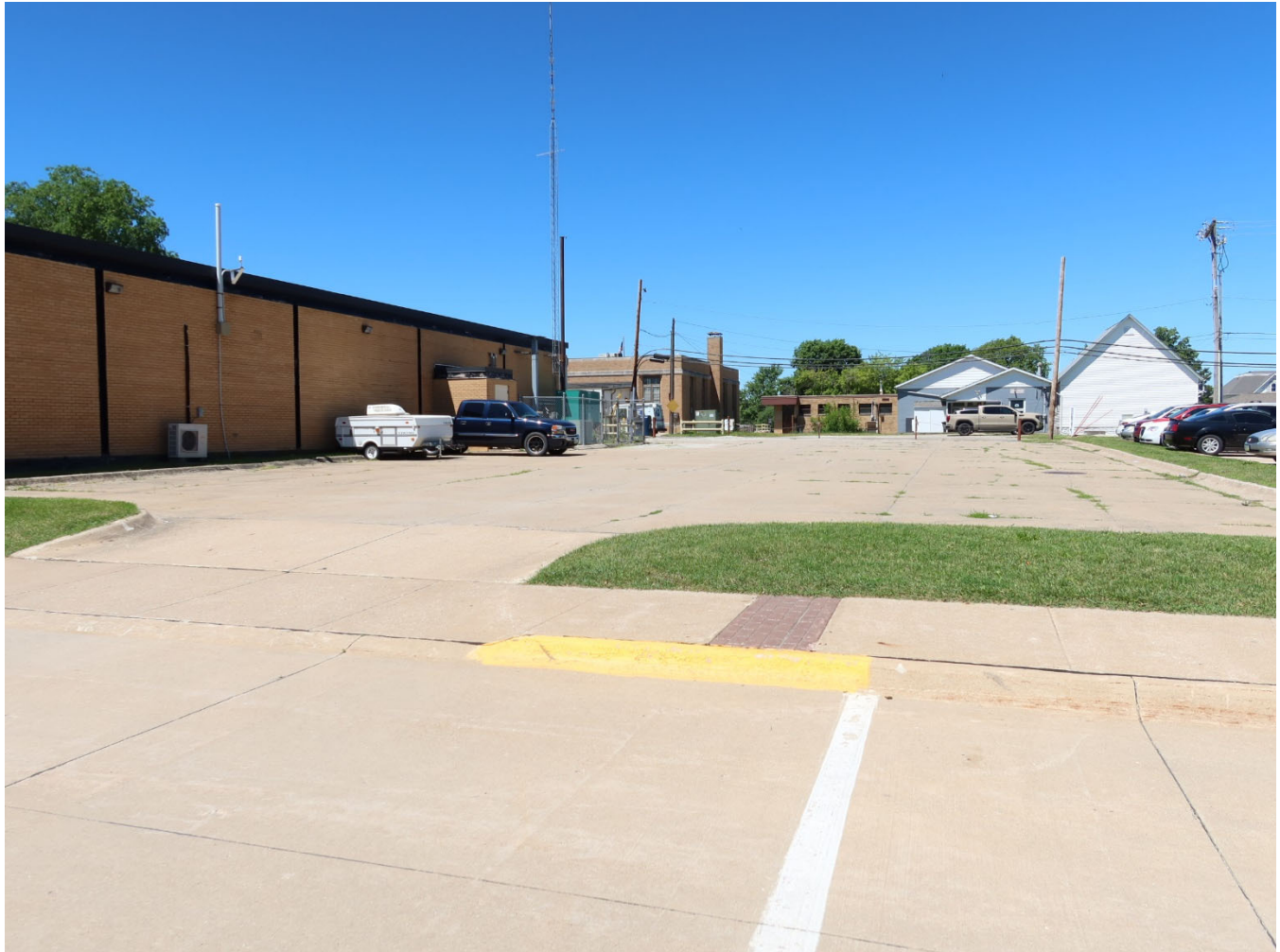
Photograph 44-02252-004. Parking lot, looking west (October 2023)