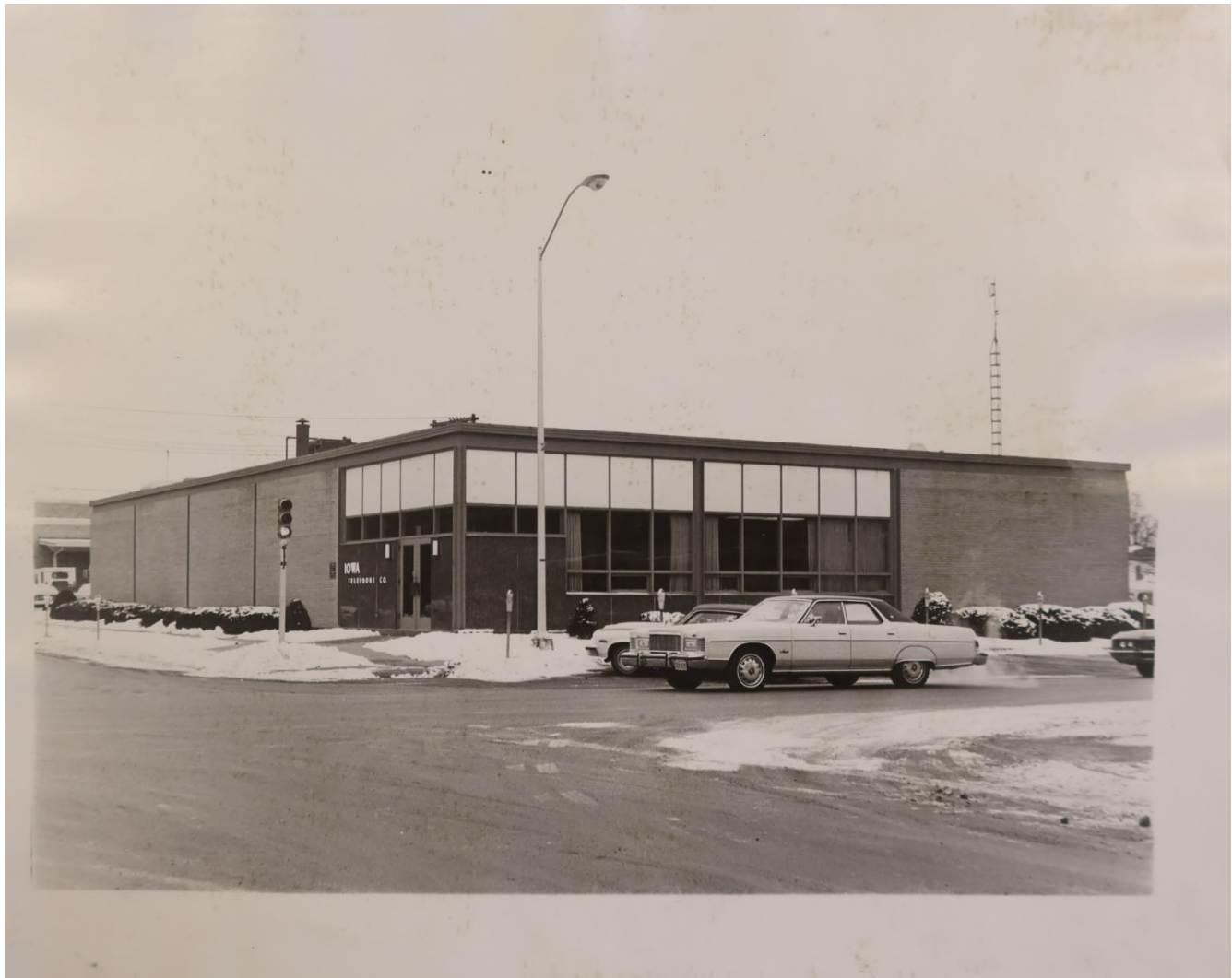
Building around 1968