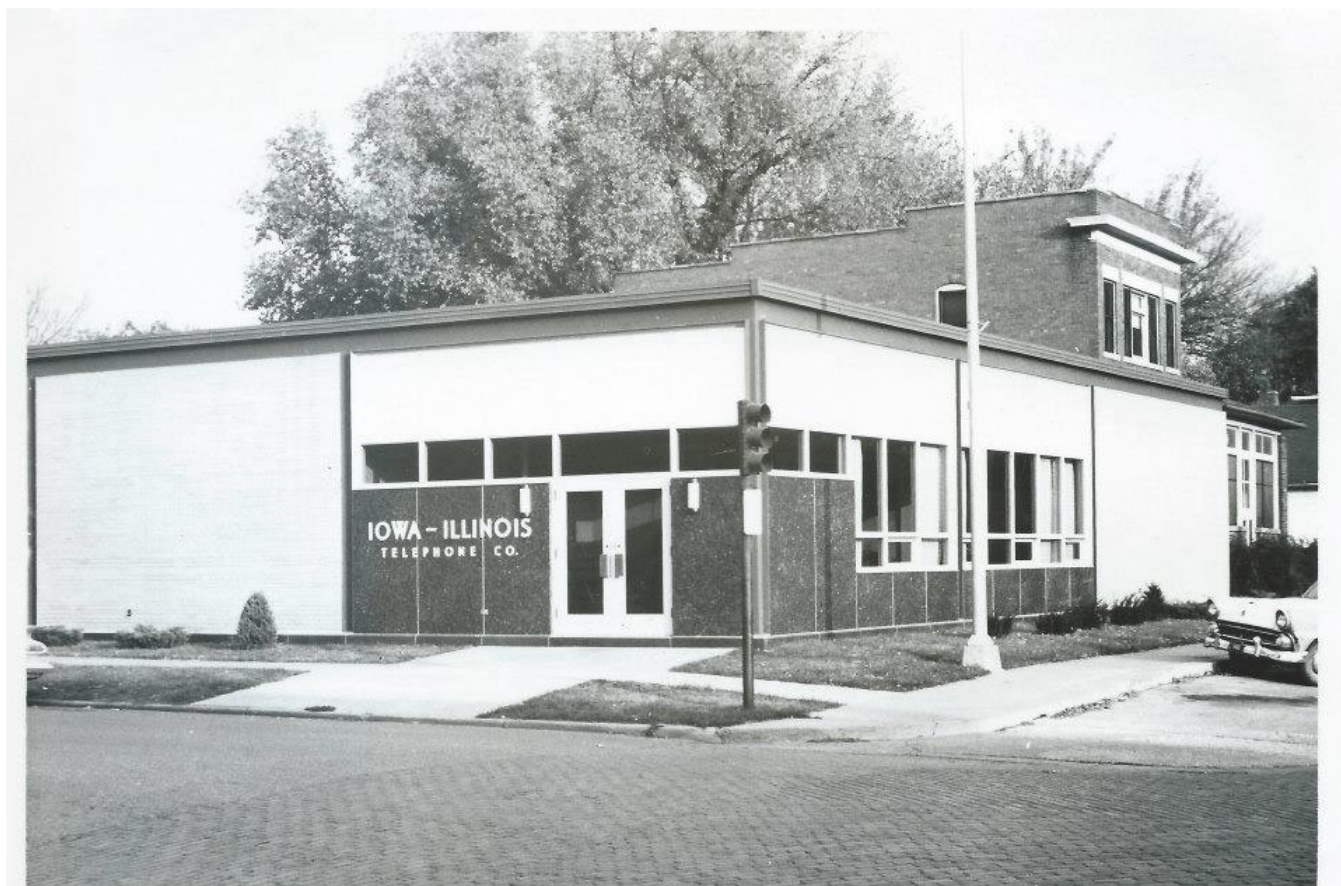
Iowa-Illinois Telephone Co building, with older 1913 telephone company building still standing to north