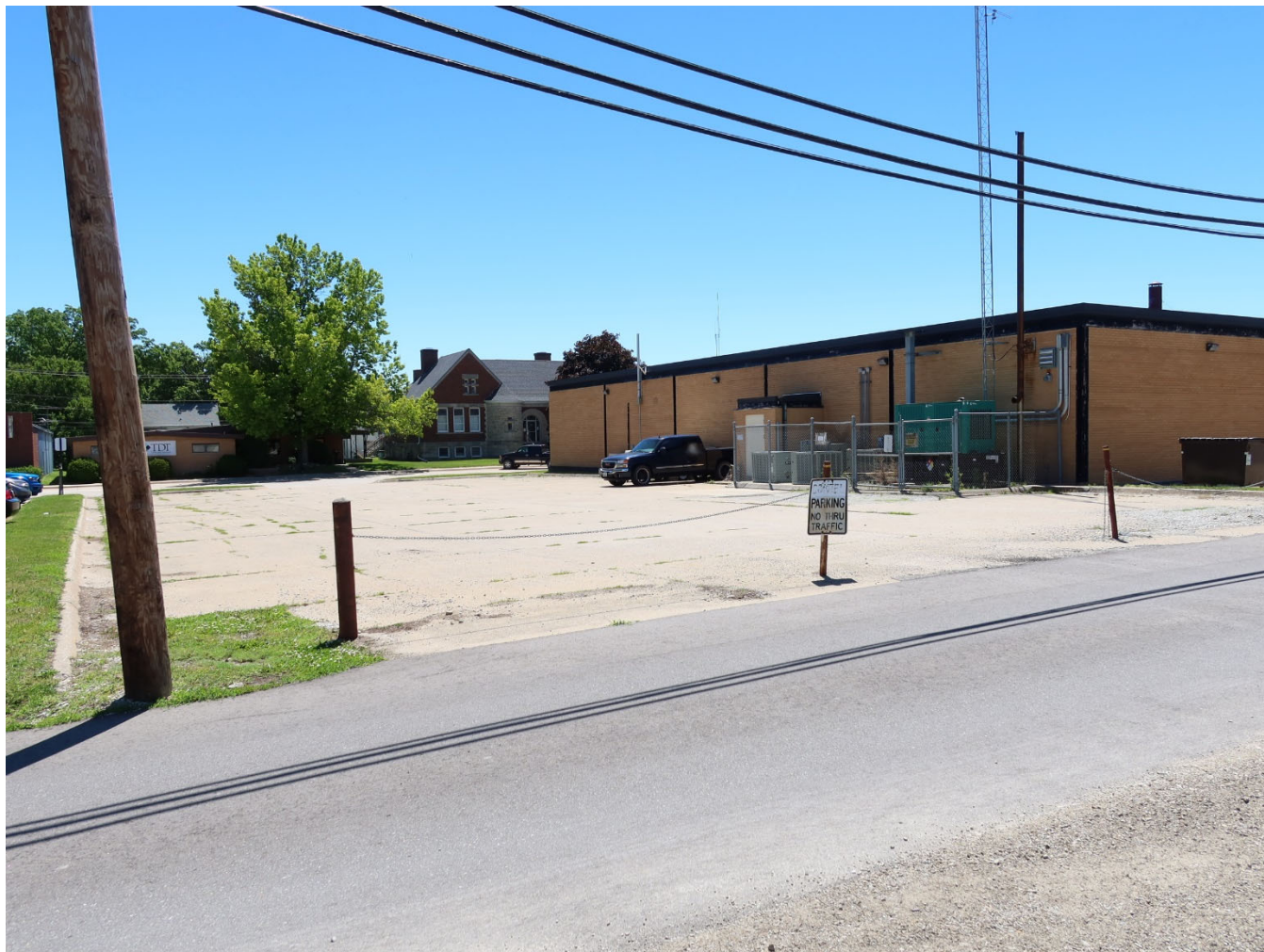
Photograph 44-02252-005. Parking lot, looking southeast (October 2023)