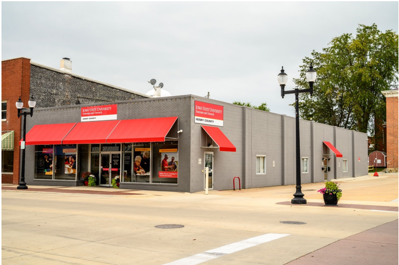
Photograph 44-00254-001. East and north elevations, looking southwest (October 2023)