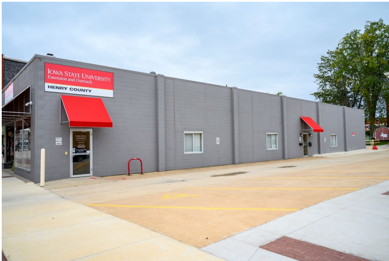
Photograph 44-00254-003. North elevation, looking southwest (October 2023)