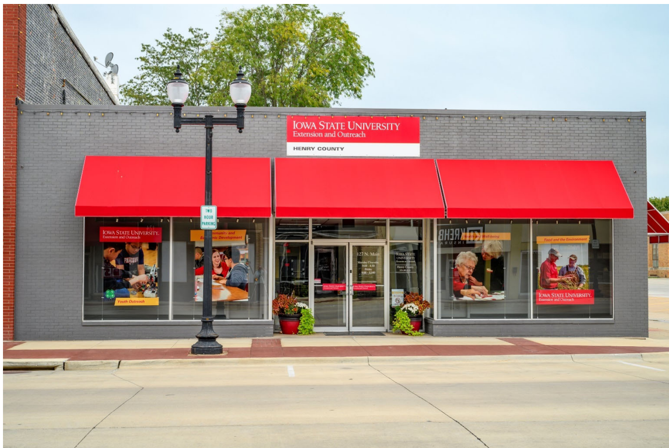
Photograph 44-00254-02. East elevation, looking west (October 2023)