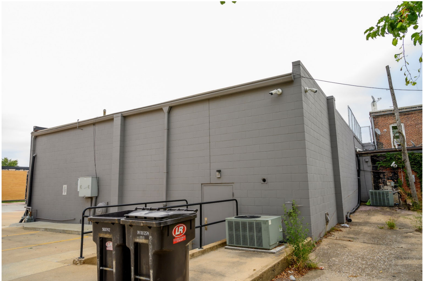
Photograph 44-00254-004. West and south elevations, looking northeast (October 2023)