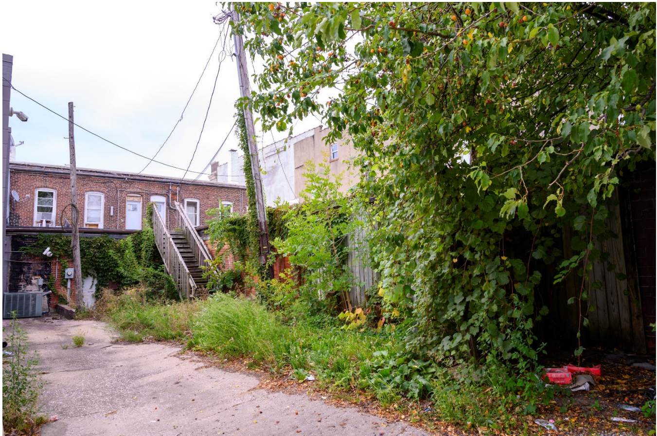
Photograph 44-00251-003. West elevation, looking southeast (October 2023)