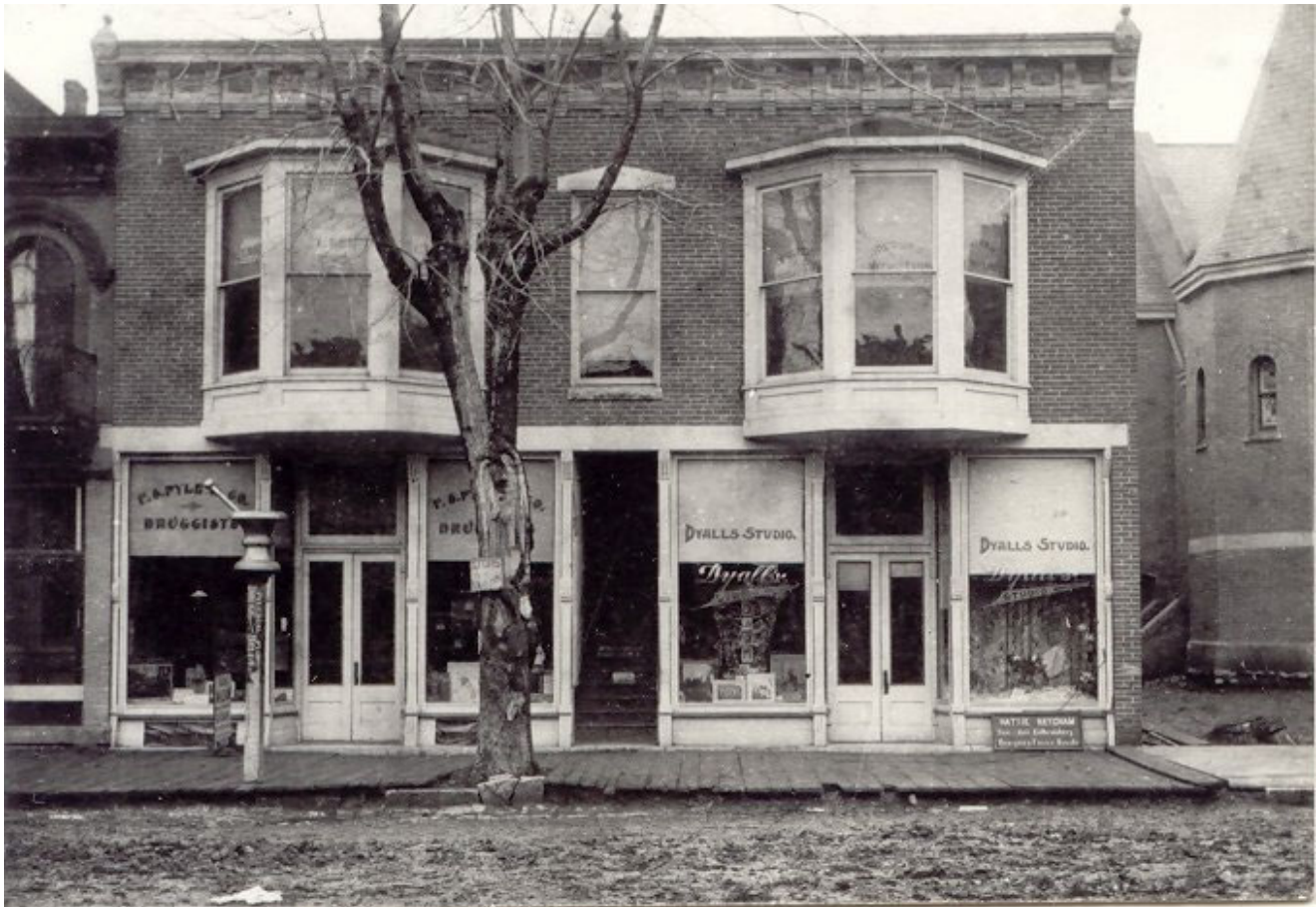
Building soon after completion in 1895