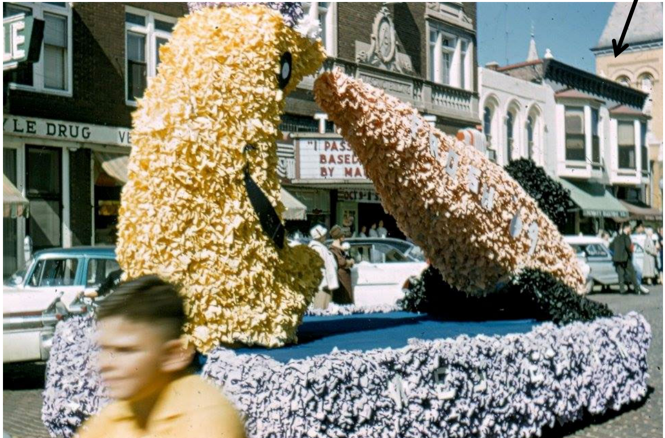
Building around 1960