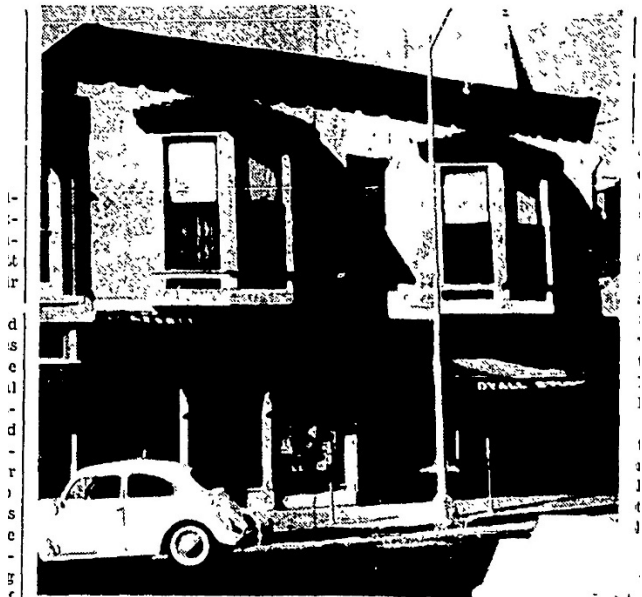
Before . . . . .

Dyall Building Henry Name of Property County 121-123 N. Main St Mount Pleasant Address City