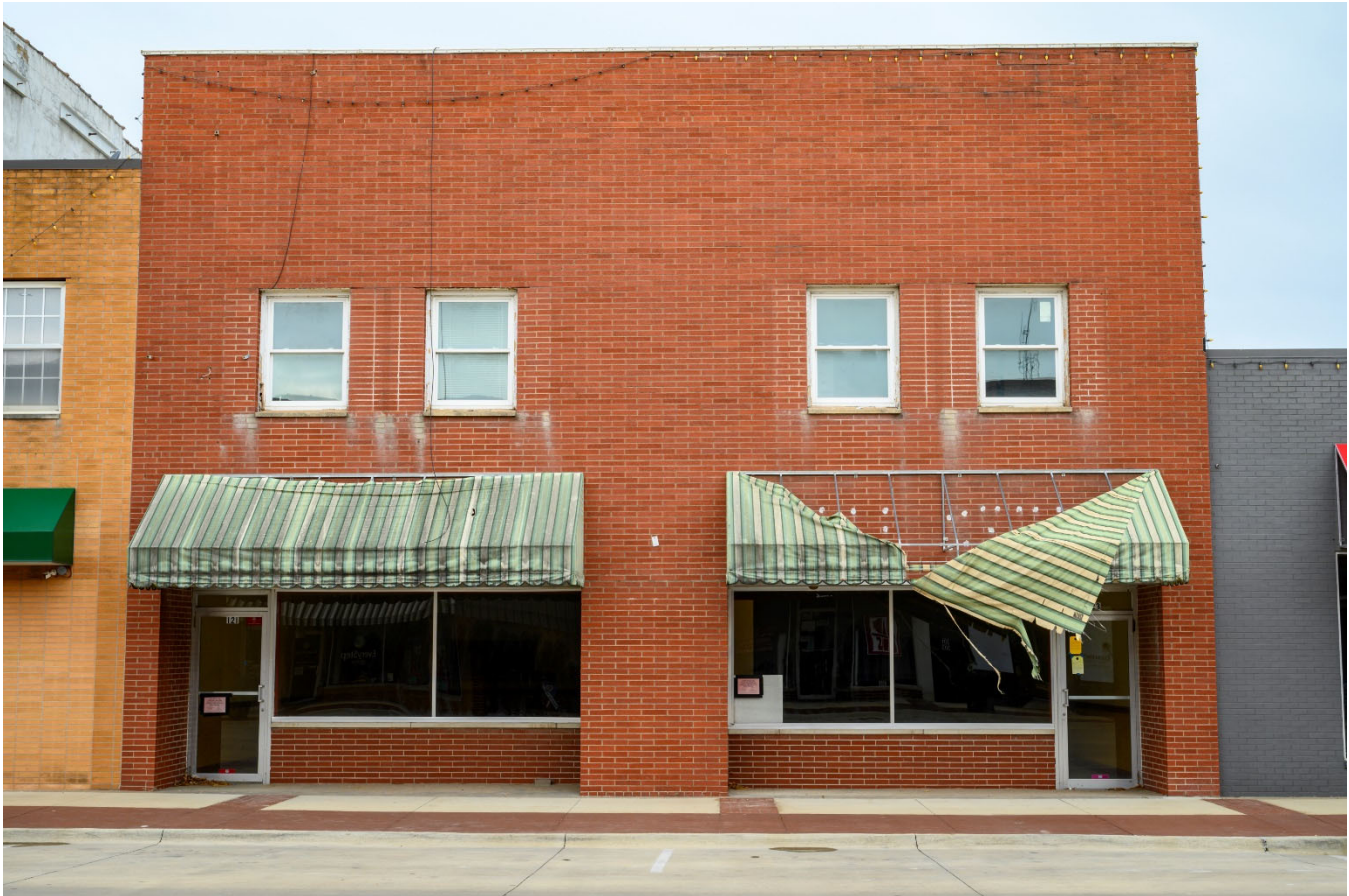
Photograph 44-00251-001. East elevation, looking west (October 2023)