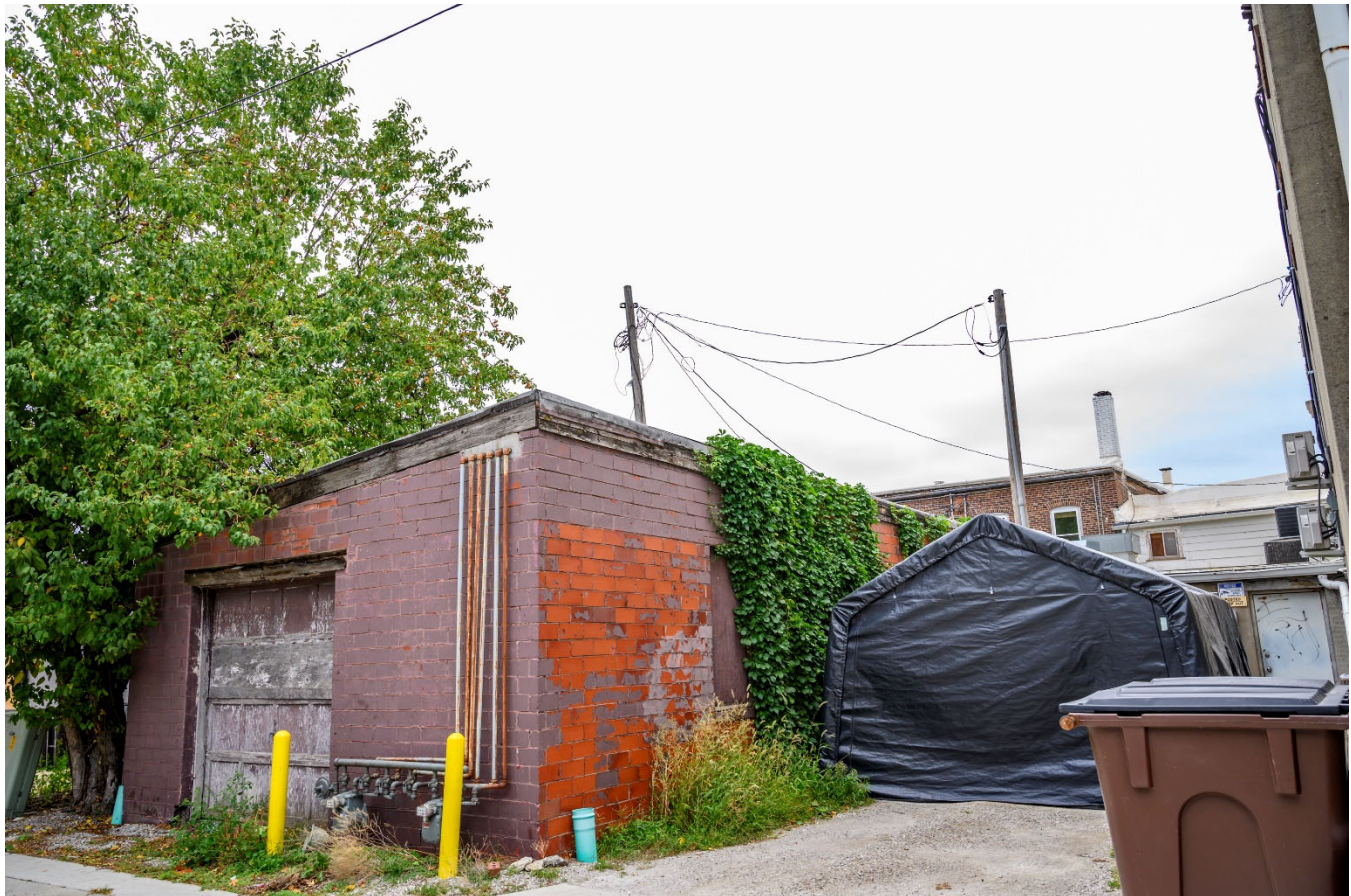
Photograph 44-00251-002. West and south elevations, looking northeast (October 2023)