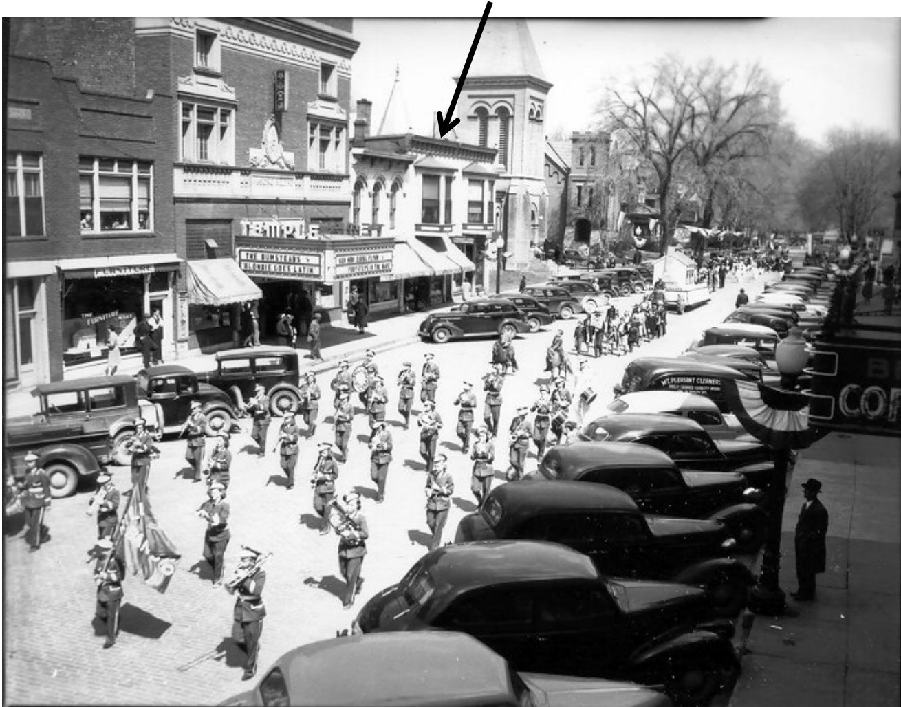
Building in 1941