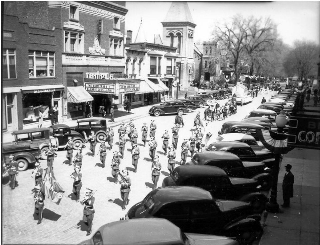
Building at left in 1941 (HCHT Facebook album)