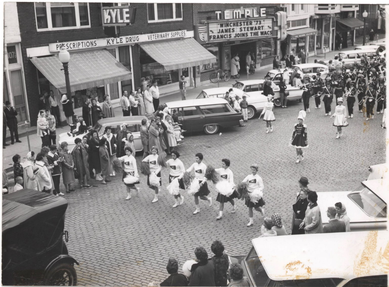
Building around 1962