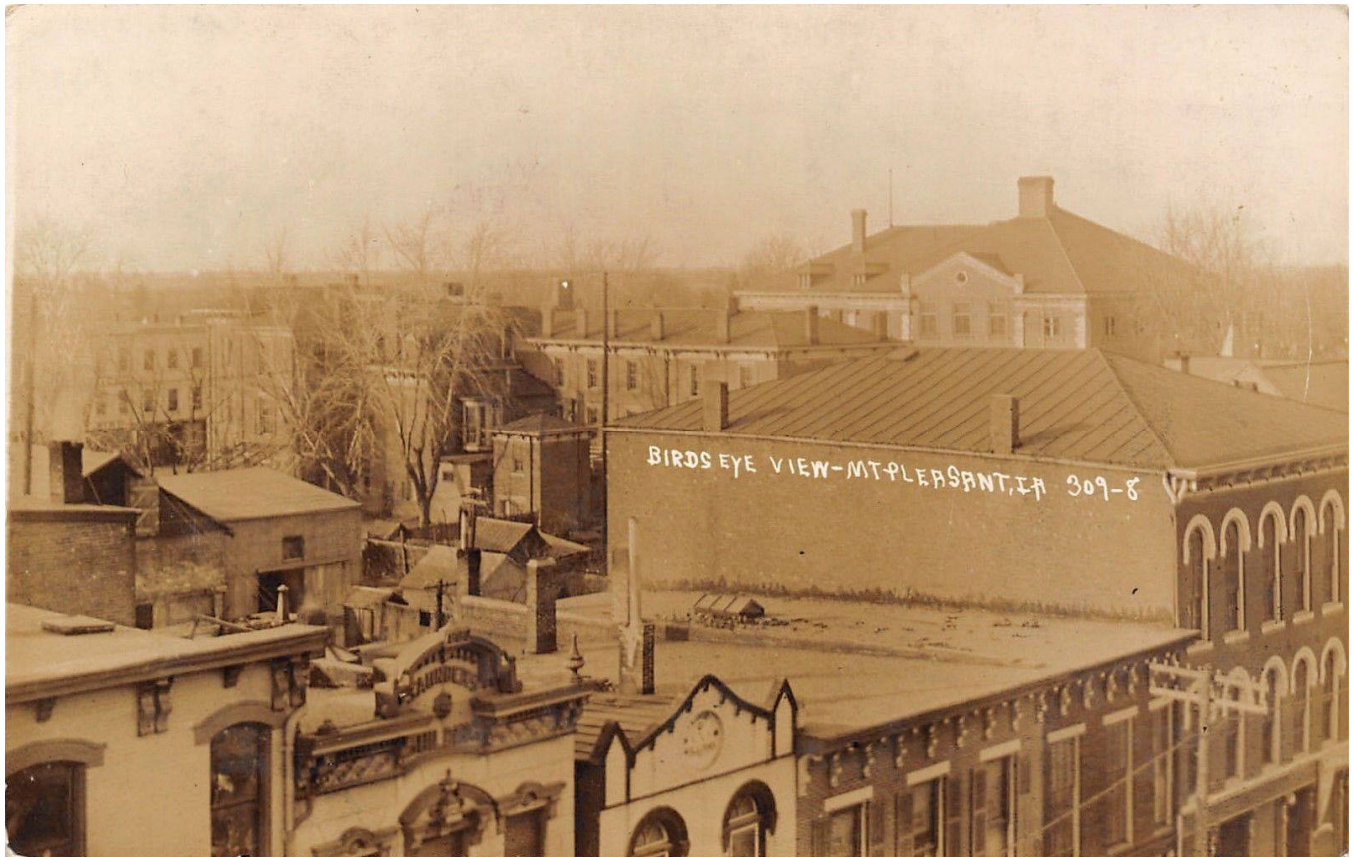
Three-story building visible at right