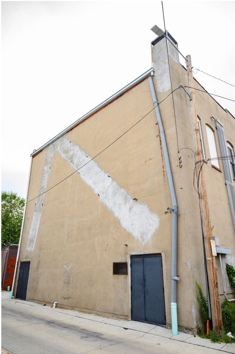
Photograph 44-00246-004. West elevation, looking northeast (October 2023)