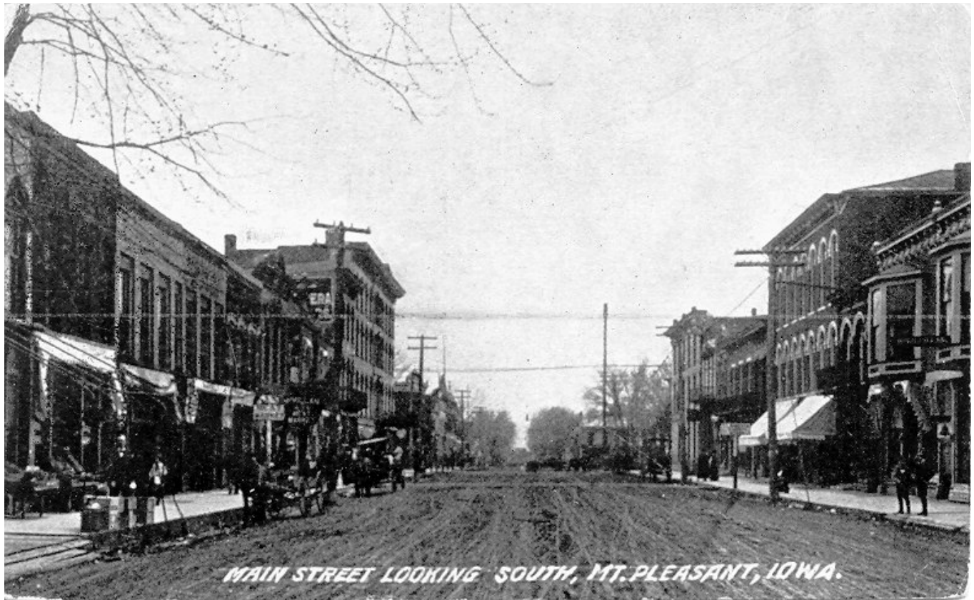
Three-story building on right in 100 block of N. Main St in 1900s