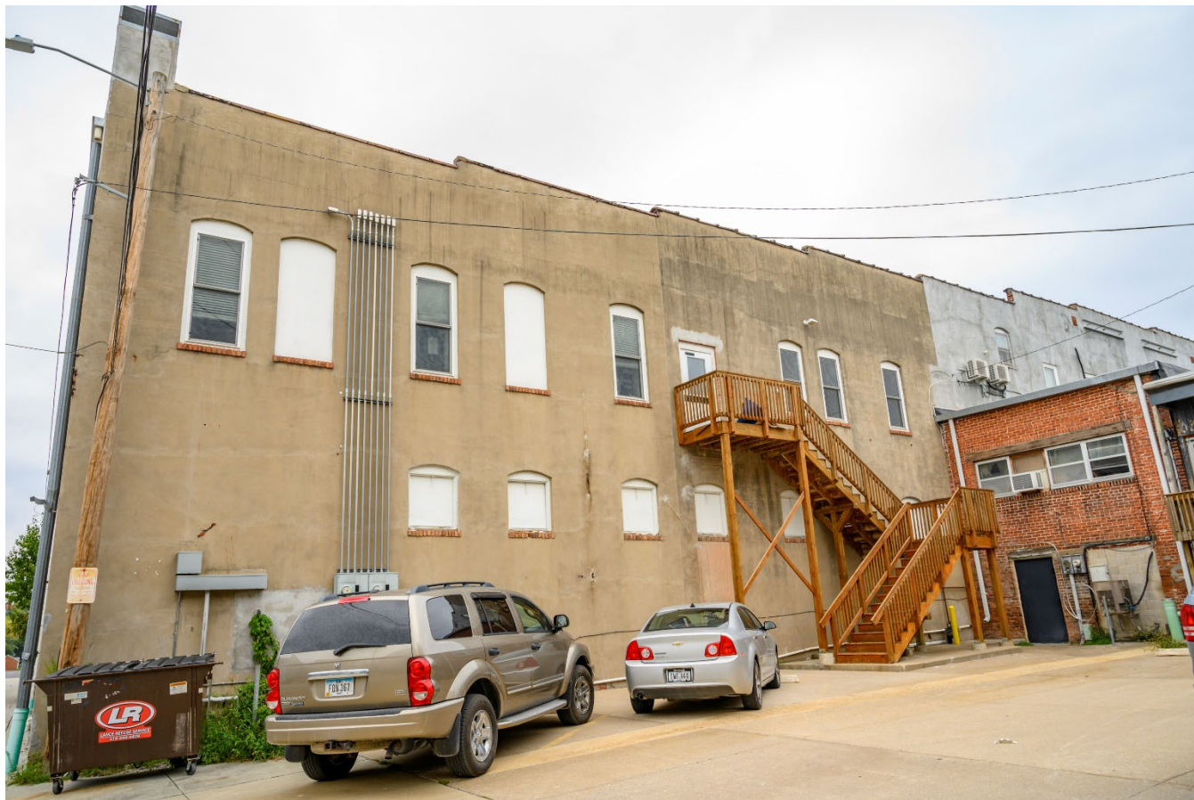
Photograph 44-00246-002. South elevation, looking north (October 2023)