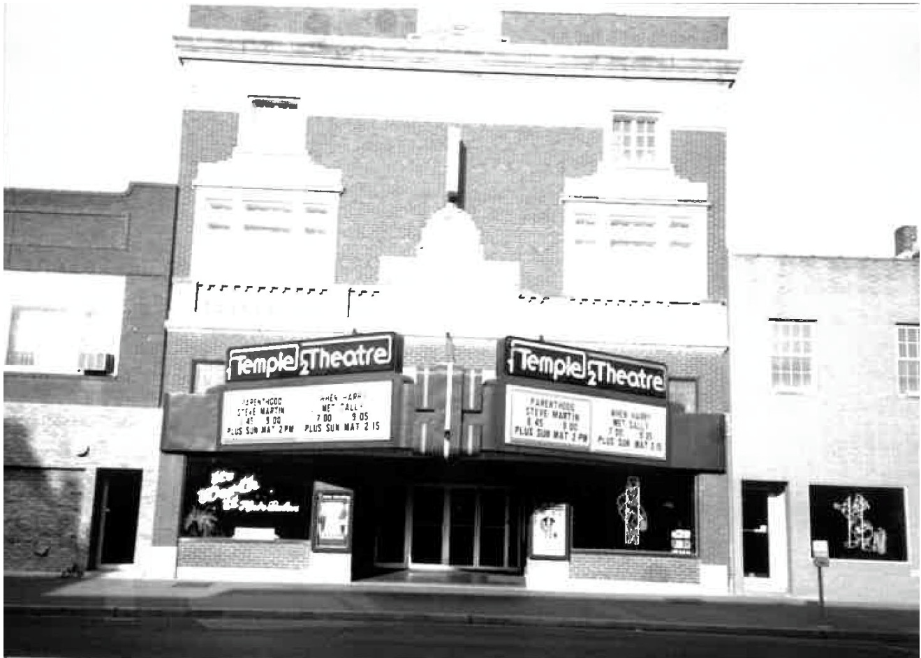
1990 survey photograph (Naumann 1991)