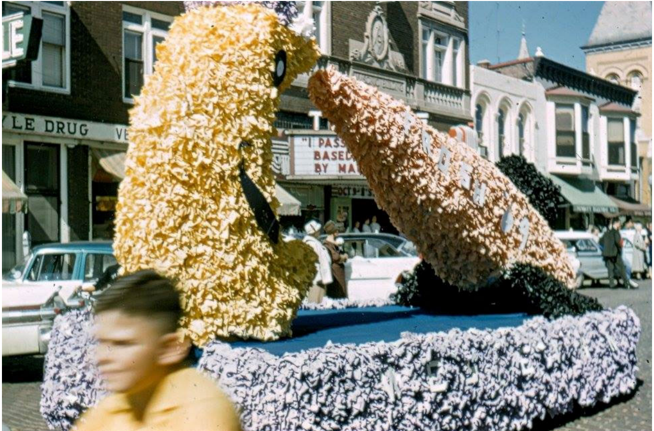
Building around 1960