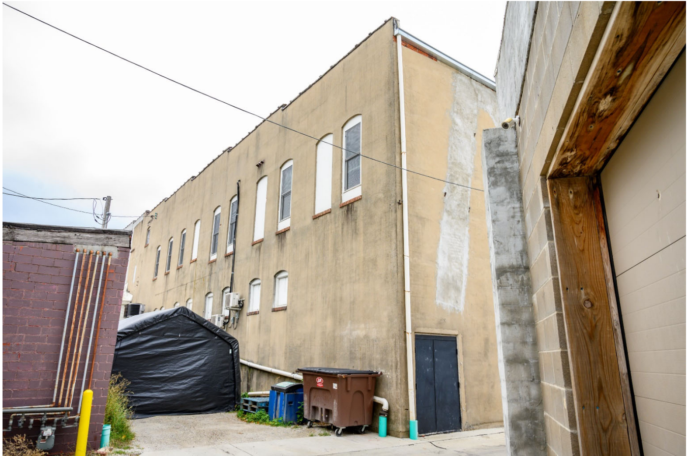
Photograph 44-00246-003. North elevation, looking southeast (October 2023)