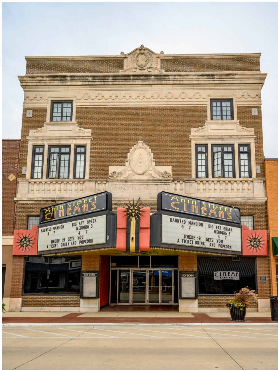
Photograph 44-00246-001. East elevation, looking west (October 2023)