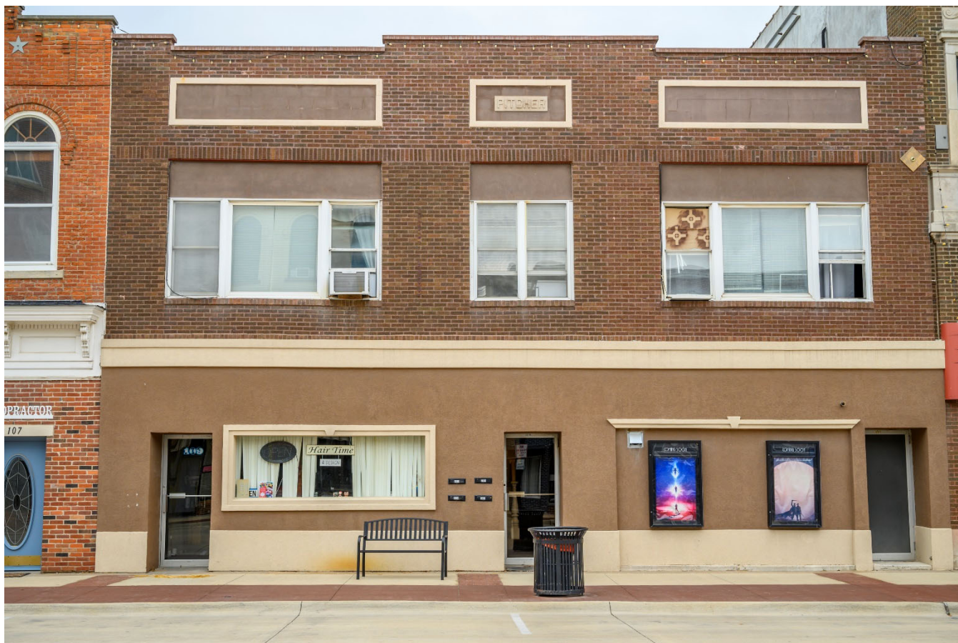
Photograph 44-00242-001. East elevation, looking west (October 2023)