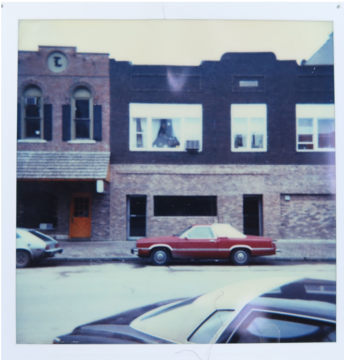
Photograph included in application for sign permit for 109 N. Main St in March 1982 (City of Mt Pleasant building permits)