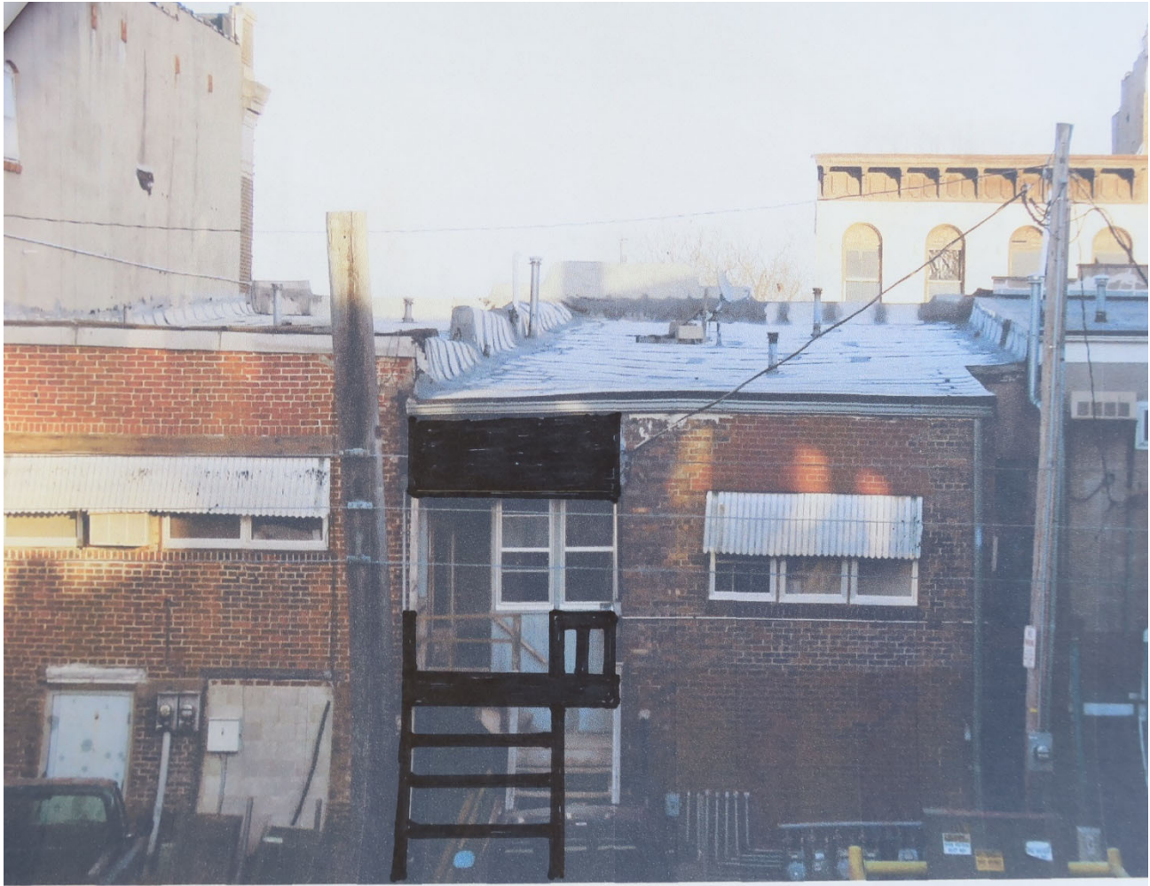
Rear of building in 2006 – 111 at left and 109 at center/right – different rooflines visible (City of Mt Pleasant building permits)