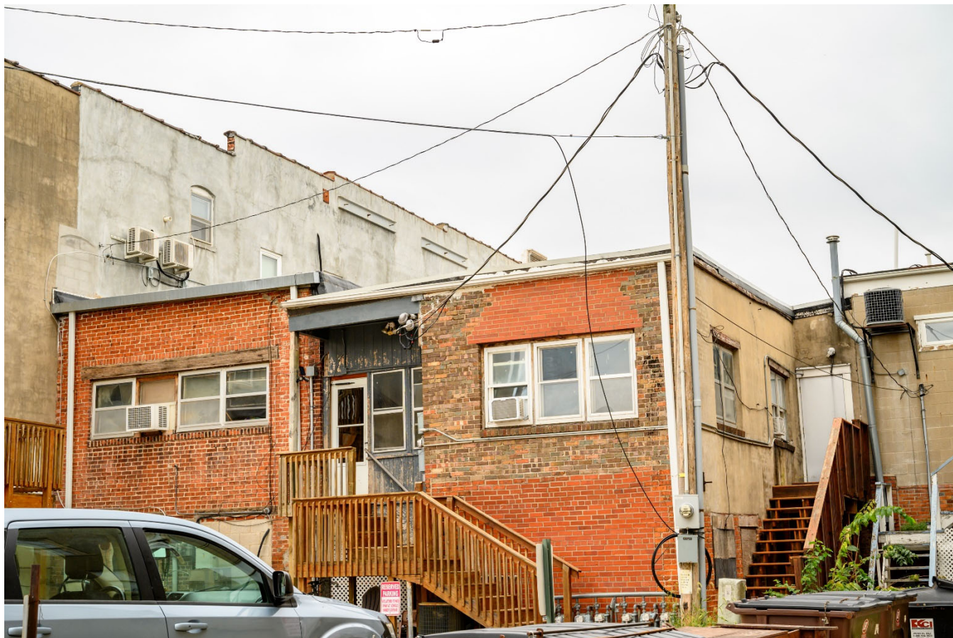
Photograph 44-00242-002. West elevation, looking northeast (October 2023)