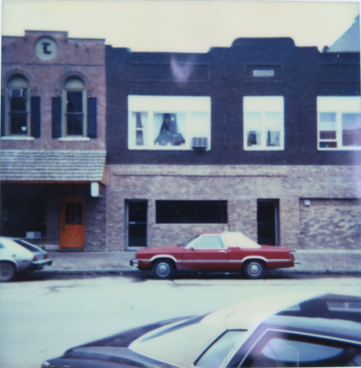
Building at left showing remodeling work completed in 1973 in application for sign permit for 109 N. Main St in March 1982 (City of Mt Pleasant building permits)