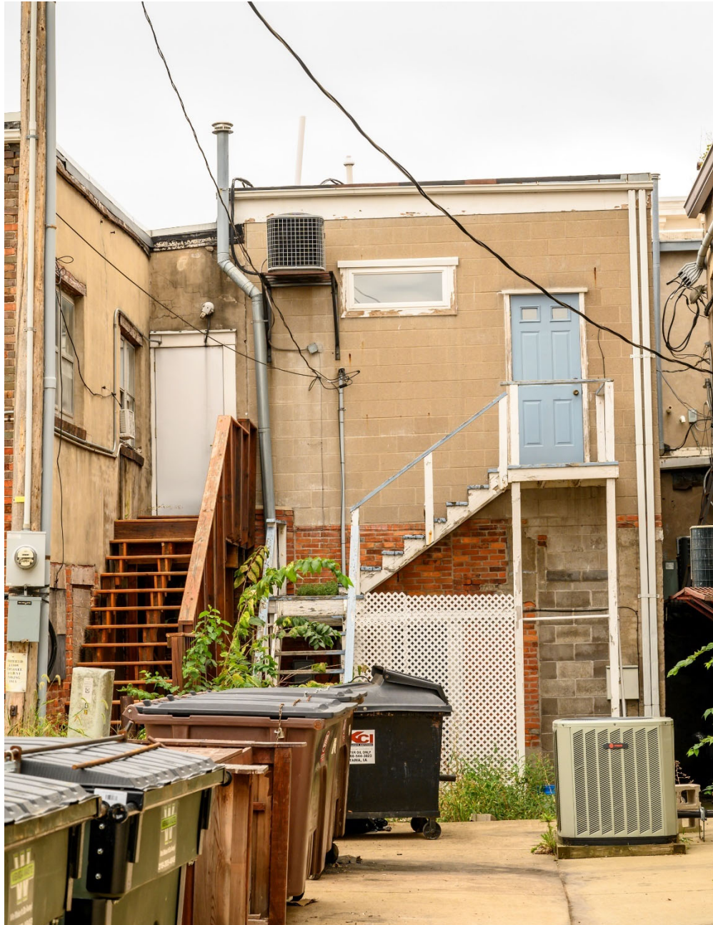
Photograph 44-00241-002. West elevation, looking east (October 2023)