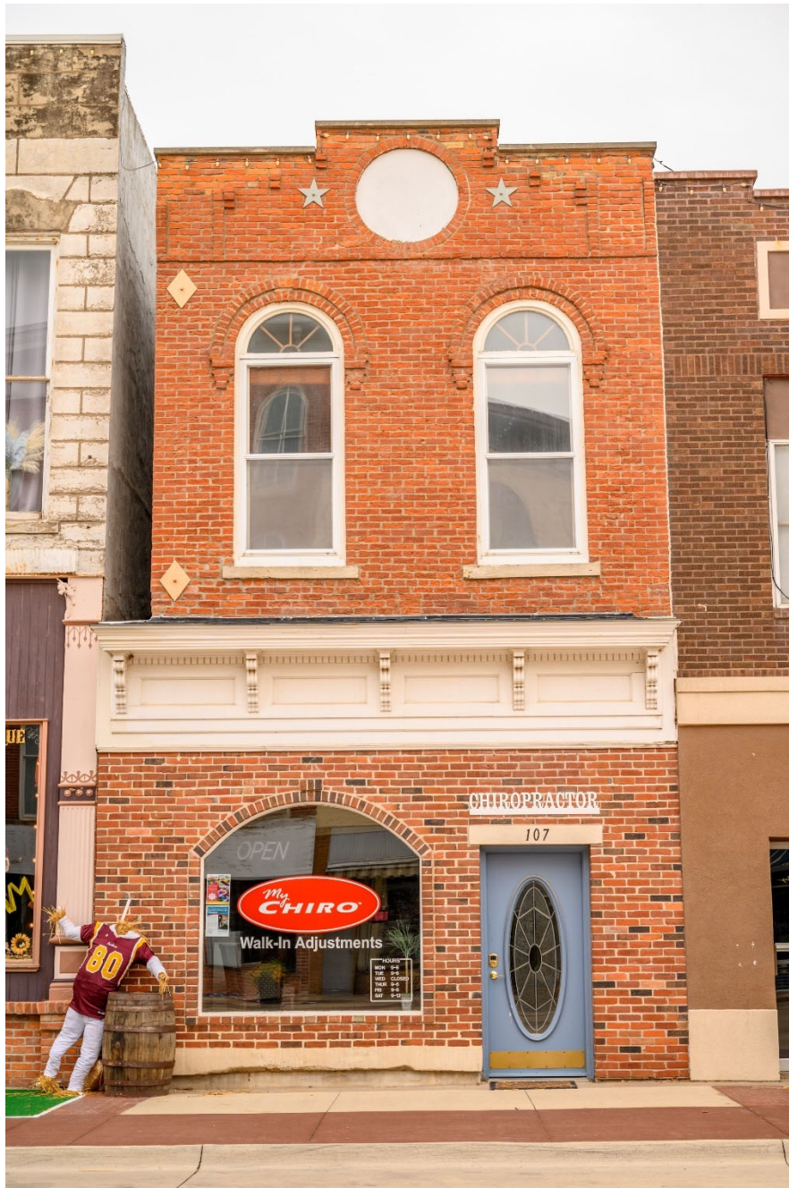
Photograph 44-00241-001. East elevation, looking west (October 2023)