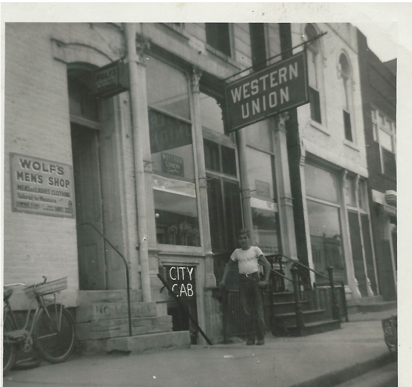
Building next to Western Union in 1938