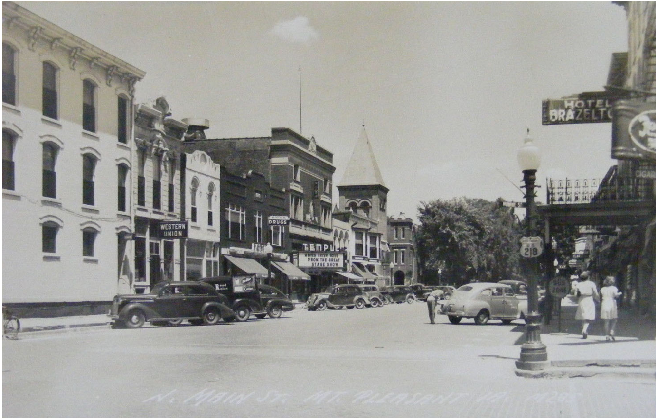
West side of 100 block of N. Main St in late 1940s