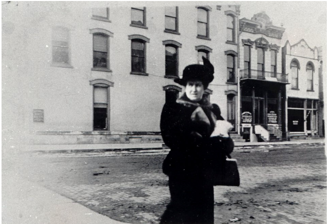
View of building at 105 N. Main St