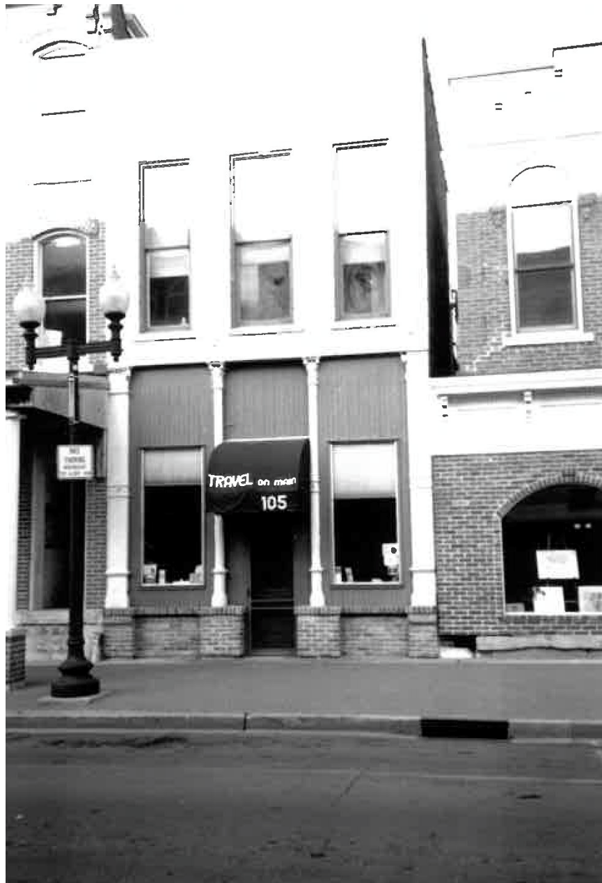
1990 survey photograph (Naumann 1991)