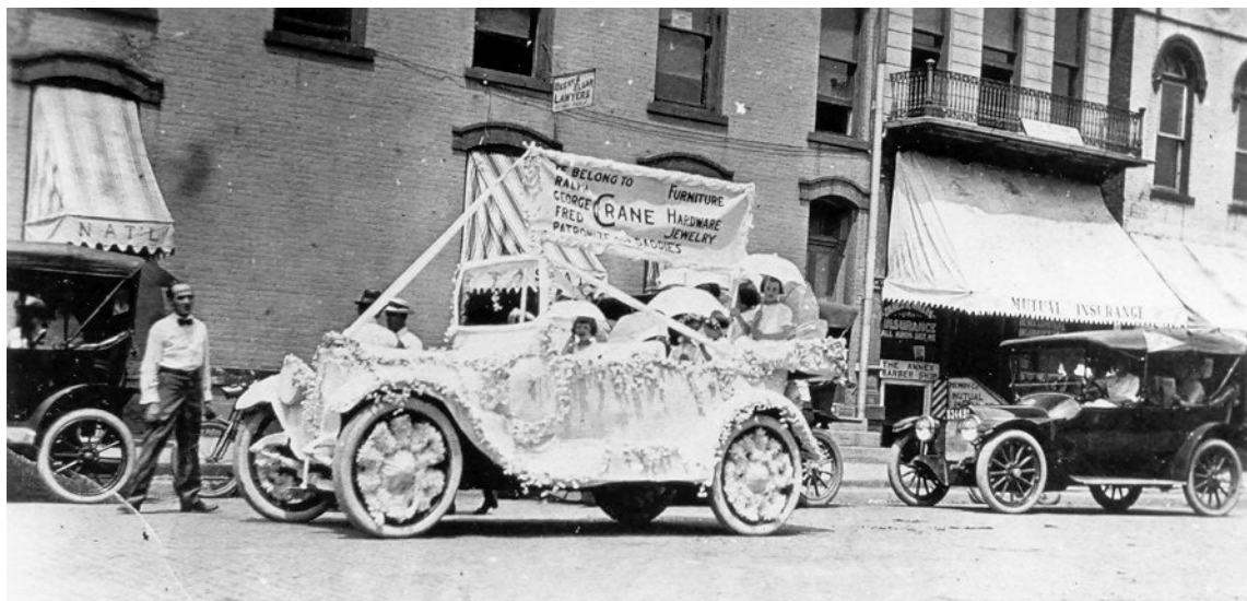
Building in 1916