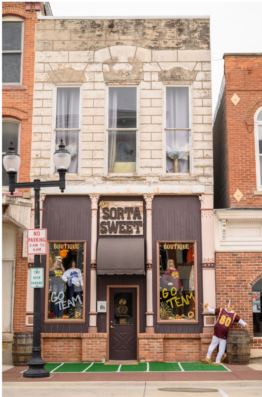
Photograph 44-00240-001. East elevation, looking west (October 2023)