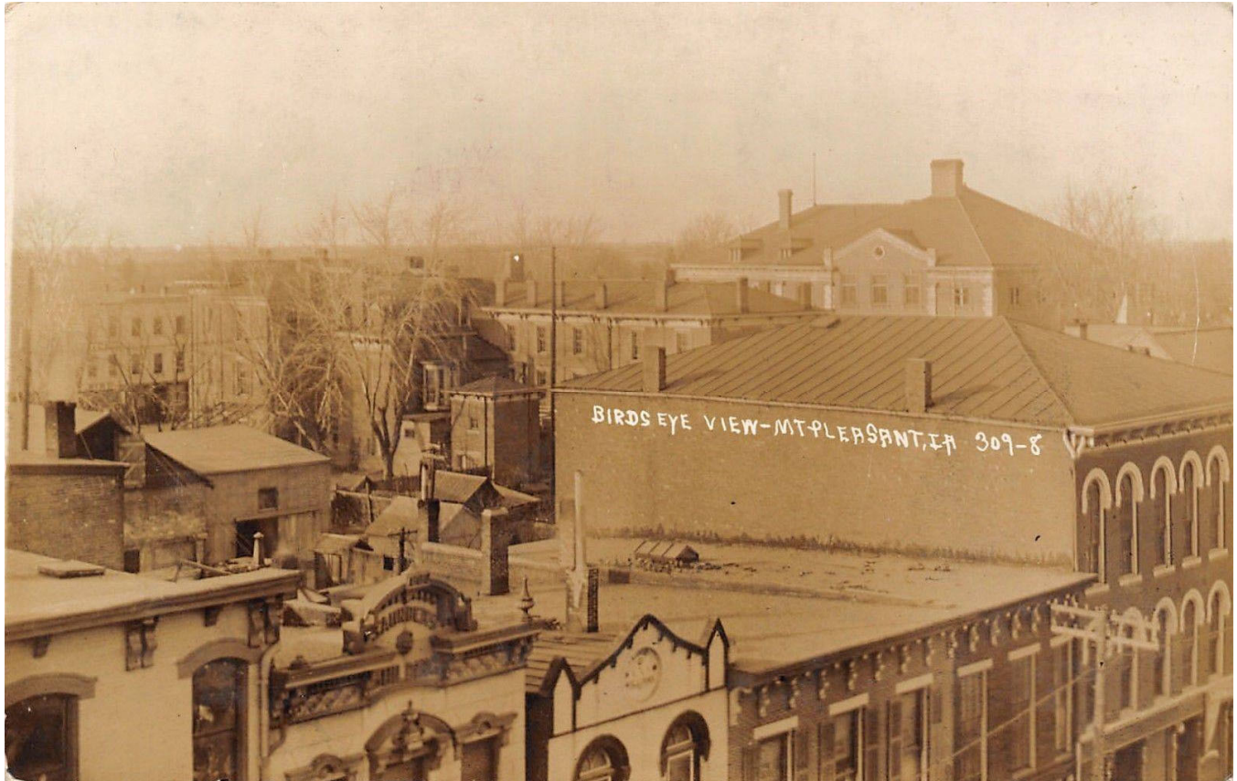
Cornice of building visible at lower left (HCHT Facebook album)