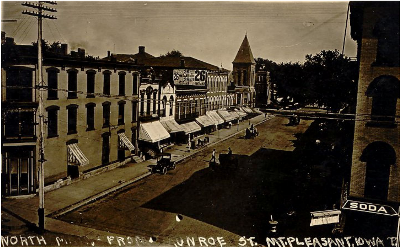
West side of 100 block of N. Main St in 1910s