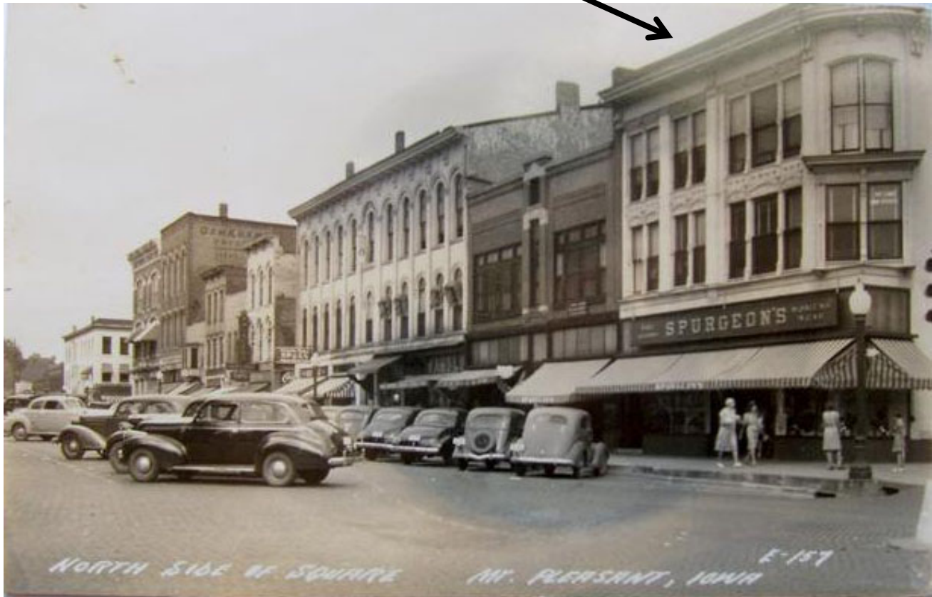
100 block of W. Monroe Street in the early 1940s