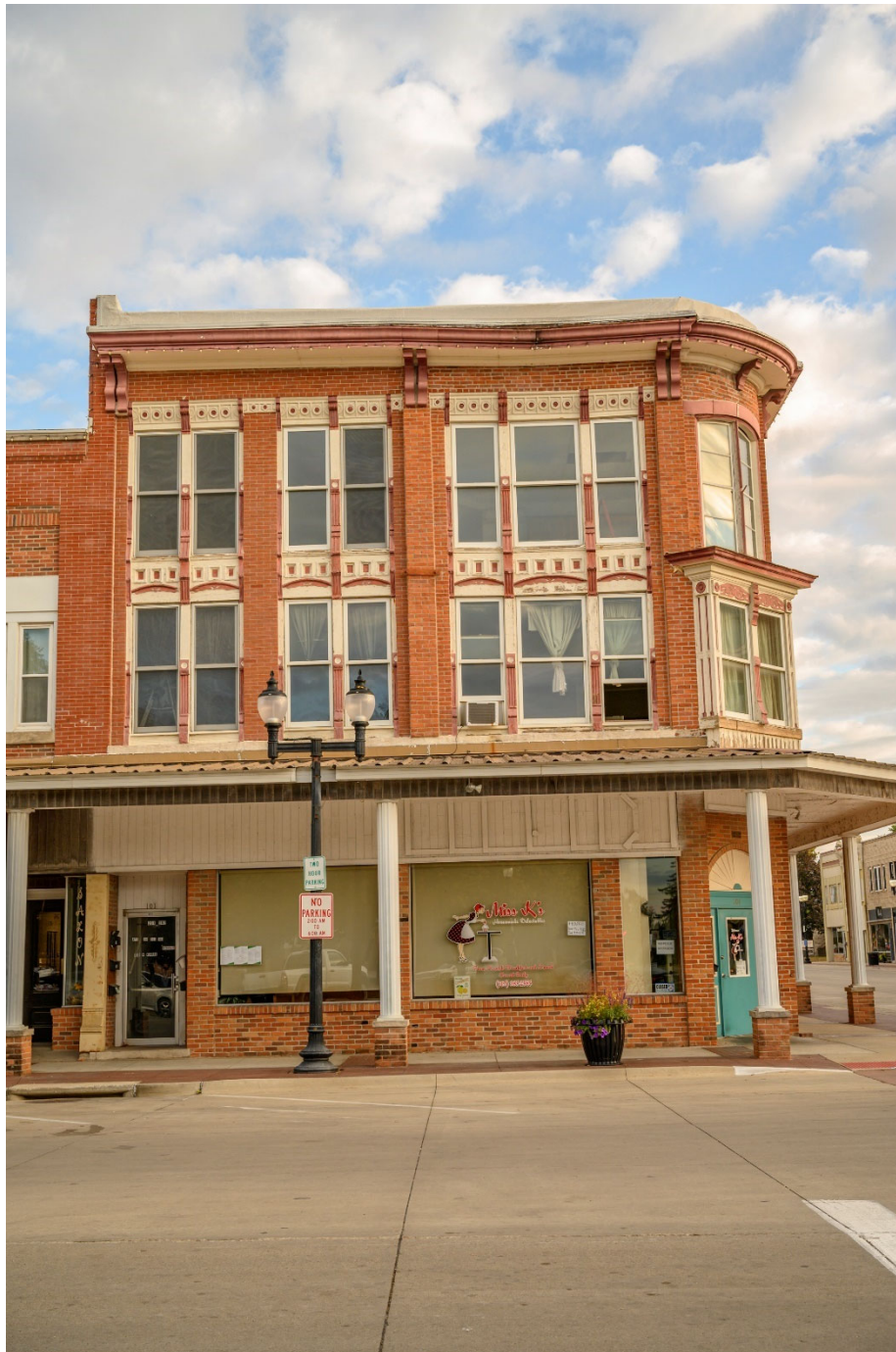
Photograph 44-00366-002. South elevation, looking north (October 2023)