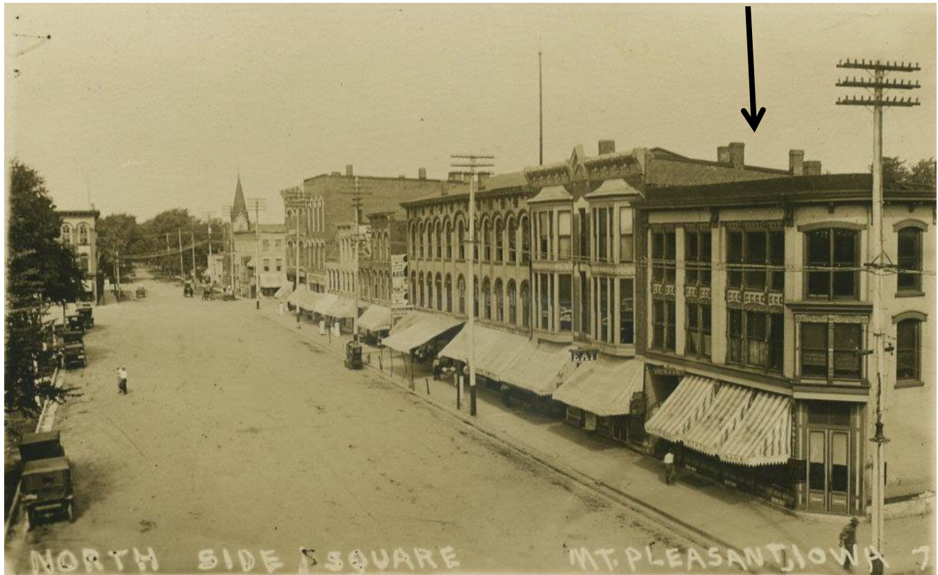
100 block of W. Monroe Street in the 1900s