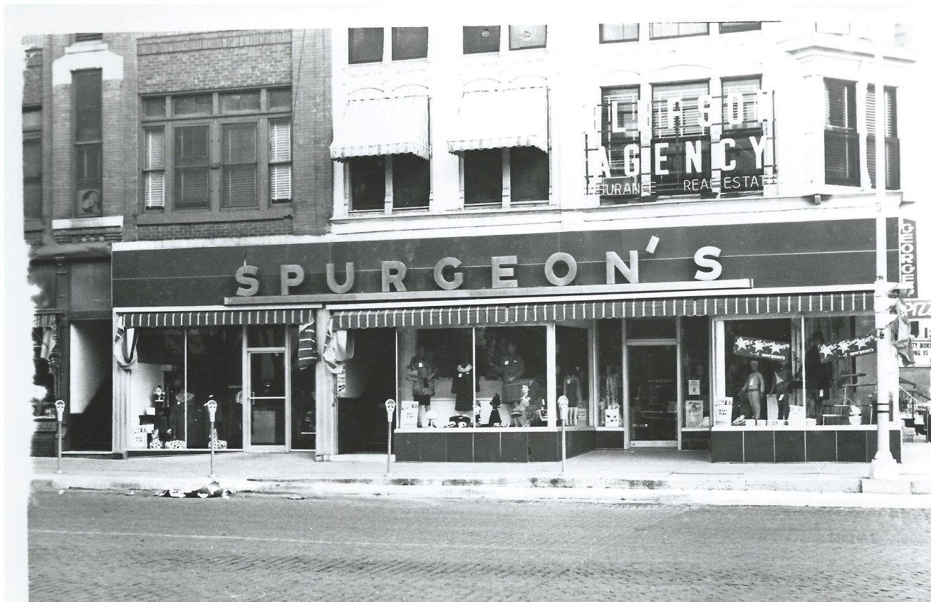
Spurgeon's around 1965 (HCHT Facebook album)