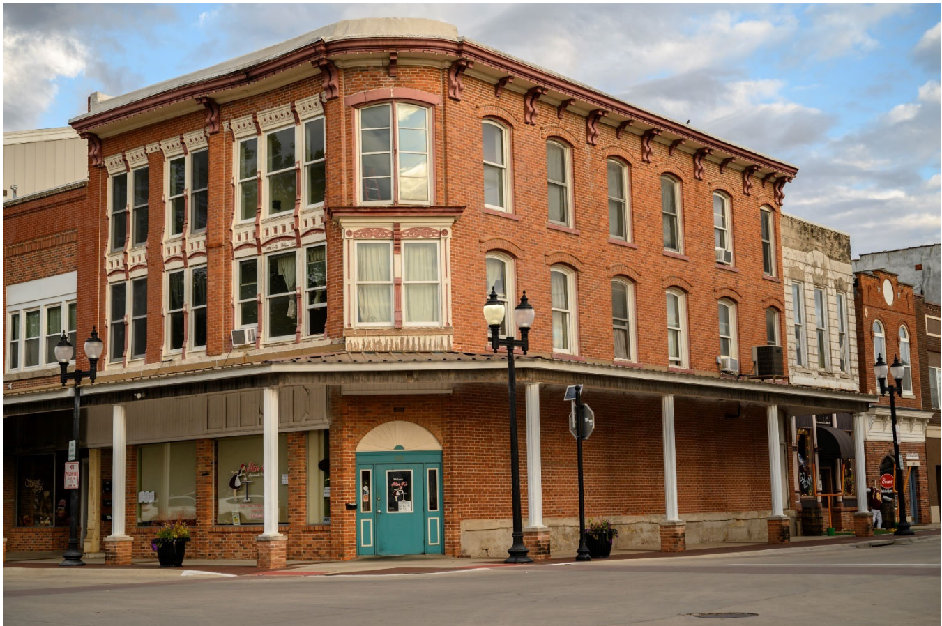
Photograph 44-00366-001. South and west elevations, looking northwest (October 2023)