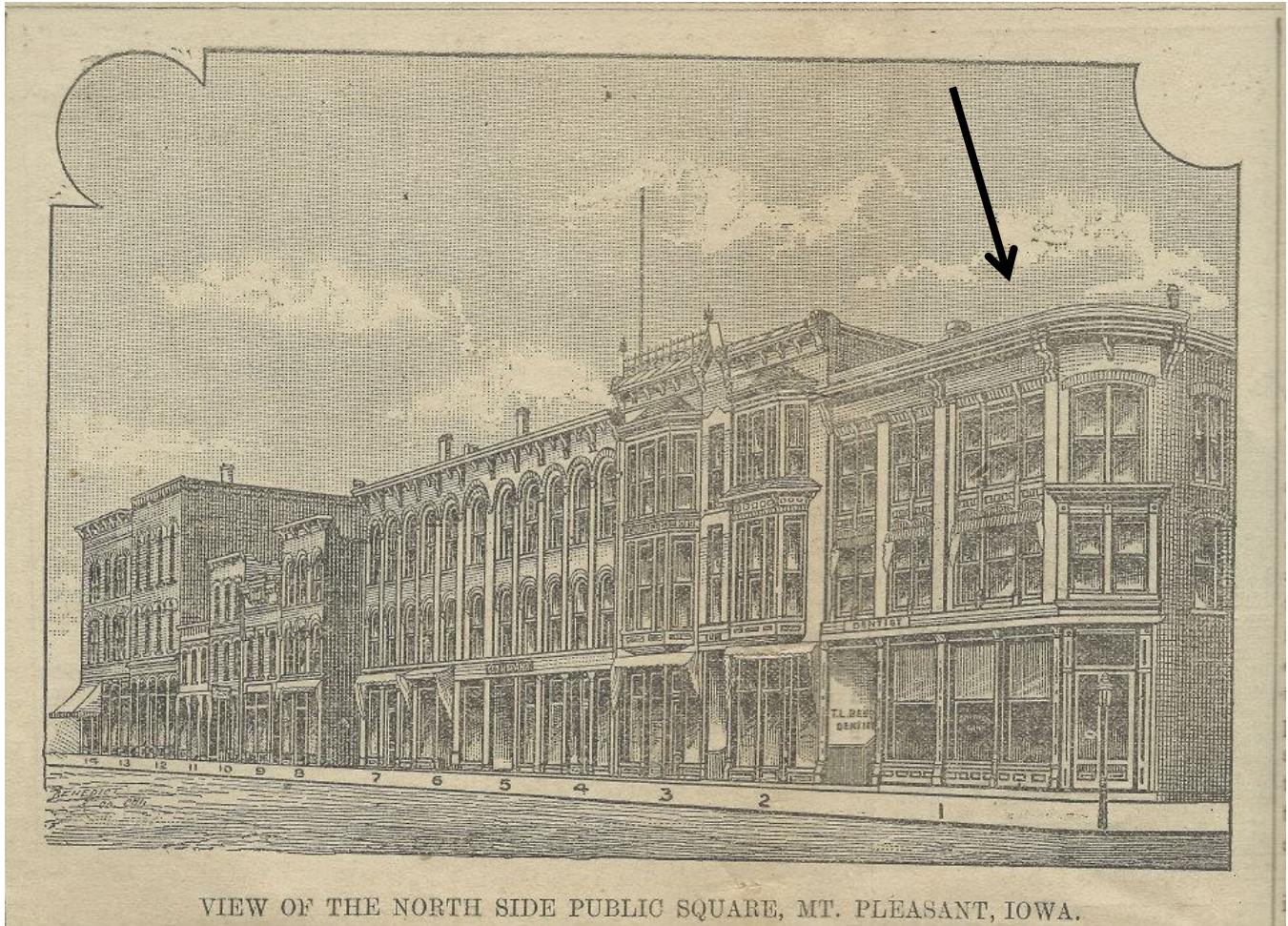
100 block of W. Monroe St in 1890