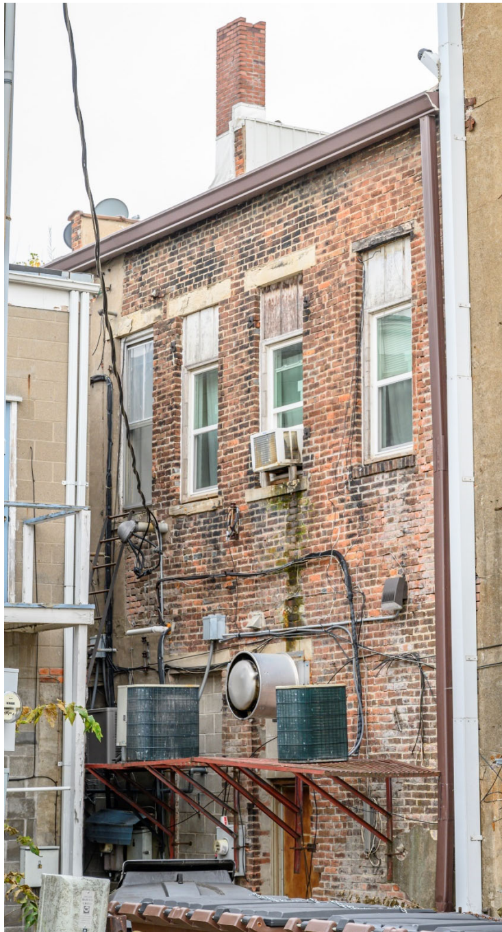
Photograph 44-00367-003. North elevation, looking southeast (October 2023)