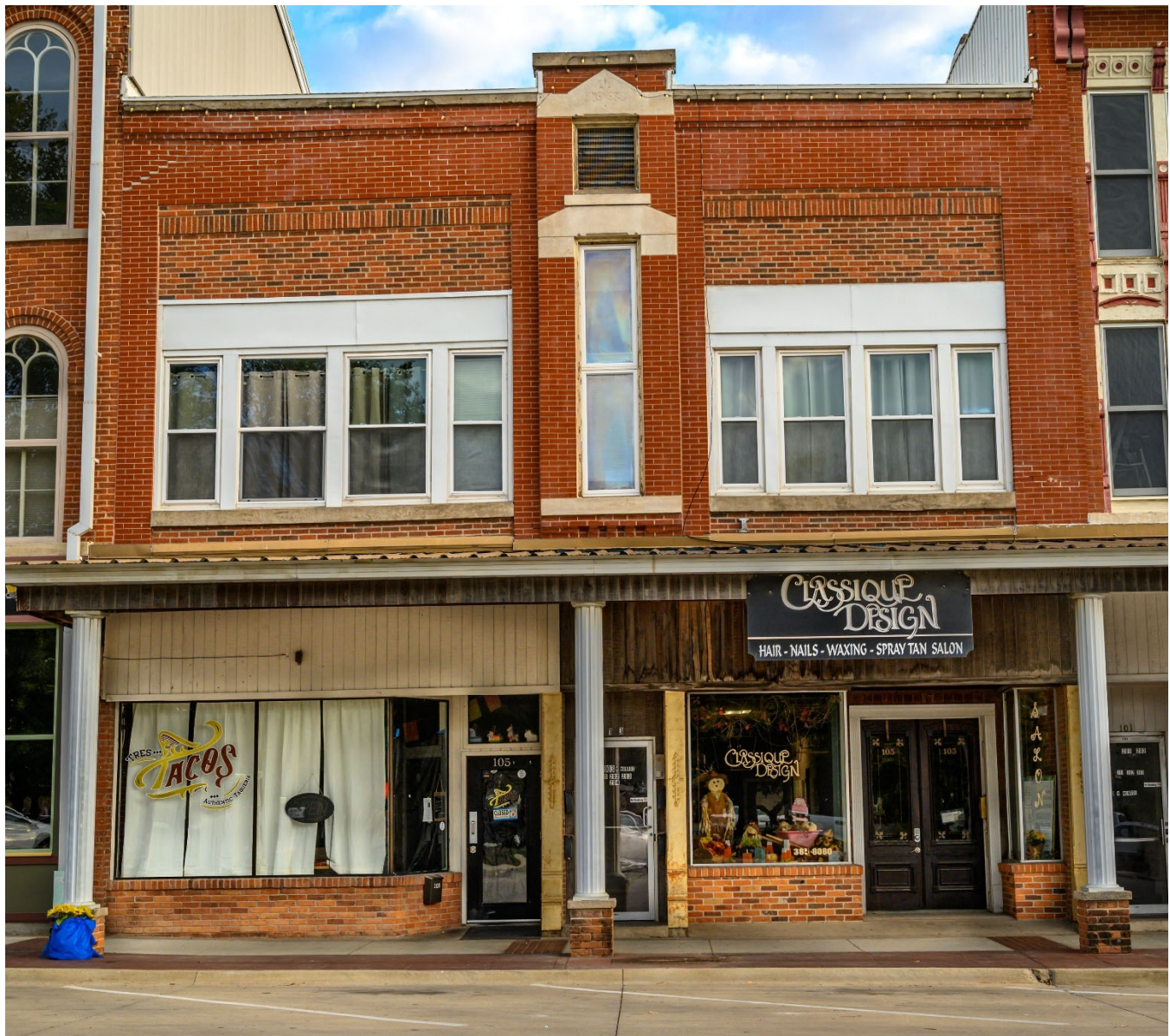
Photograph 44-00367-001. South elevation, looking north (October 2023)