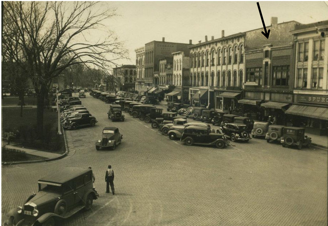
100 block of W. Monroe Street in 1936