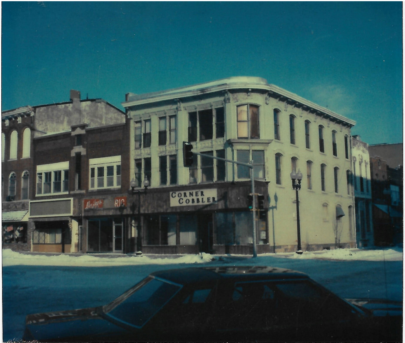
Building at 105-103 W. Monroe and corner building at 101 W. Monroe in 1970s (HCHT Facebook album)