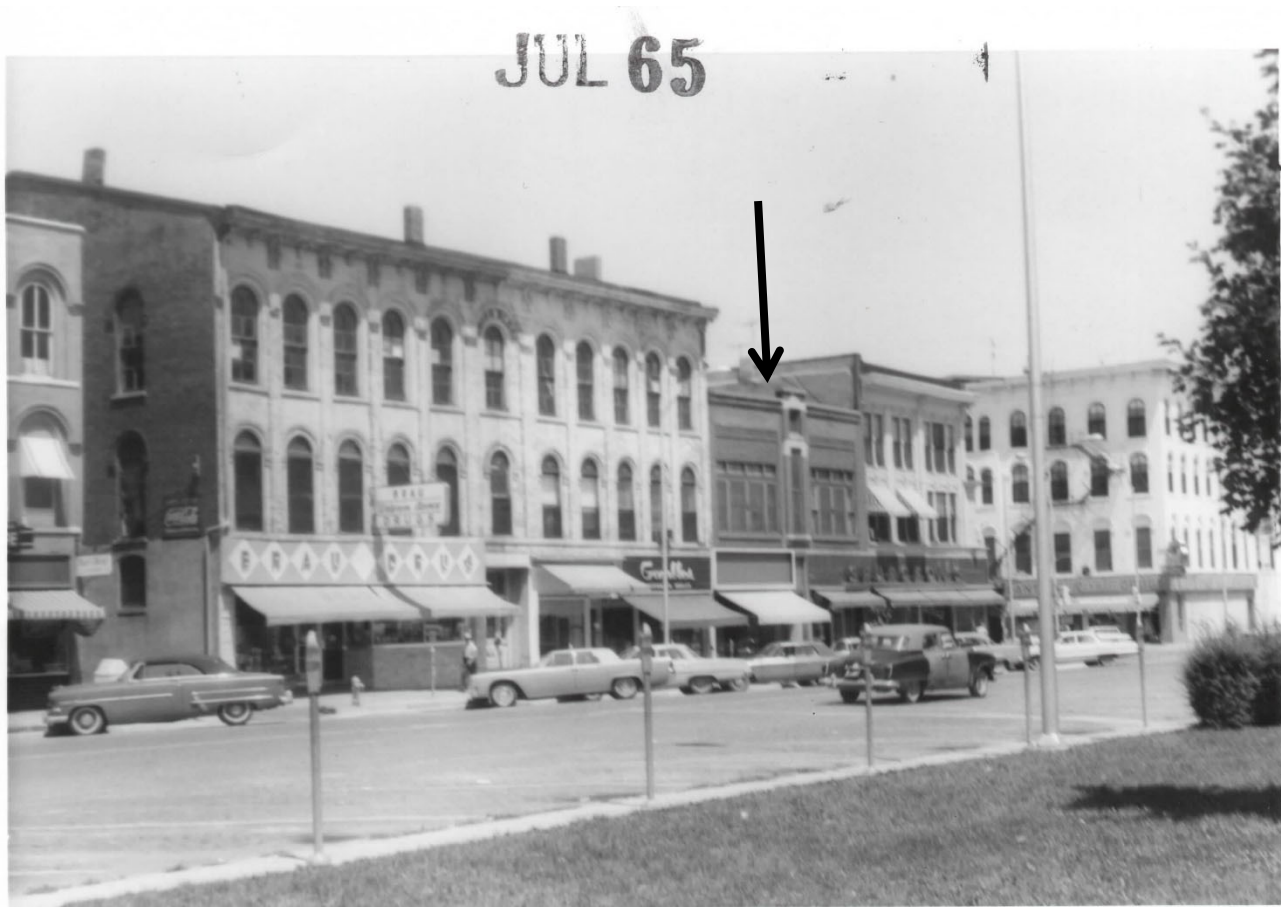
East half of north side of square in July 1965