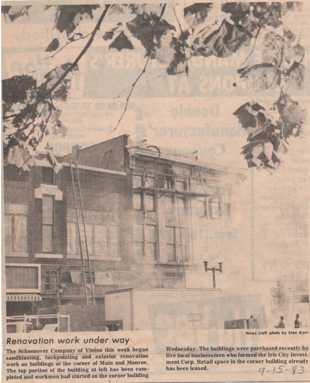
Building at 105-103 W. Monroe and corner building at 101 W. Monroe in September 1983 (Mt Pleasant News, September 15, 1983, HCHT clippings)