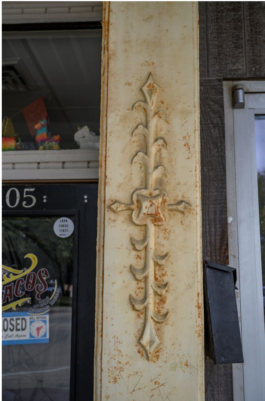
Photograph 44-00367-002. Cast iron column detail on south elevation, looking north (October 2023)