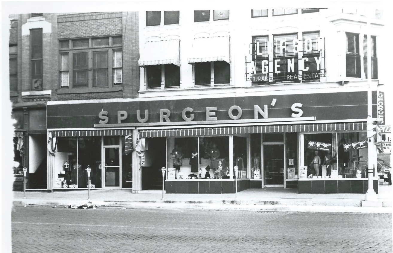
Spurgeon's in early 1960s (HCHT Facebook album)