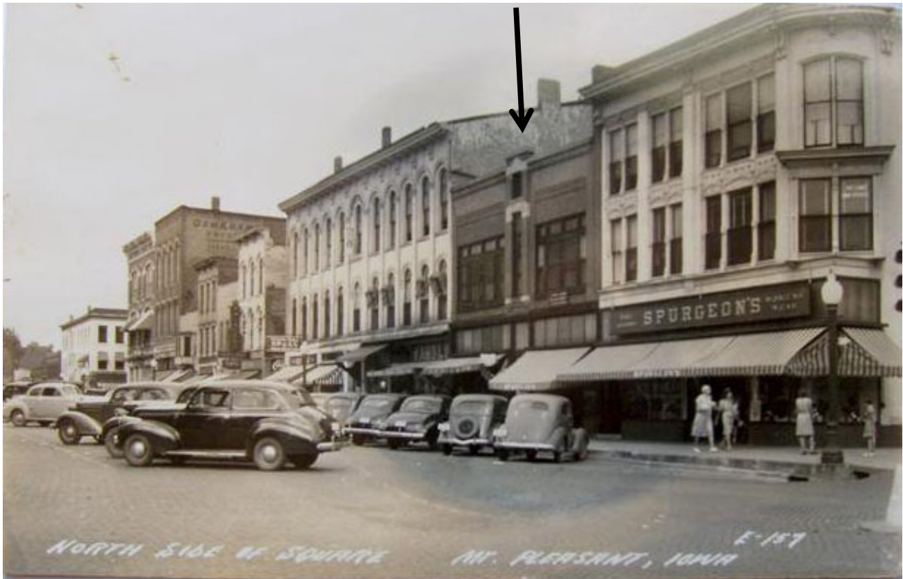
100 block of W. Monroe Street in the early 1940s