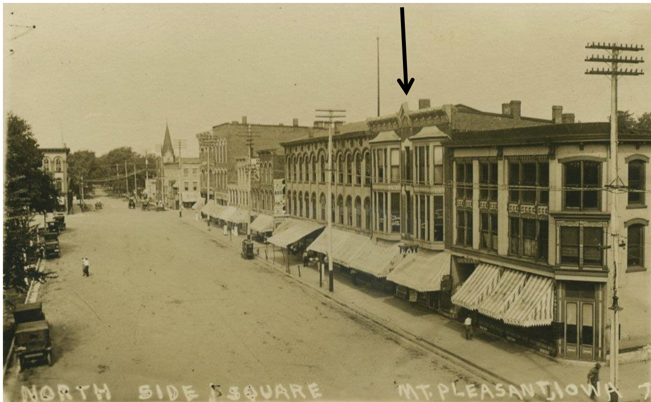
100 block of W. Monroe Street in the 1900s (HCHT Facebook album)