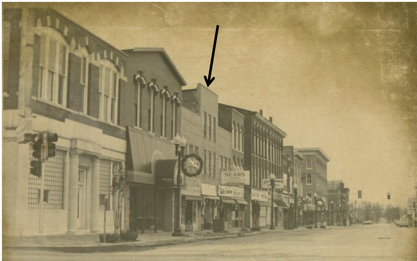
100 block of W. Monroe Street in December 1981 (Mt Pleasant News, December 2, 1981, 30, HCHT Facebook album / clippings)