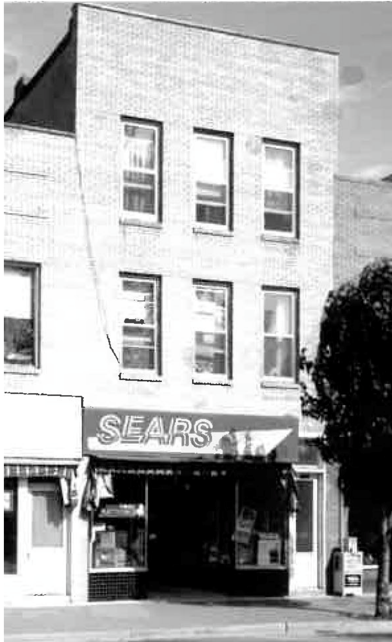
1990 survey photograph (Naumann 1991)