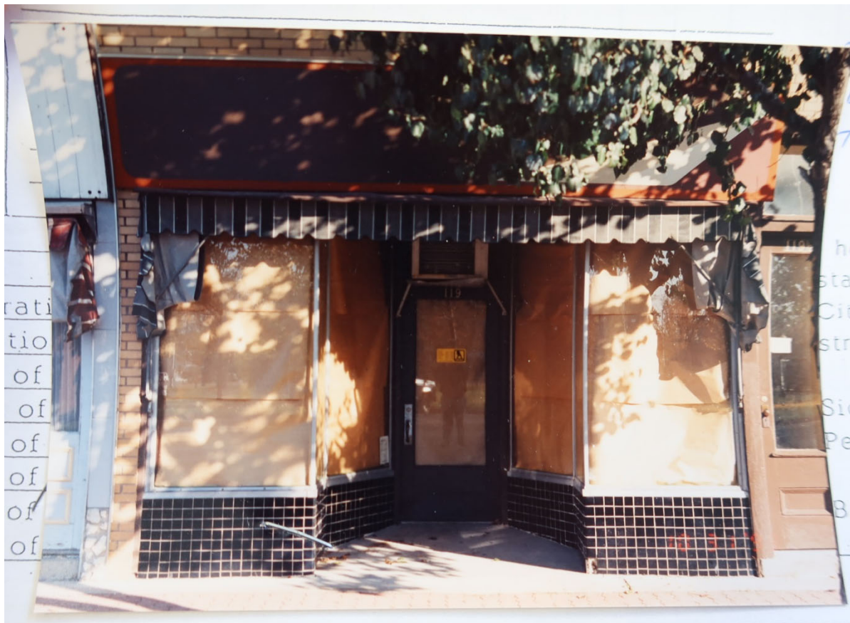
Storefront prior to issuance of building permit for remodel in October 1993 (City of Mt Pleasant building permits) black tile removed/clad