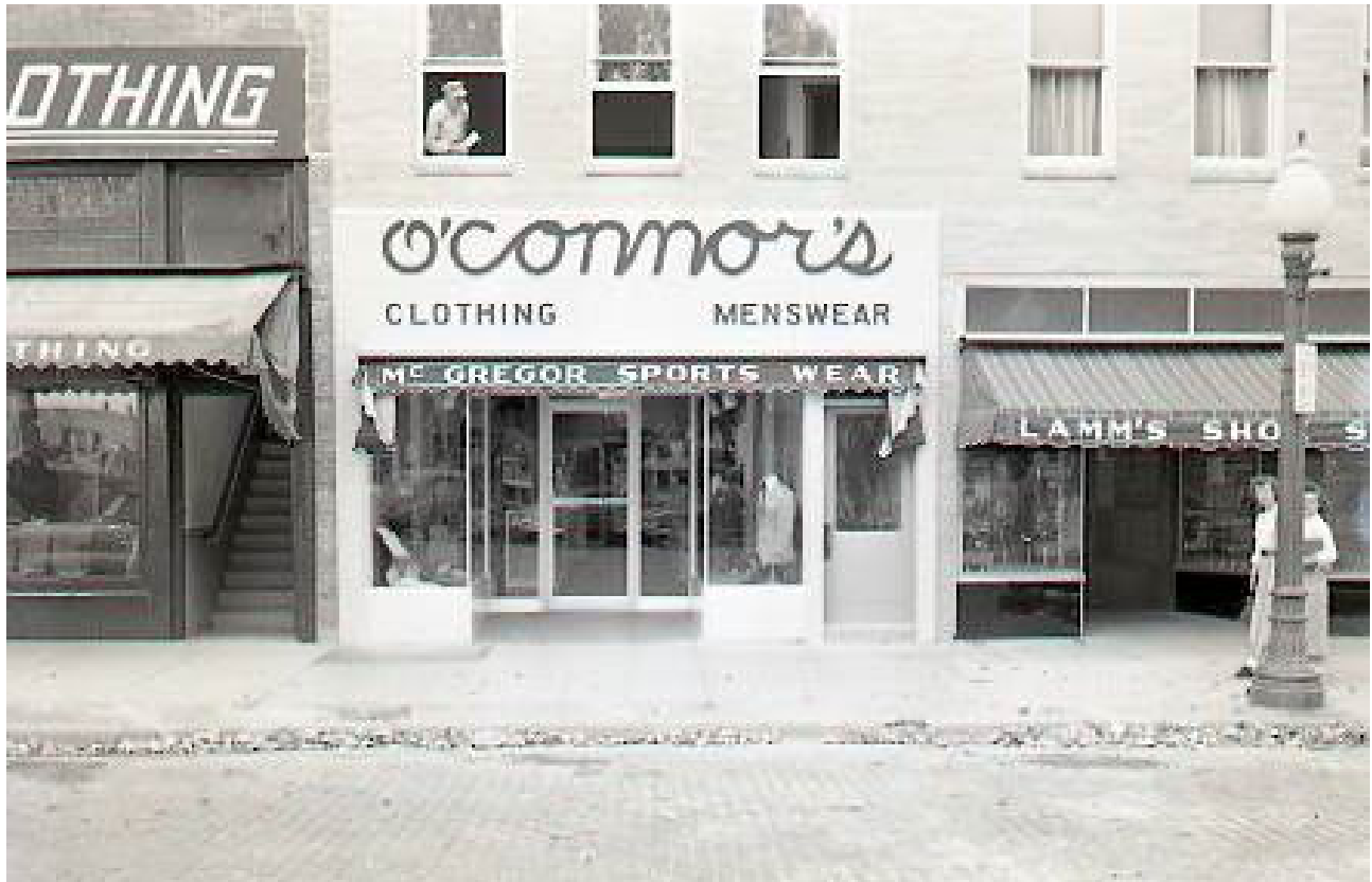
Storefront at Lamm's at right in 1952