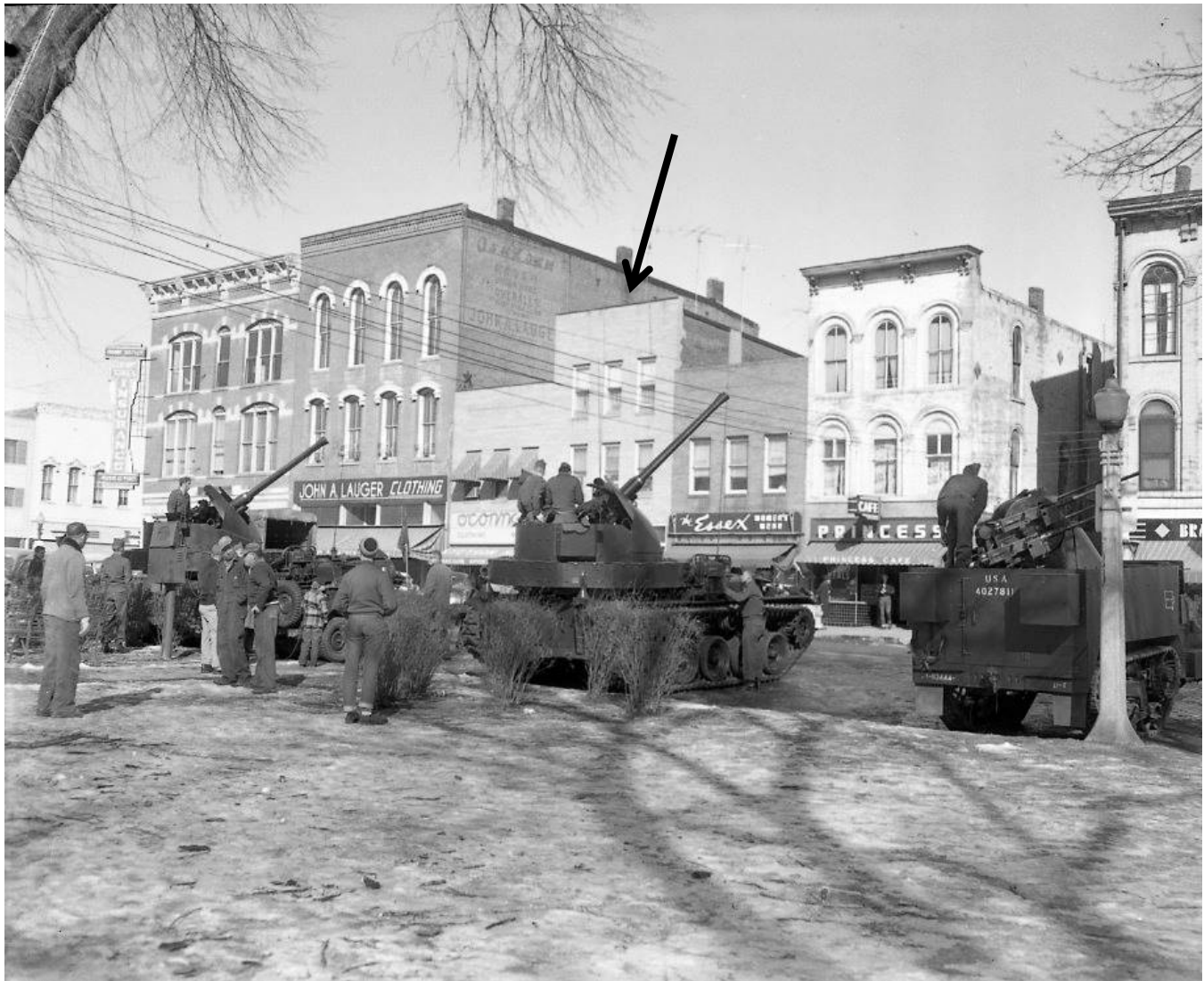
West end of 100 block of W. Monroe Street in 1956 (HCHT Facebook album)