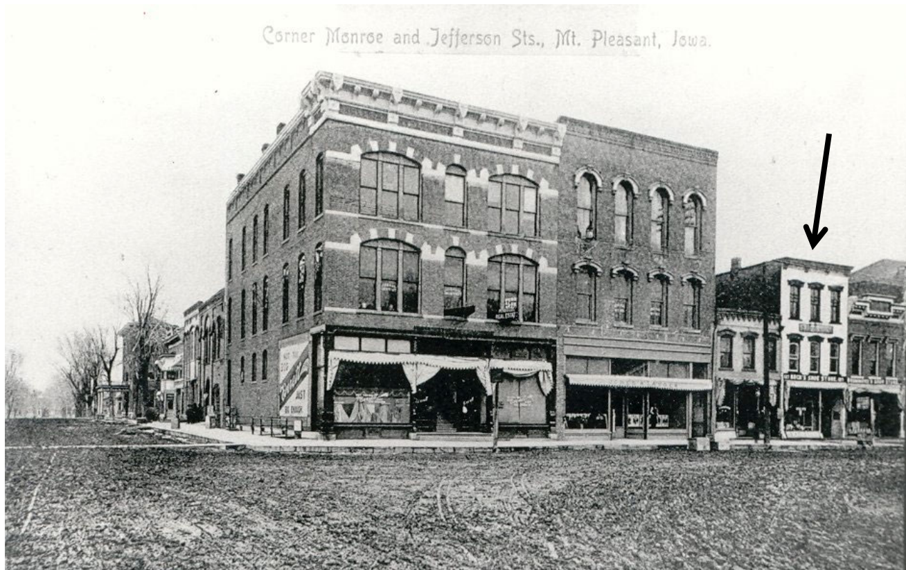
West end of 100 block of W. Monroe Street in early 1900s (HCHT Facebook album)