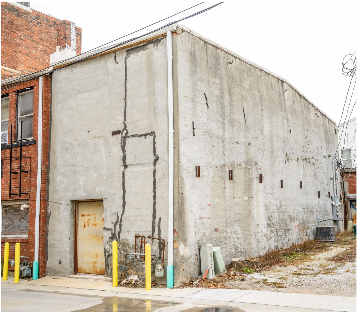
Photograph 44-02263-002. Addition along north elevation to side alley, looking southwest (October 2023)