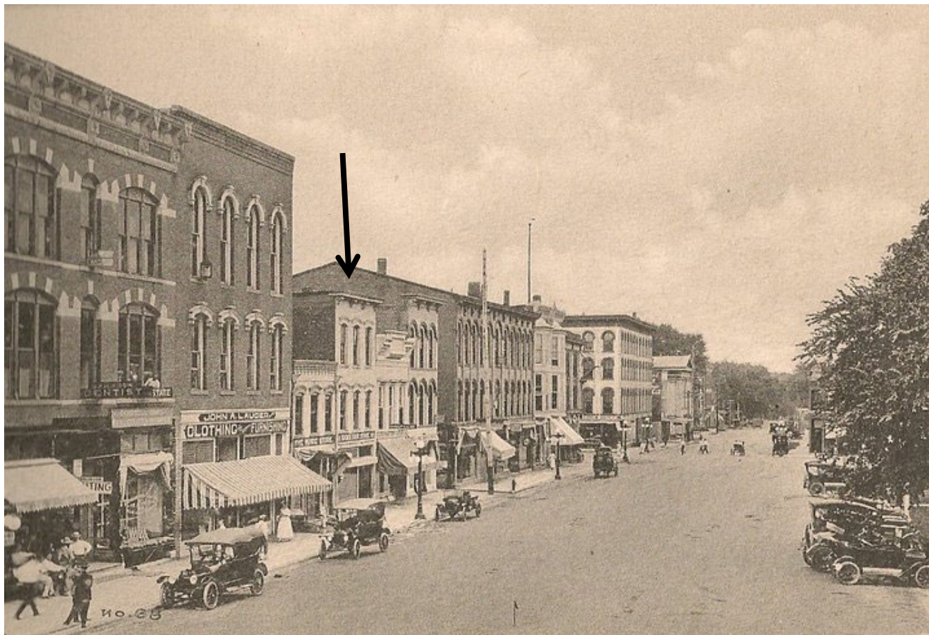
100 block of W. Monroe Street in the late 1910s