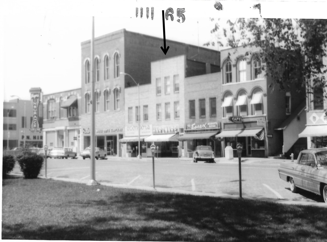
100 block of W. Monroe Street in 1965 (HCHT Facebook album)