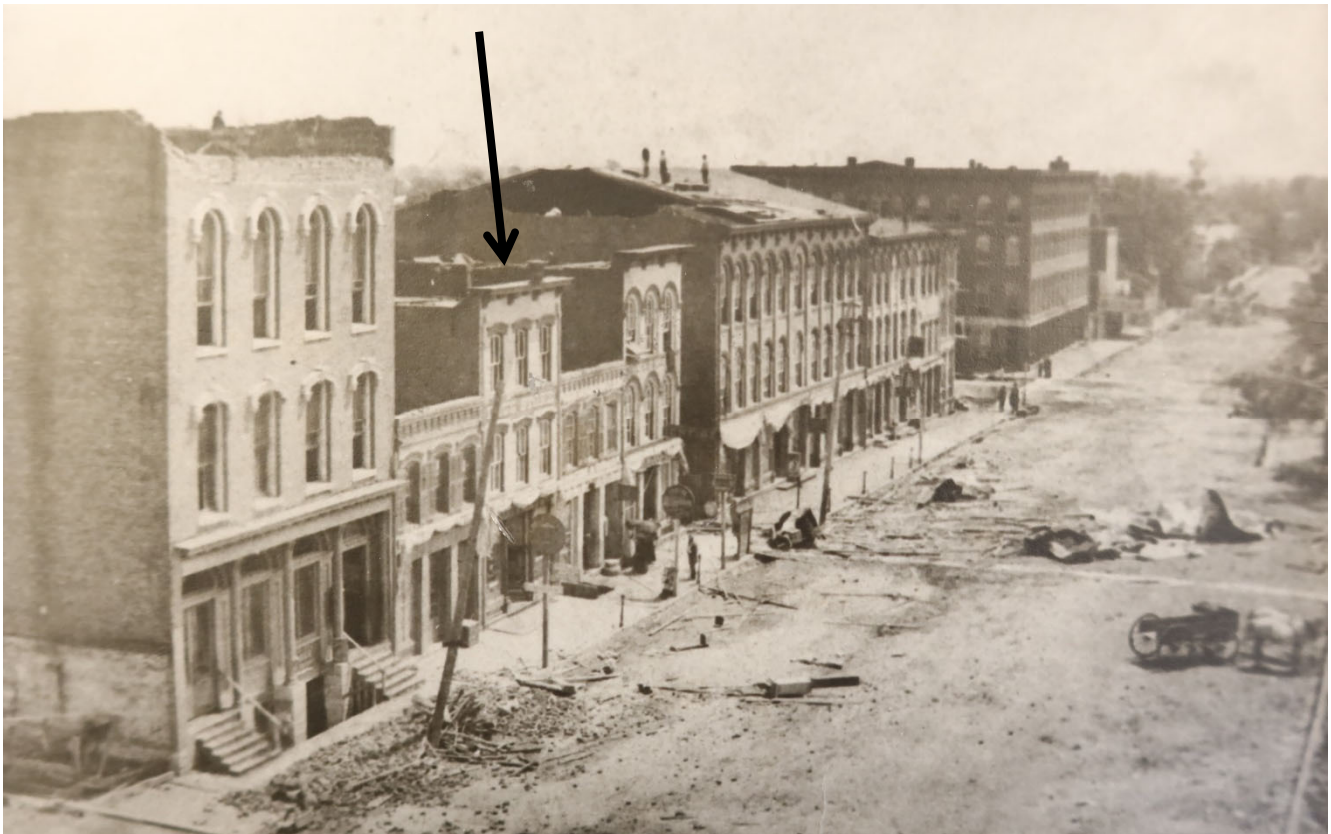
100 block of W. Monroe after June 1882 tornado