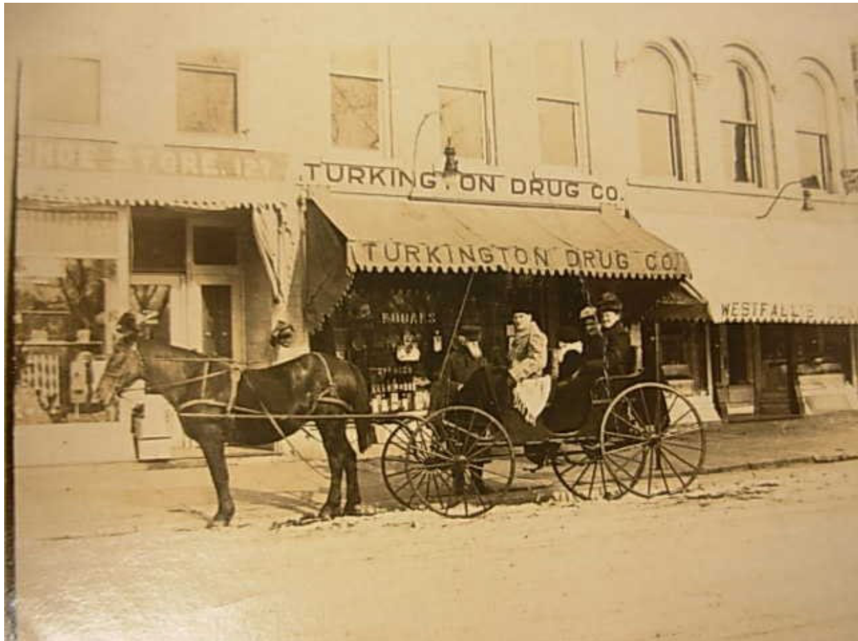
Building at left, around 1915