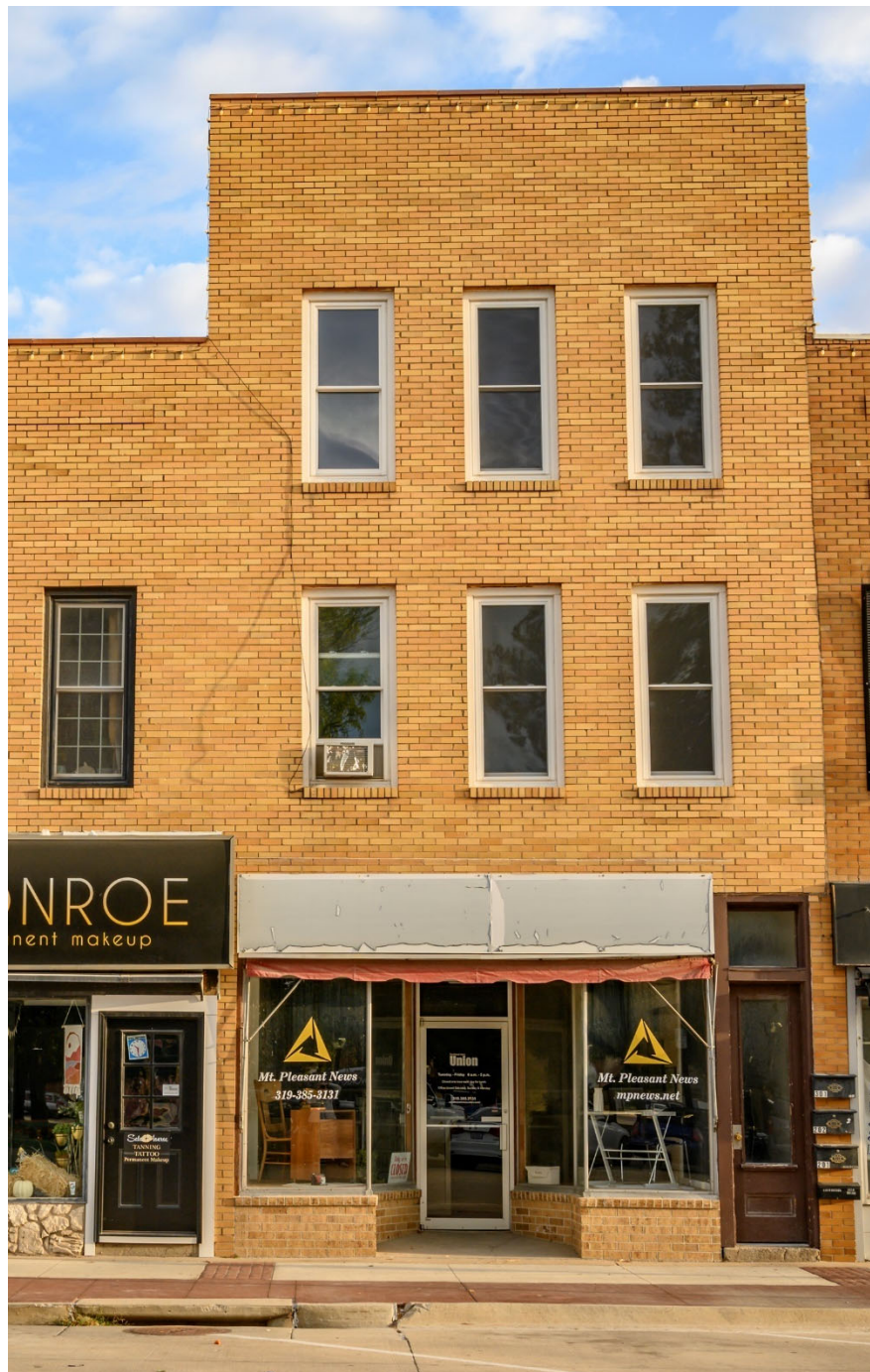
Photograph 44-02263-001. South elevation, looking north (October 2023)