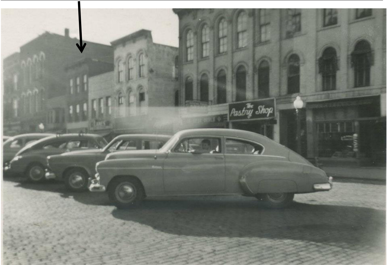
100 block of W. Monroe Street in early 1952 (Don Lamm, HCHT Facebook album)