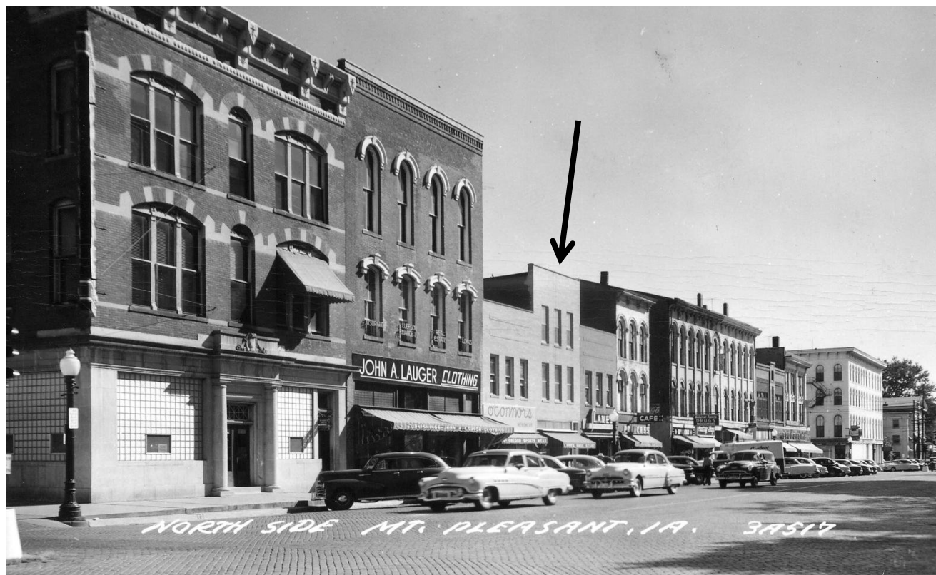
100 block of W. Monroe Street in 1957