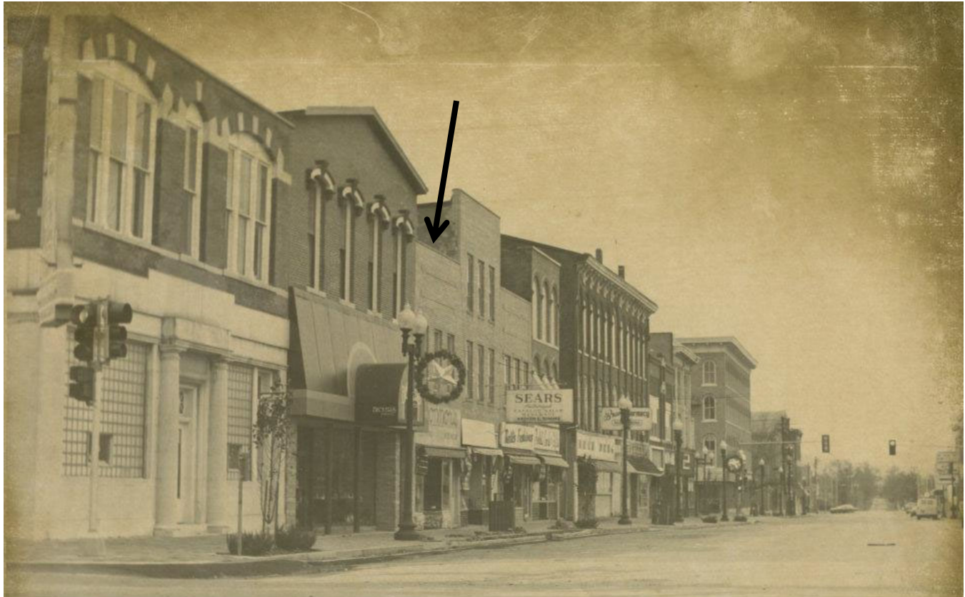
100 block of W. Monroe Street in December 1981 (Mt Pleasant News, December 2, 1981, 30, HCHT Facebook album / clippings)