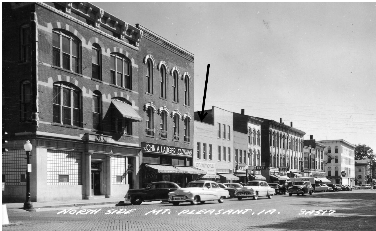
100 block of W. Monroe Street in 1957 (HCHT Facebook album)