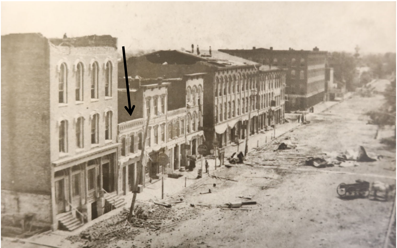
100 block of W. Monroe after June 1882 tornado