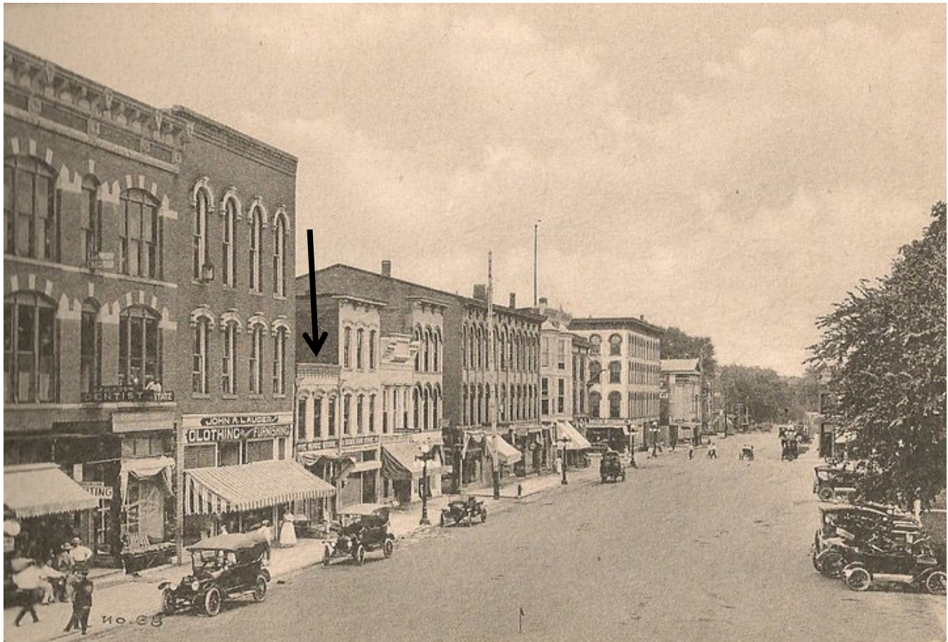
100 block of W. Monroe Street in the late 1910s