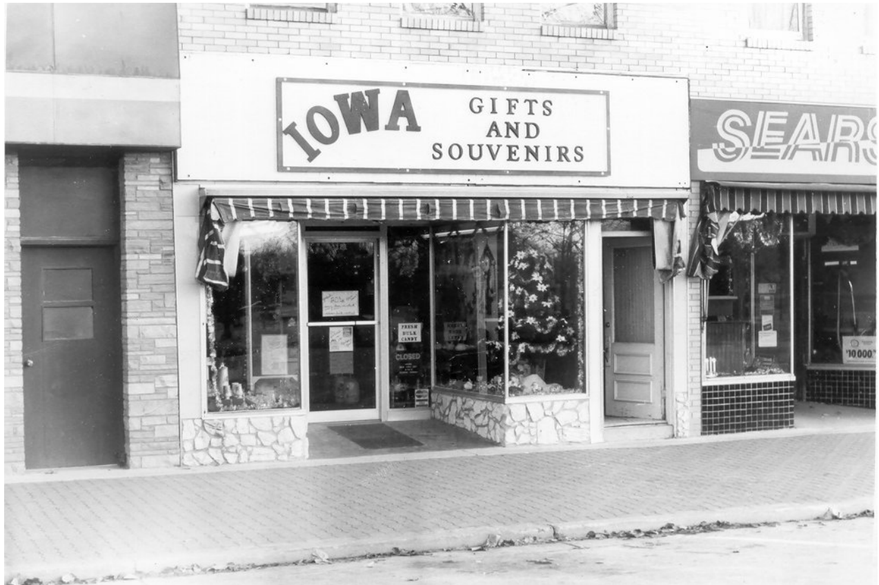
Storefront in 1990s (HCHT Facebook album)