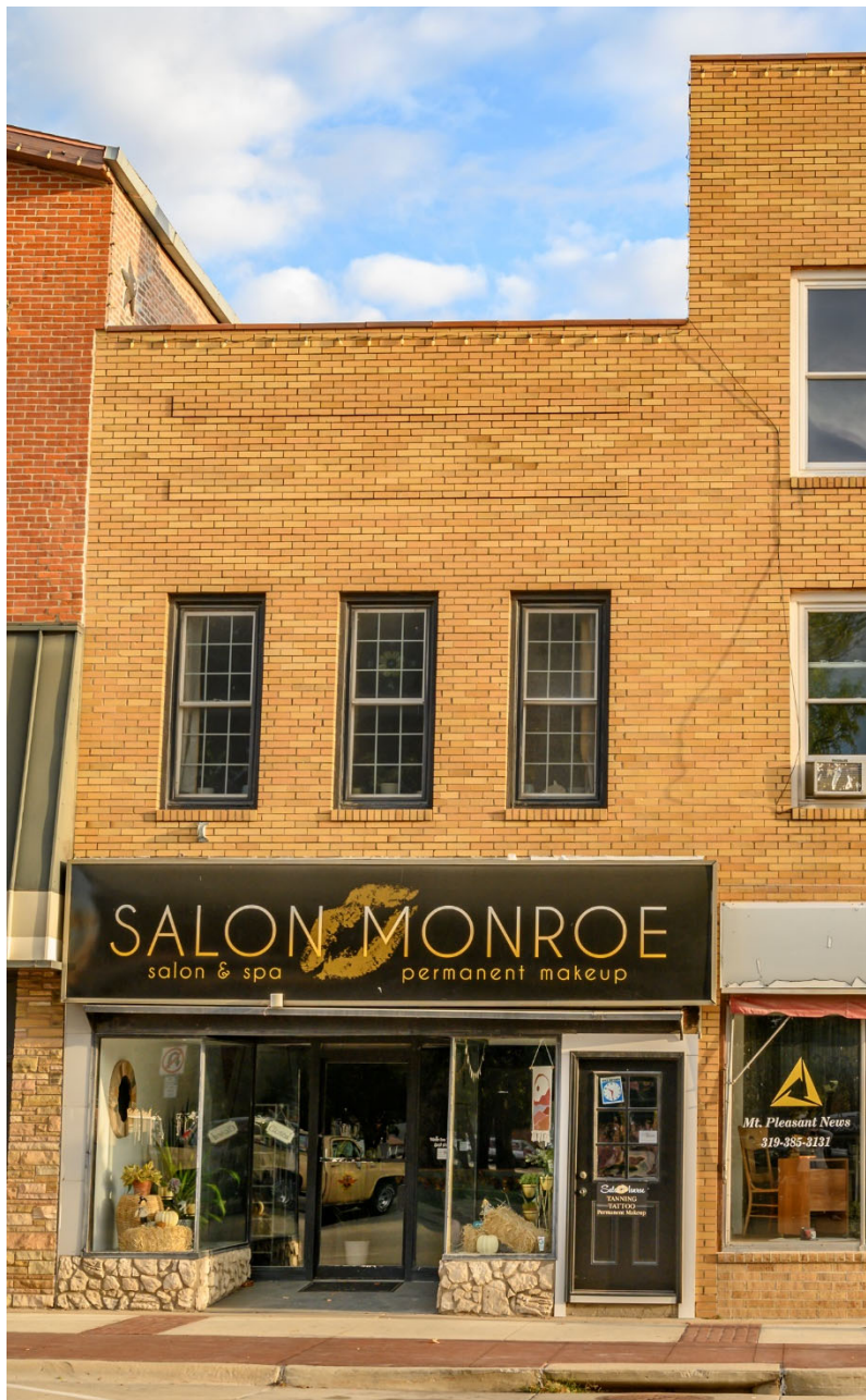
Photograph 44-00371-001. South elevation, looking north (October 2023)