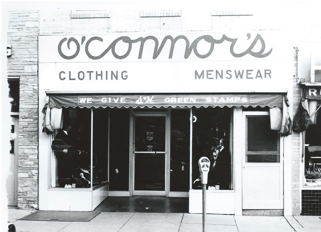
Storefront in 1960s (HCHT Facebook album)