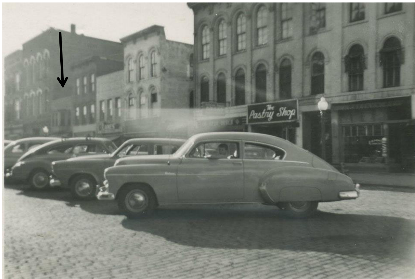
100 block of W. Monroe Street in early 1952 (Don Lamm, HCHT Facebook album)