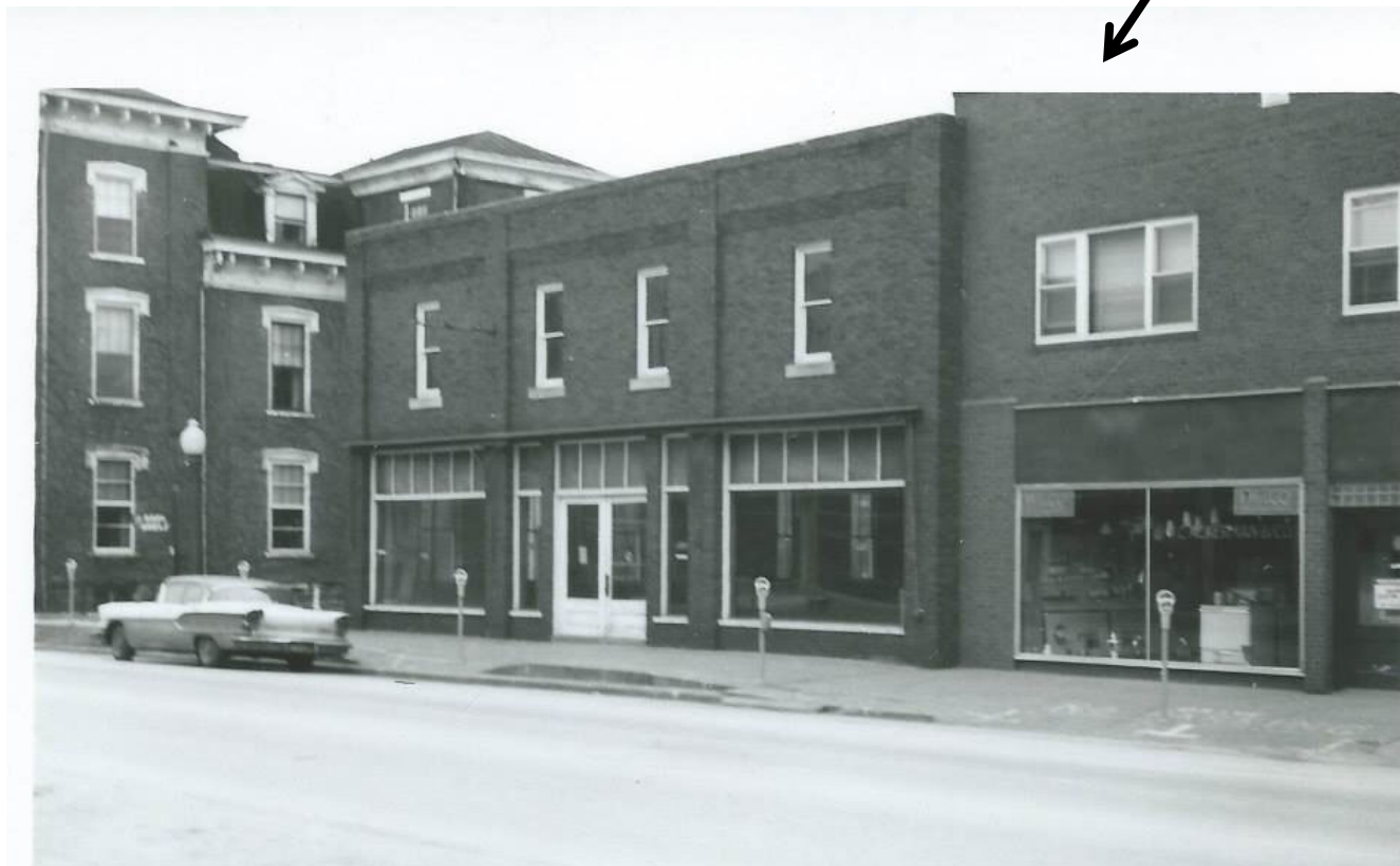
Building at right in July 1961 after 1948 façade remodel