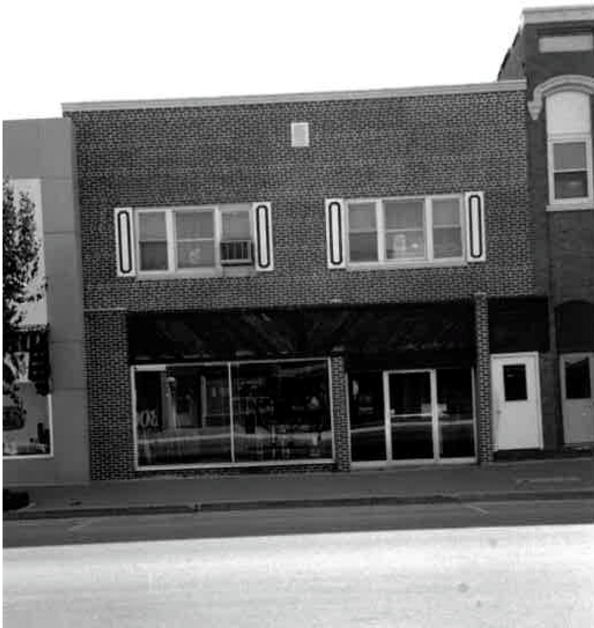
1990 survey photograph (Naumann 1991)

Goe Building Henry Name of Property County 110 N. Jefferson St Mount Pleasant Address City