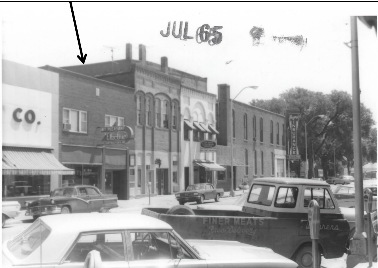
East side of 100 block of N. Jefferson in July 1965