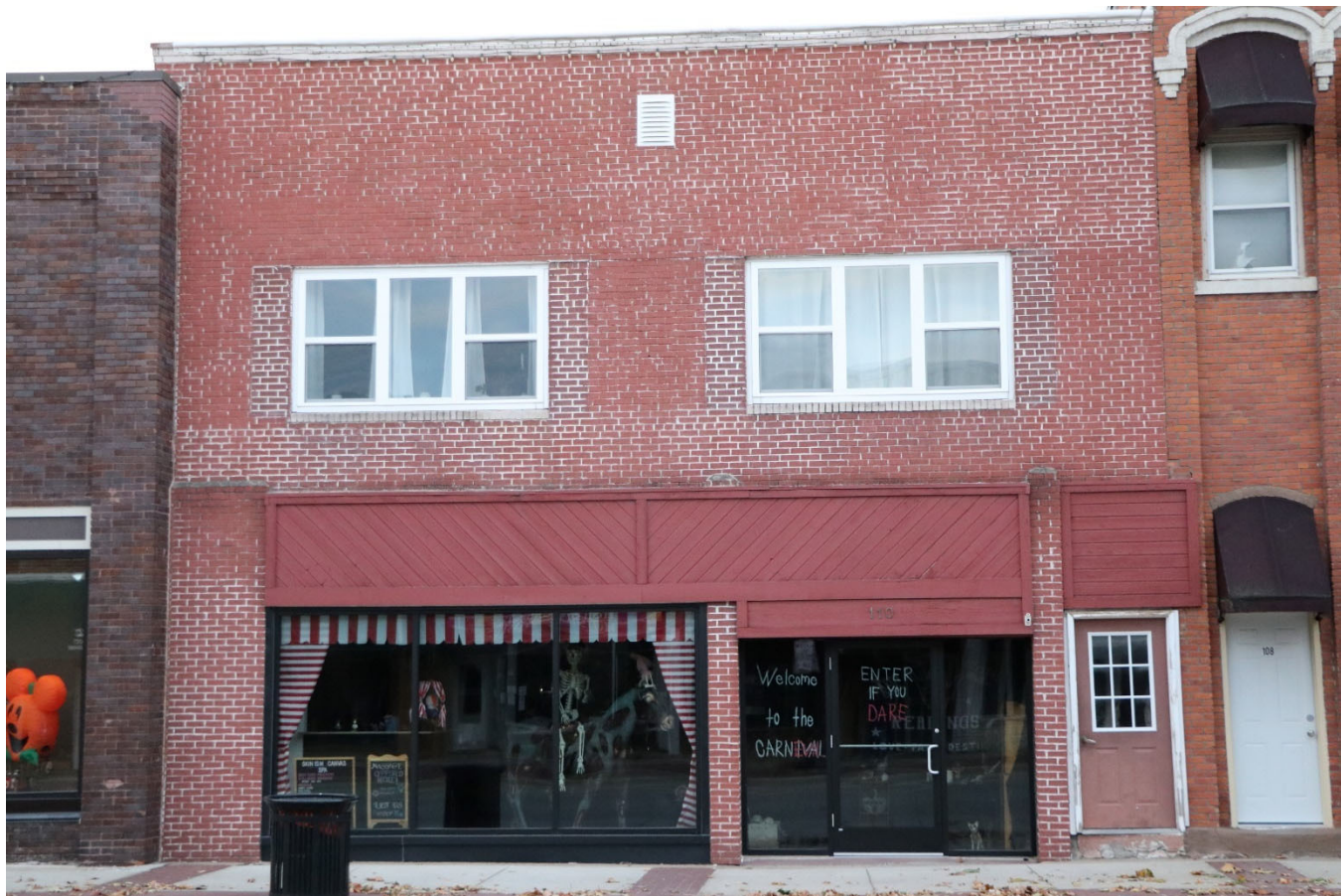
Photograph 44-00189-001. West elevation, looking east (October 2023)