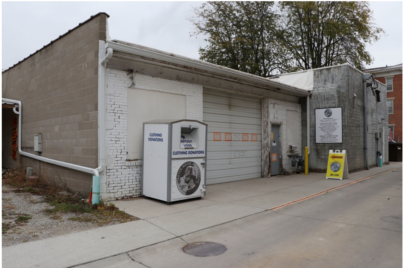
Photograph 44-00189-002. East elevation, looking northwest (October 2023)