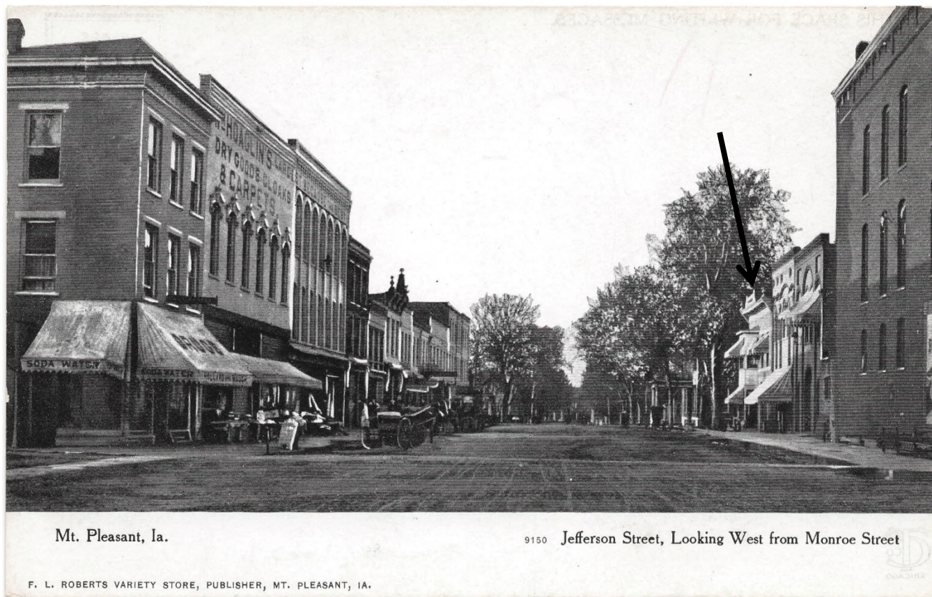
Looking north on 100 block of Jefferson St in early 1900s