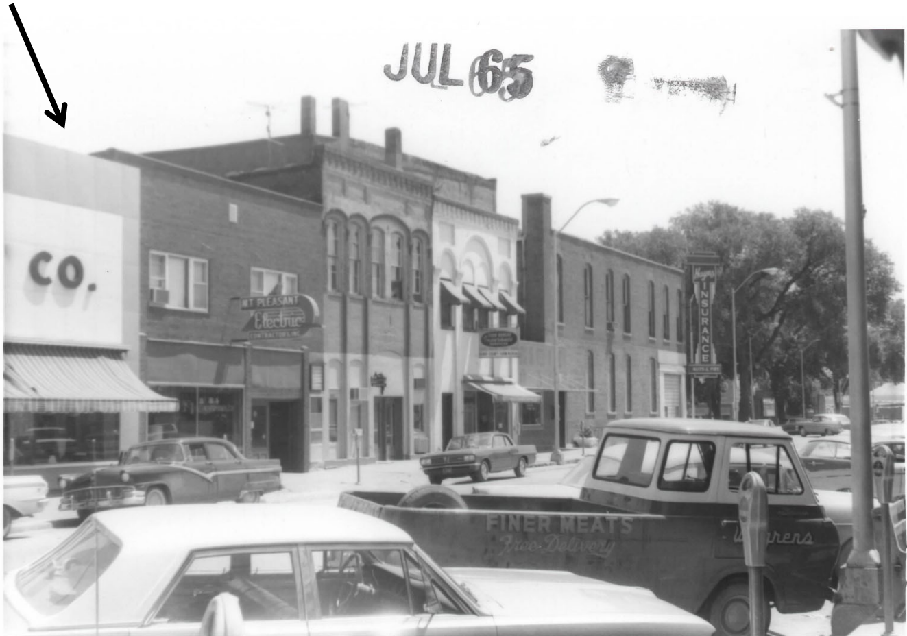
East side of 100 block of N. Jefferson in July 1965 (HCHT files)