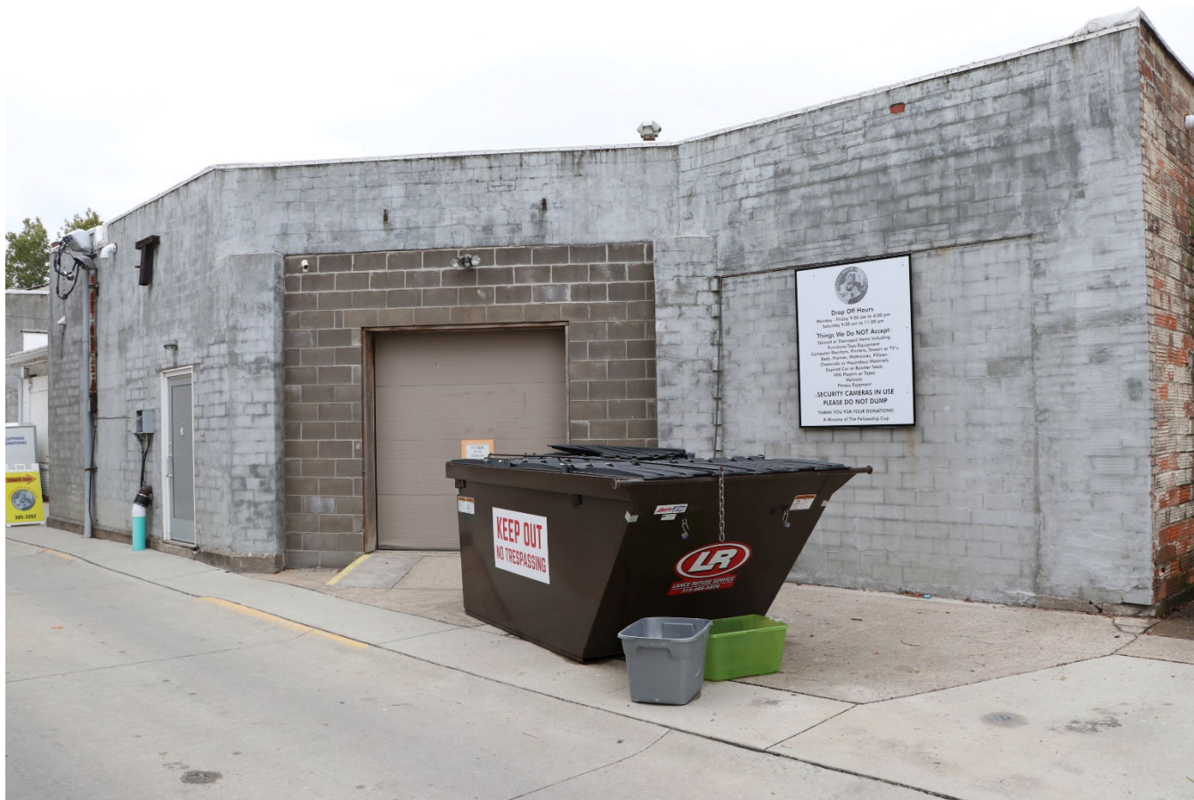
Photograph 44-00191-004. East elevation, looking southwest (October 2023)