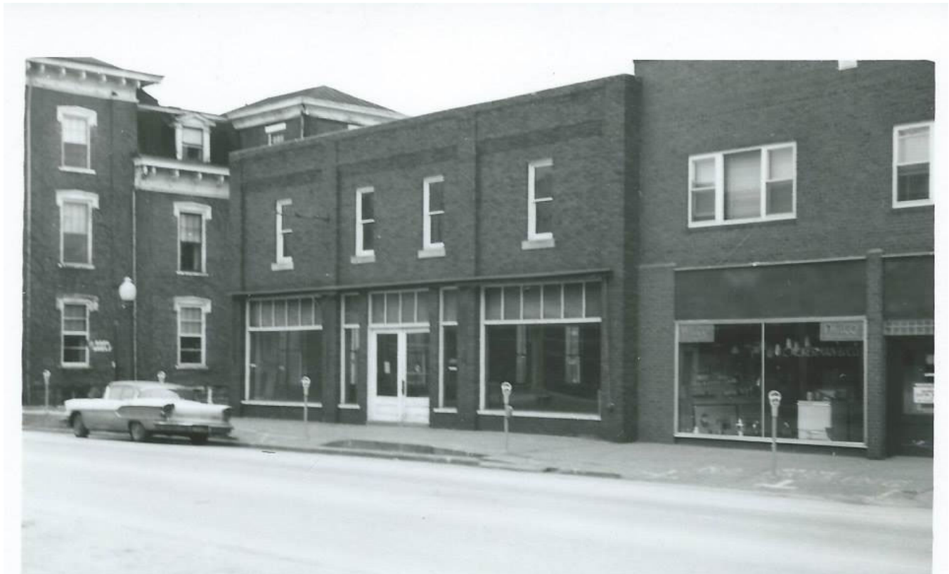
Building in July 1961