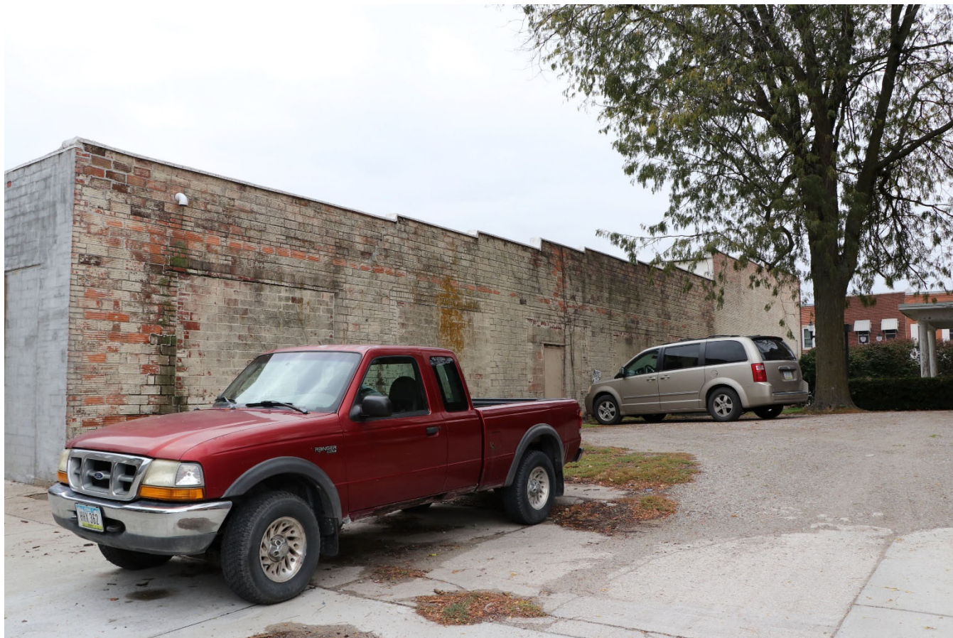
Photograph 44-00191-003. North elevation, looking southwest (October 2023)