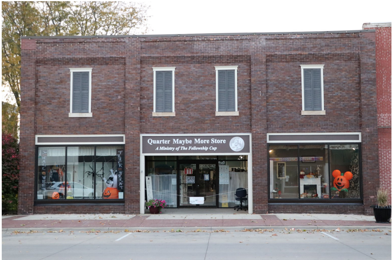
Photograph 44-00191-001. West elevation, looking east (October 2023)