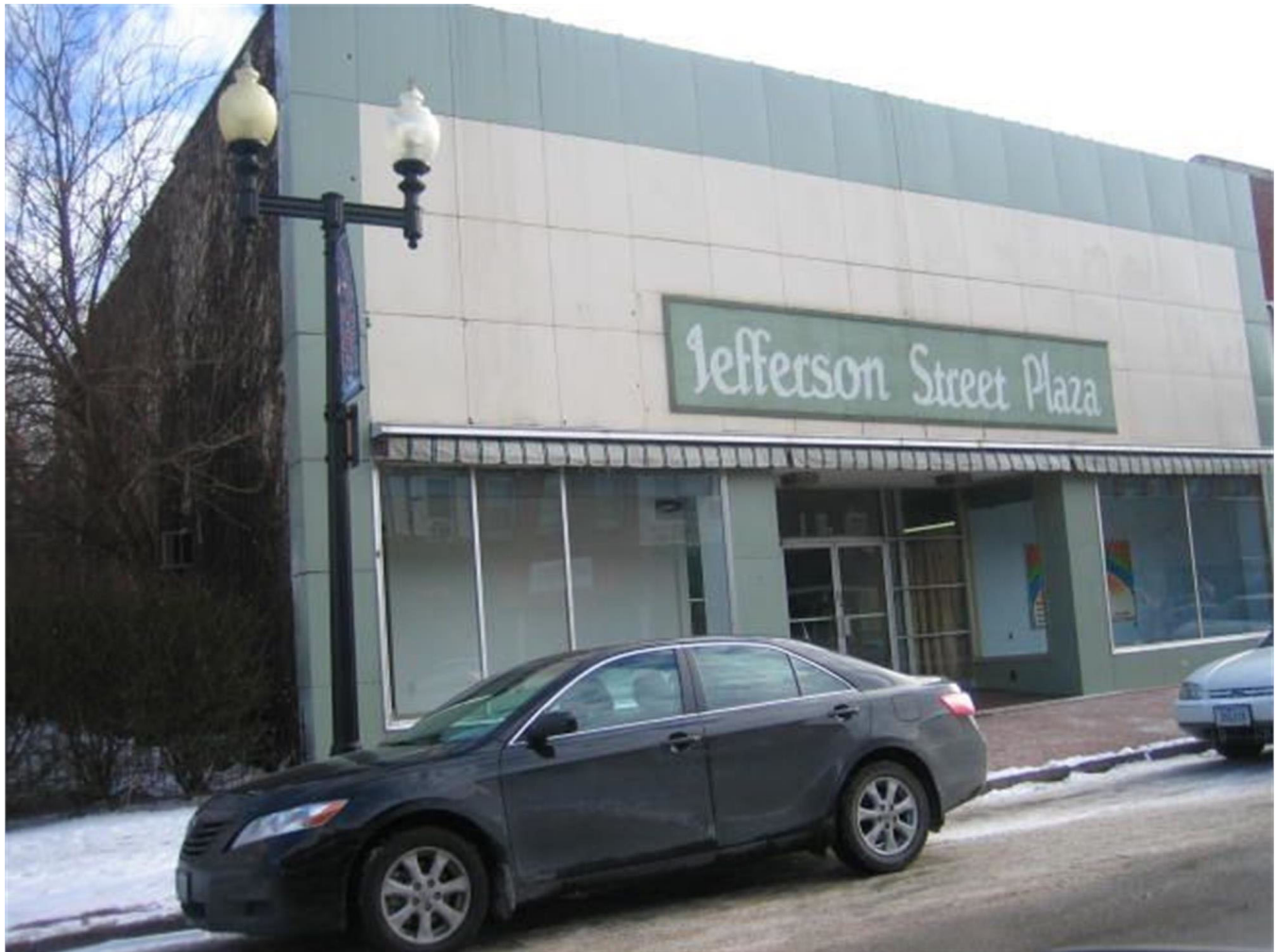
Building in 2000s with JC Penney façade (HCHT Facebook album)