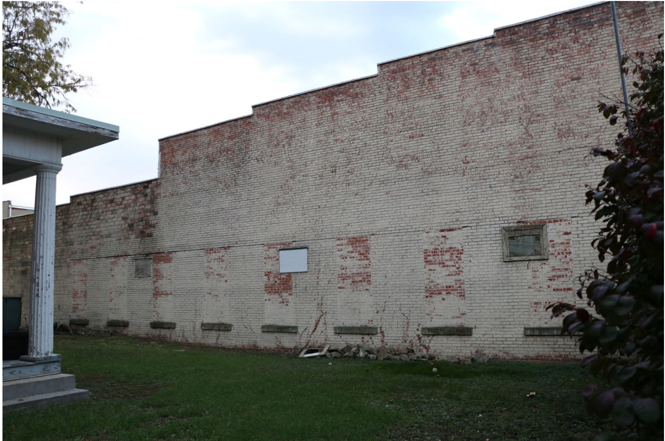
Photograph 44-00191-002. North elevation, looking southeast (October 2023)