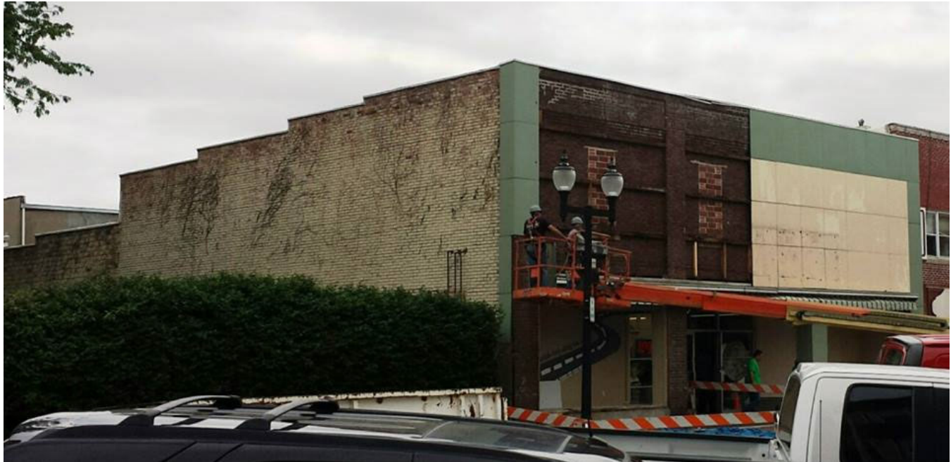
Building while façade was being removed in June 2015