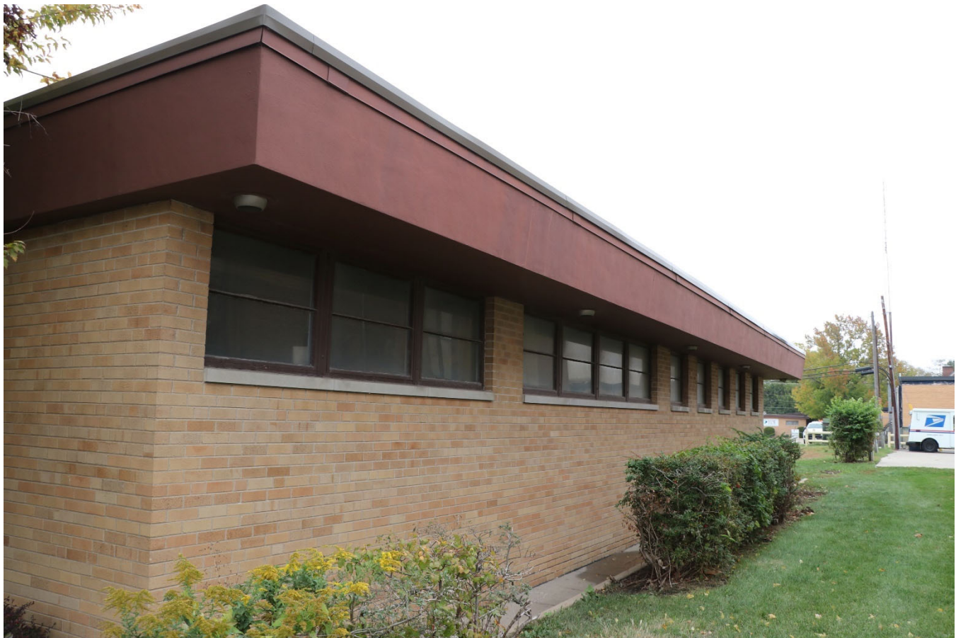
Photograph 44-02243-002. South elevation, looking northeast (October 2023)