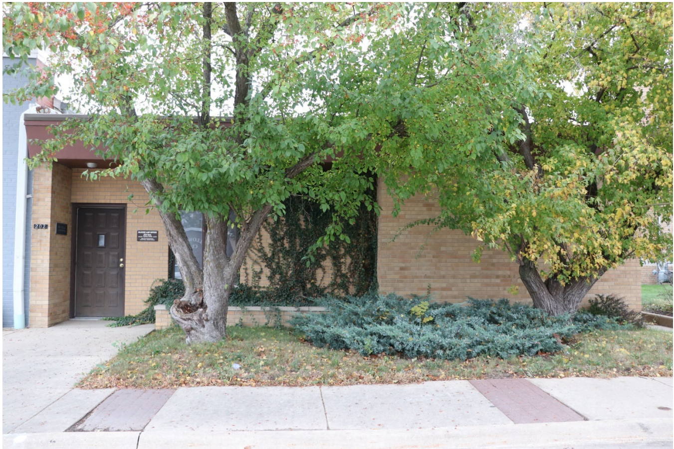
Photograph 44-02243-001. West elevation, looking east (October 2023)