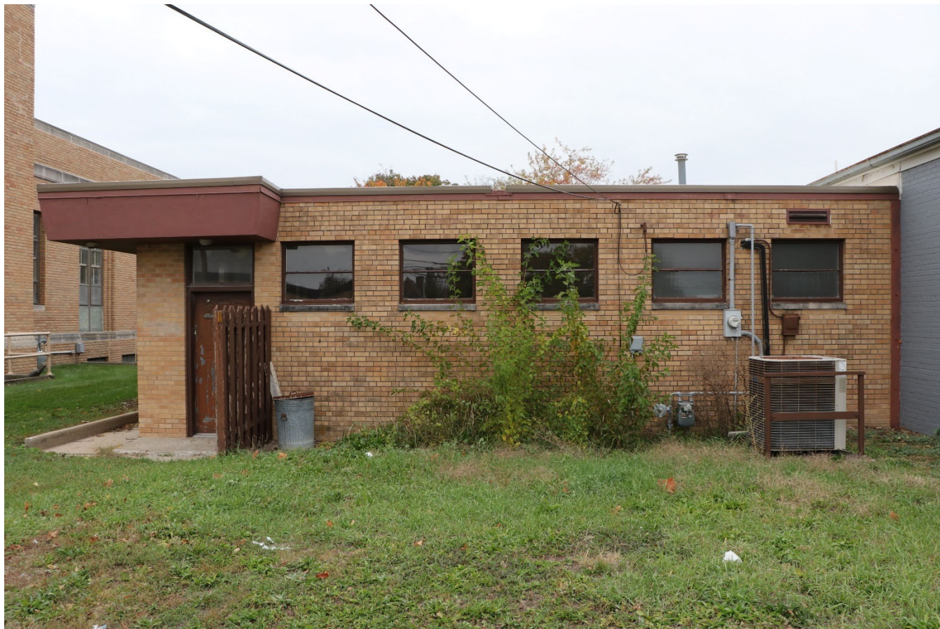
Photograph 44-02243-003. East elevation, looking west (October 2023)