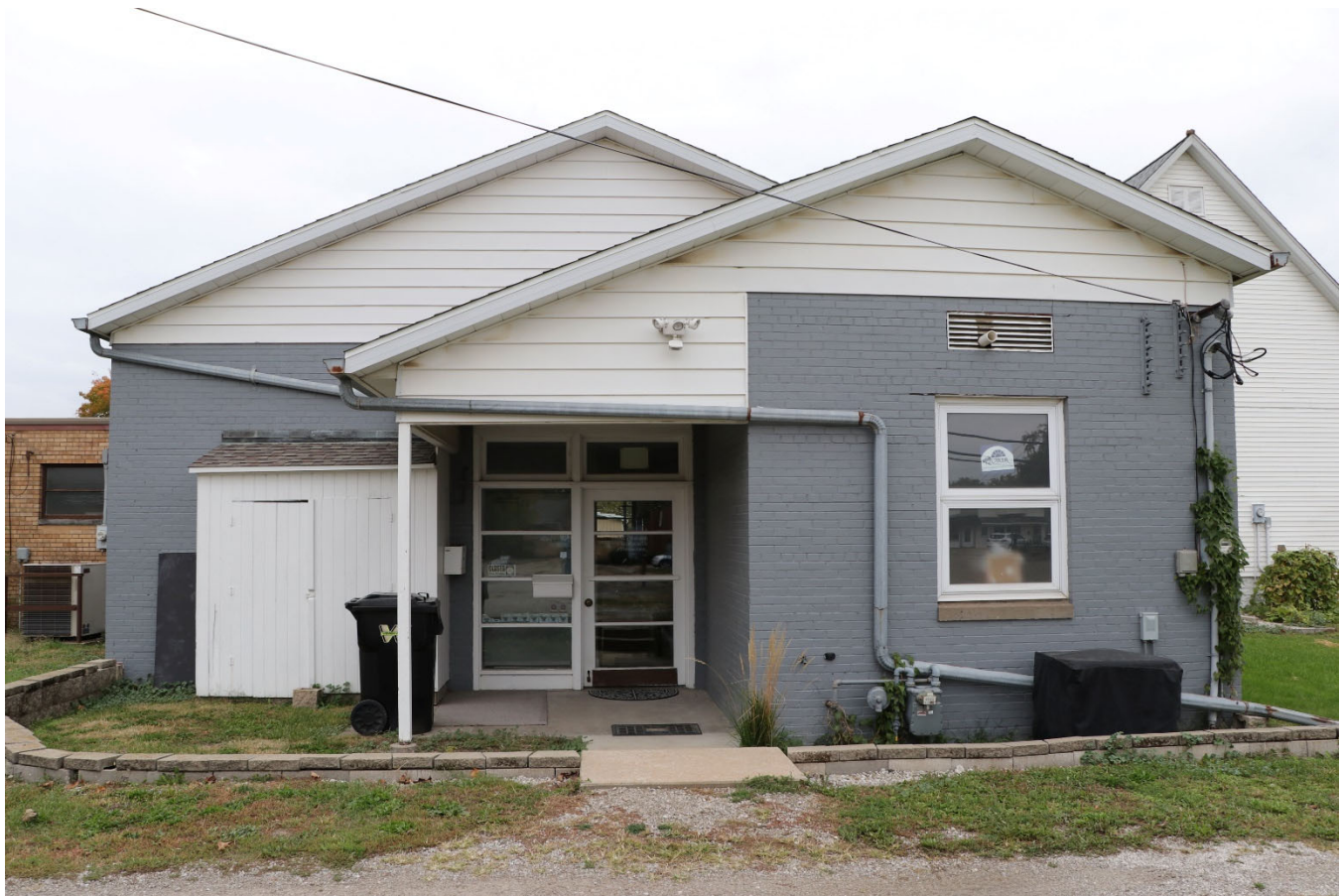
Photograph 44-02244-004. East elevation, looking west (October 2023)