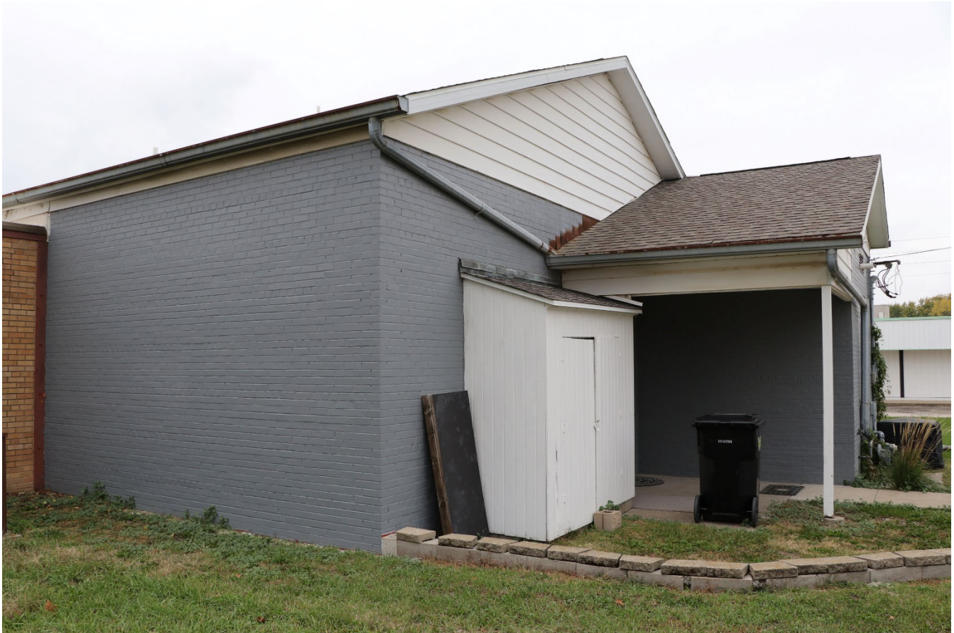
Photograph 44-02244-003. South and east elevations, looking northwest (October 2023)