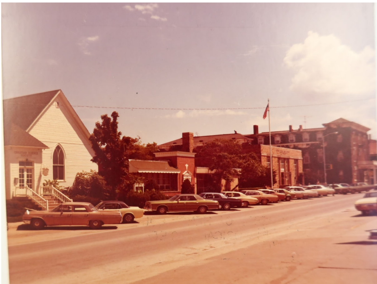
East side of 200 block in 1974, looking southeast (Dyall set, HCHS binder, Mt Pleasant library) prior to addition of gable roof in 1978