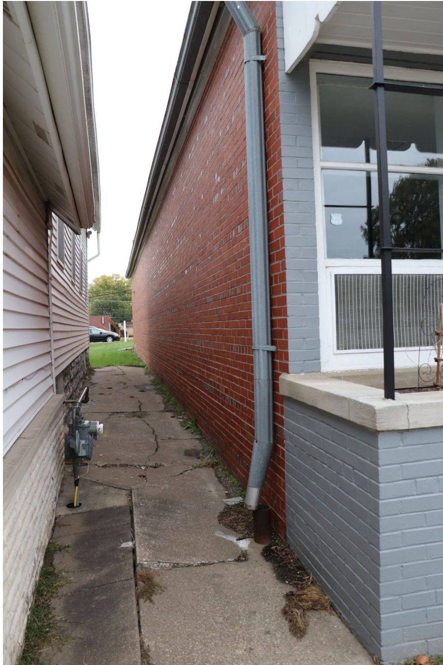
Photograph 44-02244-002. North elevation, looking southeast (October 2023)