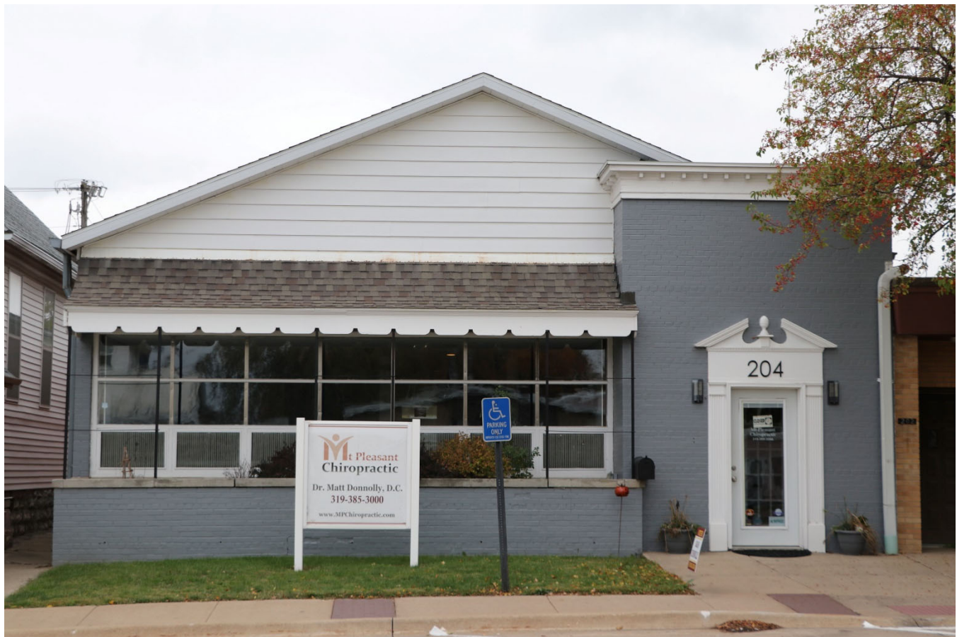
Photograph 44-02244-001. West elevation, looking east (October 2023)