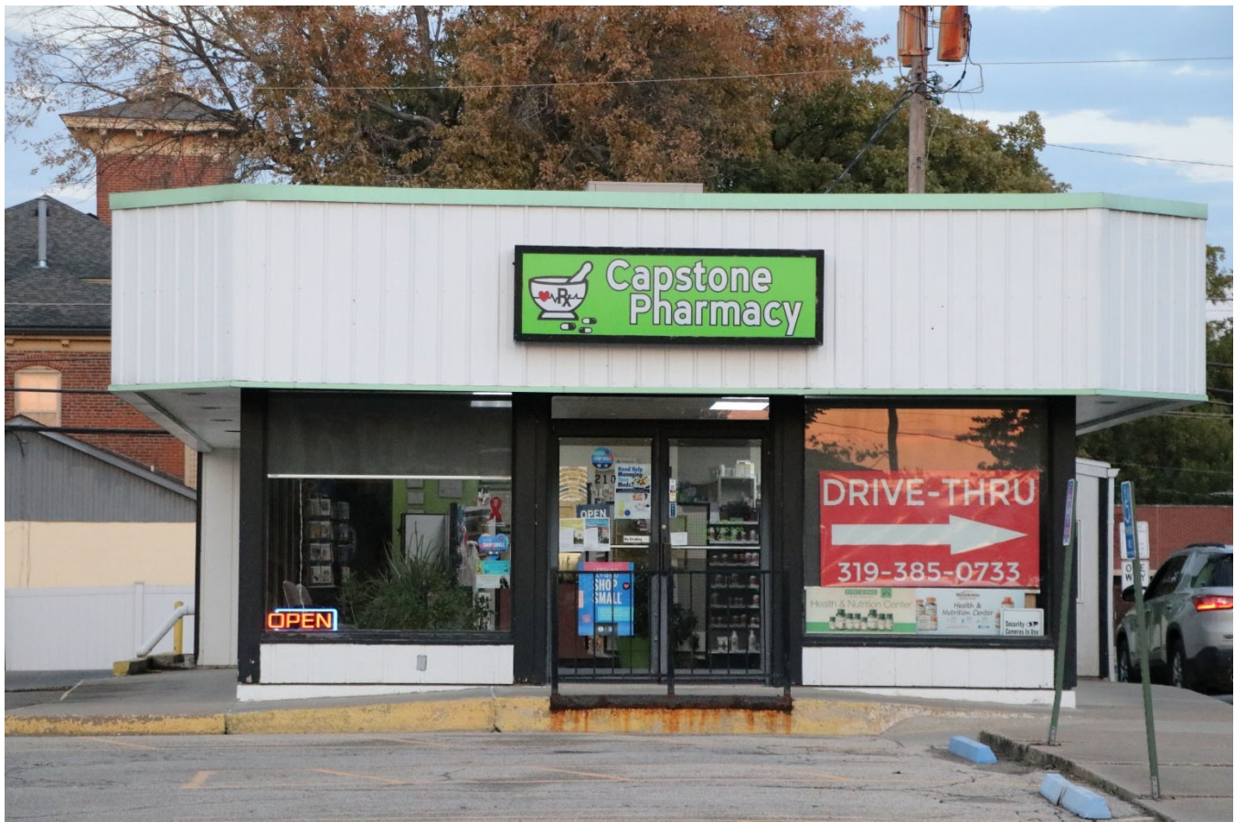
Photograph 44-02246-001. West elevation, looking east (October 2023)