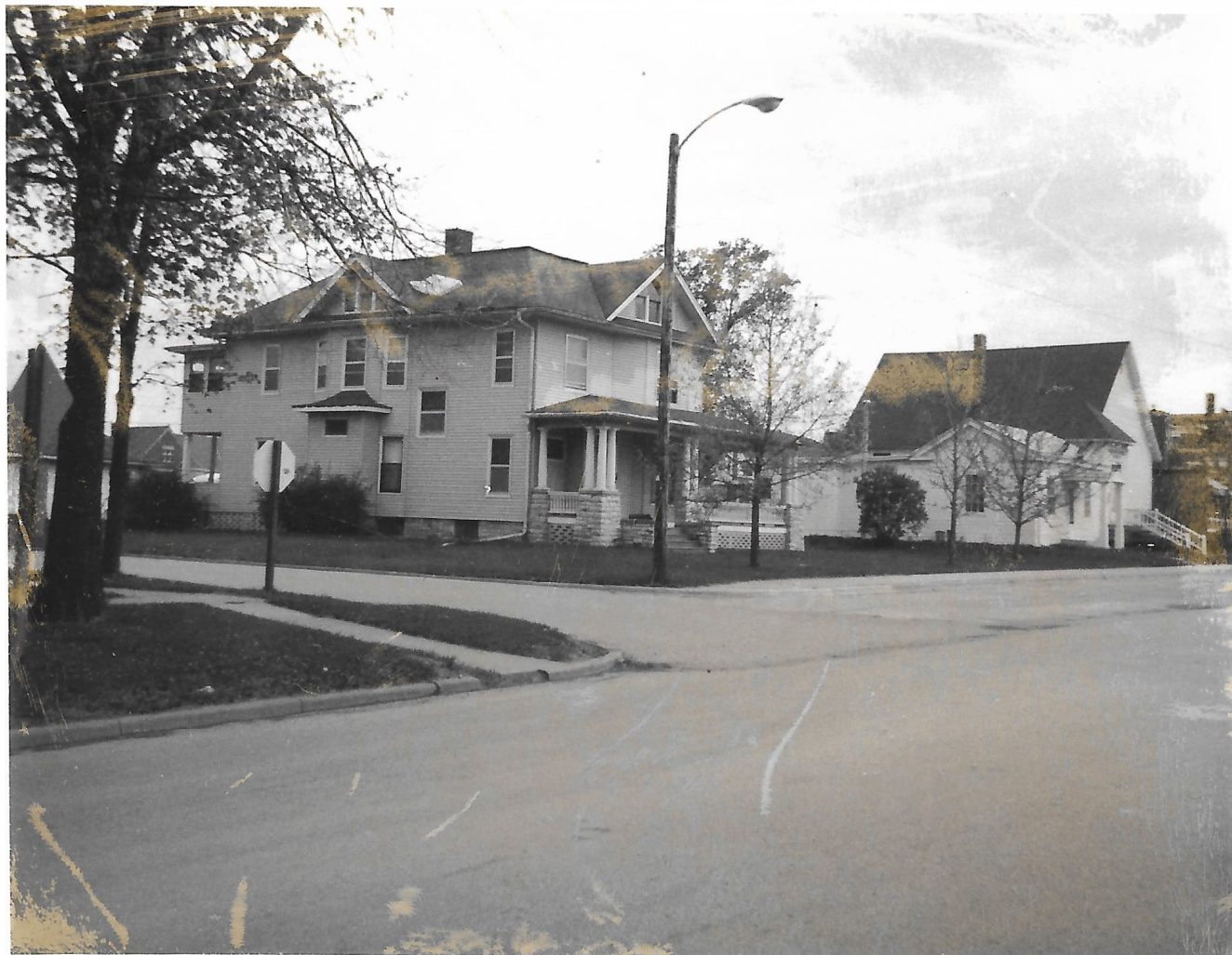
East side of 200 block of N. Jefferson in 1971 prior to move of house at corner to south of town for construction of this building, looking southeast (HCHT Facebook album)