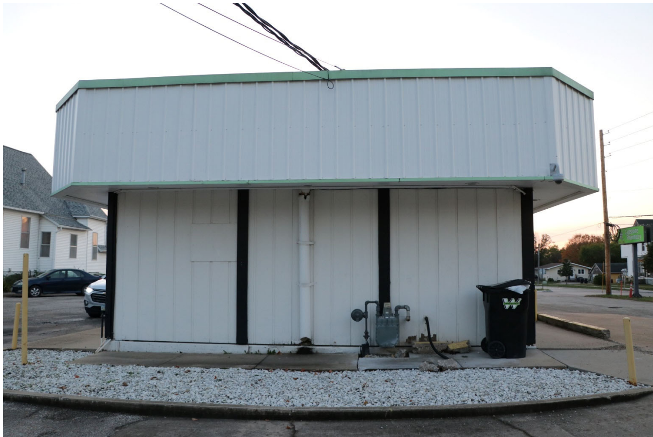
Photograph 44-02246-004. East elevation, looking west (October 2023)