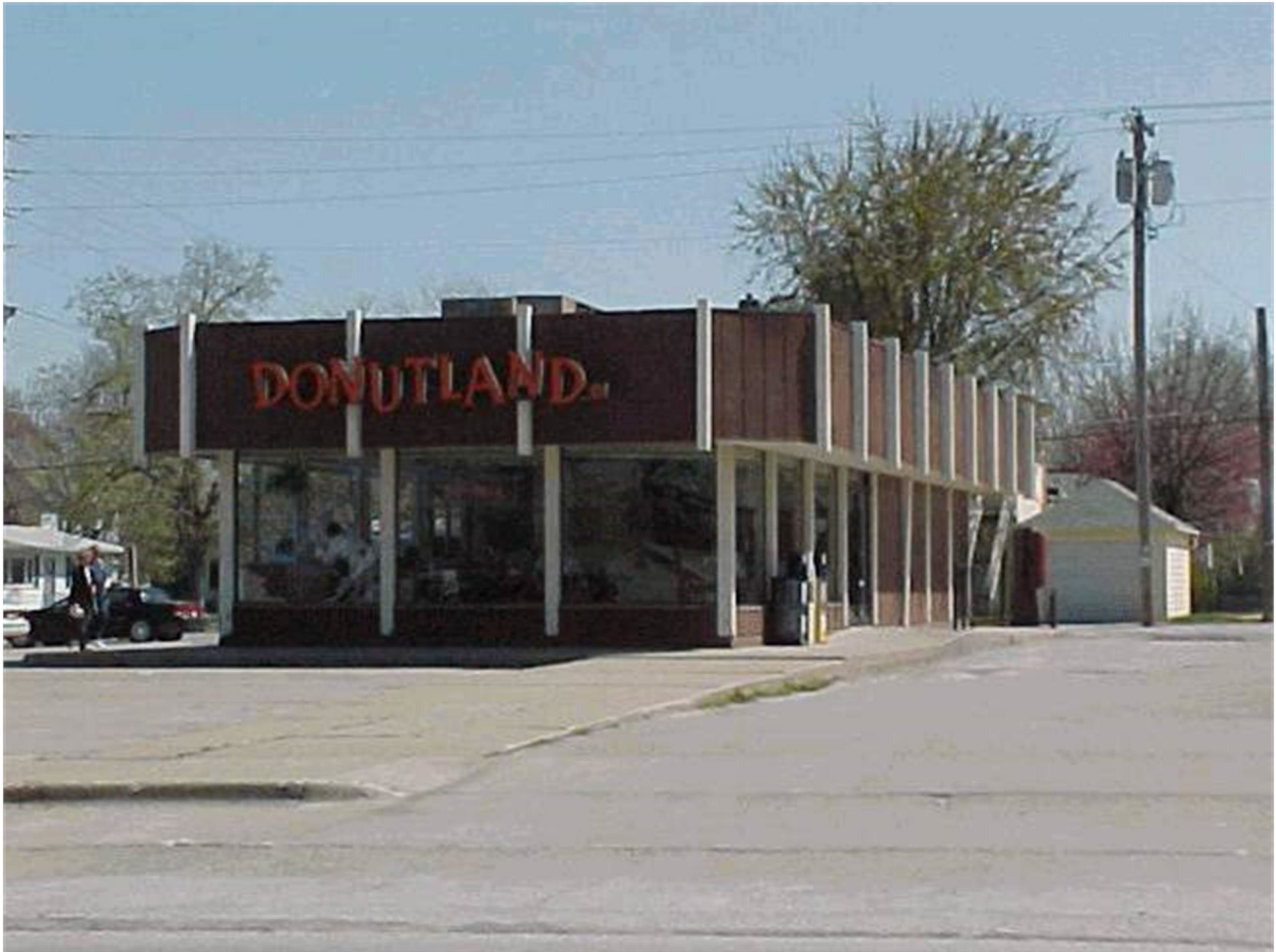
Building in 1990s