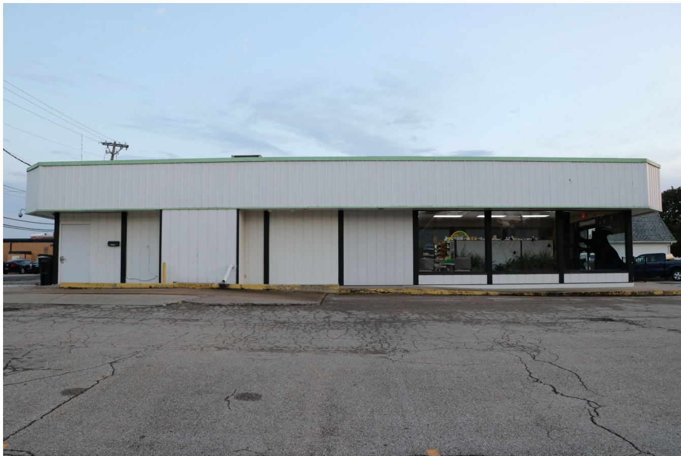
Photograph 44-02246-003. North elevation, looking south (October 2023)