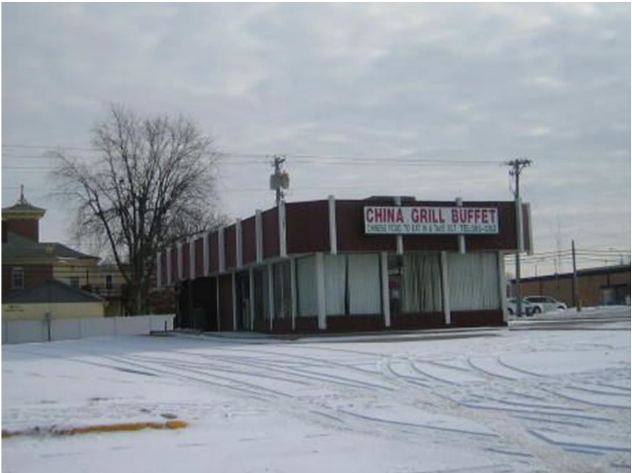
Building in 2010s

Henry County Assessor ( https://beacon.schneidercorp.com )