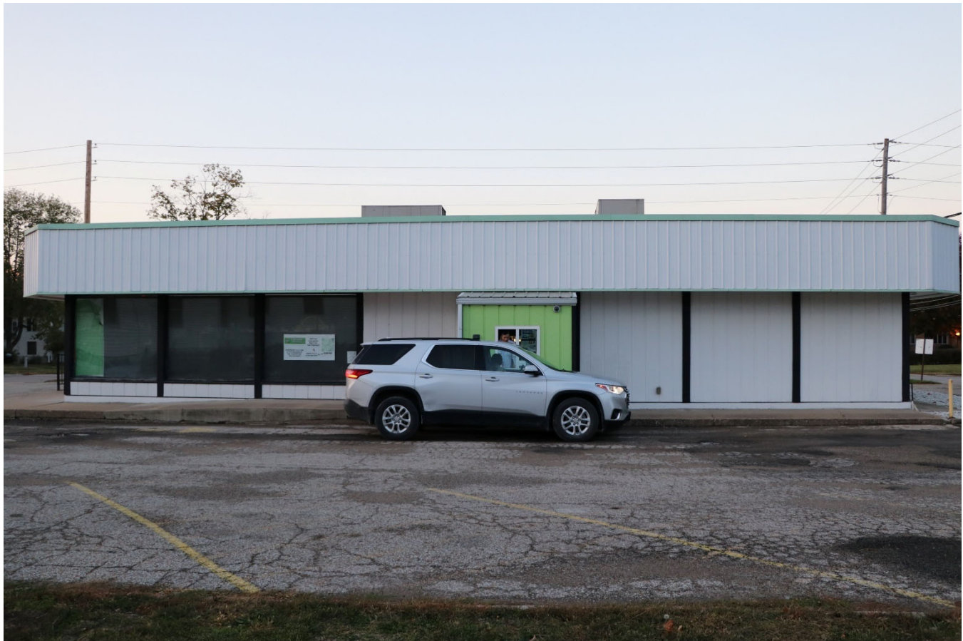
Photograph 44-02246-002. South elevation, looking north (October 2023)