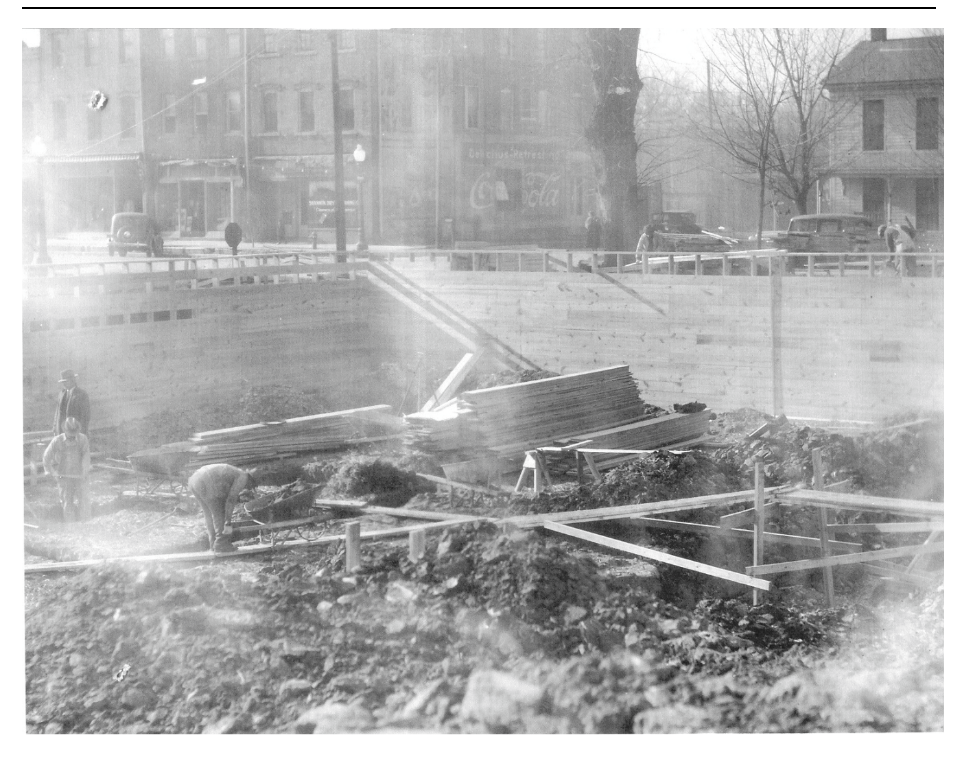
Building at corner in background of photograph likely of post office construction in 1935