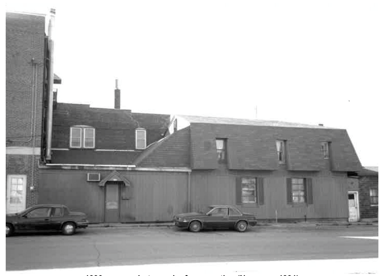
1990 survey photograph of rear section (Naumann 1991)

previously surveyed separately as 44-00238