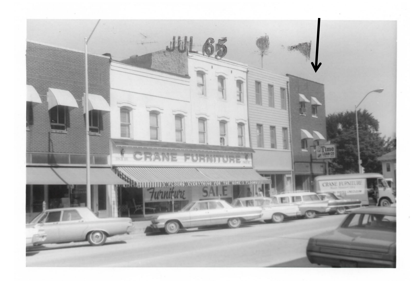
North portion of west side of 100 block of N. Jefferson St in July 1965