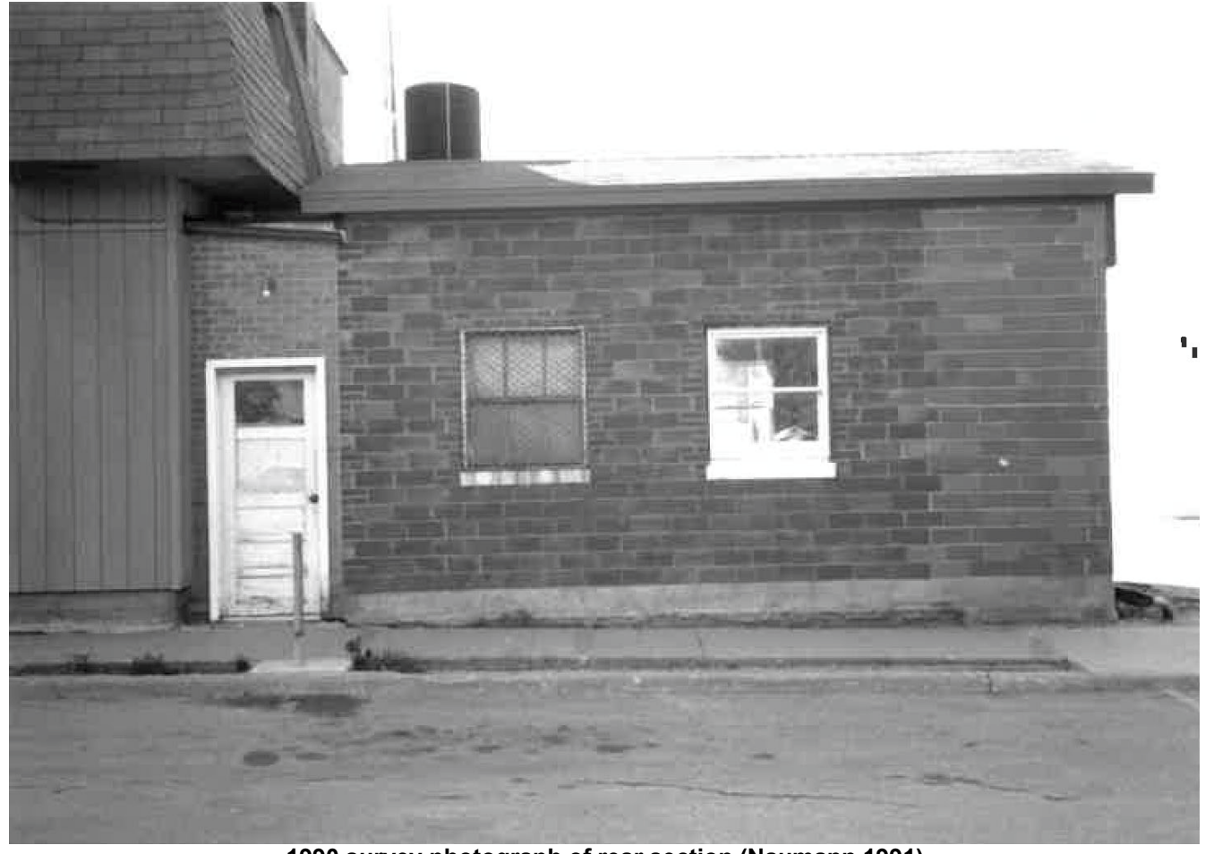
1990 survey photograph of rear section (Naumann 1991)

previously surveyed separately as 44-00238