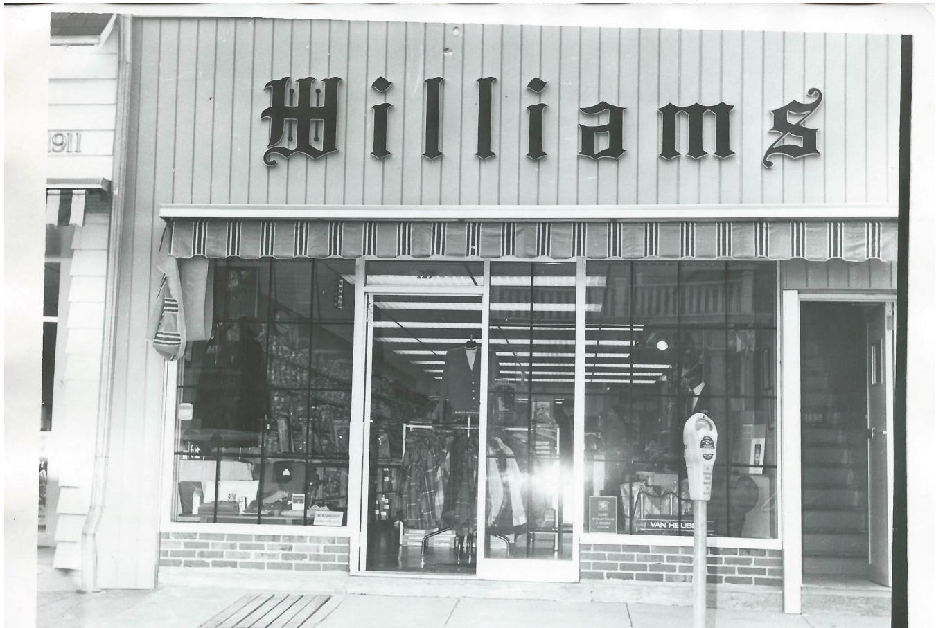
Storefront around 1973 (HCHT Facebook album)