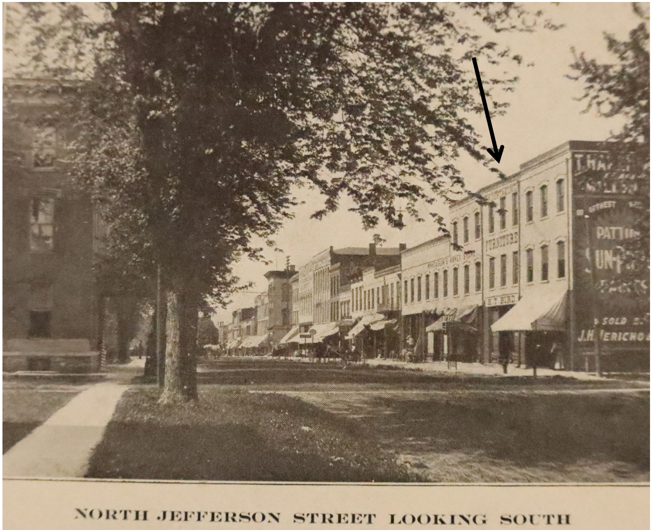
West side of 100 block of N. Jefferson in 1909, looking southwest ( Mt Pleasant Beautiful 1909: 5 )