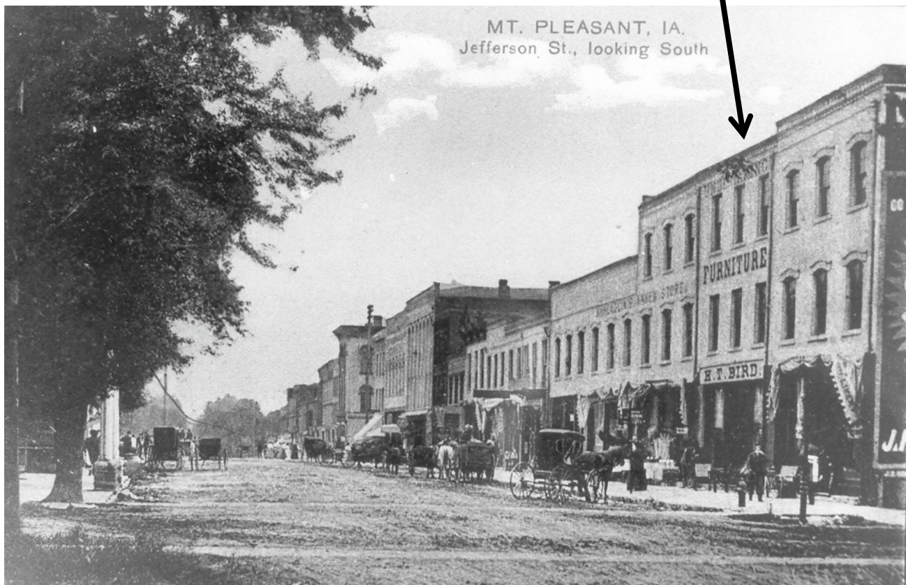
West side of 100 block of N. Jefferson St in 1900s