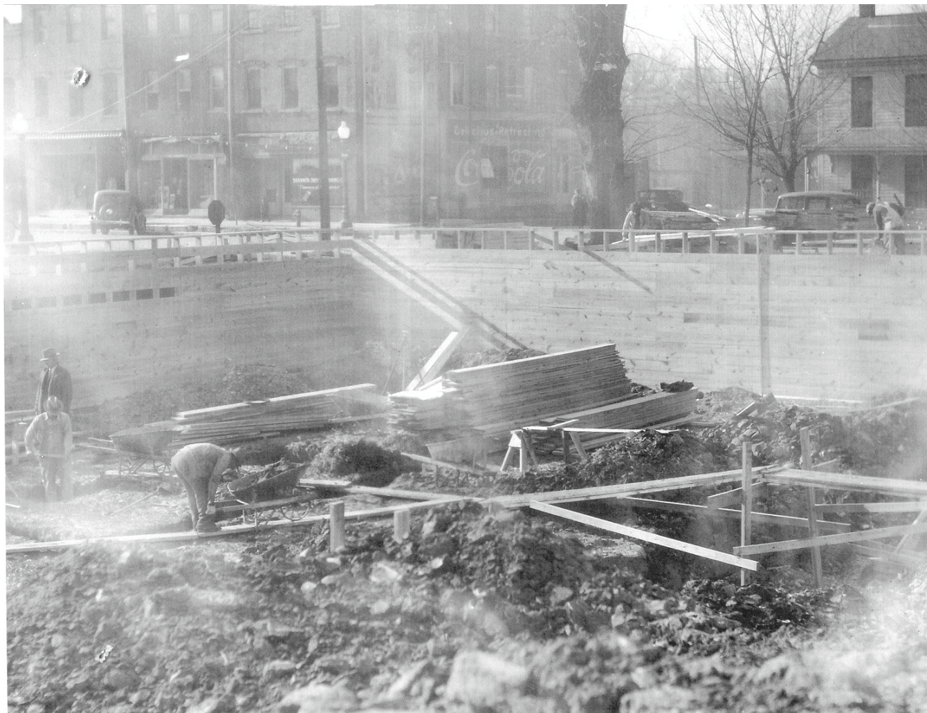
Building in middle at upper left in background of photograph likely of post office construction in 1935