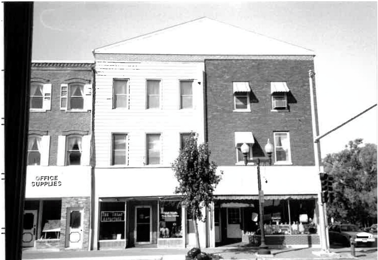
1990 survey photograph (Naumann 1991)