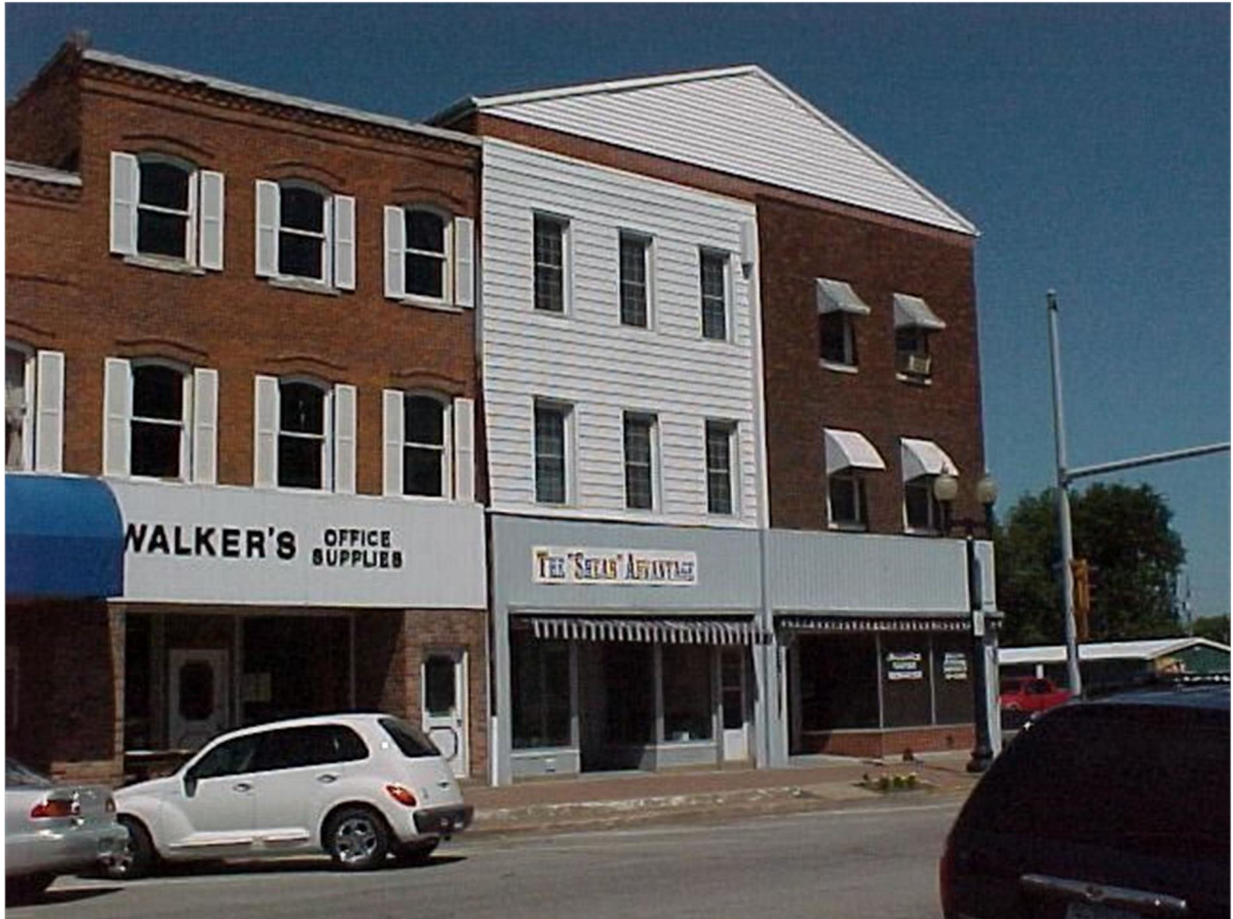
Building in 2010s

Henry County Assessor ( https://beacon.schneidercorp.com )