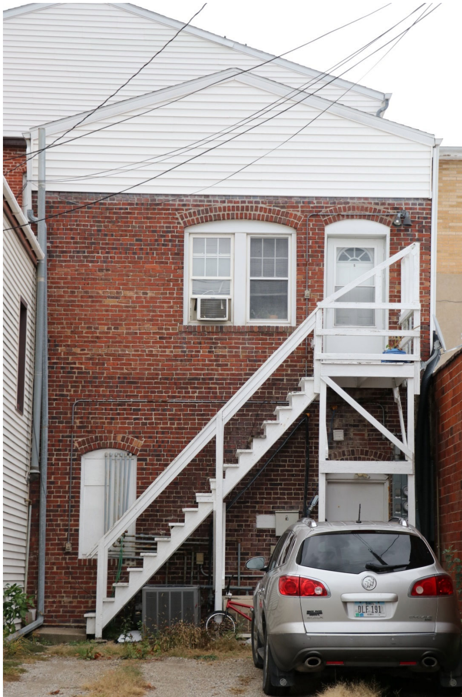
Photograph 44-02242-002. West elevation, looking east (October 2023)