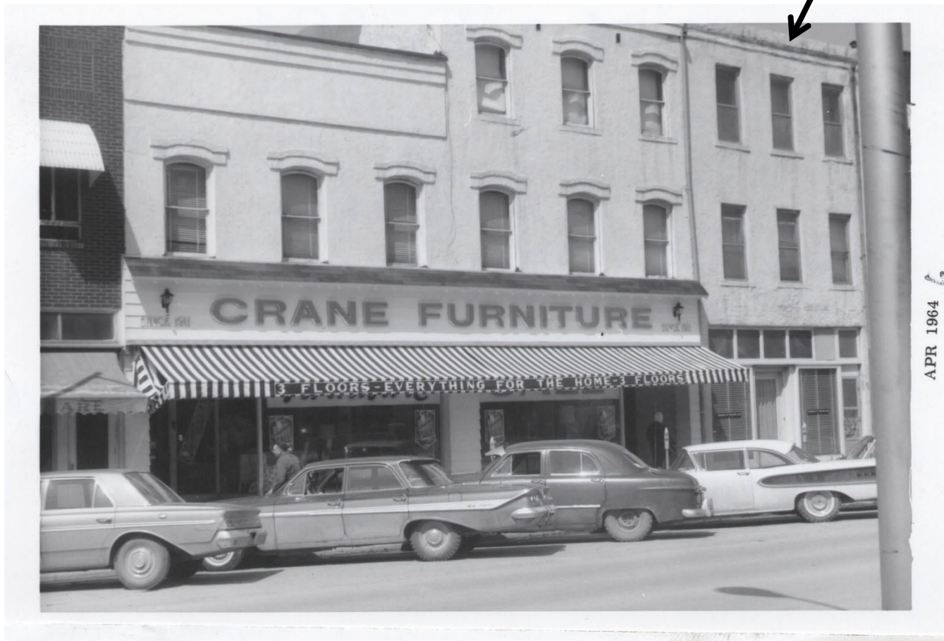
Building in April 1964 (HCHT files)