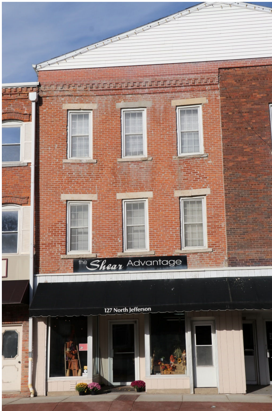
Photograph 44-02242-001. East elevation, looking west (October 2023)