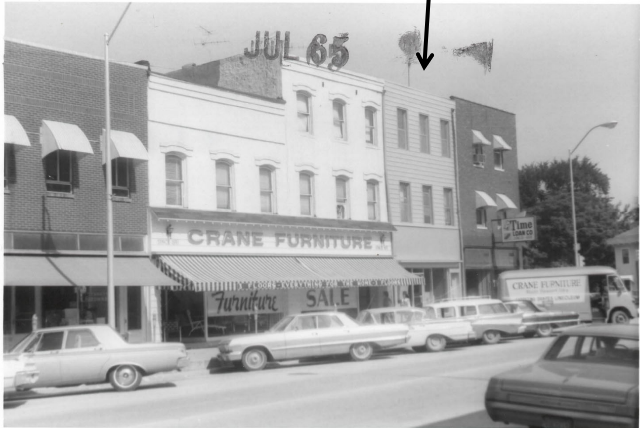
North portion of west side of 100 block of N. Jefferson St in July 1965 (HCHT files)