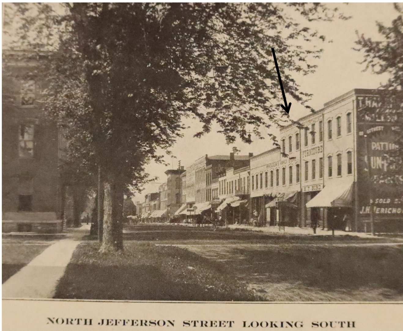
West side of 100 block of N. Jefferson in 1909, looking southwest ( Mt Pleasant Beautiful 1909: 5 )