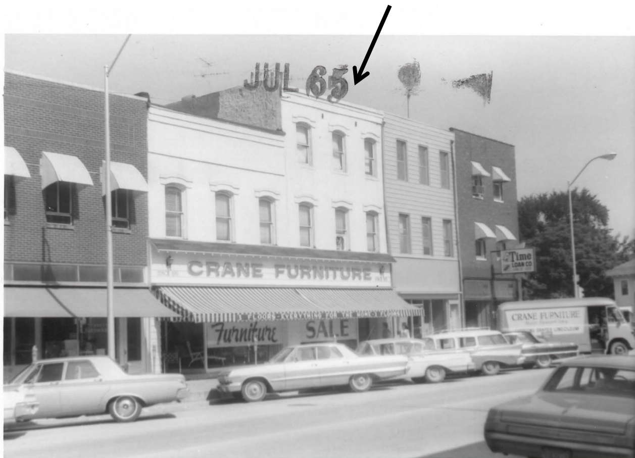
Middle of west side of 100 block of N. Jefferson St in July 1965