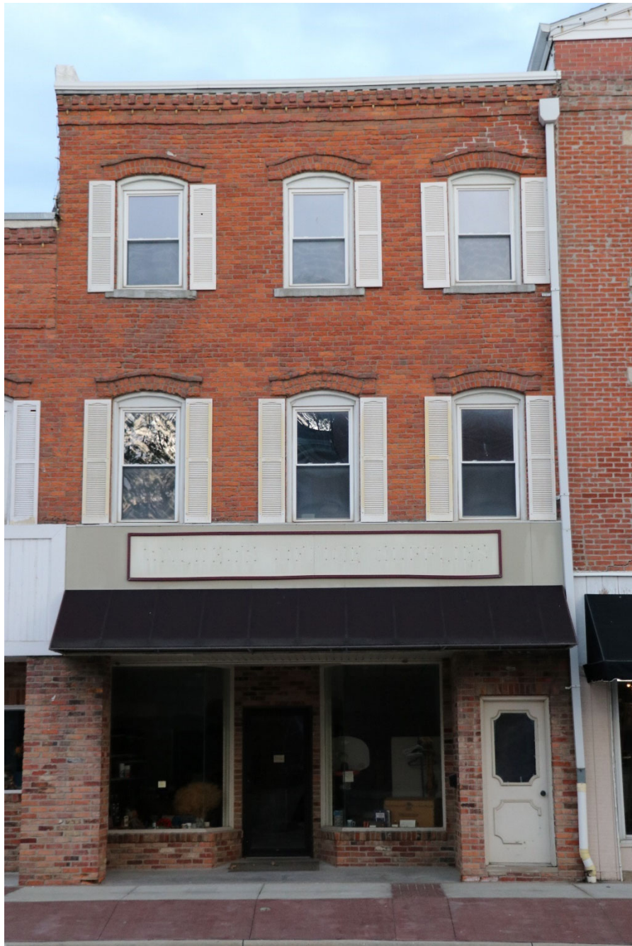
Photograph 44-00198-001. East elevation, looking west (October 2023)