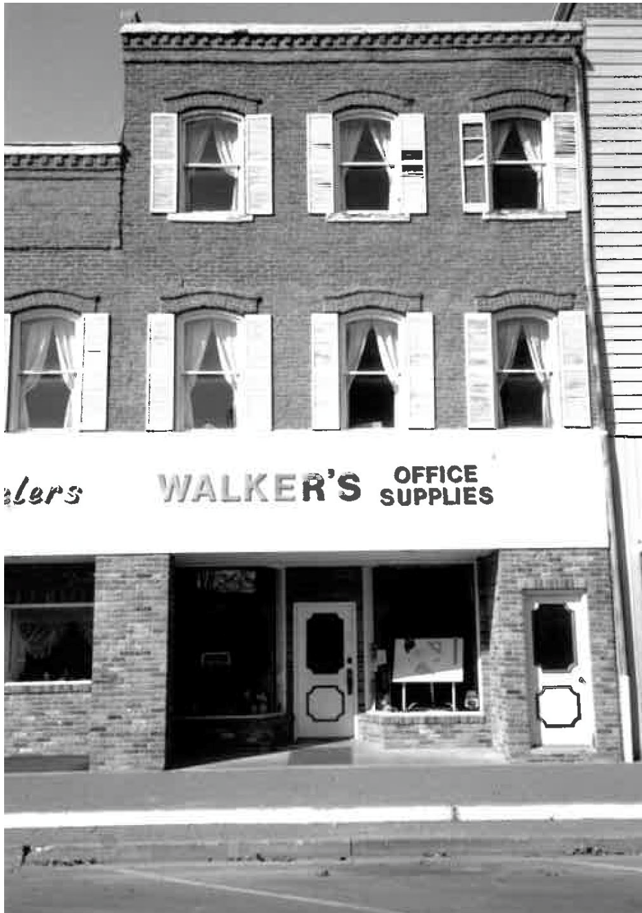
1990 survey photograph (Naumann 1991)