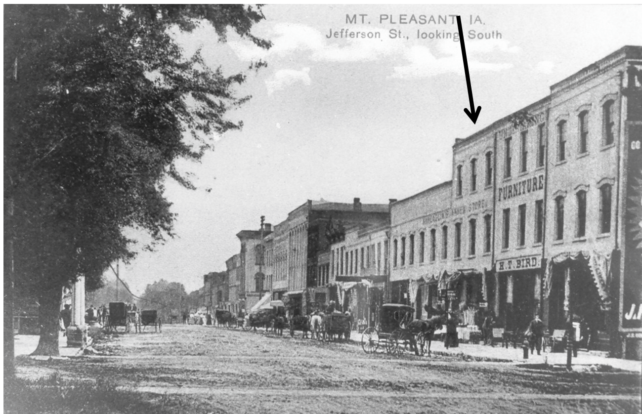
West side of 100 block of N. Jefferson St in 1900s (HCHT Facebook album)