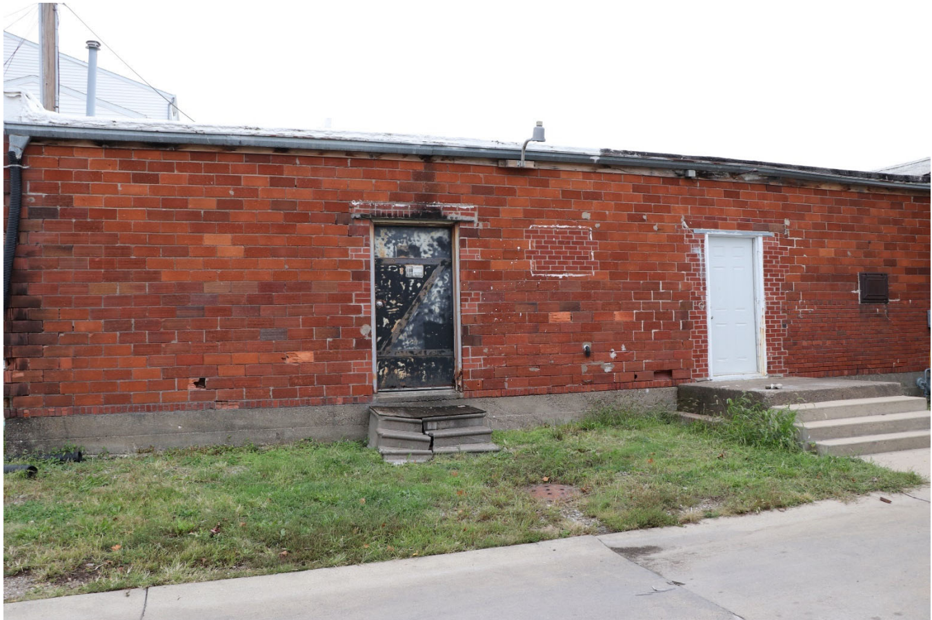
Photograph 44-00198-002. South elevations, looking north (October 2023)