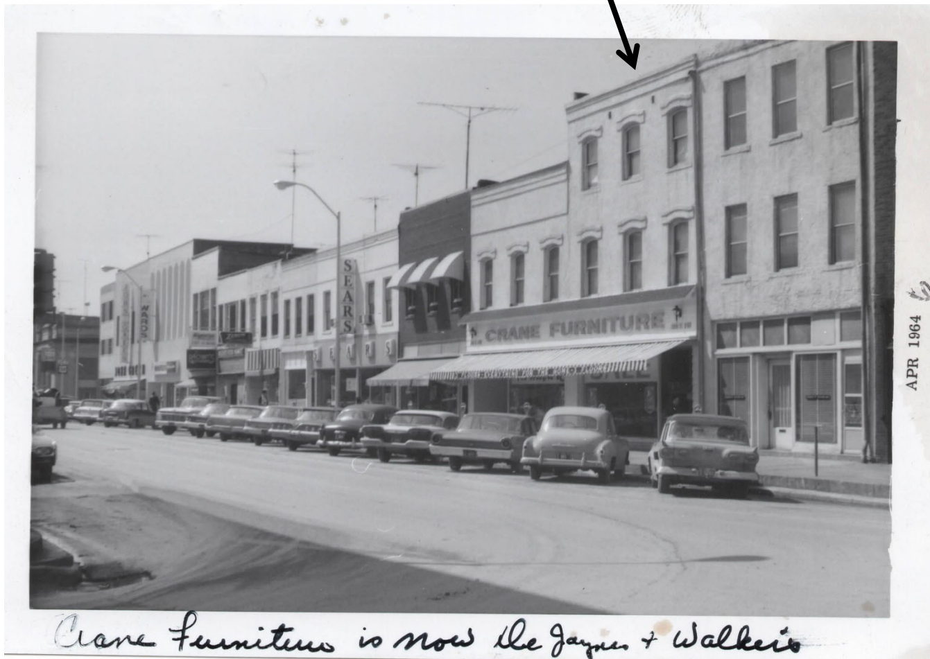
West side of 100 block of N. Jefferson St in April 1964 (HCHT files)