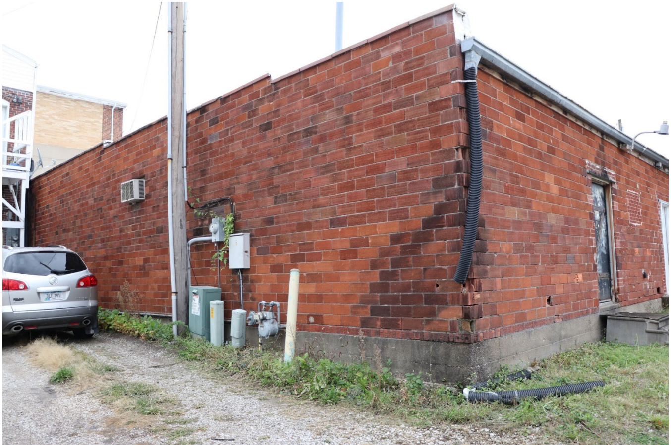
Photograph 44-00198-003. North and west elevations, looking southeast (October 2023)