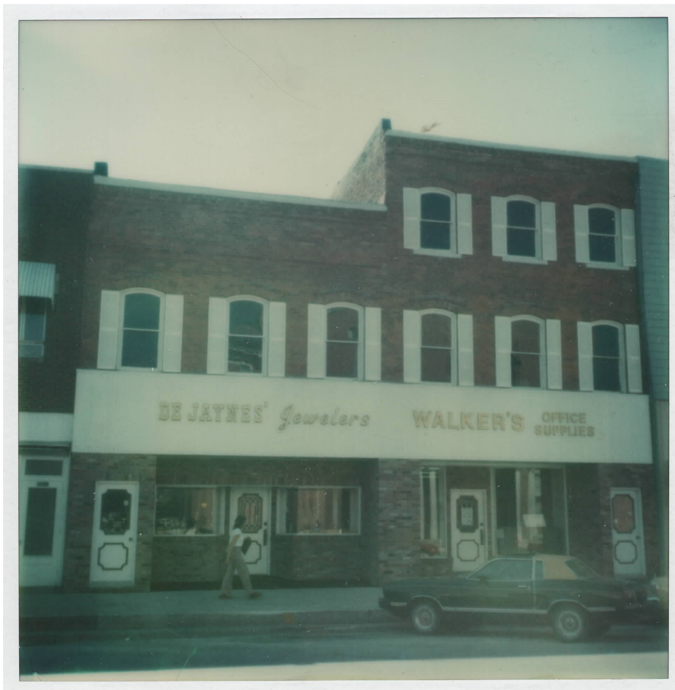
Building around 1979 (HCHT files) Operation Pride project completed