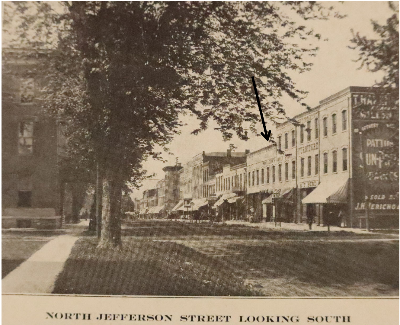
West side of 100 block of N. Jefferson in 1909, looking southwest ( Mt Pleasant Beautiful 1909: 5 )