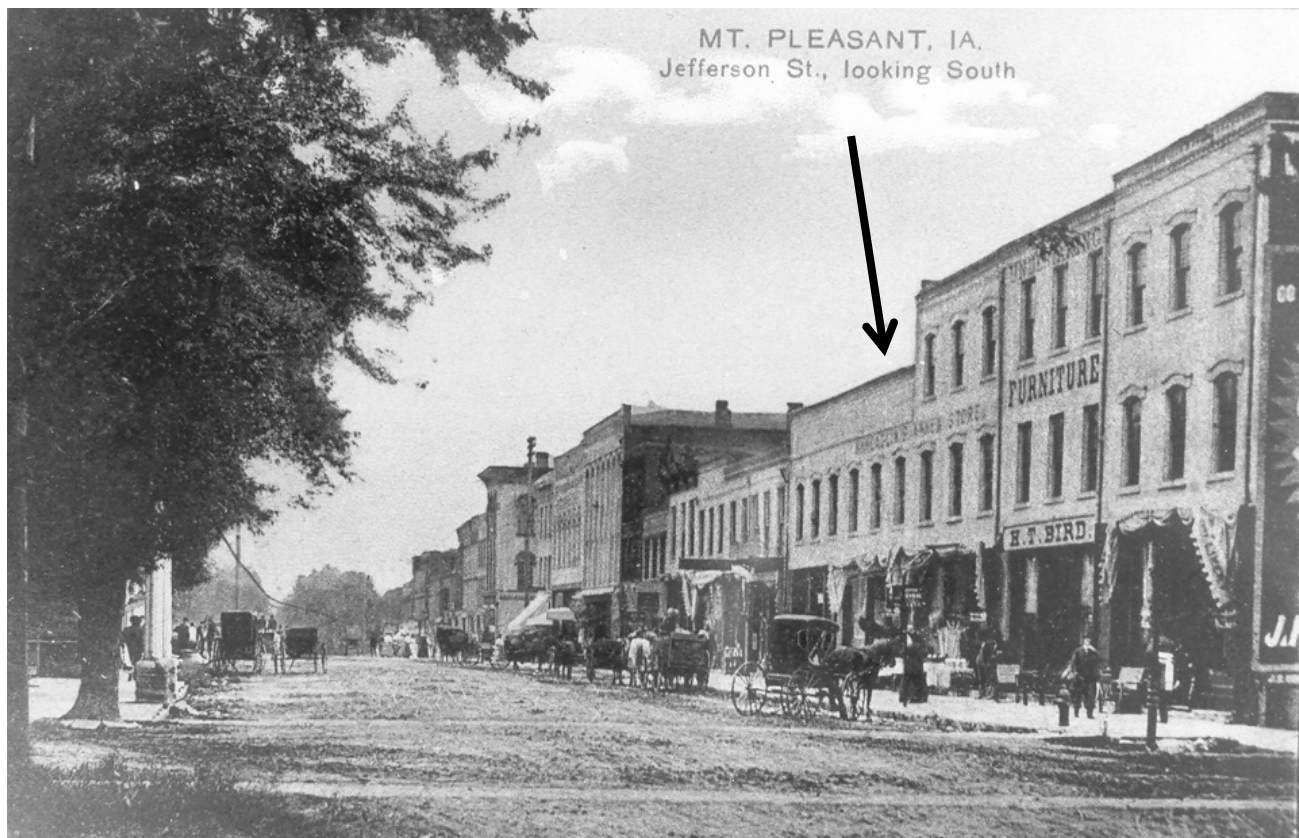
West side of 100 block of N. Jefferson St in 1900s (HCHT Facebook album)