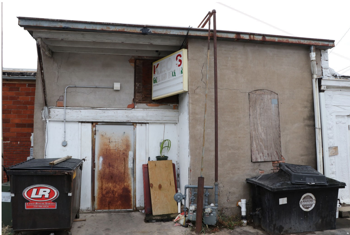
Photograph 44-00197-002. West elevation, looking east (October 2023)