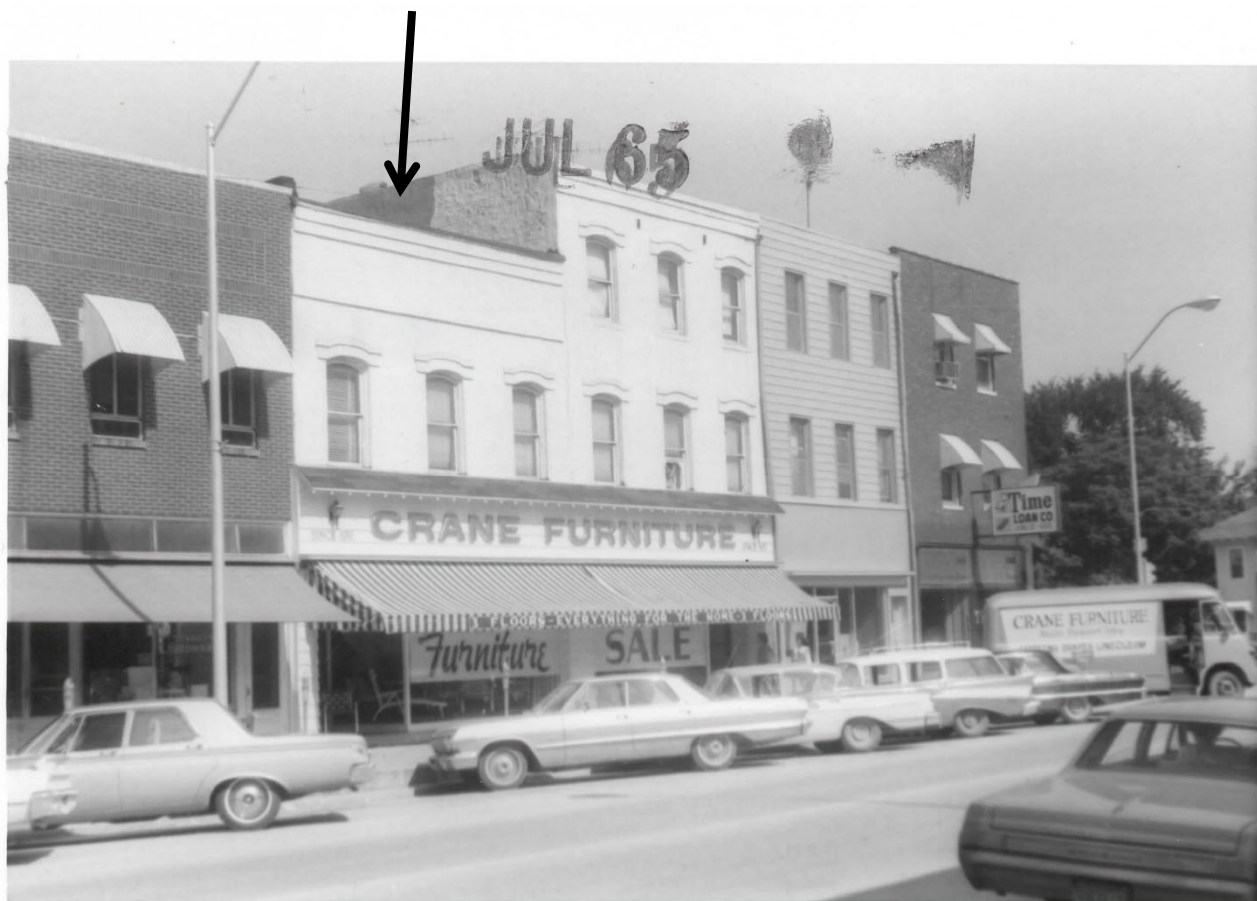
Middle of west side of 100 block of N. Jefferson St in July 1965