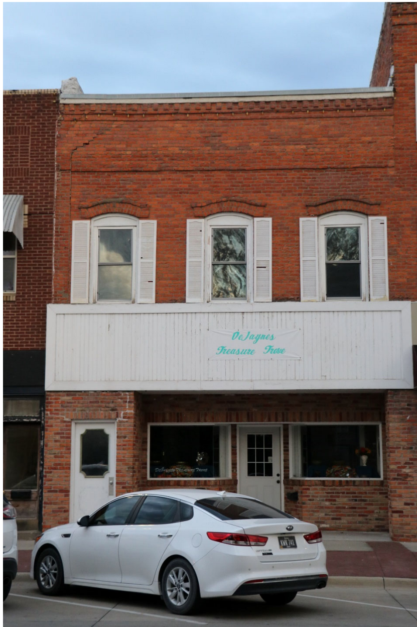
Photograph 44-00197-001. East elevation, looking west (October 2023)