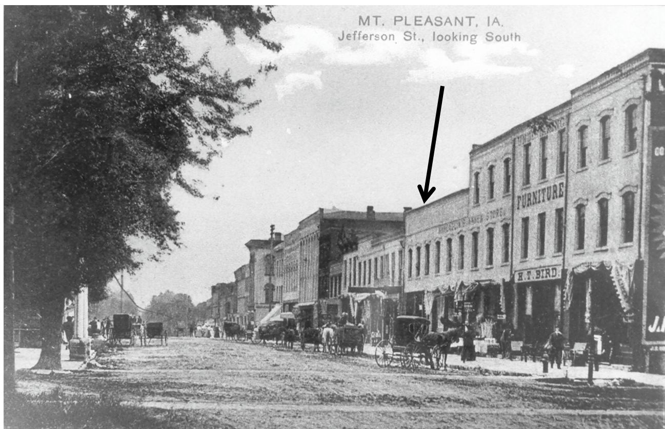
West side of 100 block of N. Jefferson St in 1900s (HCHT Facebook album)