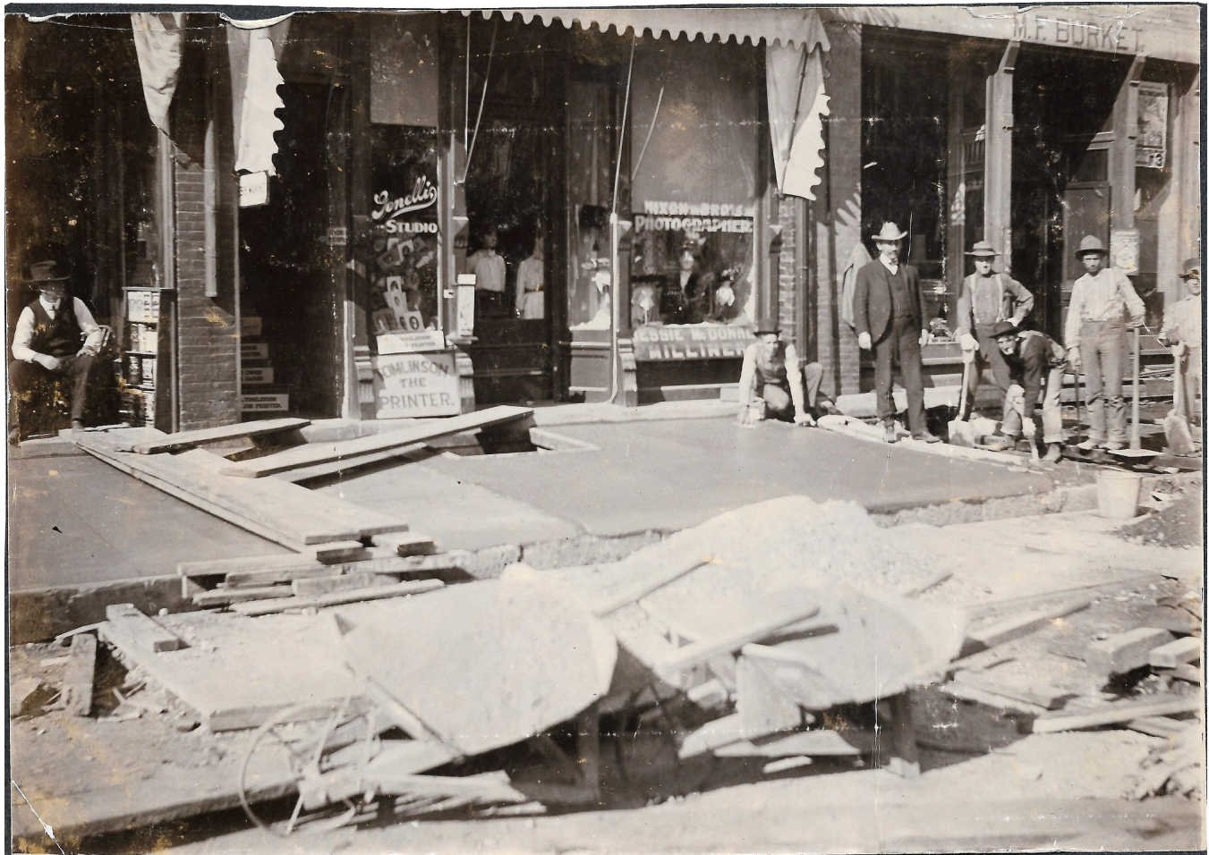
Store at right around 1903 during sidewalk improvements (HCHT Facebook album)