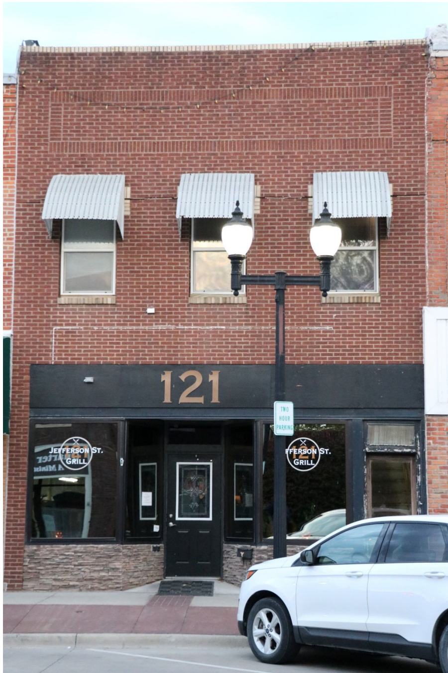
Photograph 44-00195-001. East elevation, looking west (October 2023)