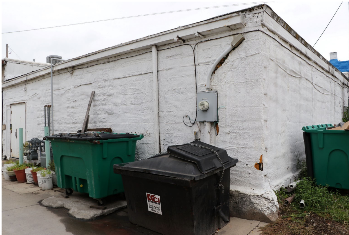
Photograph 44-00195-002. West elevation, looking northeast (October 2023)