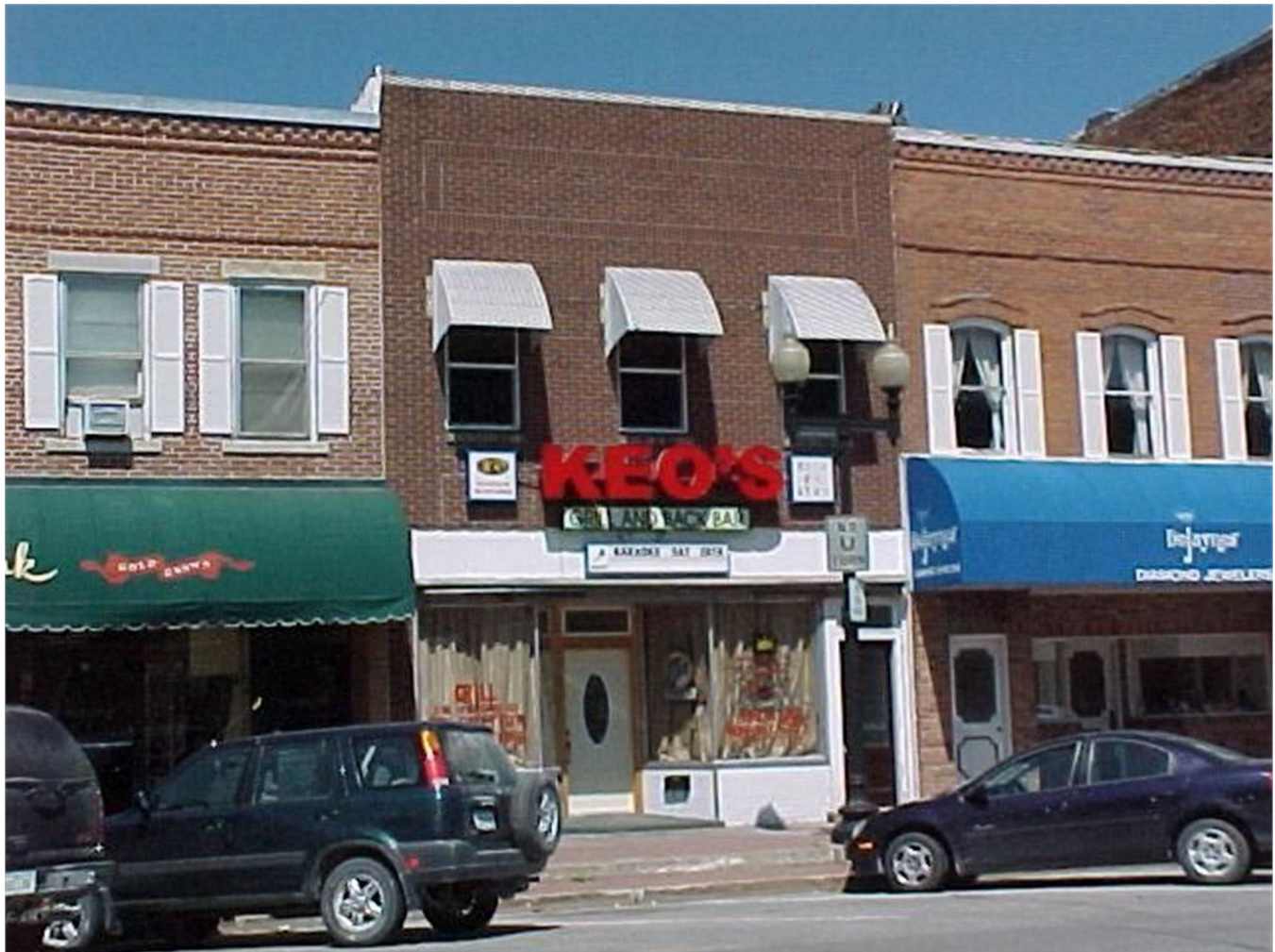
Building prior to 2006 storefront remodel