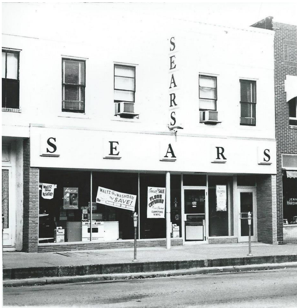
Building in 1960s