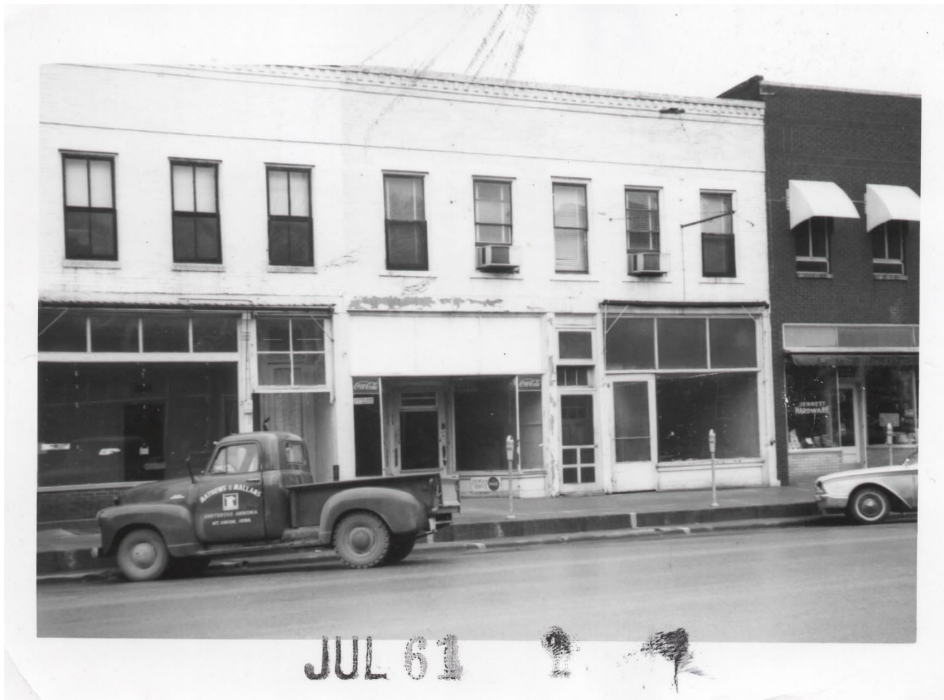
Middle of west side of 100 block of N. Jefferson St in July 1961 prior to remodel for Sears

Weir Building Henry Name of Property County 119 N. Jefferson St Mount Pleasant Address City