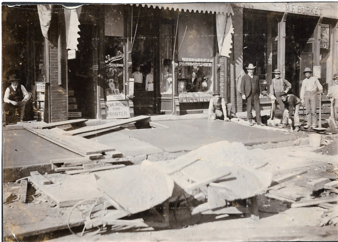
Partial south storefront, center stairs, and north storefront (Nixon Bros) around 1903 during sidewalk improvements

Weir Building Henry Name of Property County 119 N. Jefferson St Mount Pleasant Address City