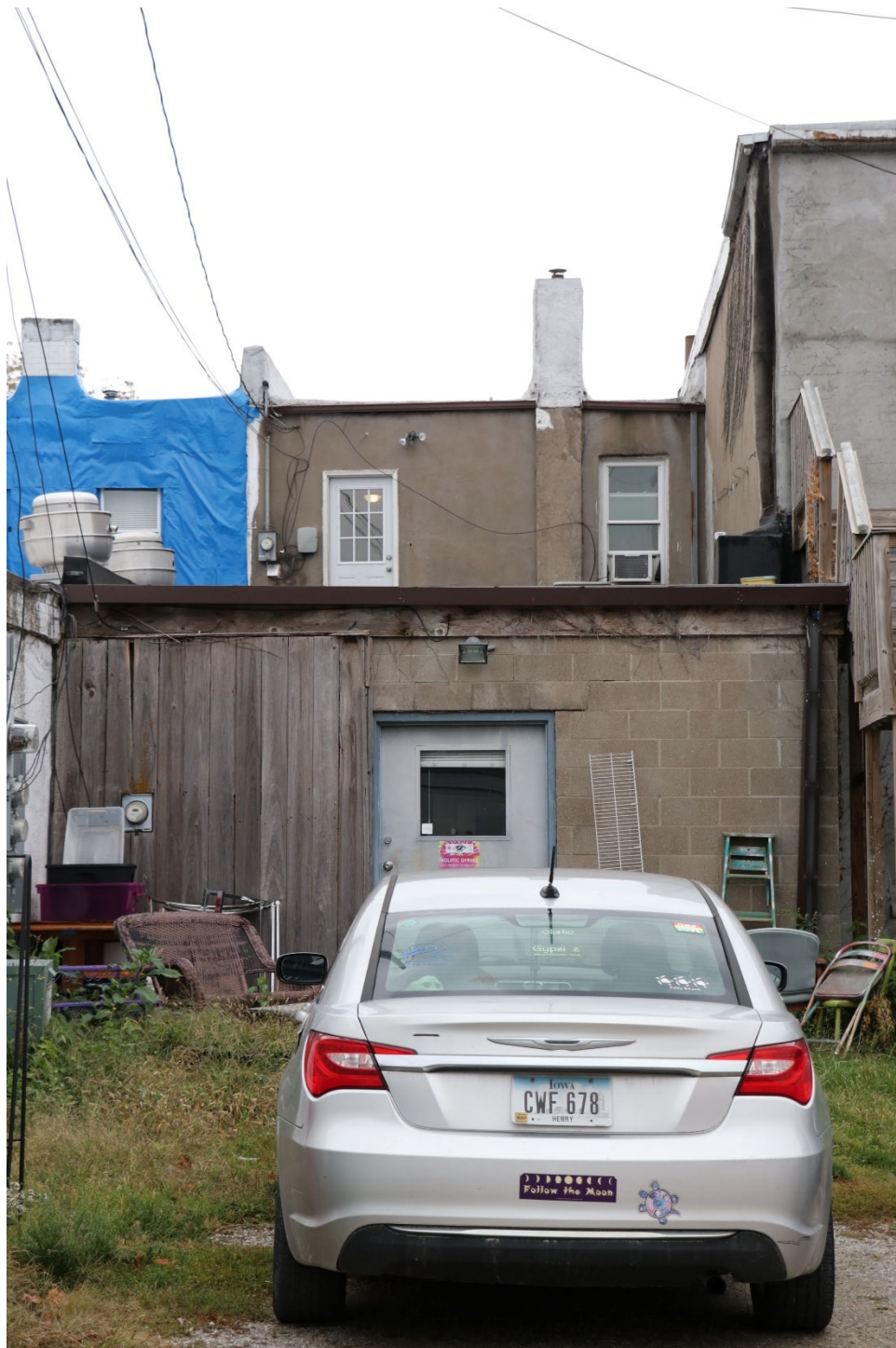
Photograph 44-00194-002. West elevation, looking east (October 2023)

Weir Building Henry Name of Property County 119 N. Jefferson St Mount Pleasant Address City