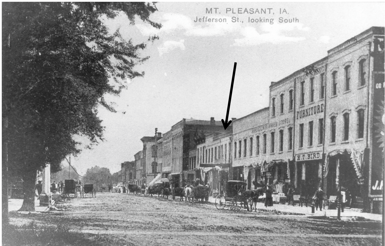
West side of 100 block of N. Jefferson St in 1900s (HCHT Facebook album)