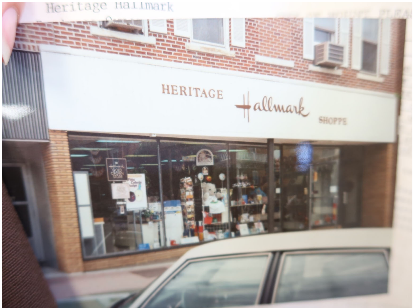
Building in May 1990 (City of Mt Pleasant building permits)

Weir Building Henry Name of Property County 119 N. Jefferson St Mount Pleasant Address City