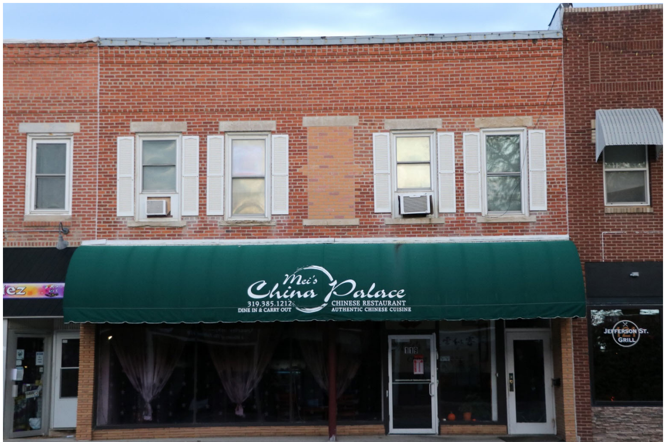
Photograph 44-00194-001. East elevation, looking west (October 2023)