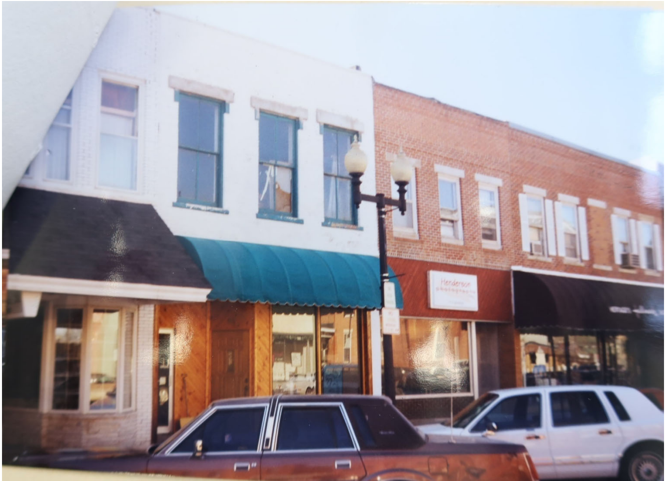
Building at right in 1999 (City of Mt Pleasant building permits)

Weir Building Henry Name of Property County 119 N. Jefferson St Mount Pleasant Address City