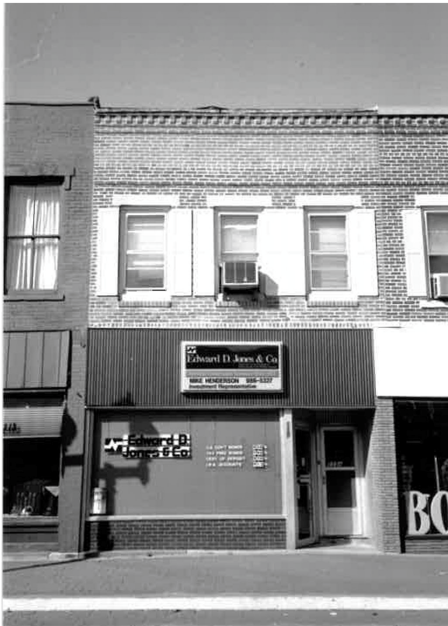
1990 survey photograph (Naumann 1991)