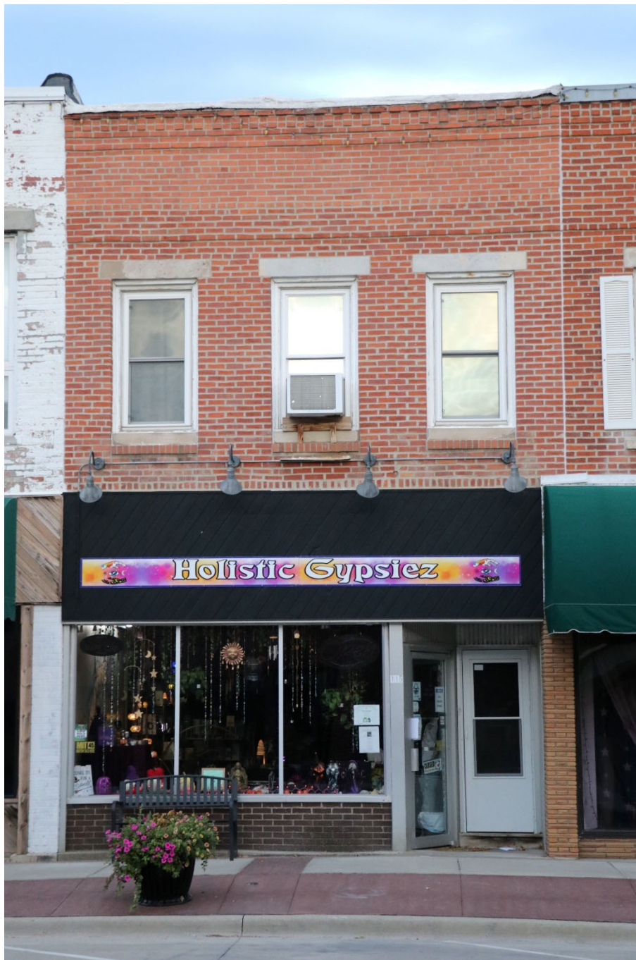
Photograph 44-00193-001. East elevation, looking west (October 2023)