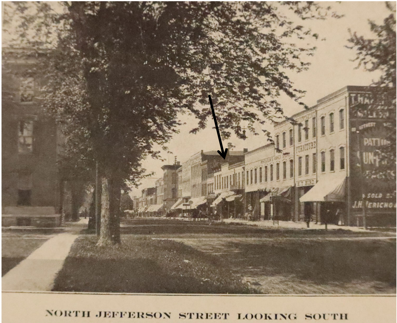
West side of 100 block of N. Jefferson, looking southwest ( Mt Pleasant Beautiful 1909: 5 )