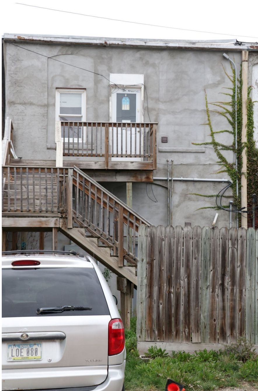
Photograph 44-00193-002. West elevation, looking east (October 2023)