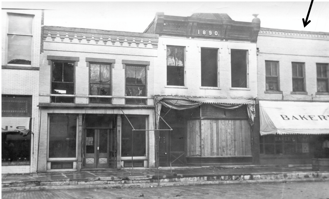
Middle of west side of 100 block of N. Jefferson after June 1914 fire