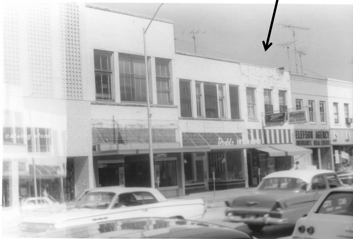
Middle of west side of 100 block of N. Jefferson St in July 1965