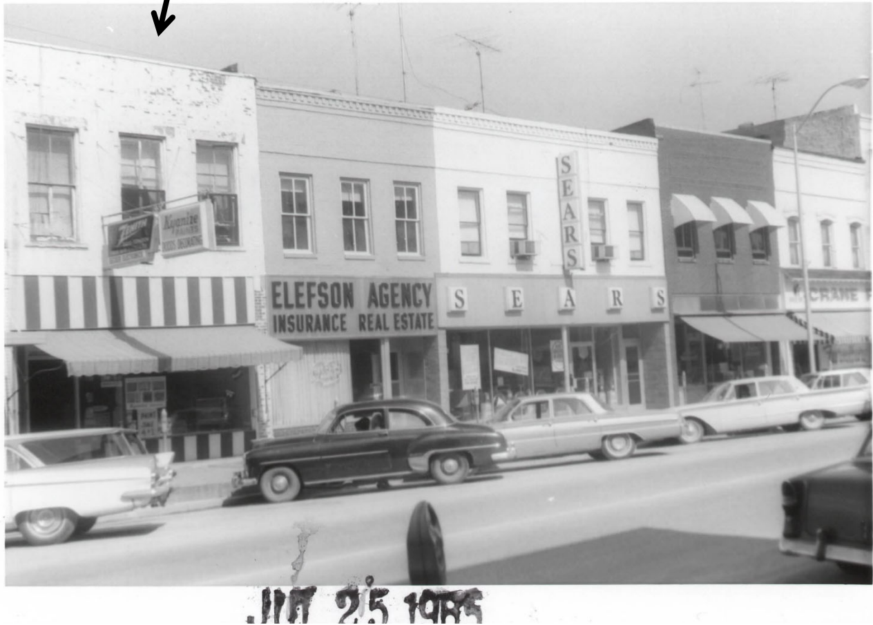
Middle of west side of 100 block of N. Jefferson St in July 1965