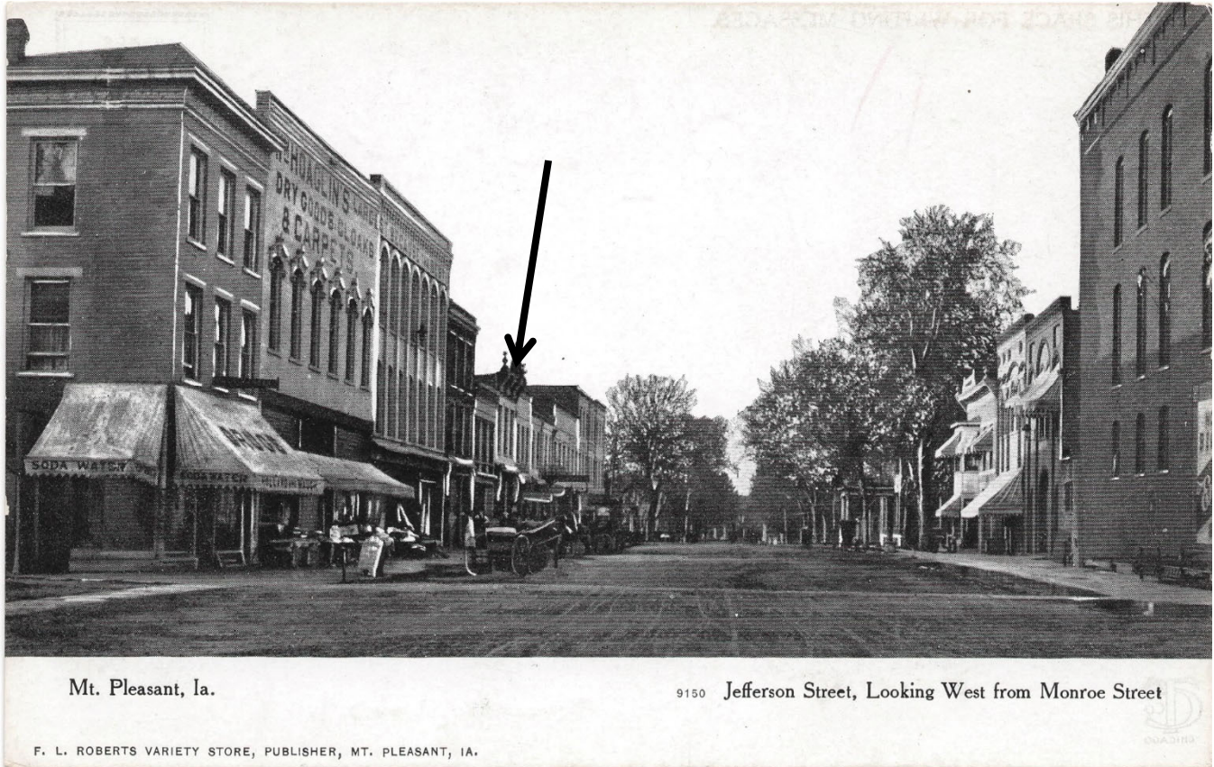
Looking north on 100 block of N. Jefferson St in early 1900s (HCHT Facebook album)