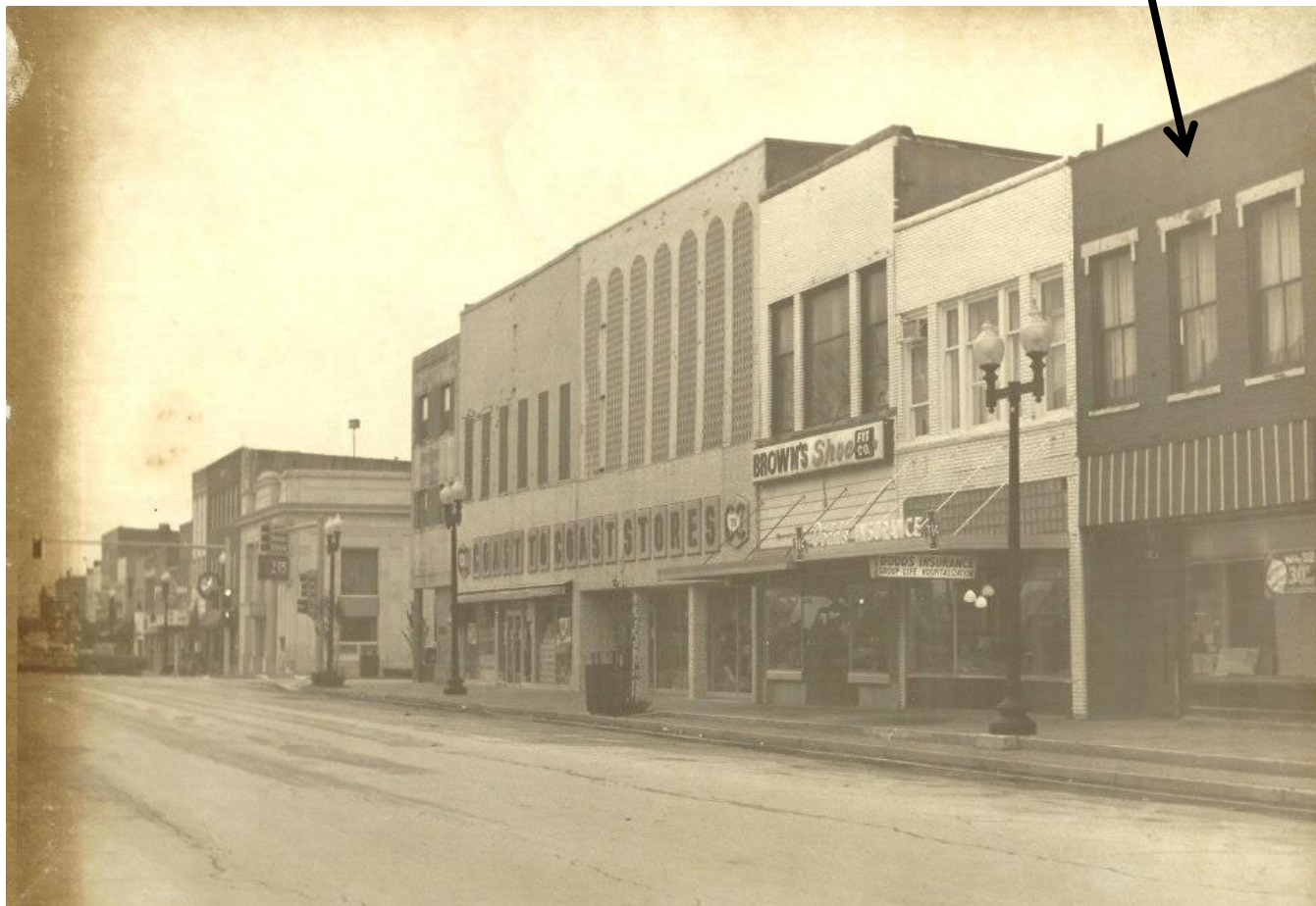
West side of 100 block of N Jefferson St in early 1980s, looking southwest