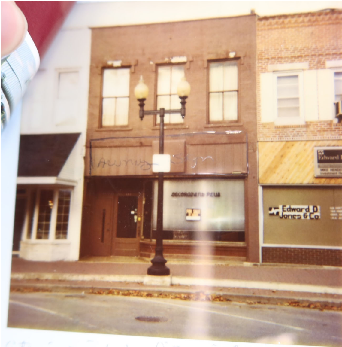
Exterior painted white with awning Building in 1993 prior to storefront remodel (City of Mt Pleasant building permits)