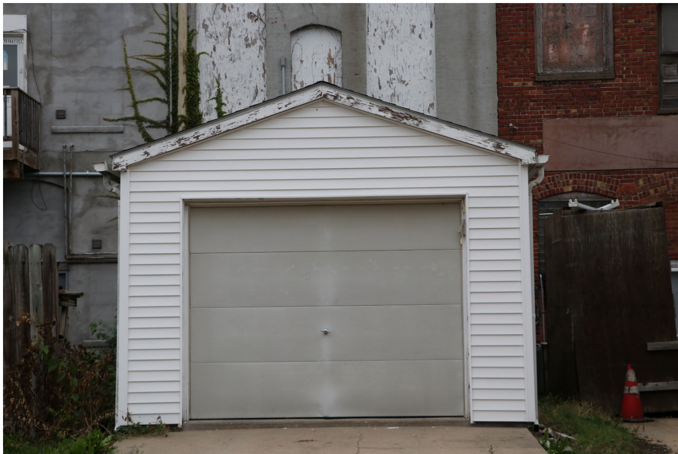
Photograph 44-00192-003. West elevation, looking east (October 2023)