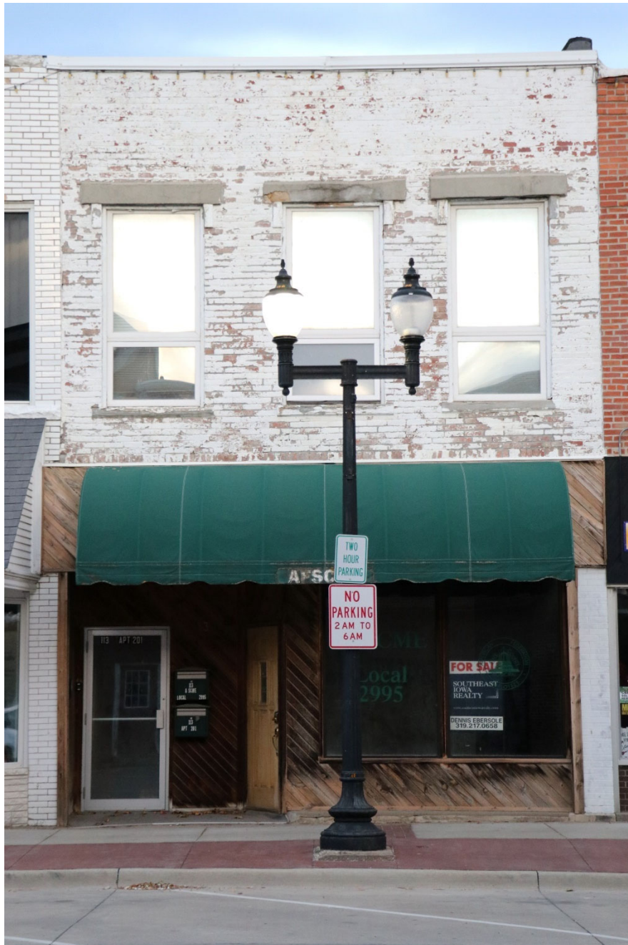
Photograph 44-00192-001. East elevation, looking west (October 2023)