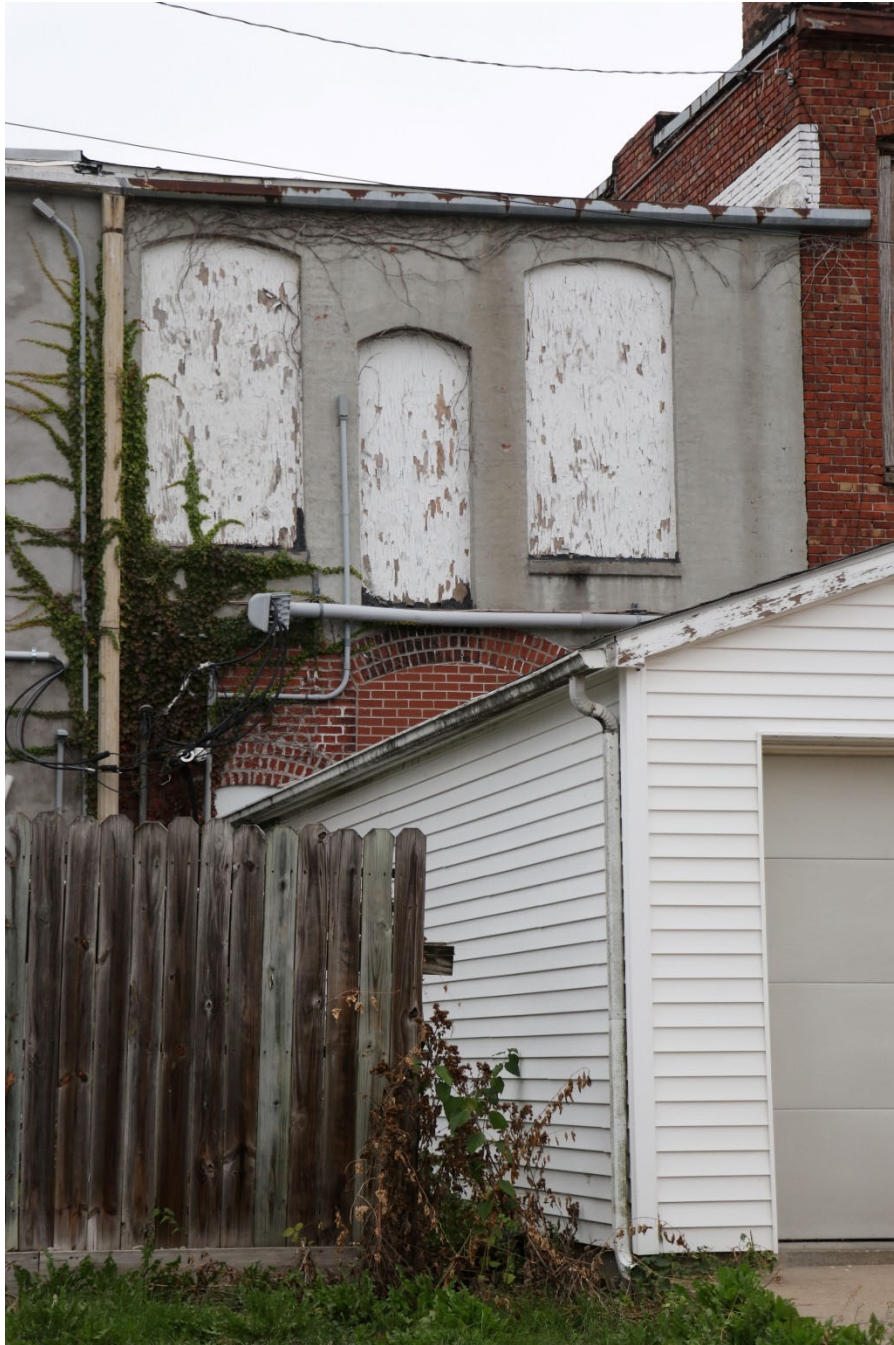
Photograph 44-00192-002. West elevation, looking southeast (October 2023)